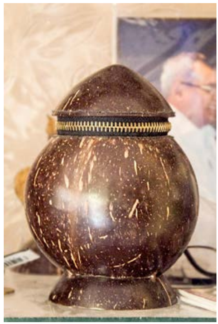
Coconut shell jewellery pot.