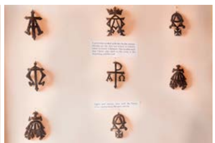
Different types of Cristian cross.