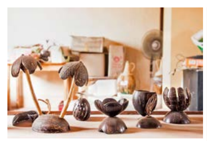
Coconut shell decorative products.