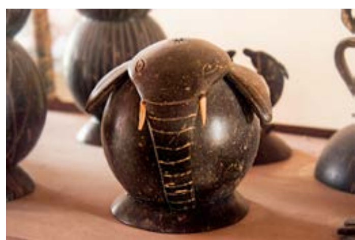
Coconut shell Elephant piggy bank.