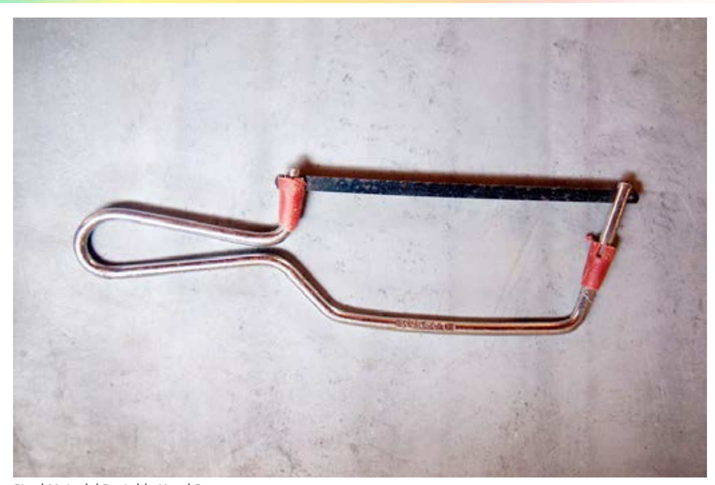
Steel Material Portable Hand Saw.