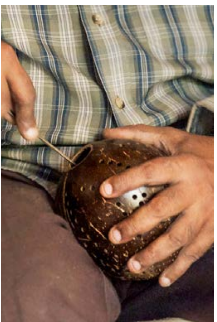
Using triangular pile artisan makes large hole for coconut shell lamp.