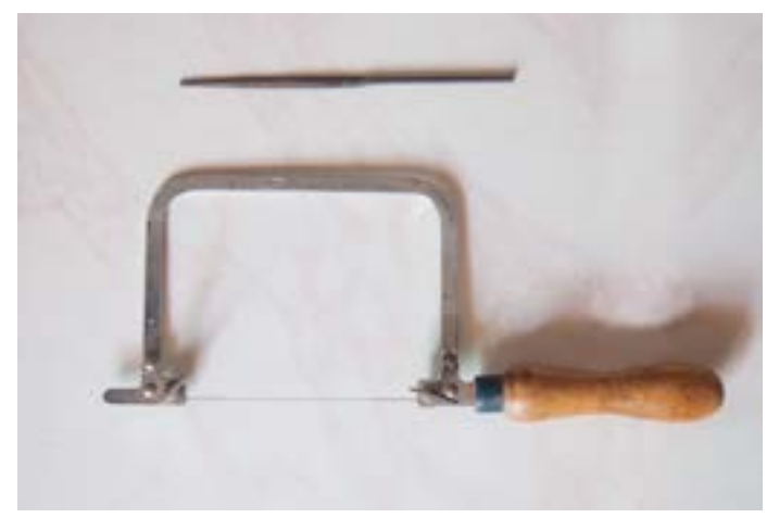
Jewellers saw tool.