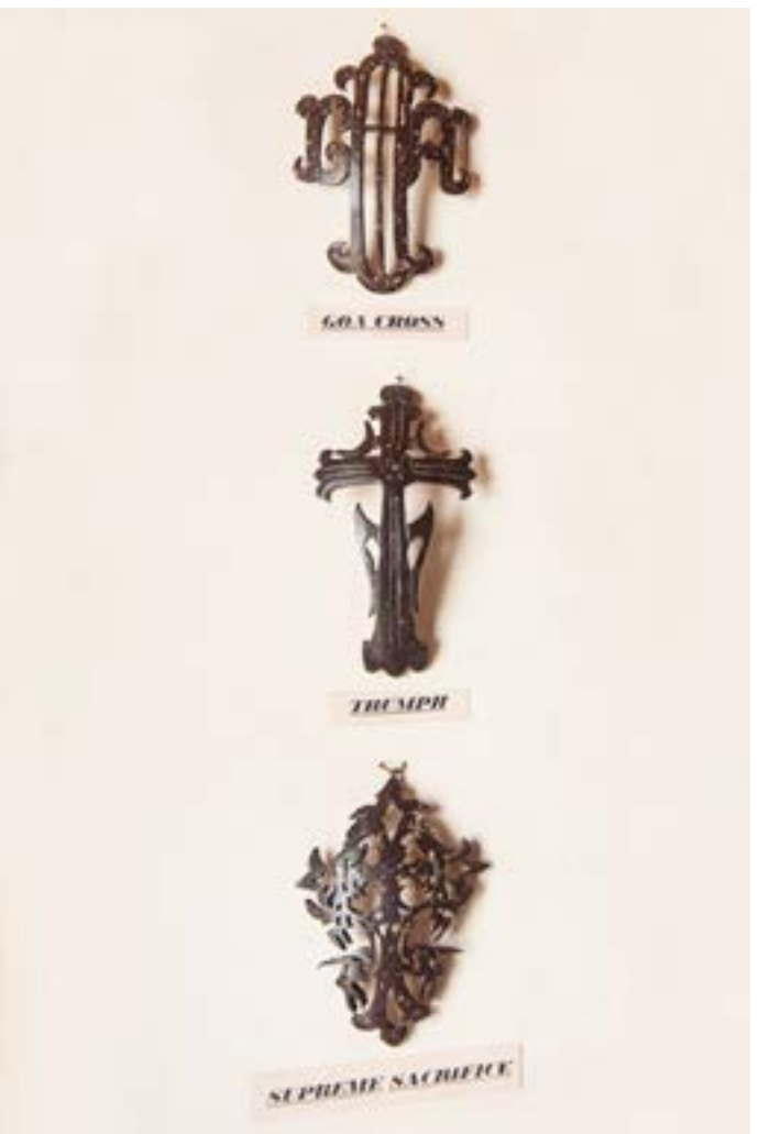
Different types of Cristian cross.