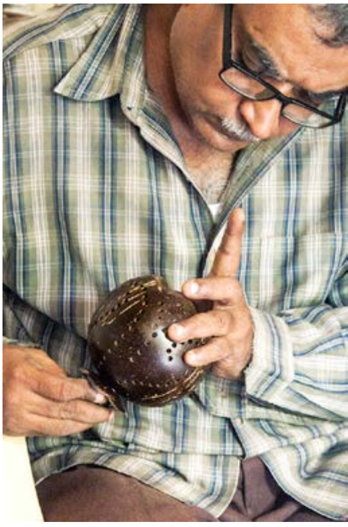
Bulb is placed inside coconut shell lamp.