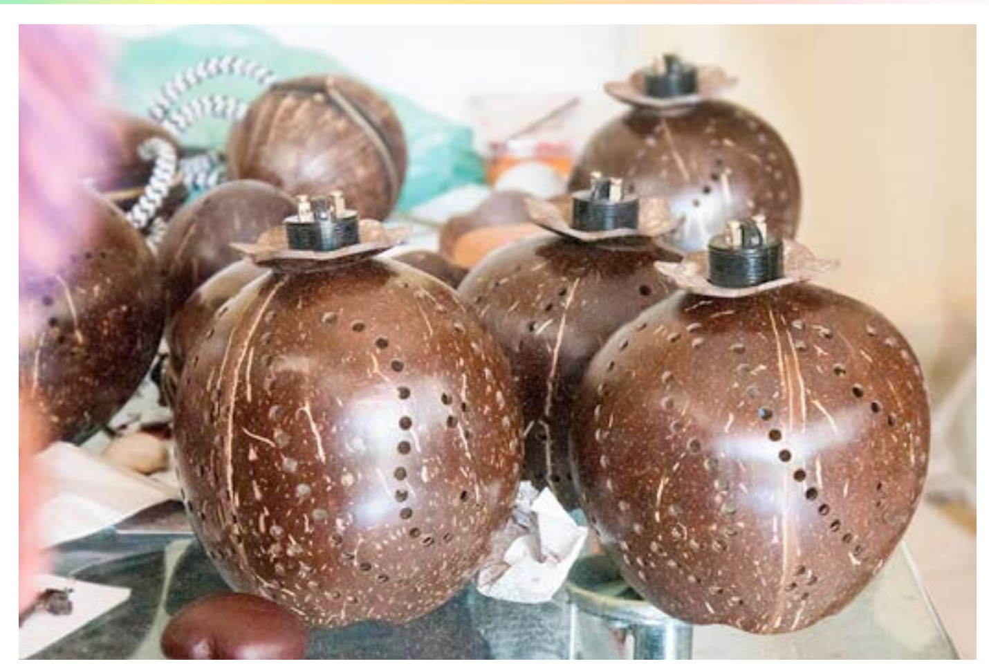
Beautiful Coconut shell lamps.