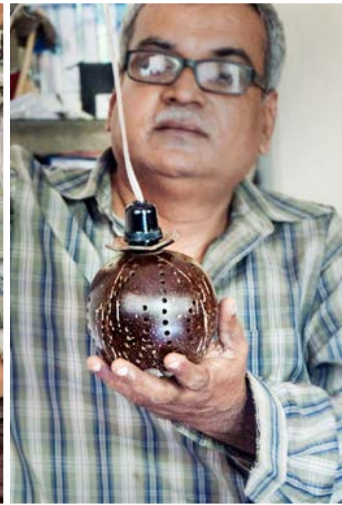
3x7 inch coconut shell lamp.