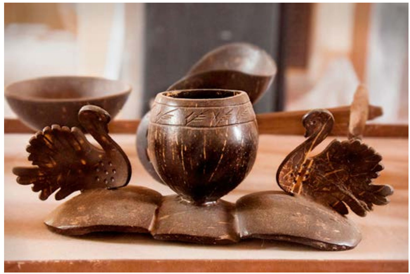
Coconut shell decorative product.

Coconut shell craft is an eco-friendly craft and is supported for the same reason. It has led to a wide range of products in which ninety percent of them are based on utility. There are decorative lamps, oil lamps from an inch to the biggest size (that is 8.3 feet). Cutlery items – Spoons, forks and more, decorative ones – oil lamps, table lamps, coffee/teapots, candle stands, showpieces, vases, earrings, jewellery, kitchenware, scenery and more. Appreciation of these products, innovations and plans to take this coconut shell craft on a larger scale is going well. Coconut shell tiles are being made. It generates a healthy environment. The coconut products are eco-friendly and attractive as well.