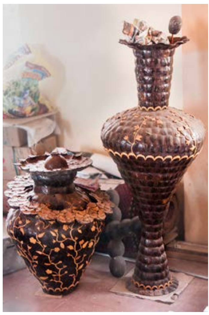
Coconut shell decorative products.