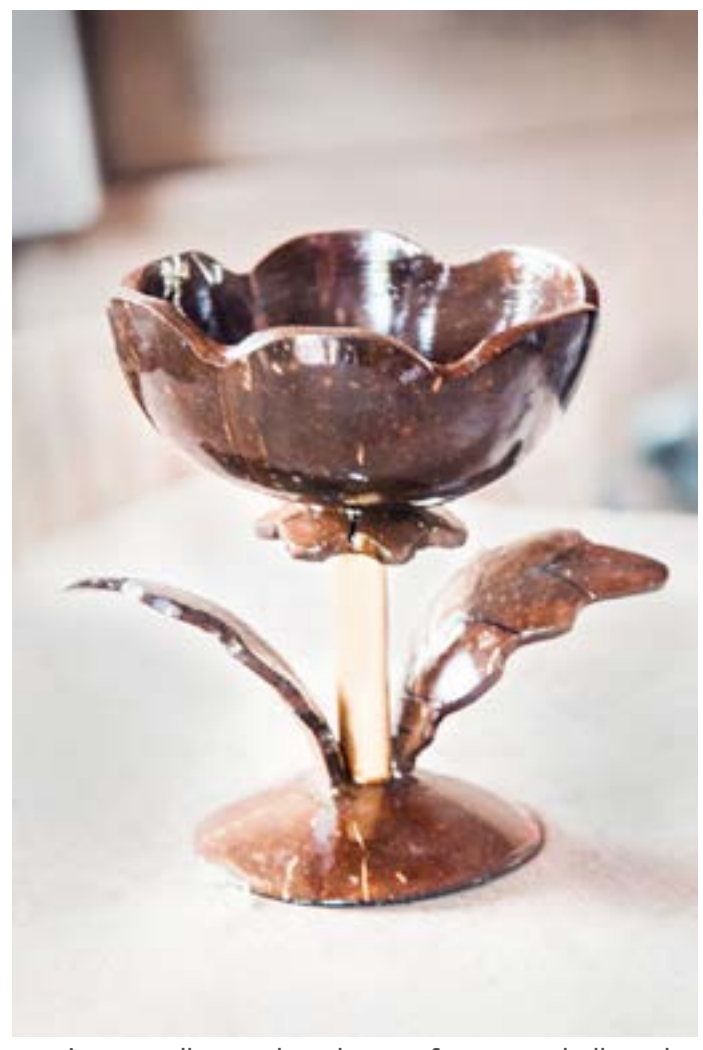
A unique candle stand made out of coconut shells and shaped like a single flower.