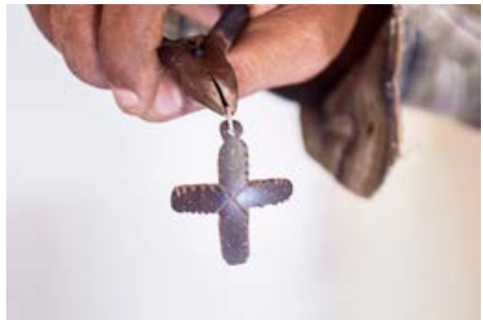
Article is made with small hole and hooks are attached.