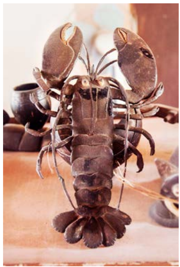
Coconut shell crab toy.