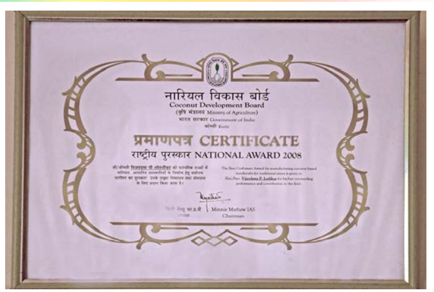
National Award of the Coconut Development Board.