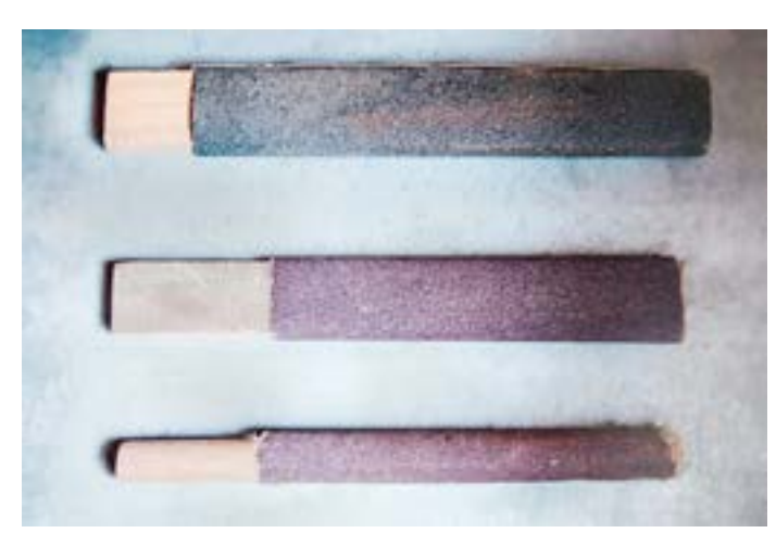
Different grades of sandpaper.