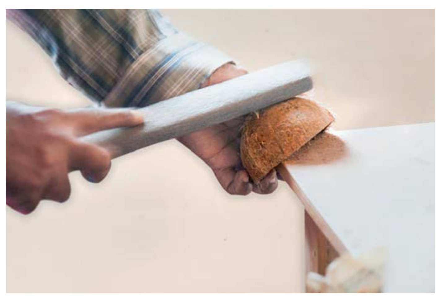
Artisan use a silicon carbide paper to get a smooth finishing.