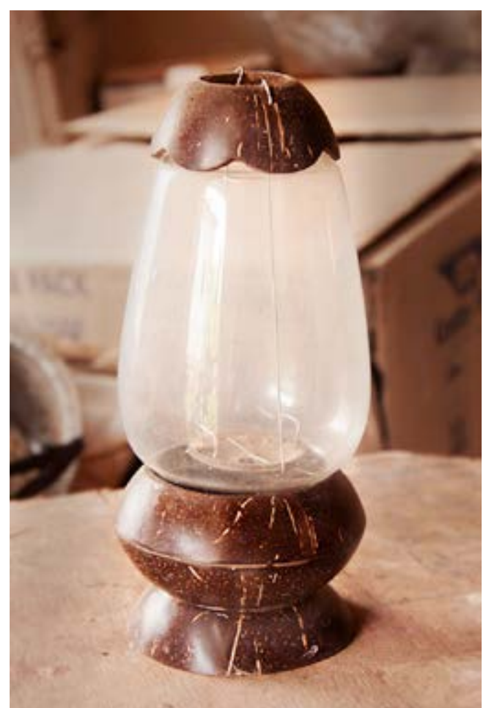
Beautiful coconut shell Candle holder.