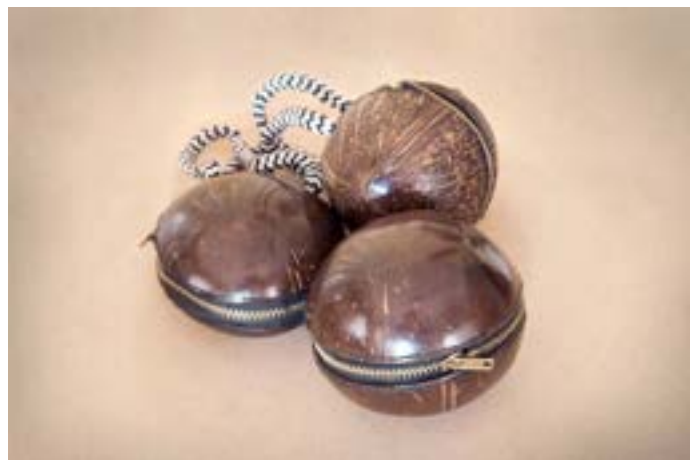
Coconut ball bag.