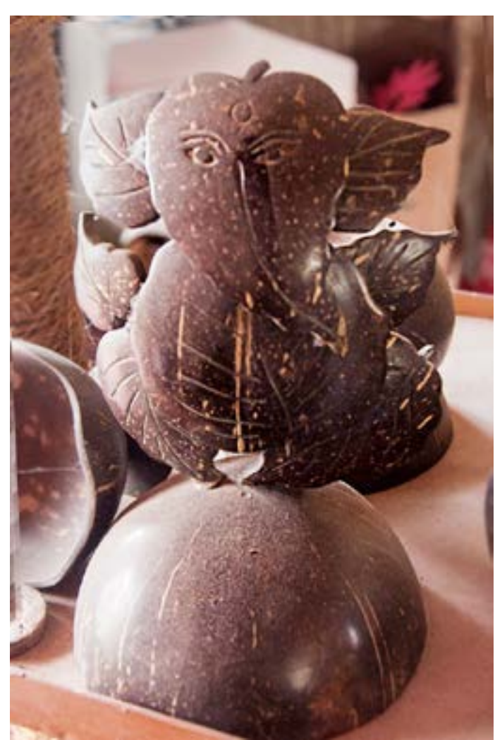
Coconut shell decorative product.