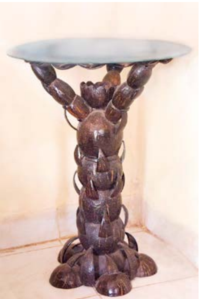
Coconut shell furniture.