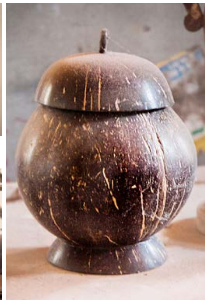
Multipurpose pot Jar (25 years old).