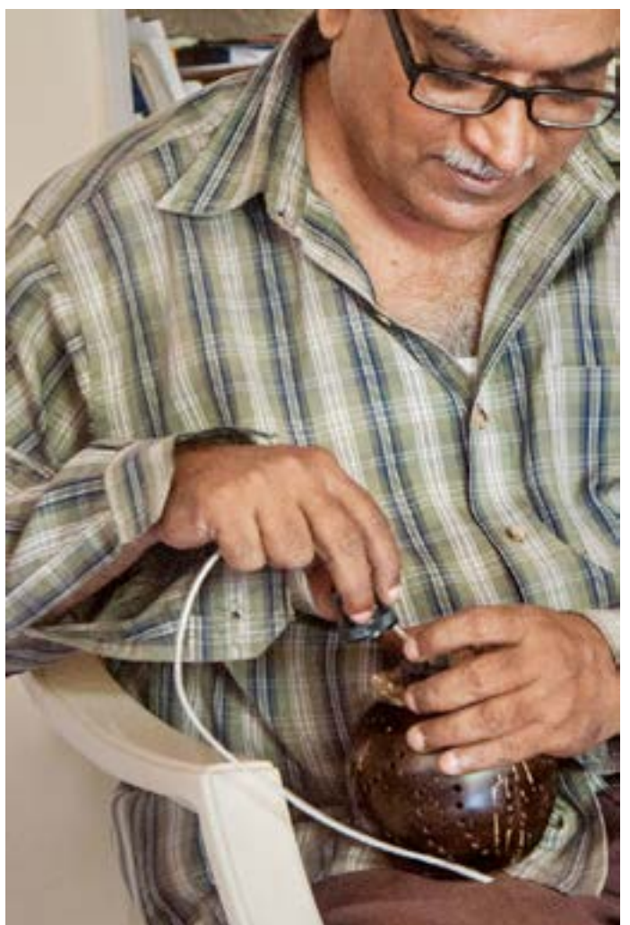
Artisan gives wire connection to coconut shell lamp.