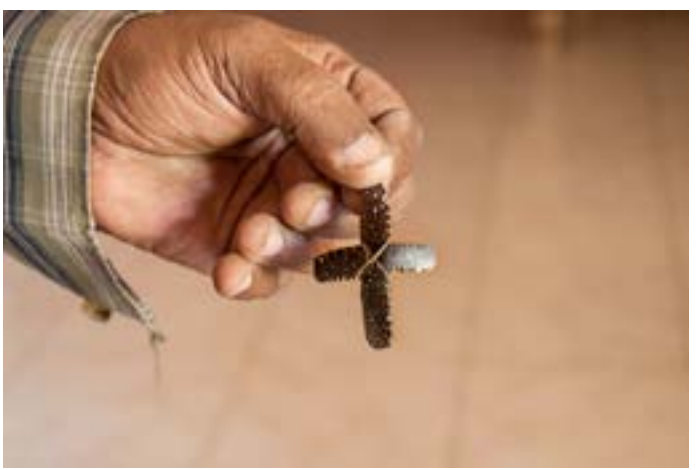
5x7 inch Cristian cross.