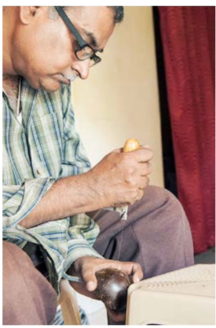
Carefully artisan carve the coconut shell because of hardness.