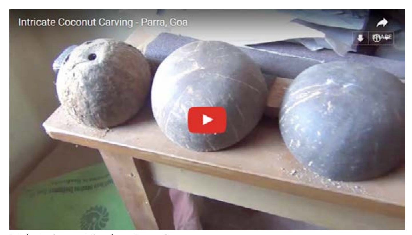
Intricate Coconut Carving - Parra, Goa