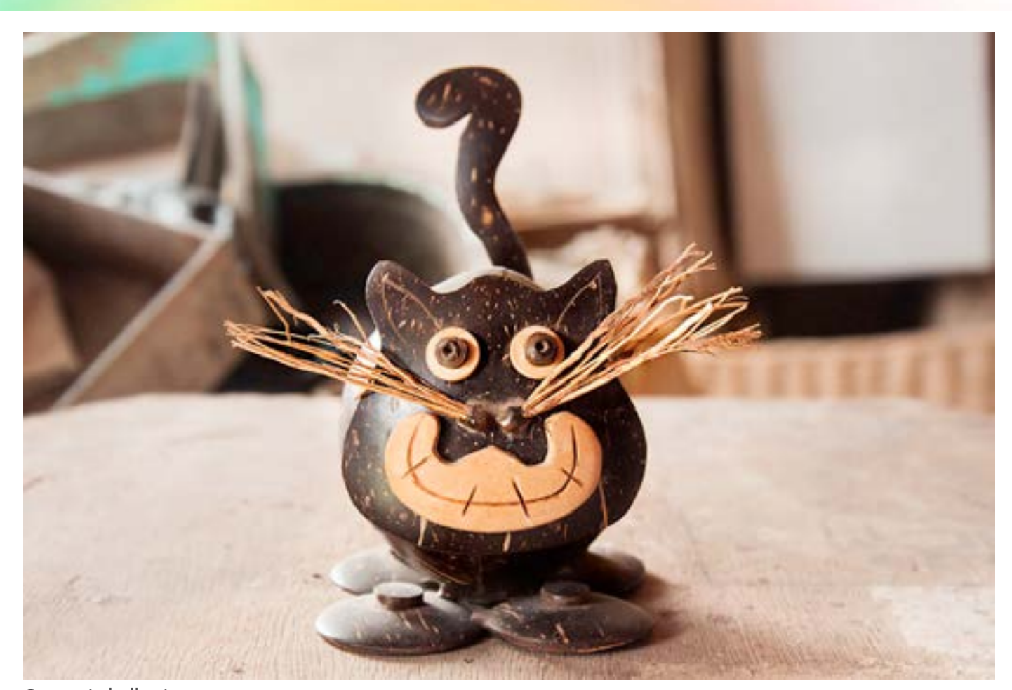
Coconut shell cat.