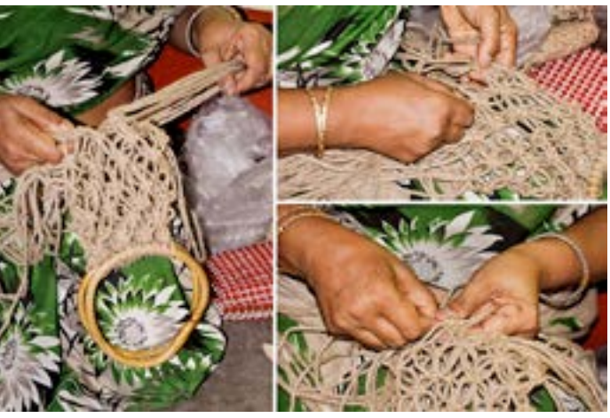
The final stage of the jute bag knitting stage.