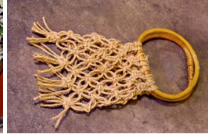
A glimpse of finished Jute bag.