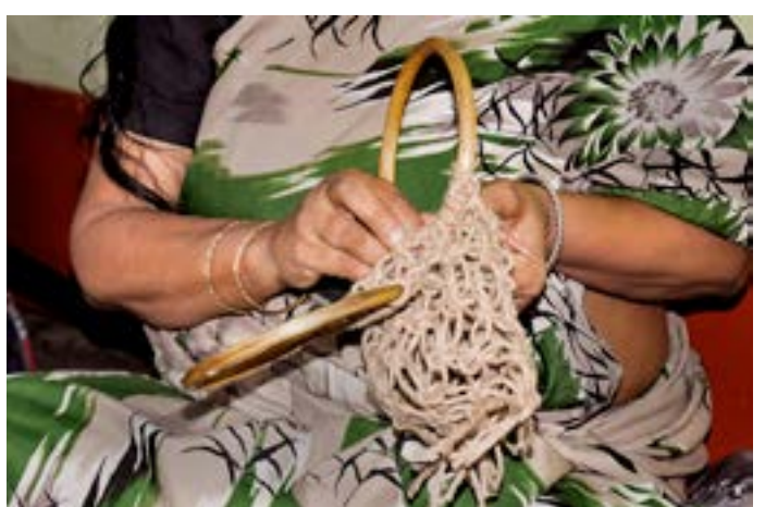
A jute bag with handles.