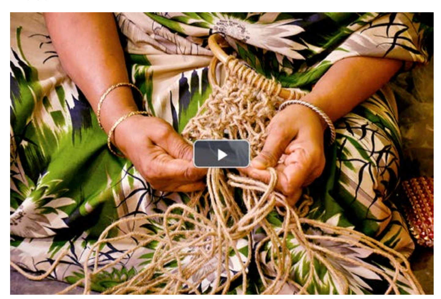
Jute Handicrafts - Kolkata