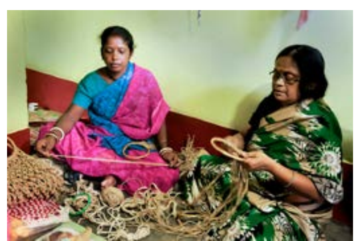
Artisans are involved in jute bag making.