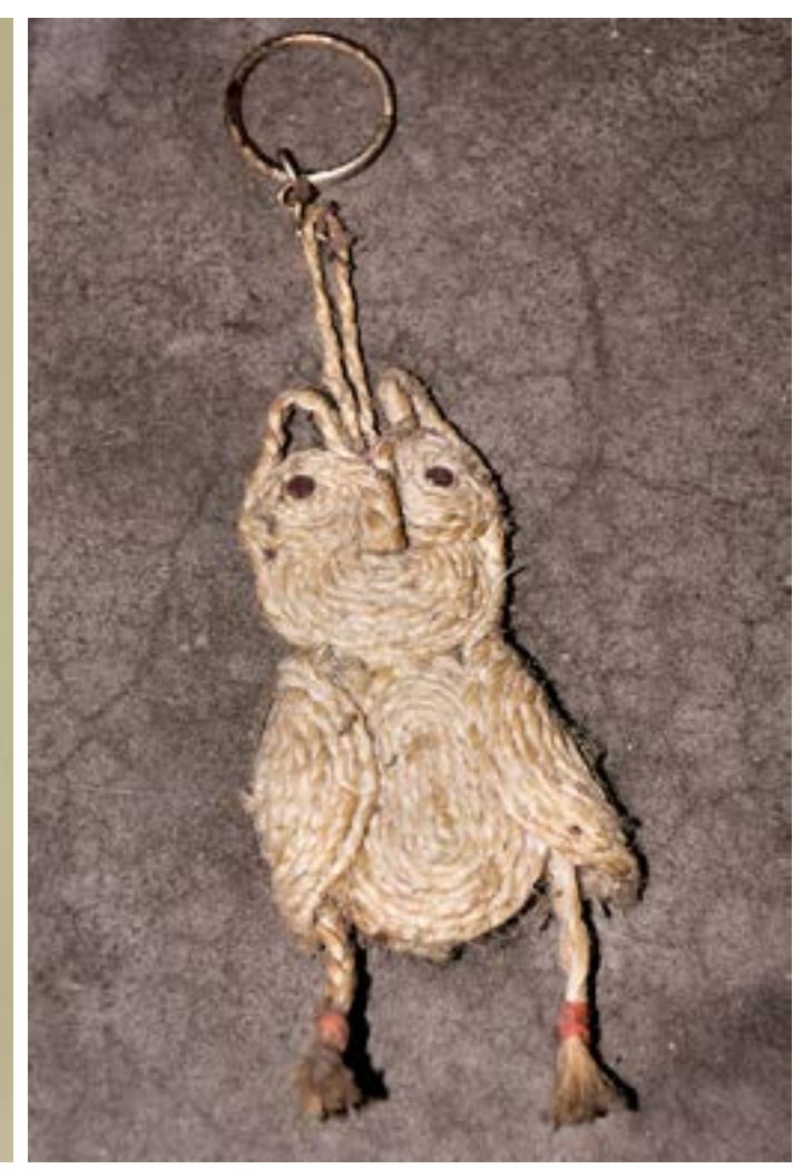
A keychain depicting an owl made of jute threads.