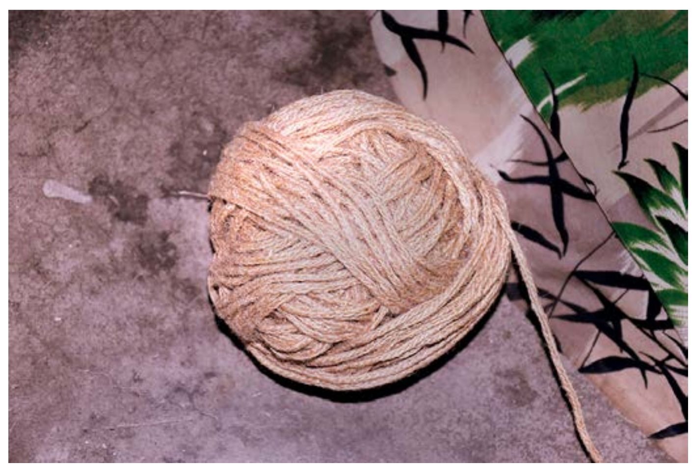
Jute yarn used in the bag making.