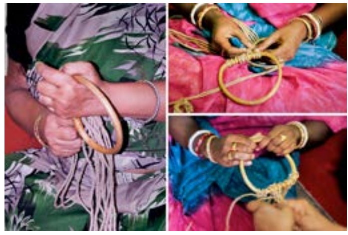
The artisan knitting jute yarn within the bamboo handle.