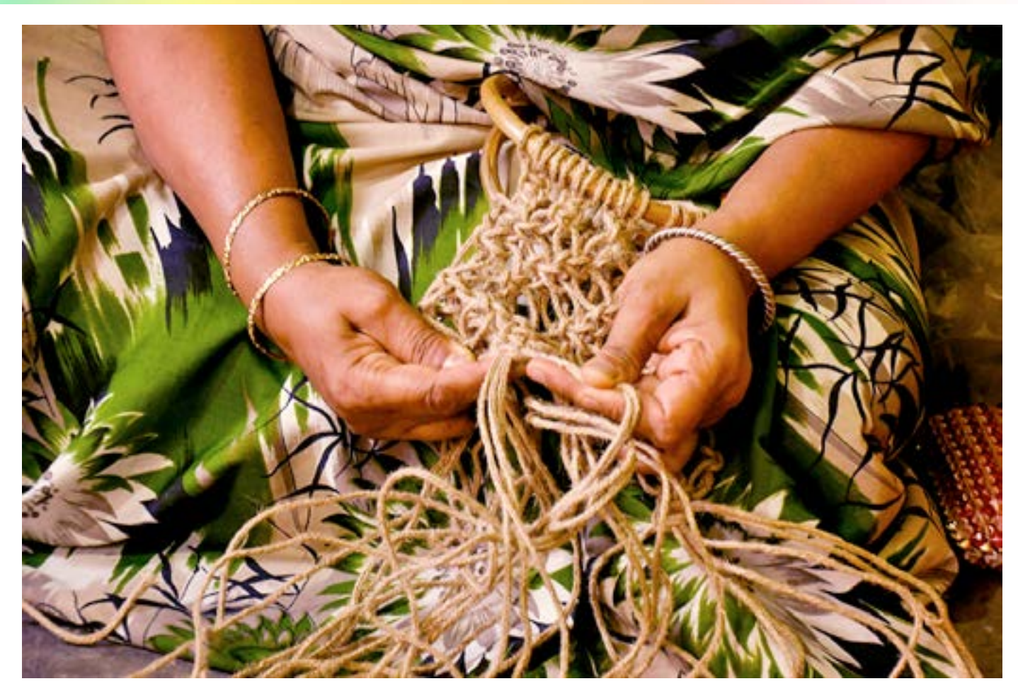
Artisan tying the jute threads with hands.