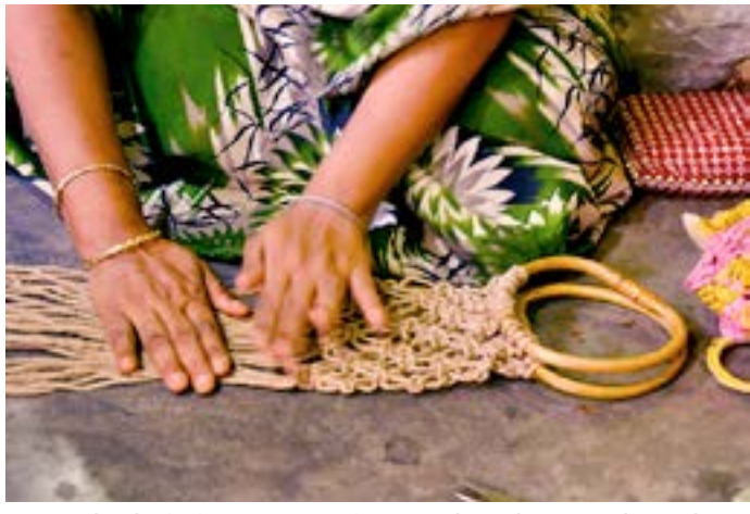
Once the knitting process is completed, extra threads are trimmed with a scissor.