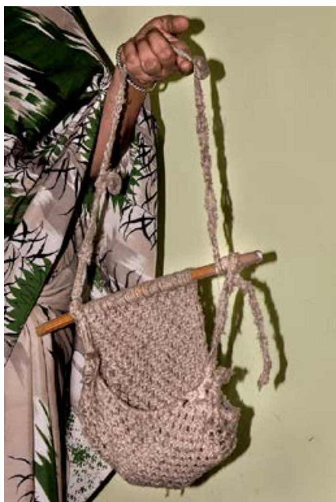
Artisan displaying a baby cradle made of jute.