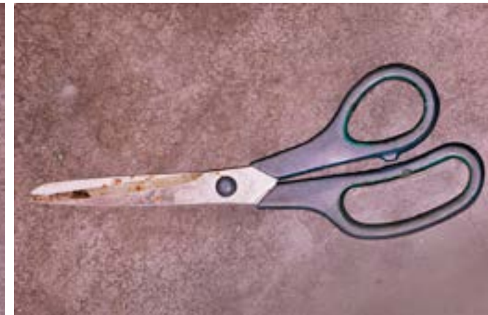
Scissors used to cut jute thread.