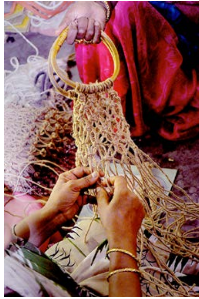
Artisan weaving the threads manually.