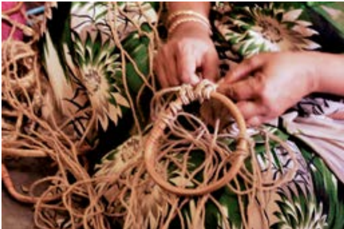
Eight jute threads being knitted on the bamboo handles to start the jute bag making process.