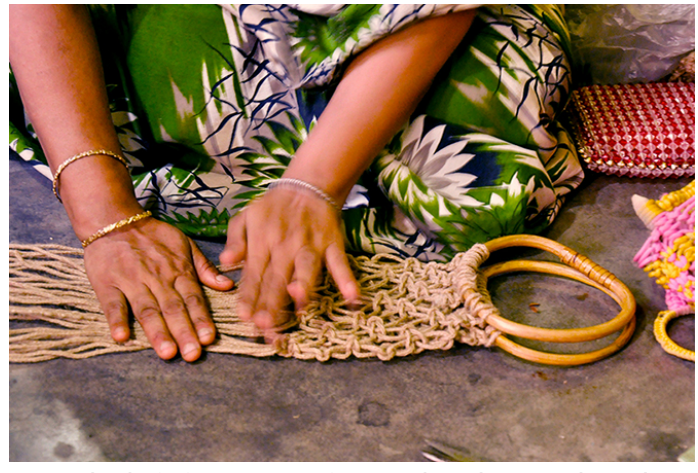
Once the knitting process is completed, extra threads are trimmed with a scissor.