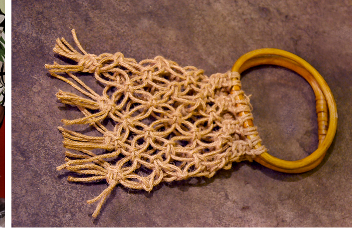
A glimpse of finished Jute bag.