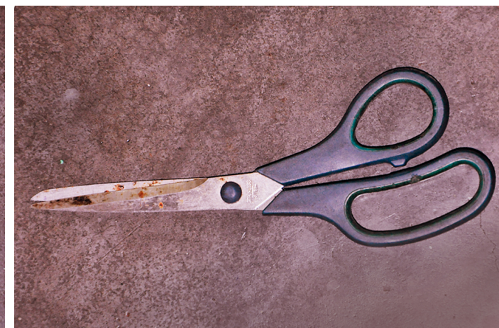
Scissors used to cut jute thread.