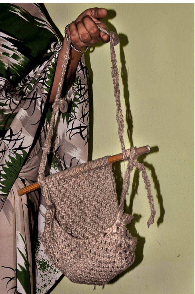
Artisan displaying a baby cradle made of jute.