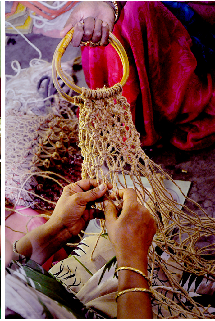
Artisan weaving the threads manually.