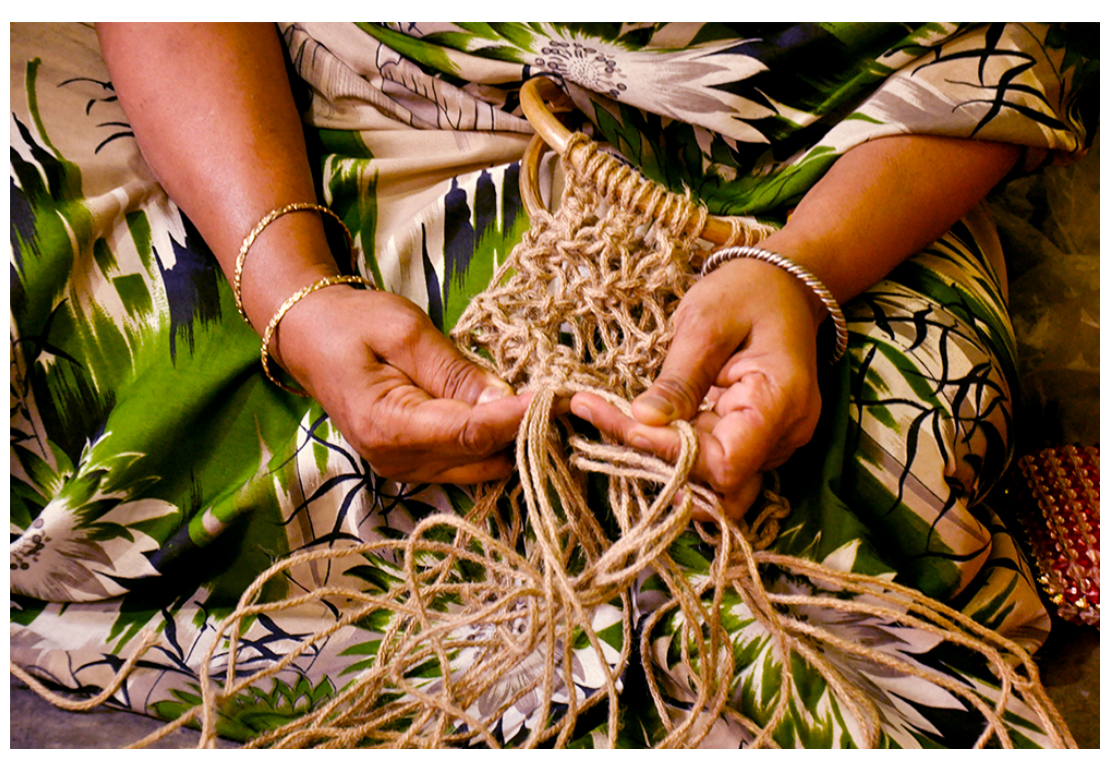
Artisan tying the jute threads with hands.