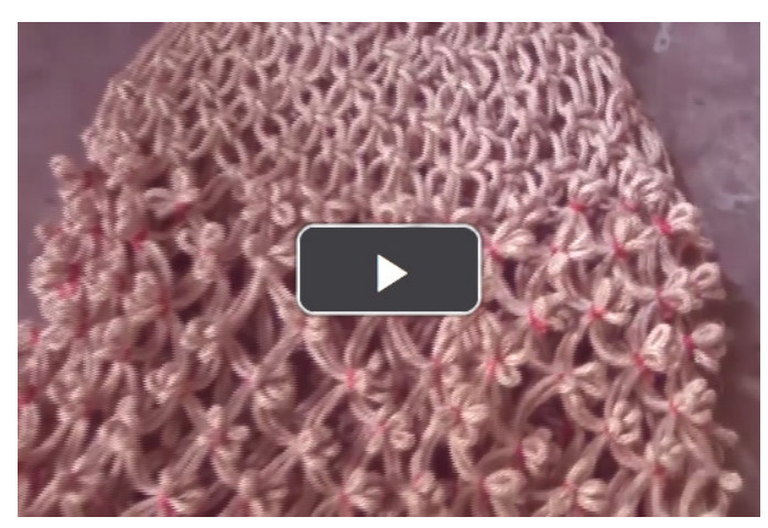
Jute Handicrafts - Kolkata