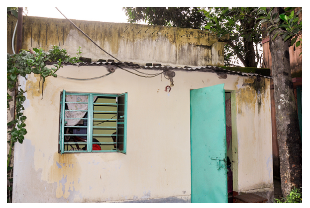
Artisan Mrs. Nupur Bhawal's house.

Jute products, mainly bags, are much stronger and more nature friendly than other contemporary options like poly bags, cotton bags, paper bags that drastically affect the ecosystem. Nowadays, jute products come with a fancy, stylish dash, thus placing a strong completion against their counterparts. Macramé is a kind of jute bag largely practiced in parts of Kolkata that are named after the knots used in its making. The macramé knots though venerable, with multiple loops, form a series of patterns, thus producing elegant ornaments and accessories. This set of knots include a square knot, a half knot, a half hitch, larks head knot, and coil knot are widely used to create jewelry, bags, mats, plant hangers, and wall hangings. The making of Macramé involves certain hand movements that prove to be a great exercise method for fingers and the wrist. The hand joint seems loose and strong with regular practice of tying macramé knots. Jute craft making is a hobby for many women artists. Mrs. Nupur Bhawal from West Bengal is spending her leisure time making handicrafts. She has been practicing these crafts since many years. Her hobby is turned into a profession.