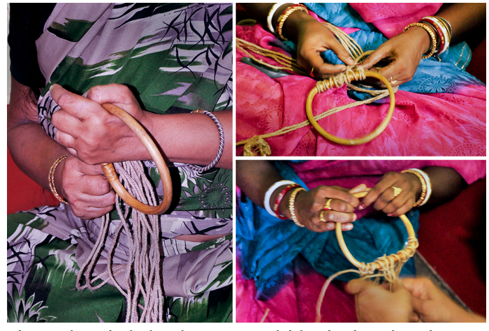
The artisan knitting jute yarn within the bamboo handle.