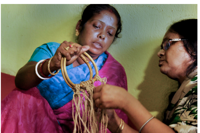
Another artisan lending a hand while weaving the thread by holding the bamboo handle right.