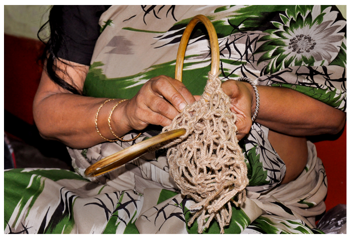
A jute bag with handles.