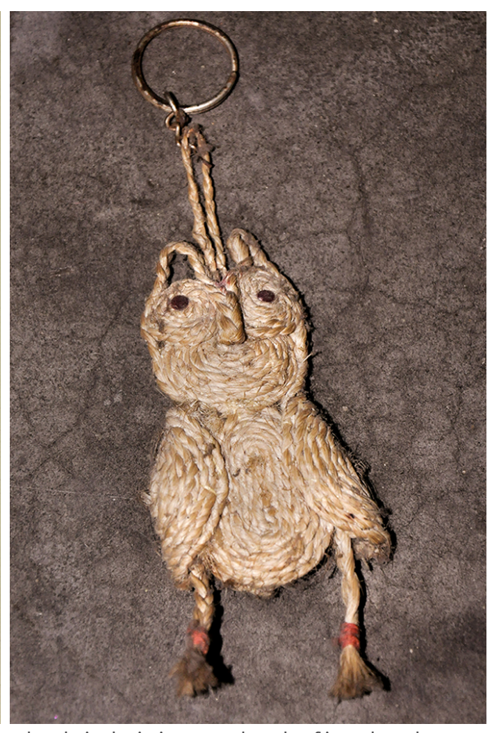
A keychain depicting an owl made of jute threads.