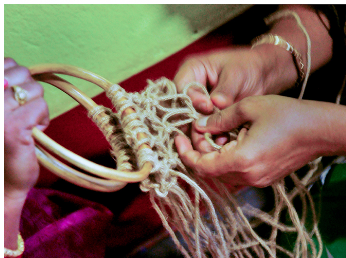
Artisan weaving jute threads as per the net shape.