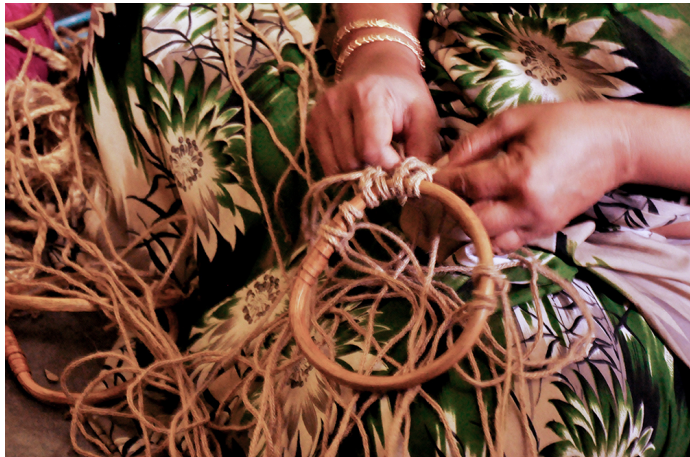
Eight jute threads being knitted on the bamboo handles to start the jute bag making process.