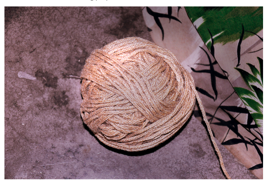
Jute yarn used in the bag making.