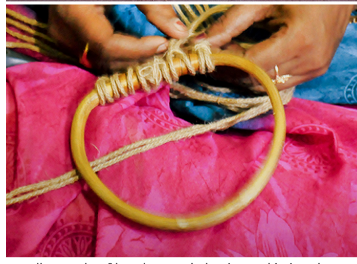
Handles made of bamboo and plastic used in jute bags.