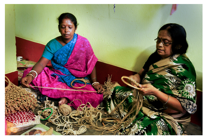
Artisans are involved in jute bag making.