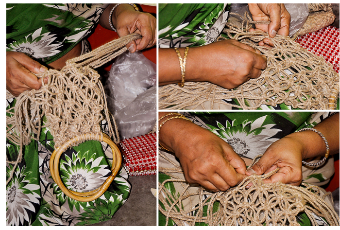
The final stage of the jute bag knitting stage.