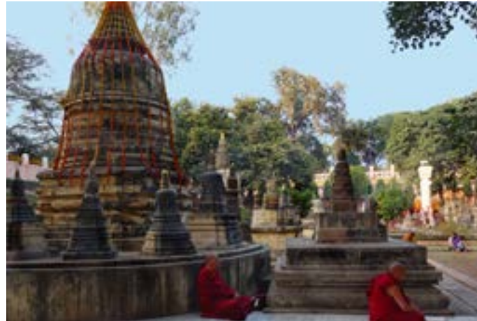
Tibetan monks sitting in the temple premises.