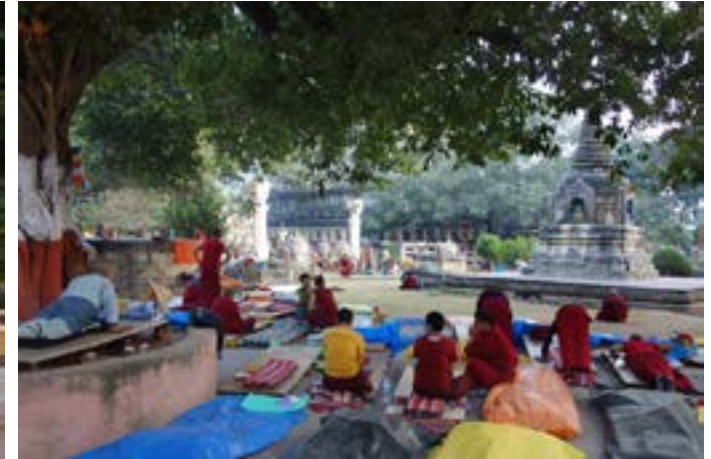
Tibetan monks prostrating before the temple. These prostrations are often done either 3, 7, 21, or 108 times.