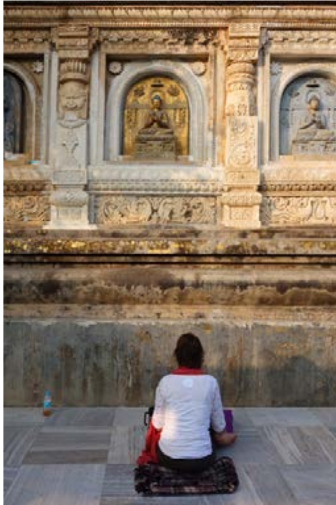
A foreign devotee deep in meditation before one of the small statues of Lord Buddha (dharmacakrapravartana) this idol creates a gesture indicative of the teaching Buddha who preached his first sermon in Sarnath.