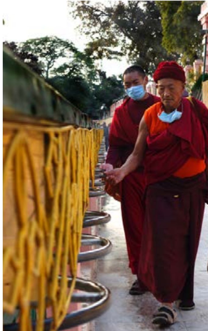
Monks turning the prayers wheels encircling the complex.