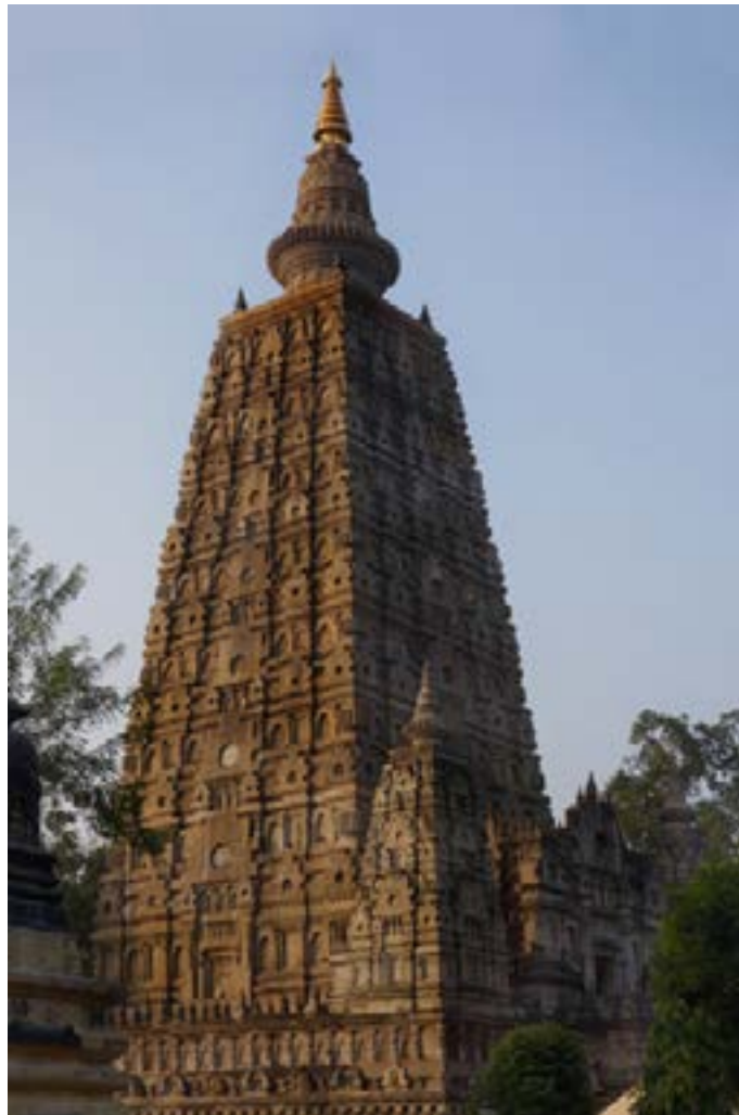
The spire of the Mahabodhi temple.