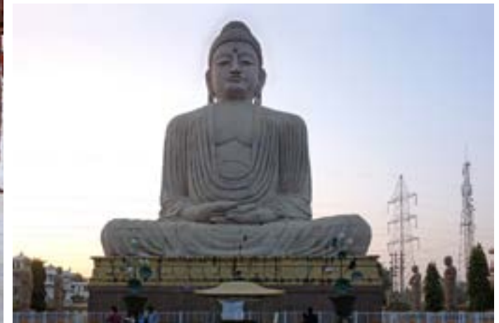
The Great Buddha located in Bodhgaya - is an 82 feet statue of Shakyamuni Buddha expressing the gesture of meditation, which is indicated by his pose - the right hand placed over the left, with stretched fingers and palms facing upwards.