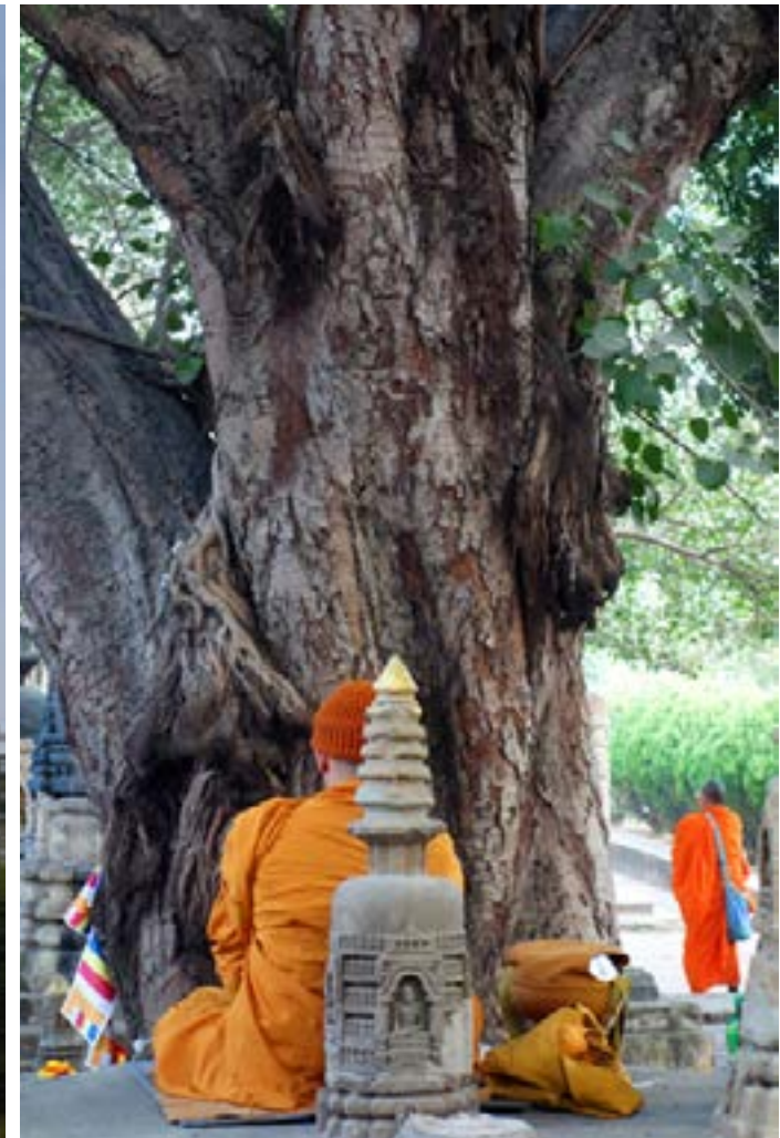
A Malaysian Buddhist monk in meditation under a peepul tree.