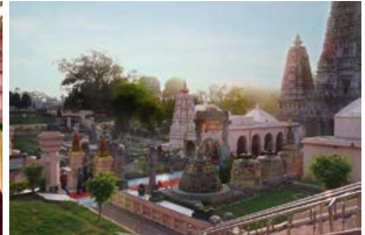
A long shot of the complex reveals the various levels and layers of the area - with different stupas, paths, empty spaces for contemplation, temple rooms and the monumental Mahabodhi temple.