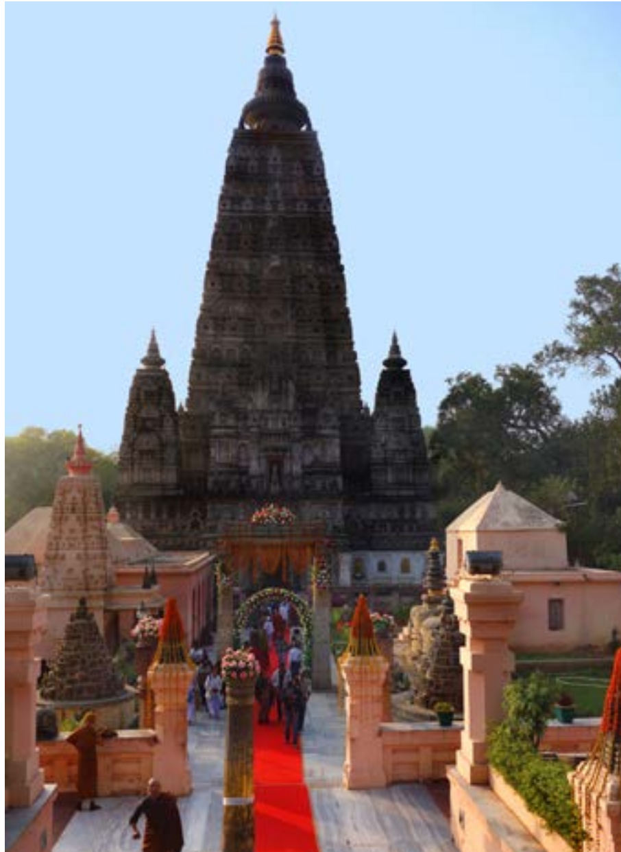
The first glimpse of the tall and erect structure of the Mahabodhi temple within the complex.