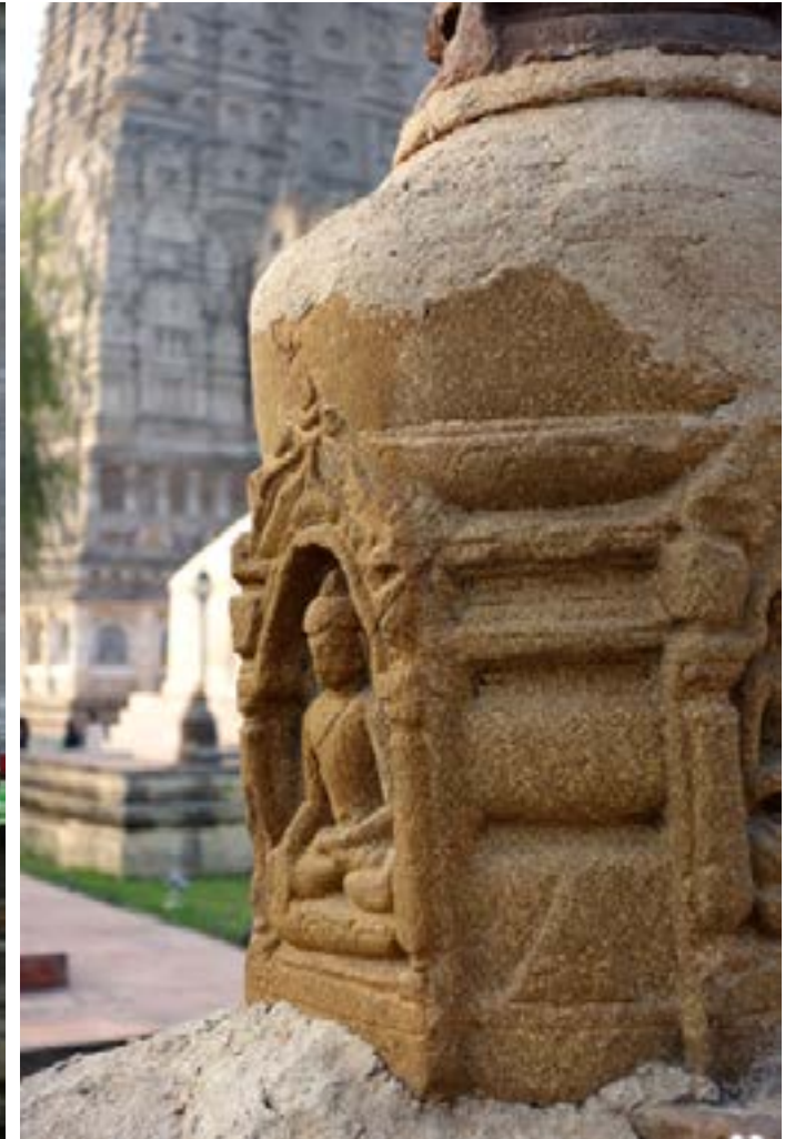
Details of a Chorten within the temple complex.