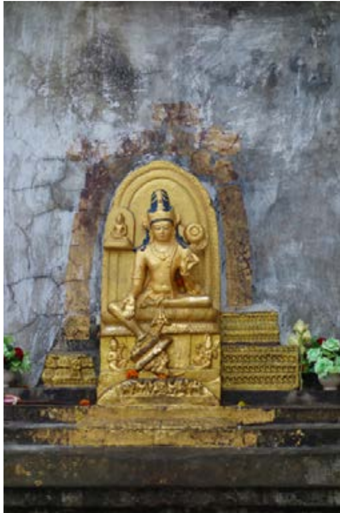
An antiquated statue of Tara (a female Bodhisattva in Mahayana Buddhism) outside the temple.