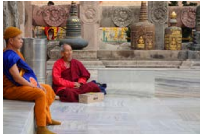
A Tibetan monk and a monk from Thailand contemplating within the temple space.