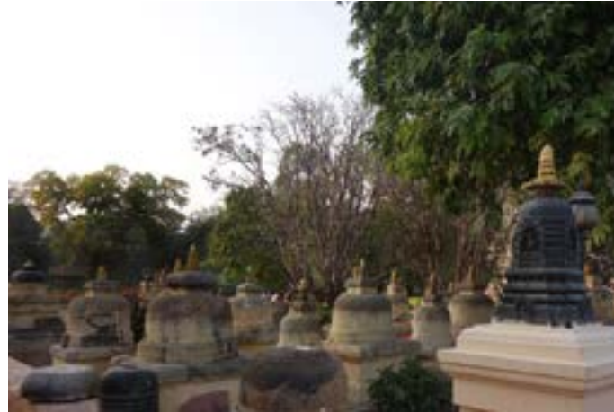
Stupas scattered amidst the temple areas.

https://dsource.in/resource/mahabodhi-temple-bodh-gaya/mahabodhi-temple