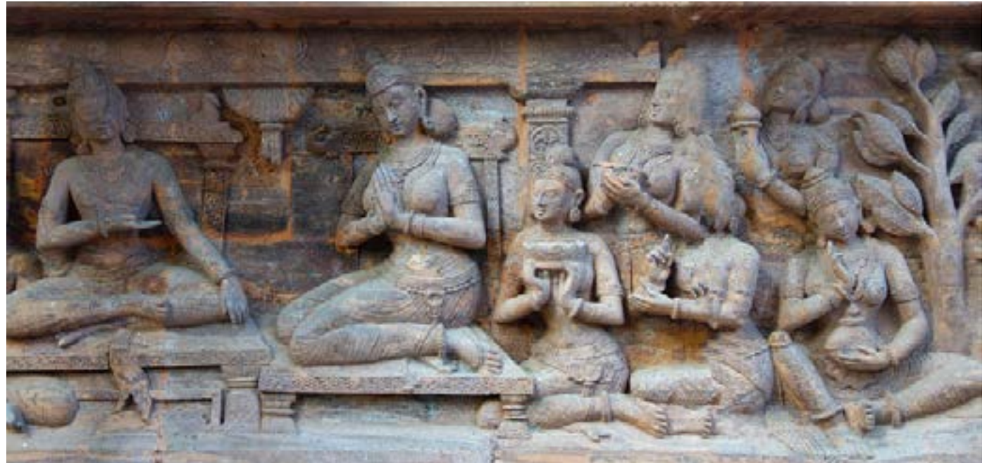
Numerous stone murals like this one - depicting devotees listening to Buddha - and more are created around the buildings within the temple complex.