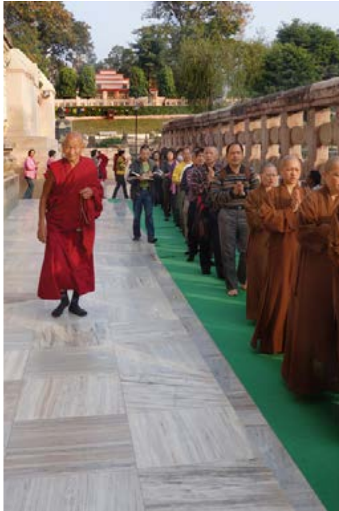
A contingent of monks from Japan doing a pradakshina around the temple while chanting prayers.