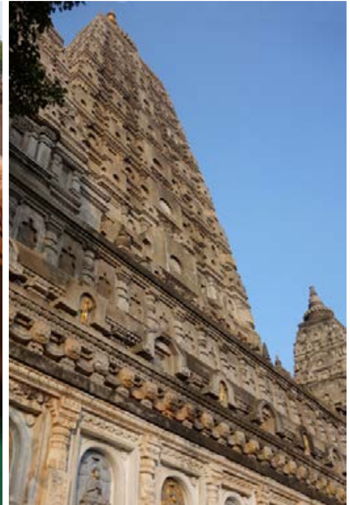
A close up of the temple's spire reveals geometric patterns and niches containing carved images of Lord Buddha. There are floral patterns and animals embellishing the spire.