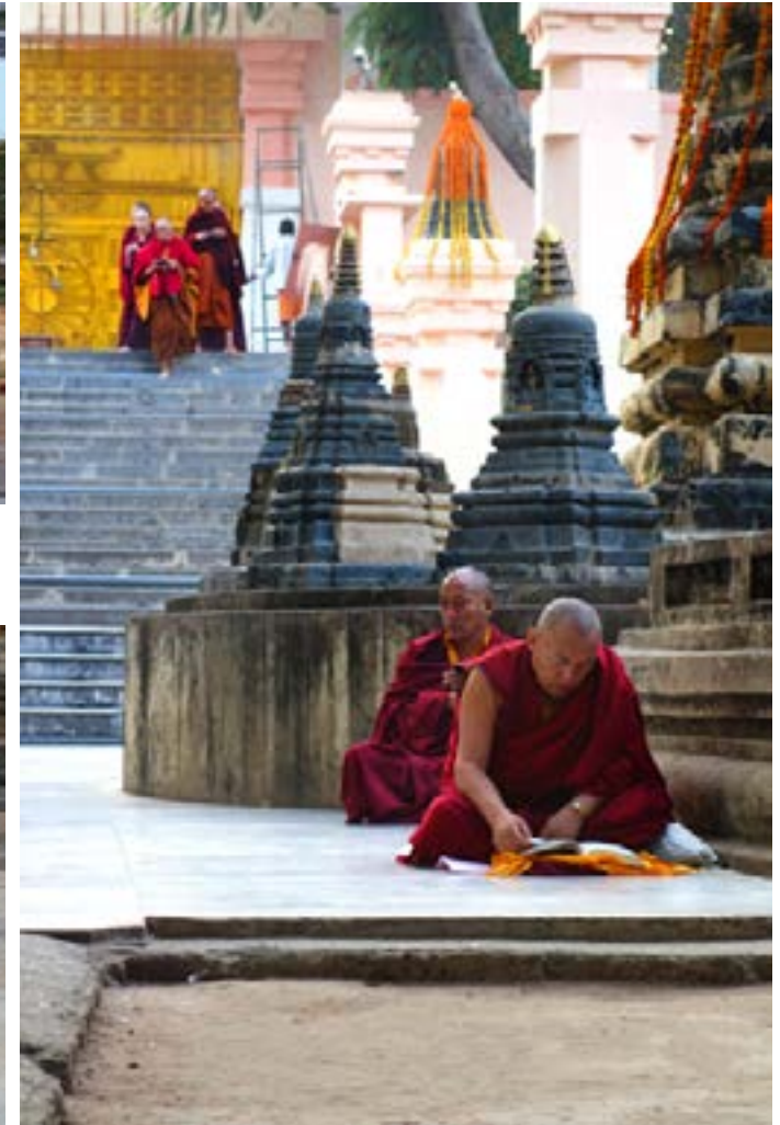
Tibetan monks praying within the temple complex.