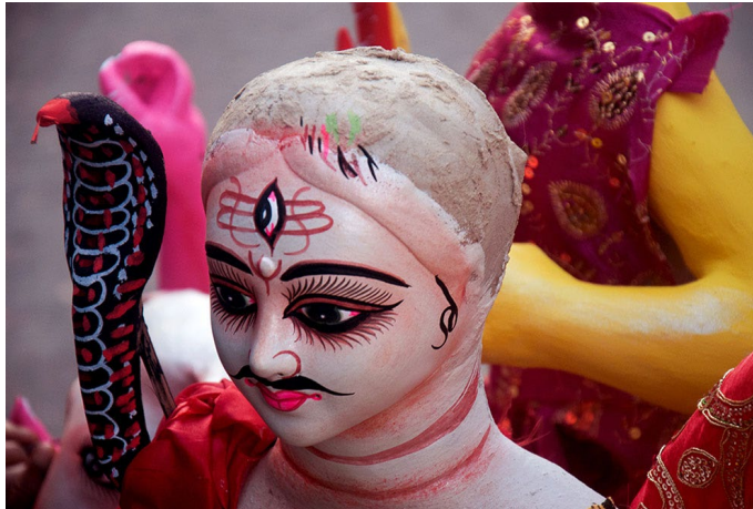
The Shiva idol's face in the painting process.