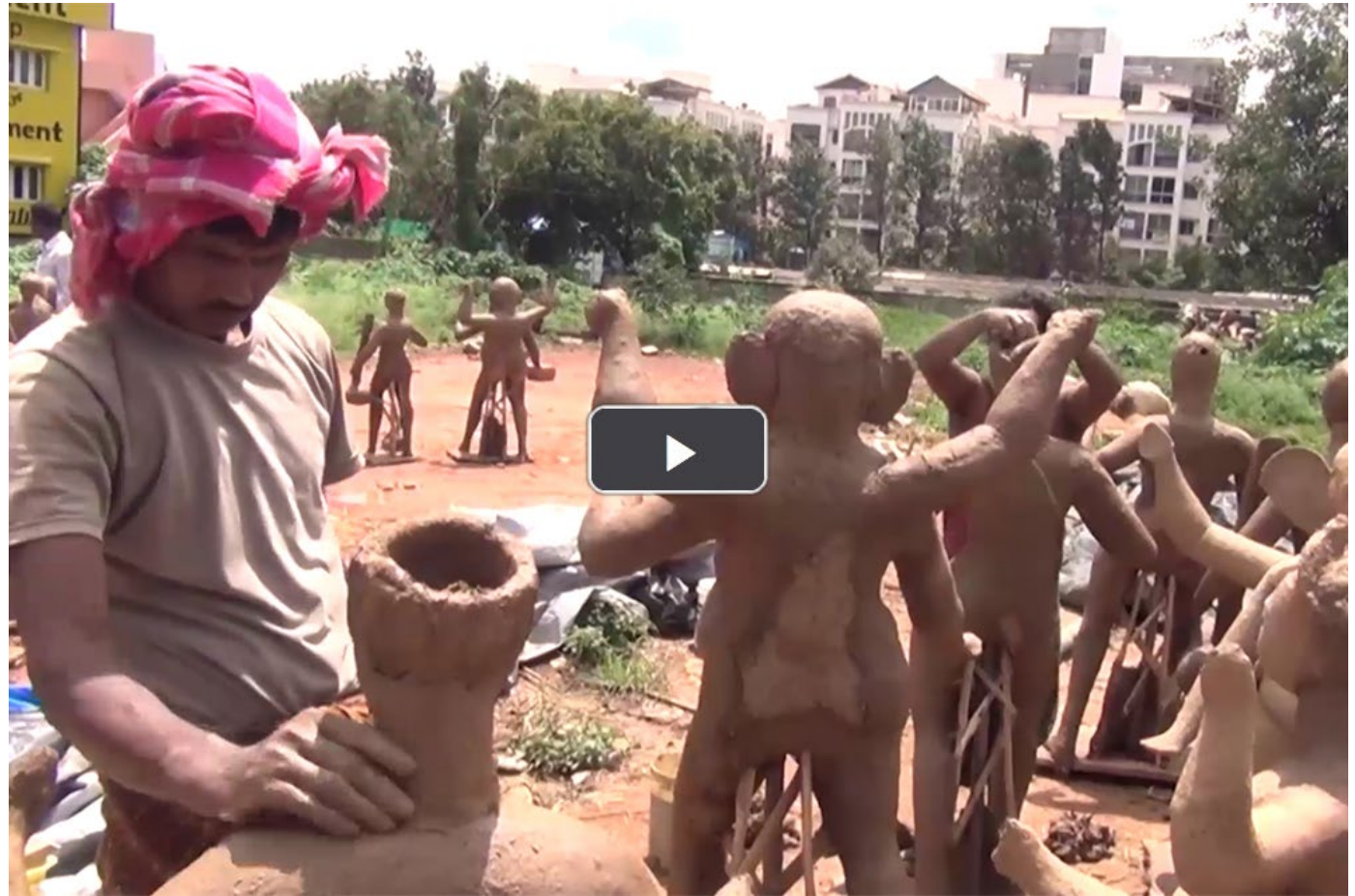
Making of Durga Idol - Tripura