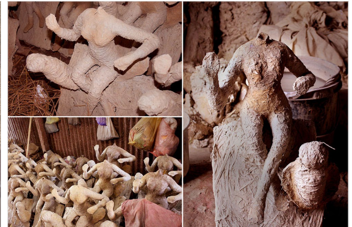
The clay is applied to the armature as a base coat.