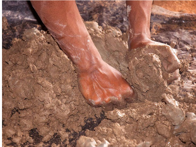
Artisan kneading the clay.