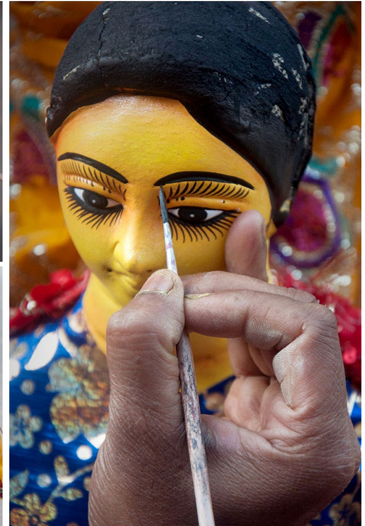
The artisan is painting the eyebrow part.