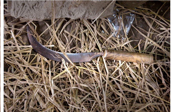
Sickle shaped knife is used in idol making.