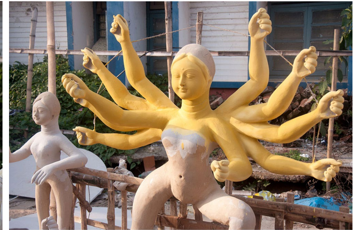
The idol is kept for the drying process.