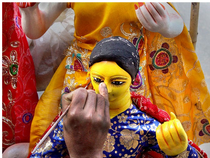
The process of painting the features of the idol.