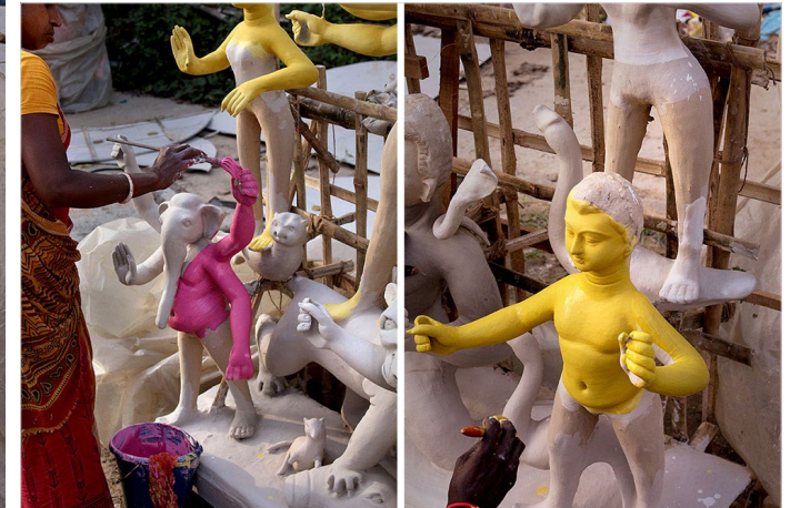
Artisan is applying the colour on Ganesh and other small idols.