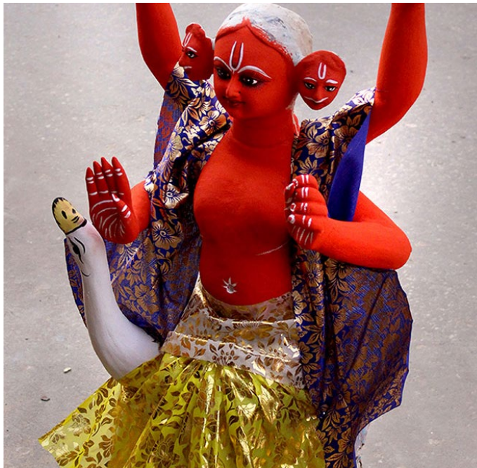
The idol of the Brahma is painted in red colour.