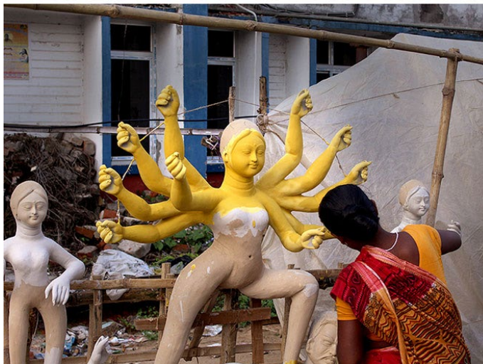
The artisans are applying the yellow colour on the idol.