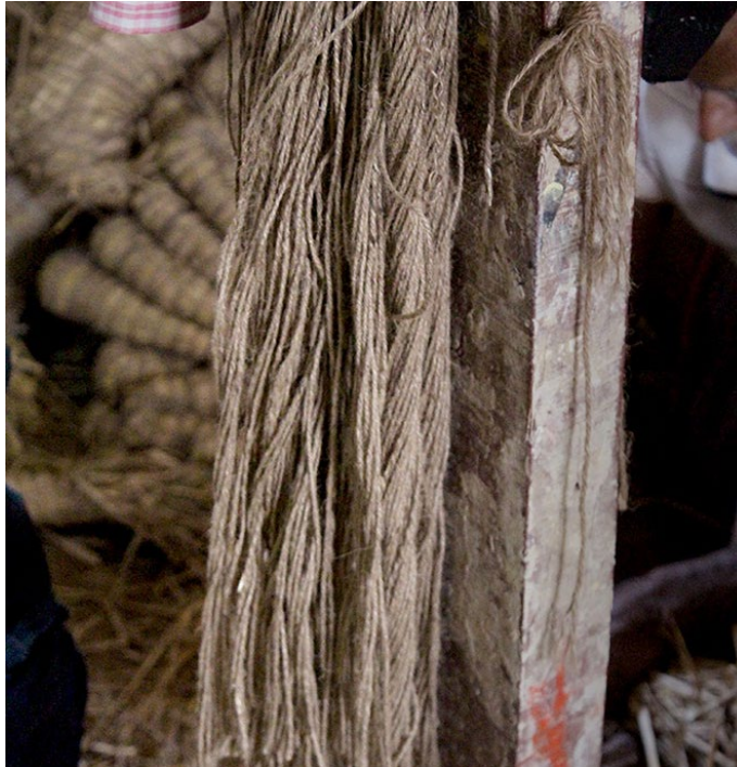
Twine threads are used to tie the hay to get the basic structure of idol.