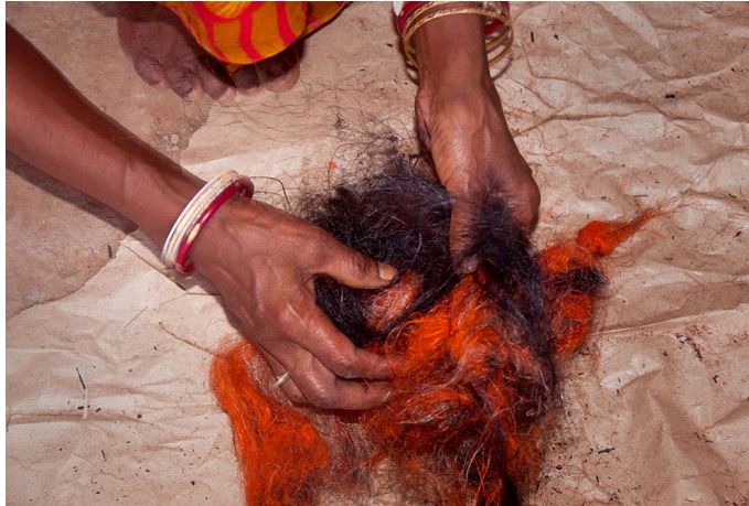
Dummy hair is spread to fix on the idol.