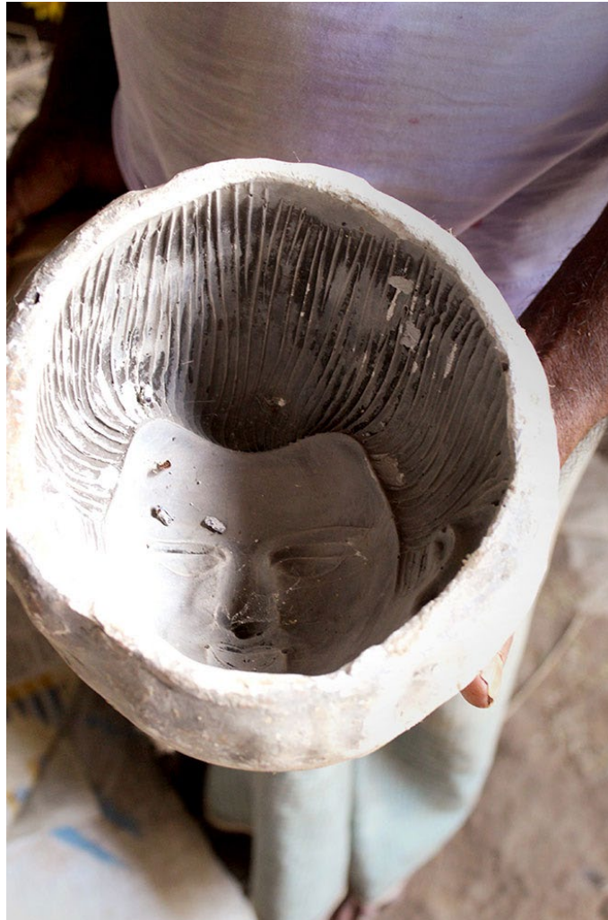
Face mold is used to make the face of the idol.