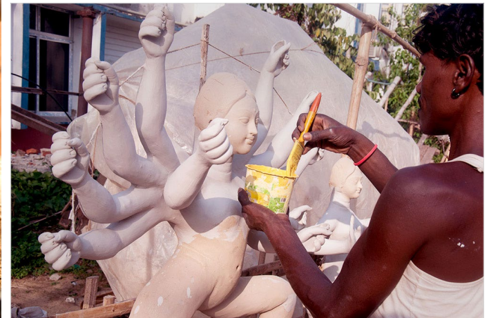
Artisan is applying the base colour on the idol.