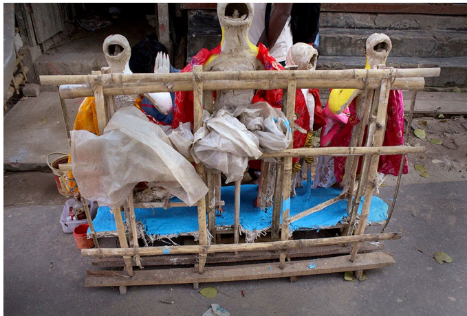
The idols are supported with wooden sticks.