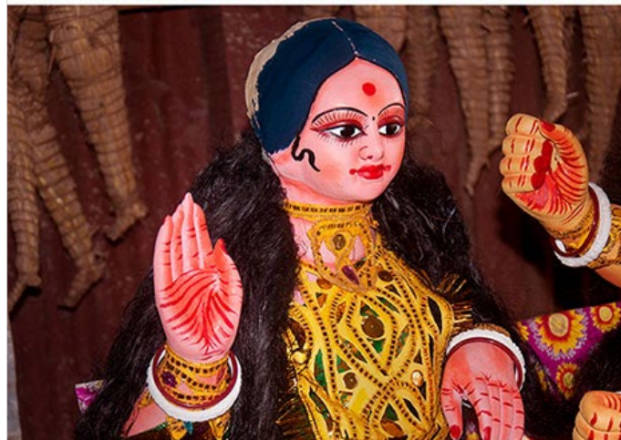
Beautifully ornamented Goddess Durga's idol.