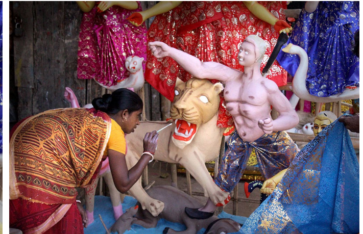
The women artisan is colouring the idols.