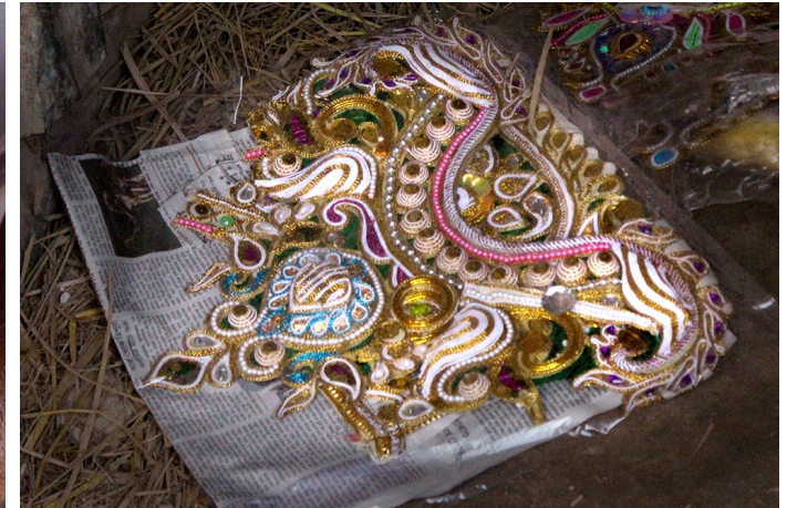
Accessories like artificial crown is used to decorate the head of idol.