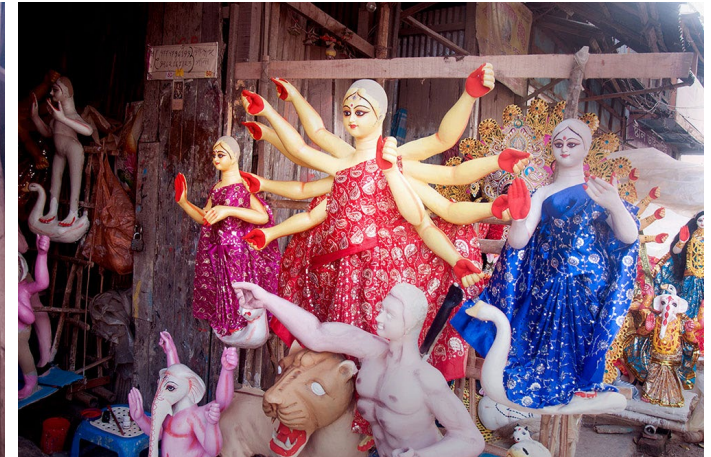
The coloured idols are in the making process.