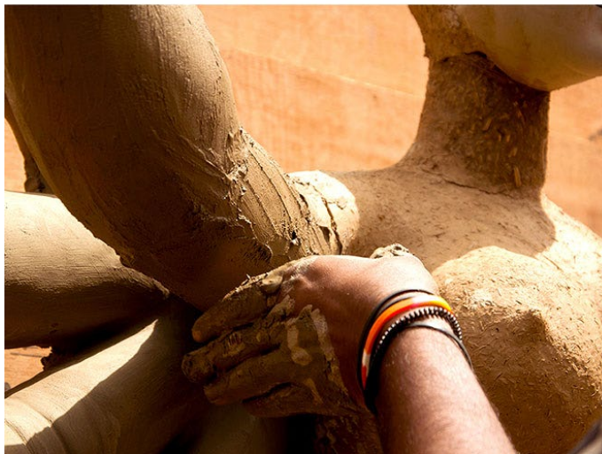
The face and other body parts are being fixed.