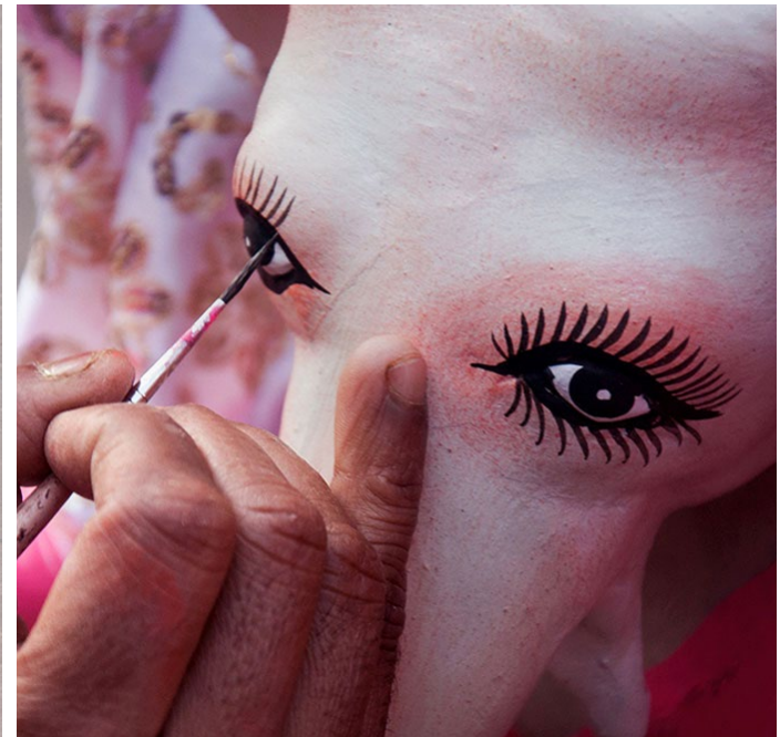
Artisan is painting the eyebrow part of the Ganesh idol.