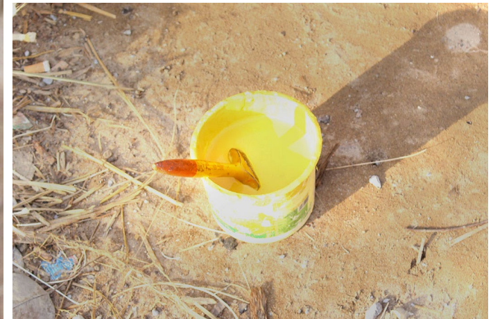
The brush and yellow colour are used to paint the idol.