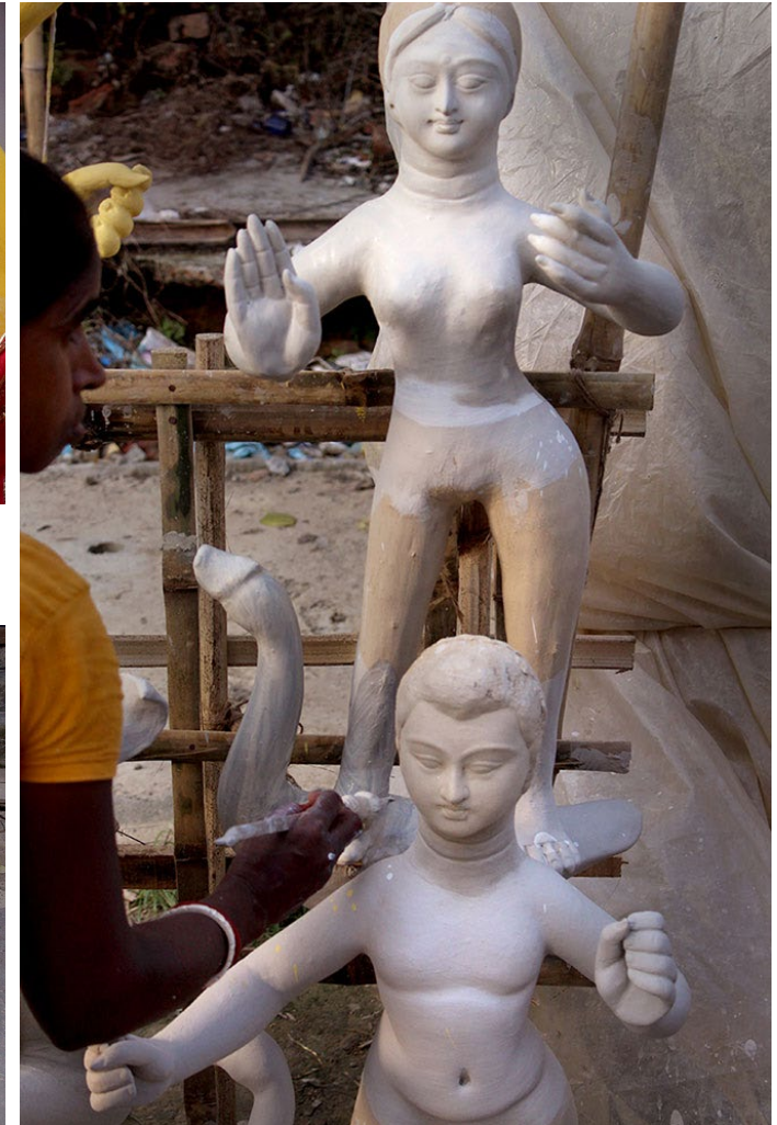
A women artisan is giving white colour as a base colour on the idols.