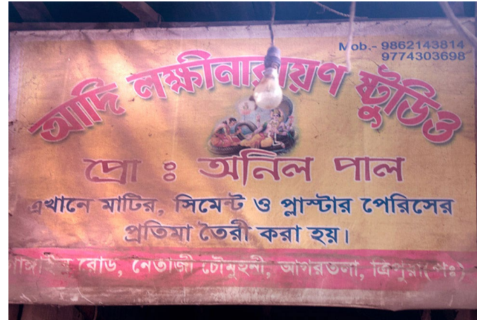
The board of idol making place.

https://dsource.in/resource/making-durga-idol-tripura-agartala/introduction