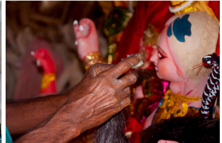
The artificial hair is stuck on the idol's head.