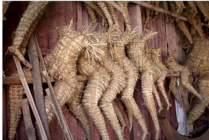
Armature of an idol in different shapes and sizes.