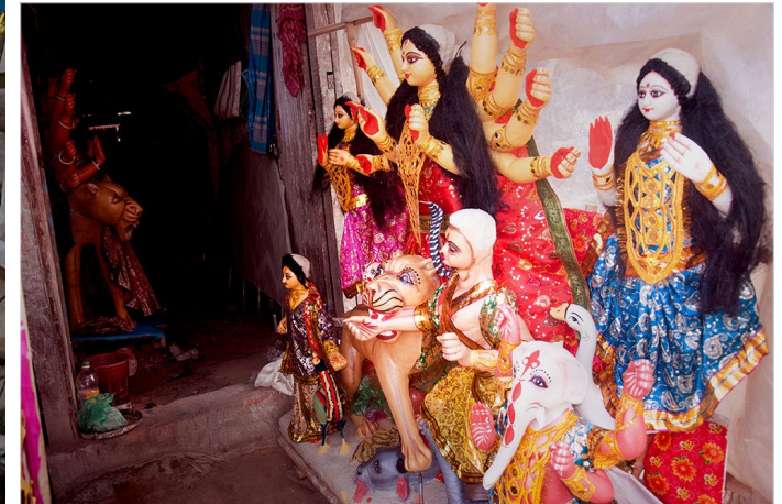
Different types of idols that are fully decorated.