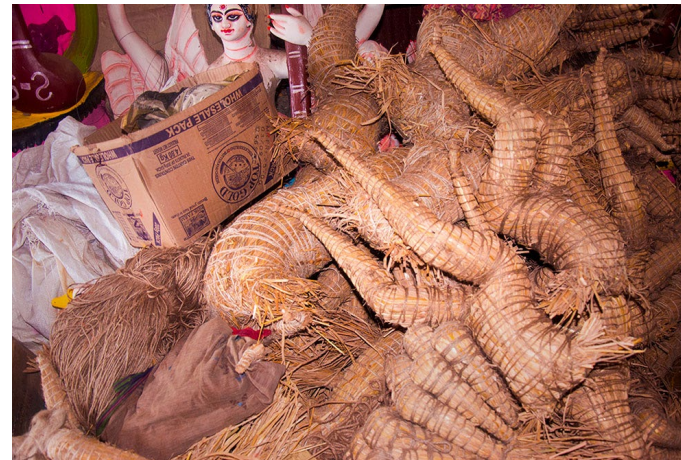
An armature of a body in different postures is kept ready.