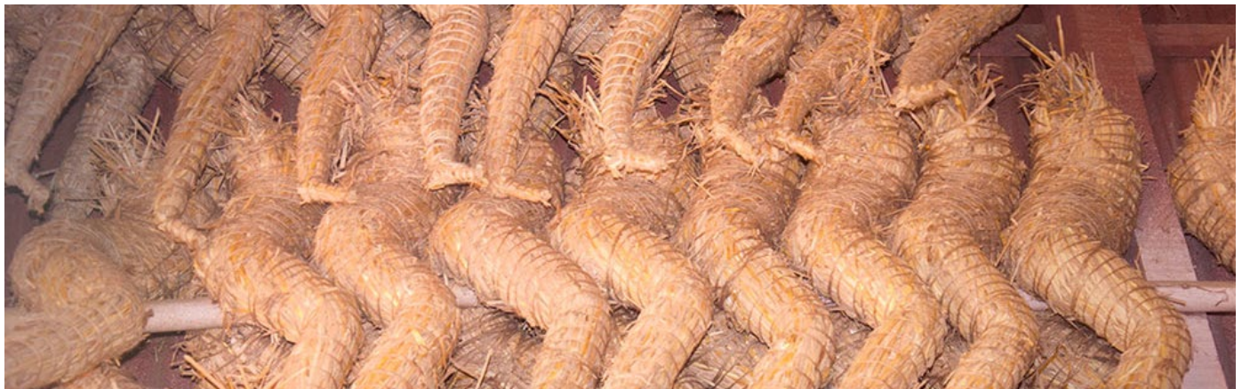
Armature of body in different postures.