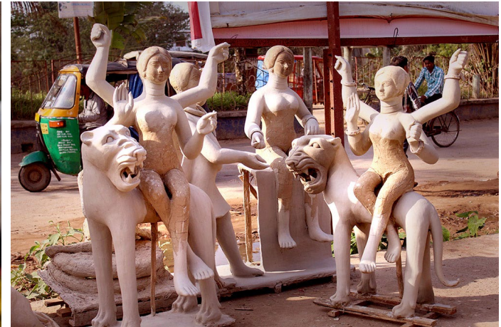
The base layer of white paint is applied to the idols and kept for the drying process.