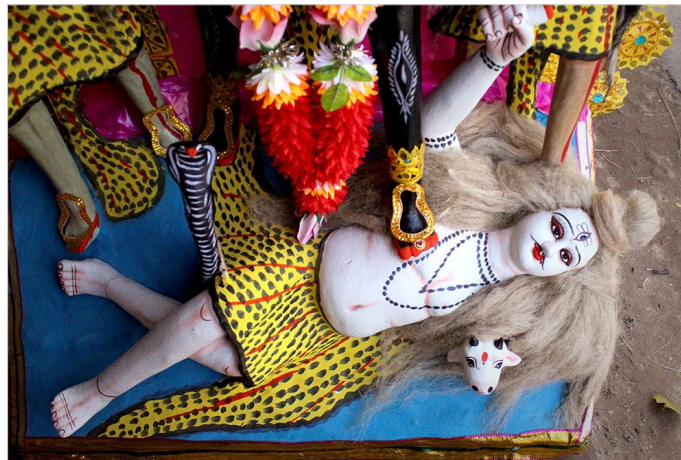
Lord Shiva's idol.