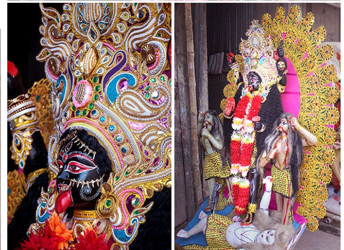
The finished Kali Mata's idol.