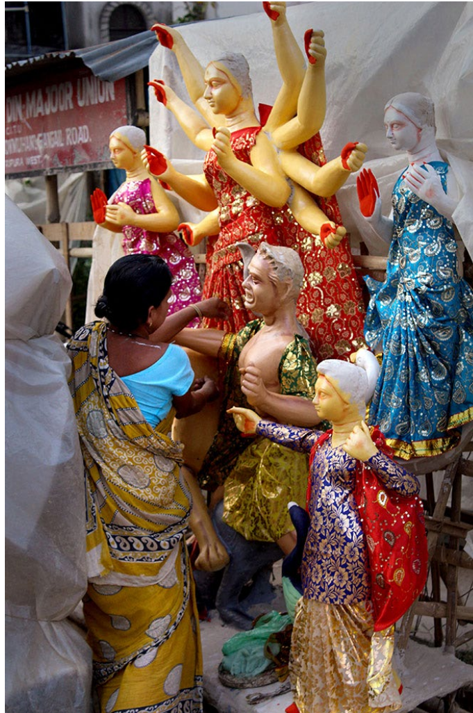
The female artist is decorating the idols with colorful saree.