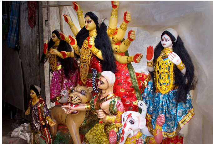
Durga Mata with other idols.