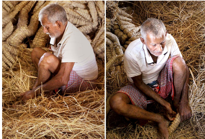
Senior craftsman making an armature.