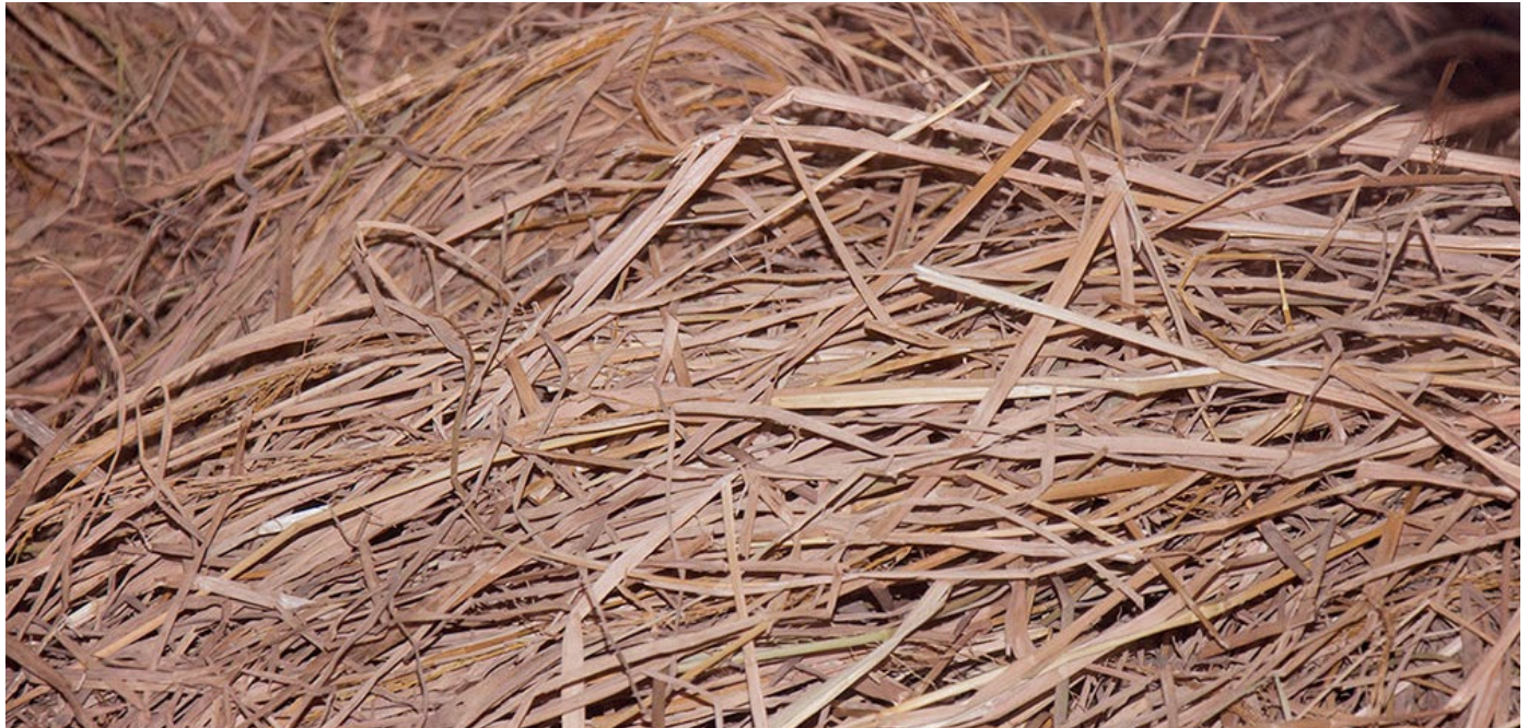
Rice grass is used for idol making process.