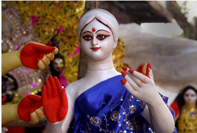
A red-paint is applied on the idol's hand.