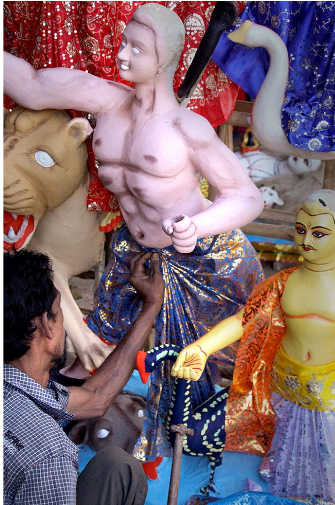
The artisan has made dhoti with a cloth and attaching it to the idol.