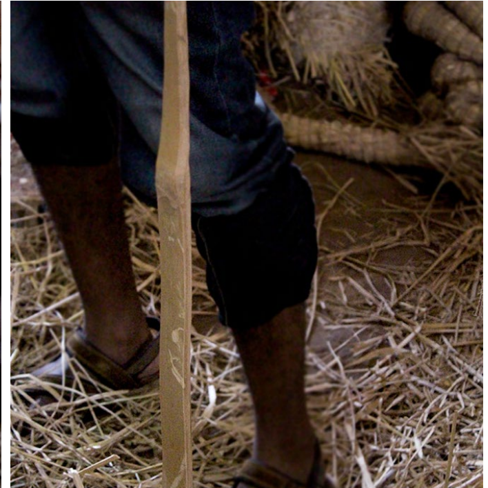
The bamboo sticks are used in armature making.