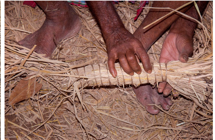
The craftsman is making the body part armature by tying rice grass.