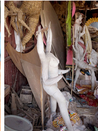
Artisan is attaching the head and hands to the idol body, and finish the smoothing process.