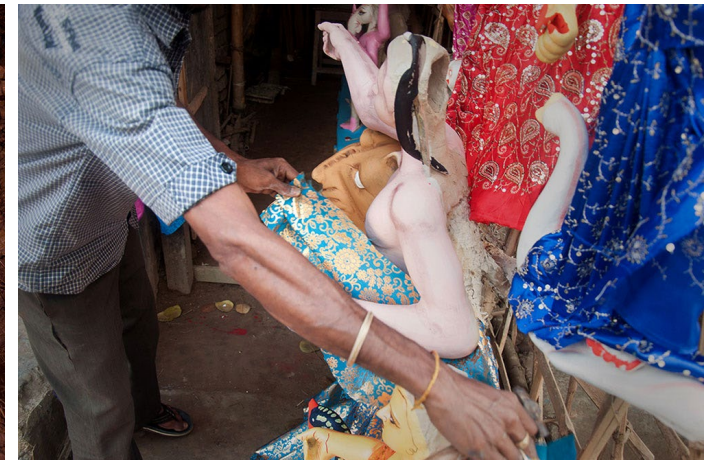
The artist measures the idol with a piece of cloth.