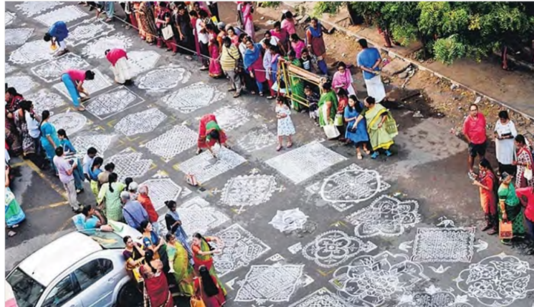
Kolam contest, part of Mylapore festival.

As one would guess, during this festive season, many stalls, shops, canteens selling South Indian cuisine, and many cinema and concert venues displaying cultural content emerge. It is more than just a cultural event at this point, as this is the flagship event of many Sabhas in the city. One of the other important events is the “Mylapore festival” organized every year by Sundaram Finance, an investment service provider, based in Chennai. It is held in Mylapore, the cultural hub of Chennai city. This is a full-fledged fest involving contests, stalls, concerts held in unexpected venues like parks or on the street and talks. Visiting this festival has almost become part of the Margazhi tradition for many people in the city.