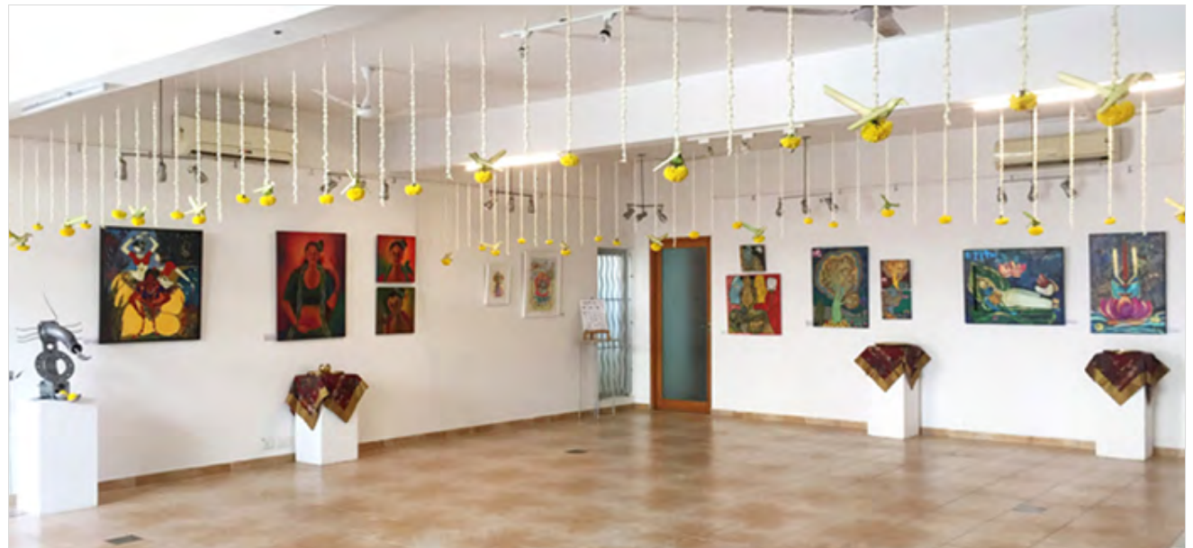
Margazhi musings - Art show savouring the art of Margazhi. (Image source)