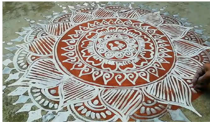
Jhoti being created.

In Odisha, this month is called Margashira, and every Thursday in this month is celebrated as a festival known as “Manabasa Gurubara”. It is believed by the people that goddess Lakshmi visits people’s homes during this month and removes all pain and negativity. The harvest of the Kharif season is worshipped as goddess Lakshmi on these Thursdays. People keep their homes very clean and invite the goddess inside. The doorstep and entrances of the home are plastered with cow-dung paste and the rest of the house is decorated with aesthetically designed motifs called “Jhoti” or “Chita” using the ground semi liquid rice paste or “pithau”.