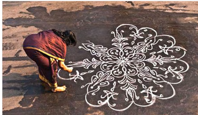
Floral kolam.

Of course, there are contemporary additions to the festival, with fests and fairs in Mylapore - the cultural hub of Chennai, music concerts of all genres, street musicians and so much more, adding to the festive spirit of Margazhi. These various events and practices are discussed in more detail in the upcoming sections.