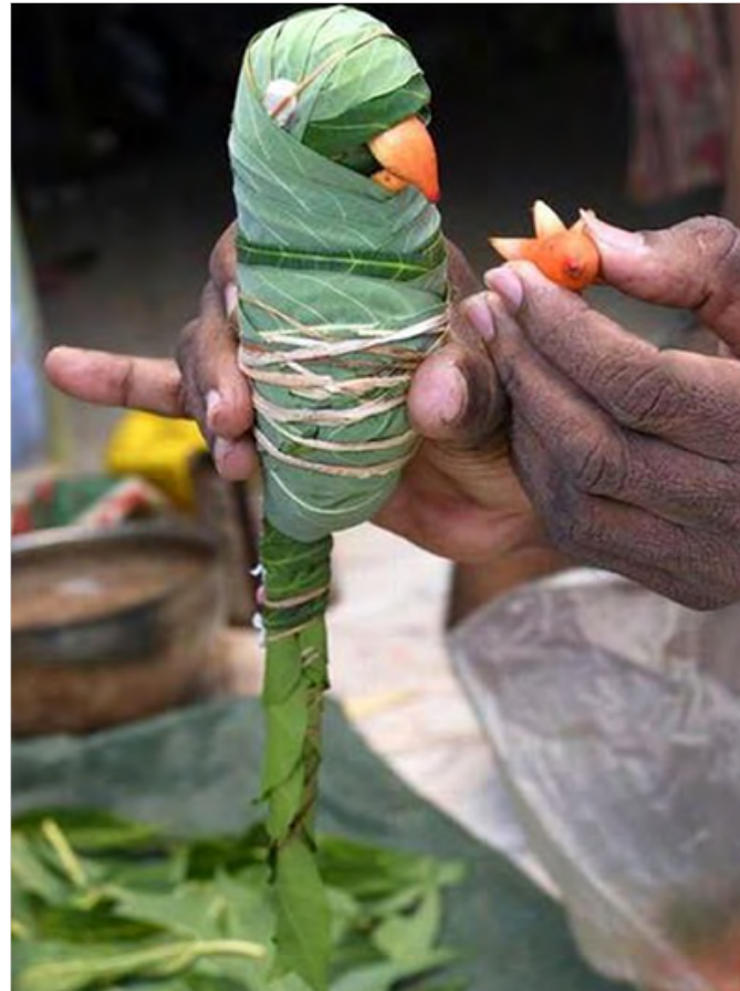
The Srivilliputtur handmade parrot.

Andal, In Her 'Nachiar Tirumozhi', talks about her parrot and it is said that her singing about the parrot may refer to her sending parrots as messengers of love to Perumal. Parrots are also said to signify messengers of love, they are considered to be the vehicle of Kamadeva, the Hindu god of human love or desire.