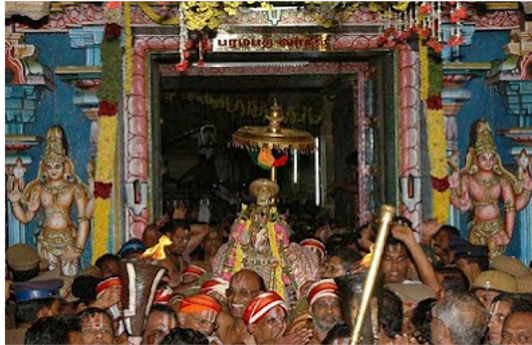
Presiding deity of Srirangam temple crossing the doorway.