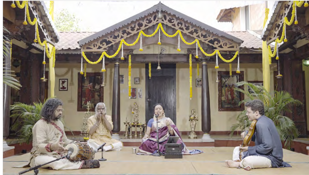
Margazhi concerts.