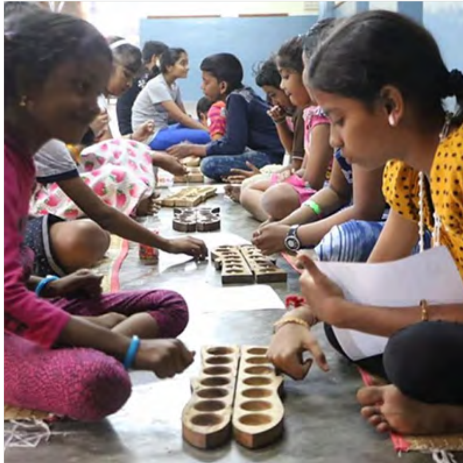
Pallankuzhi contest (traditional game), Mylapore festival.