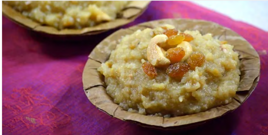
Prasadham in leaf cups.

Prasadam is given to every single person who visits the temple and it reflects the philanthropic spirit of temples, which regularly feed those in need of food. These recipes are also passed down generations and are cherished by everyone who has tasted it. The process is also sustainable as the food is never wasted, and it's served in biodegradable leaf cups, which everyone knows and loves.