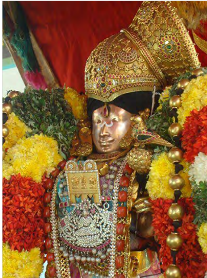
Andal idol in Srivilliputtur temple. (Image source)