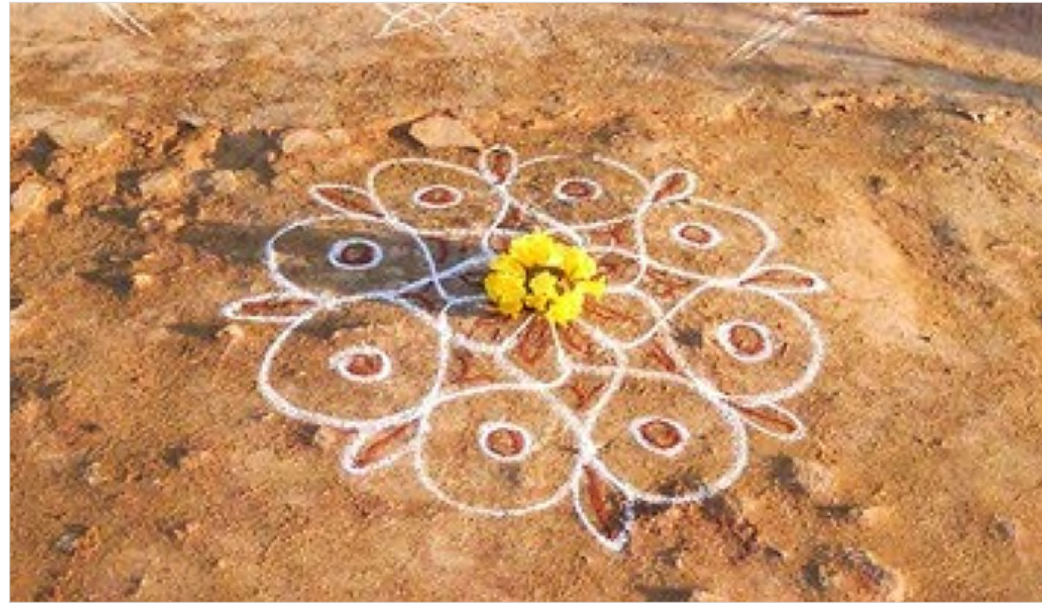
Margazhi kolam with pumpkin flower.