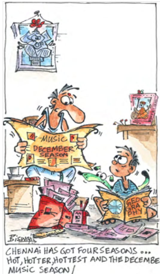
Margazhi Musings - 6 by Biswajit Balasubramanian.

People always find new ways to celebrate festivals, and the festival itself, and what it means to the people evolve over time. One thing that remains is how it brings people together and helps them connect to their roots and spiritual side. In recent times there has been a rise in folk music and dance events, which is also an effort to re-vive dying folk art forms. An example is the “Margazhiyil Makkalisai”, a festival that offers a platform for folk and street musicians and is an attempt to make Margazhi more inclusive. Art shows displaying all things “Margazhi”, mobile apps that help its users find concerts that happen around the city and a series of illustrations by Biswajit Balasubramaniam depicting people during the Margazhi season are just a few of the new additions to all the Margazhi festivities.