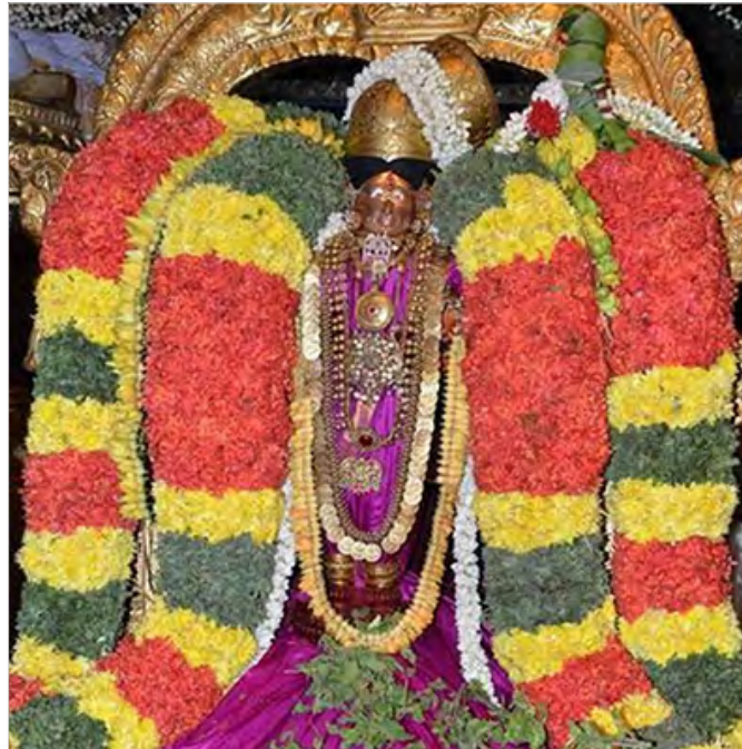
Andal’s garland “Andal Maalai”.

Andal, who was initially known as “Kodhai”, made it clear that she yearns to be married to the Lord Perumal. She eventually started making garlands as offerings to the Lord, but only after she wore them first. She continued to do this until one day, she was found out by her father Periyalvar, who forbade her from repeating this, and a new garland was immediately made. Later in the night, it is said that Perumal appeared in Periyalvar’s dream, and said that he wanted only Andal’s offerings, and that is how Andal gets her name, which literally means “the one who ruled over the lord”.