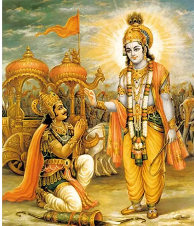
Krishna enlightening Arjuna with the Bhagwad Gita.

~Sri Krishna in Bhagavad Gita, 10.35, मासानां मागशीष हम्.