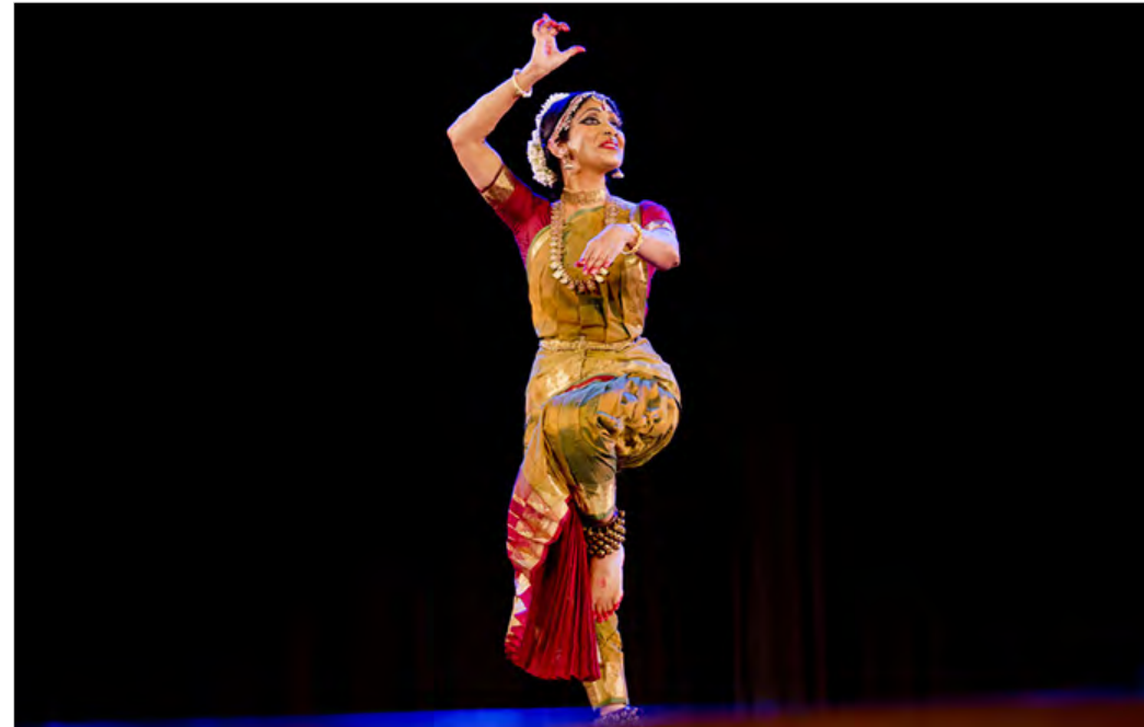
Performance at the Music Academy during the festival. (Image source)

https://www.dsource.in/resource/margazhi-festival-tamilnadu/events-during-margazhi-season