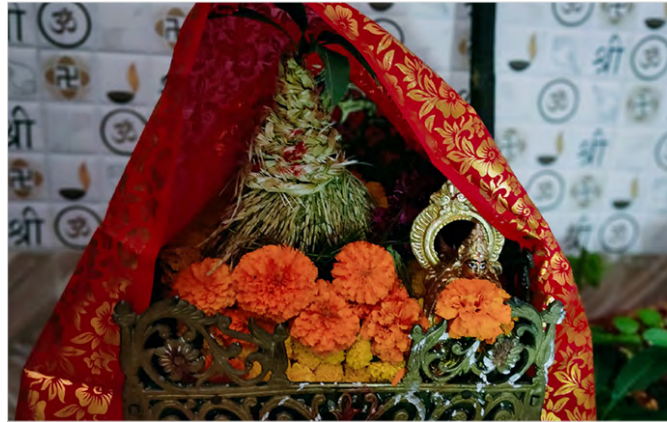
Idol of Maa Lakshmi for Manabasa Gurubara.