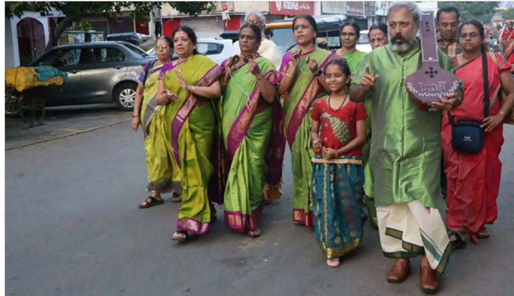
Early morning Margazhi Veedhi Bhajans. (Image source)

https://www.dsource.in/resource/margazhi-festival-tamilnadu/events-during-margazhi-season