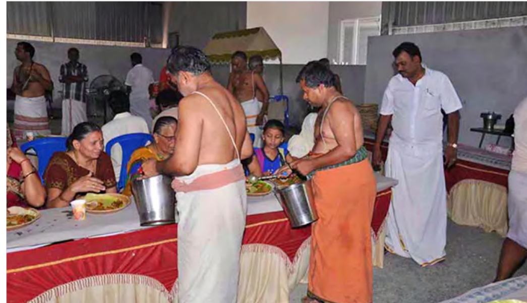
Canteen at Thyaga Brahma Gana Sabha.