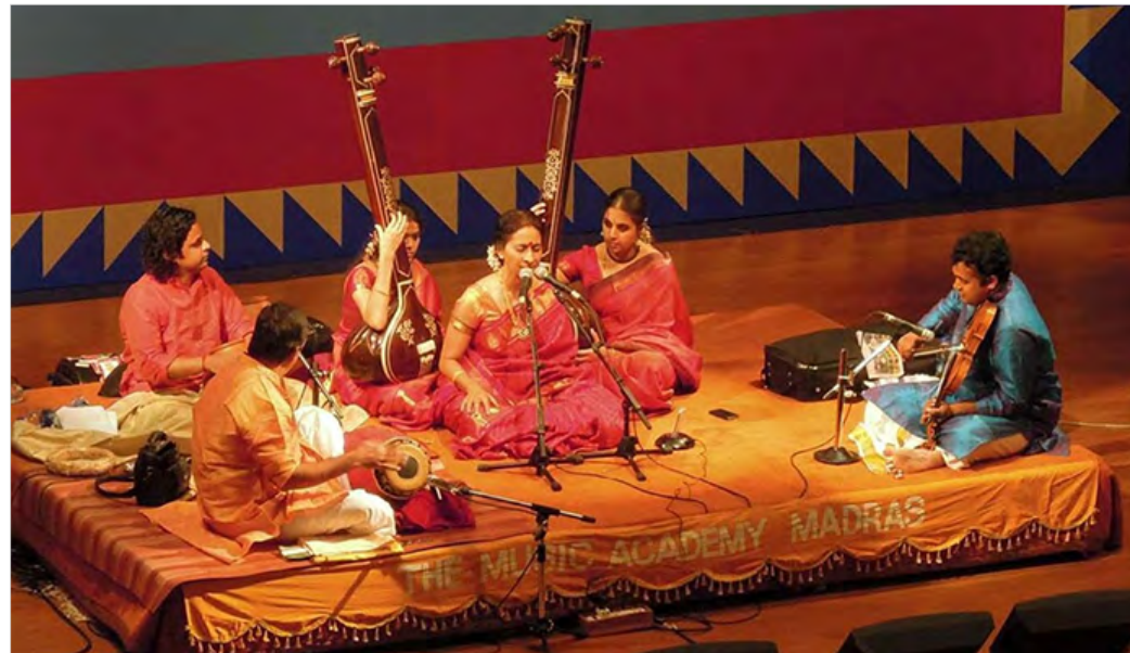
Singer Bombay Jayashri at the Music Academy during the fest.