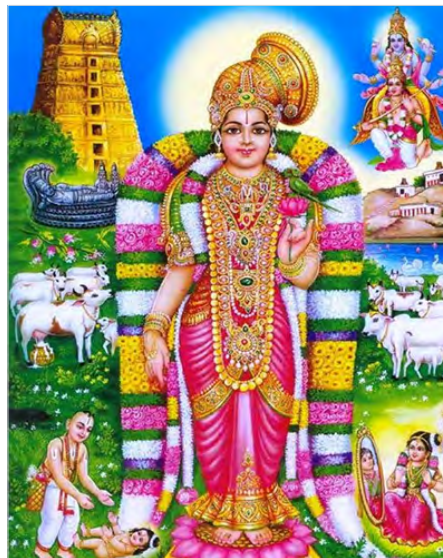
A depiction of Andal.