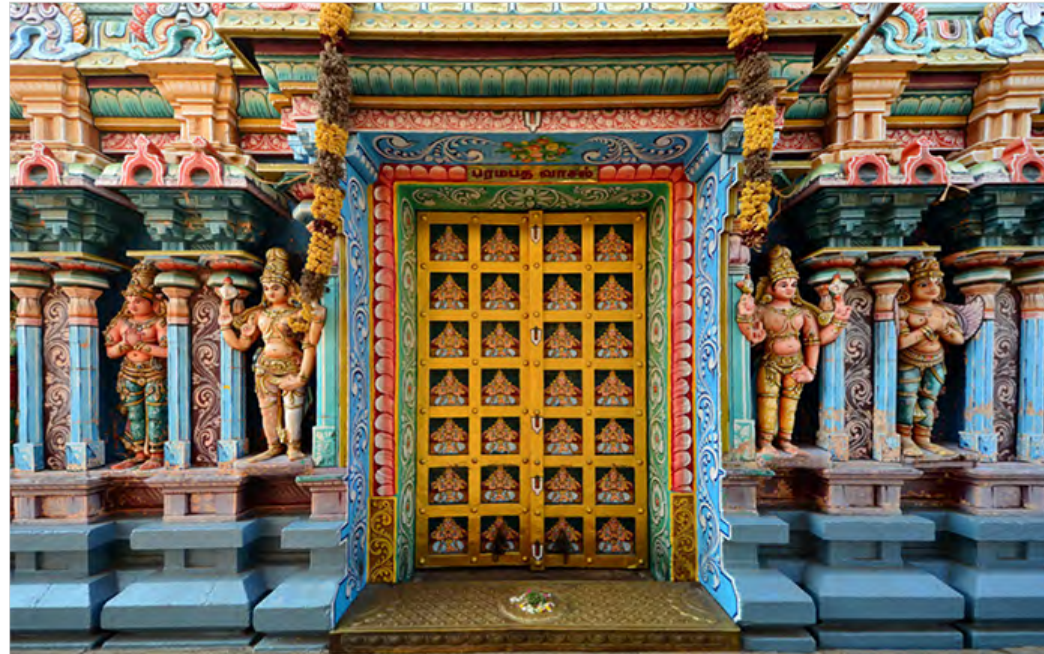
Swarga vasal at Srirangam temple - door to Vaikuntam. (Image source)

This is an important event in the Ranganathaswamy temple in Srirangam, Tamilnadu, which has a dedicated “Swarga Vasal” which is opened only once a year. People observe a fast on this day, visit temples and walk through this gate and this is considered as them entering the doors to Vaikuntam. Therefore, these opened doors are a common symbol that marks the end of the Margazhi season.