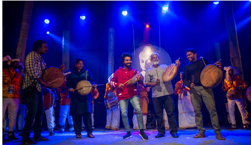
Margazhiyil Makkalisai, folk and street artist festival. (Image source)

https://www.dsource.in/resource/margazhi-festival-tamilnadu/events-during-margazhi-season