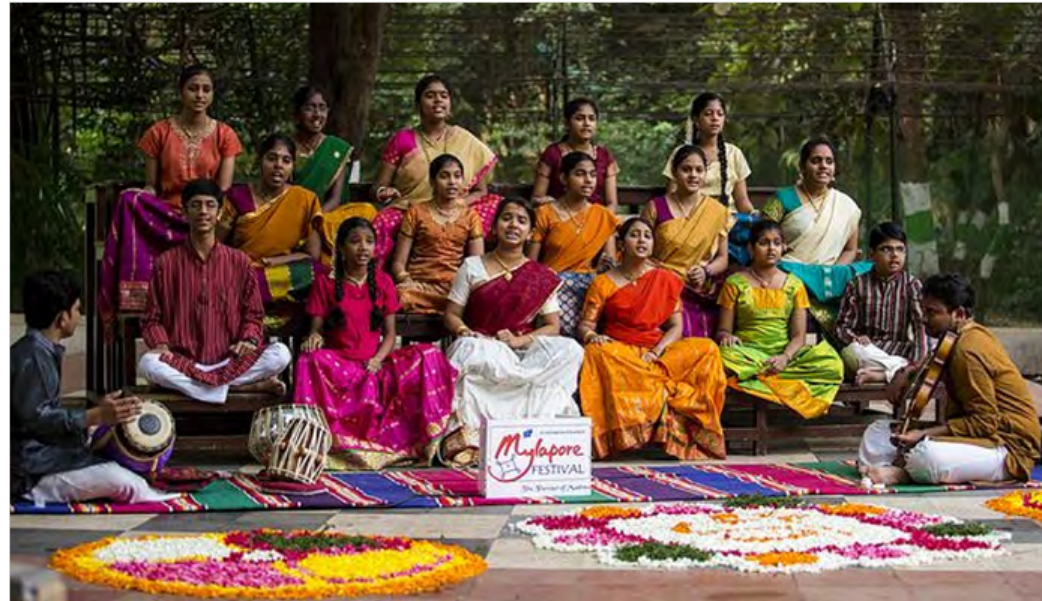
Carnatic concert in Mylapore festival.