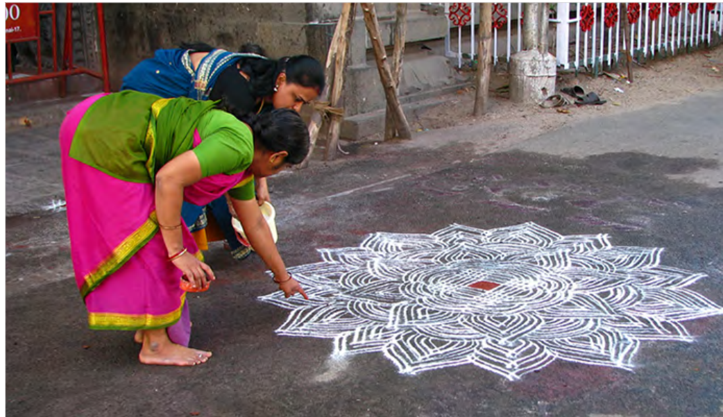
Women drawing kolam in front of the temple.

Kolam is a well-known form of decoration practised by many south Indian households. It is a decorative pattern drawn on the thresholds of homes, made with rice flour or in recent times, chalk powder.