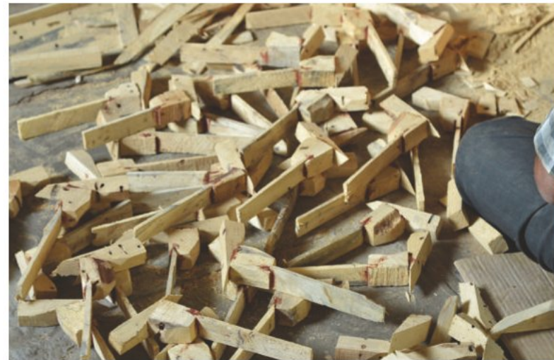
Fixing the skeleton parts