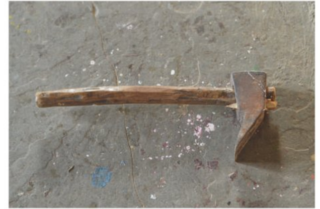
Bharsha (wood scalping)