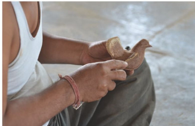
Rubbing with sandpaper