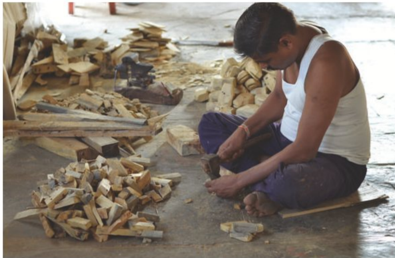
Making skeleton parts