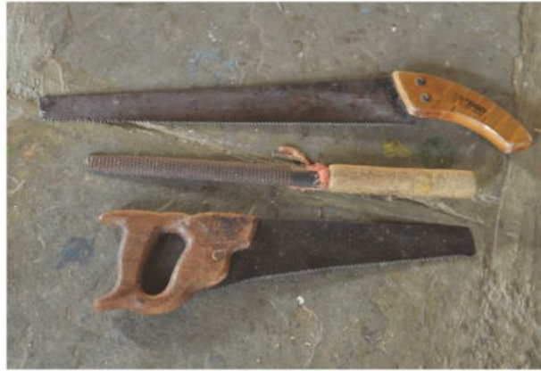
Iron files and saw