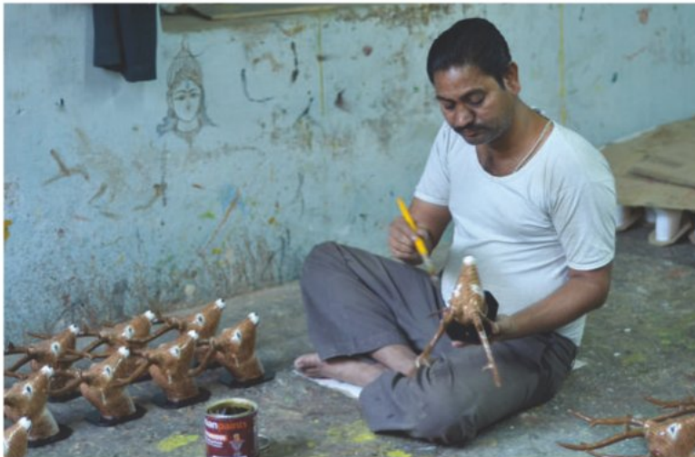
Coating the toy