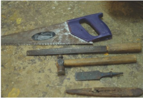
Saw and carving tools