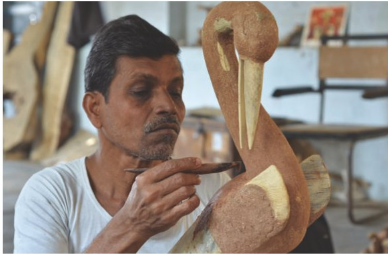
Adding chinta lappam to the skeleton