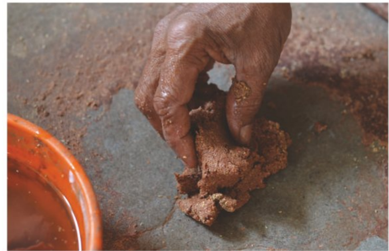
Making Chinta Lappam