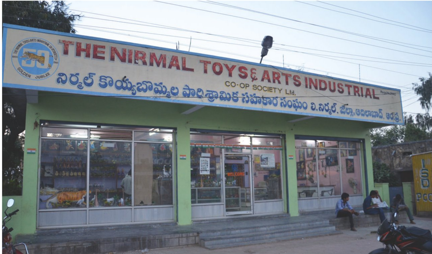
Nirmal Toys & Arts Industrial Co-operative Society Ltd,