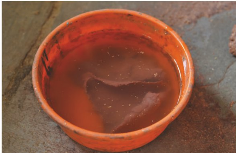
Dry Tamarind Seed Pulp with water