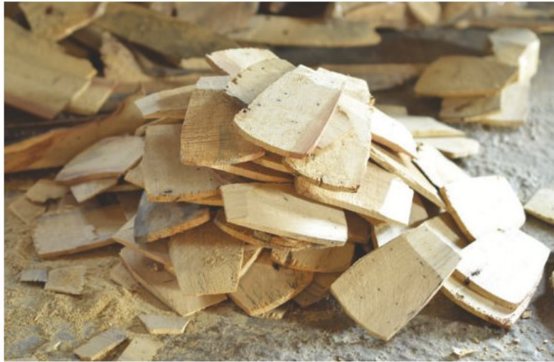
Ponki Chekka wood pieces