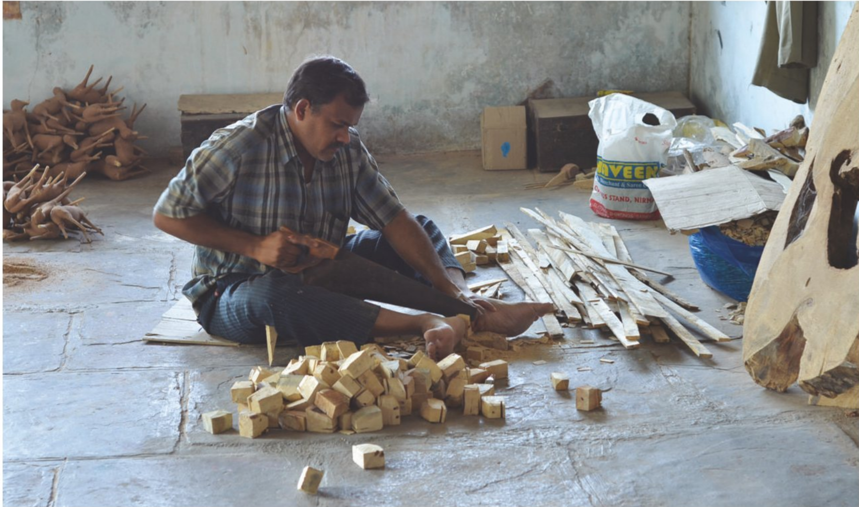
Craftsman at work