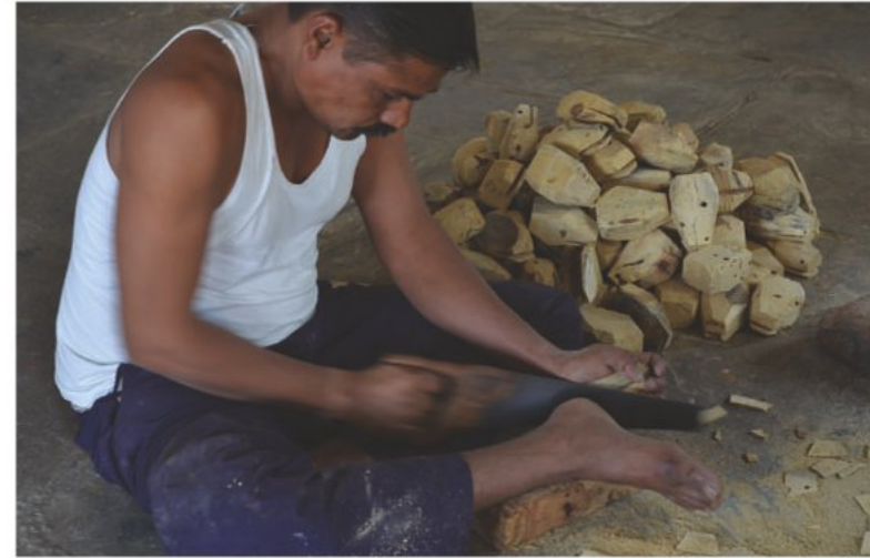
Cutting the wood in various shapes