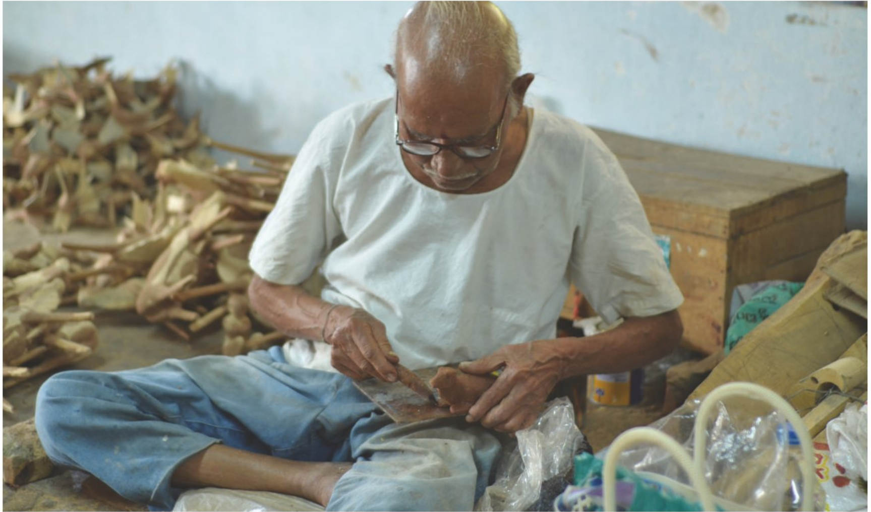
Finishing the toy