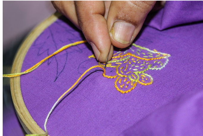
Stitching is done according to the design on the cloth.

https://dsource.in/resource/pillow-cover-embroidery-panaji-goa/making-process