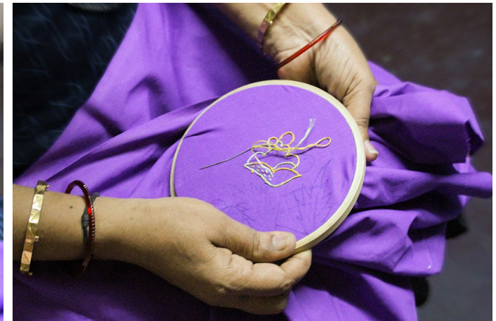
The artisan started embroidery on the pillow cover.