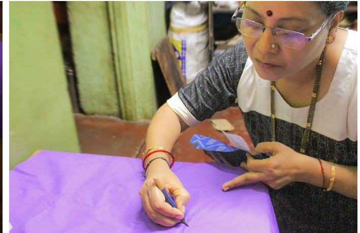
The required design is highlighting on the cloth with a dark pencil.