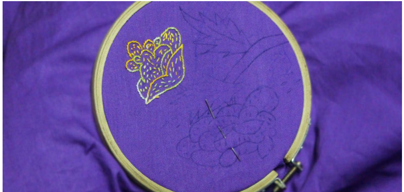
Partially completed flower embroidery design.