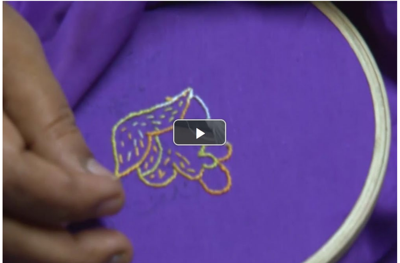
Pillow Cover Embroidery - Panaji, Goa