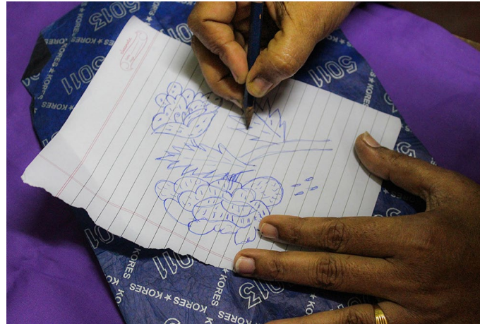
Artisan tracing design on the cloth with the help of a design template.

https://dsource.in/resource/pillow-cover-embroidery-panaji-goa/making-process