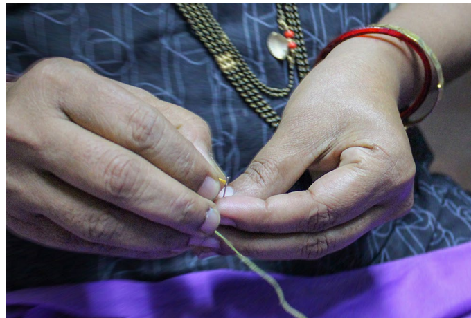
Inserting the required colour thread into the needle hole.