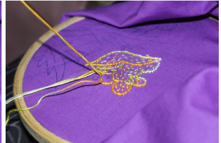
Pulling up the needle to make a stitch.