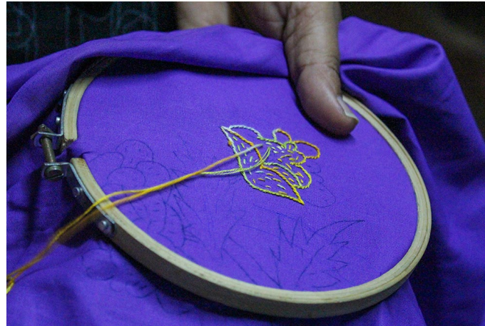
Fills the space with design by different patterns.

https://dsource.in/resource/pillow-cover-embroidery-panaji-goa/making-process