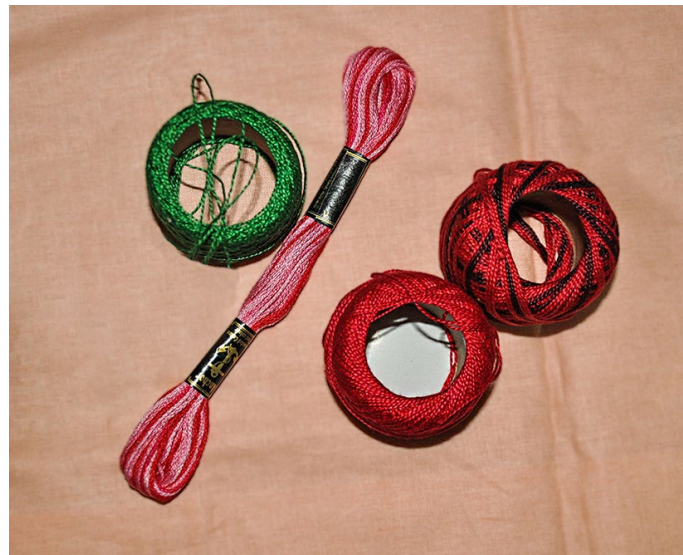
Nylon and cotton threads are used for embroidery purposes.