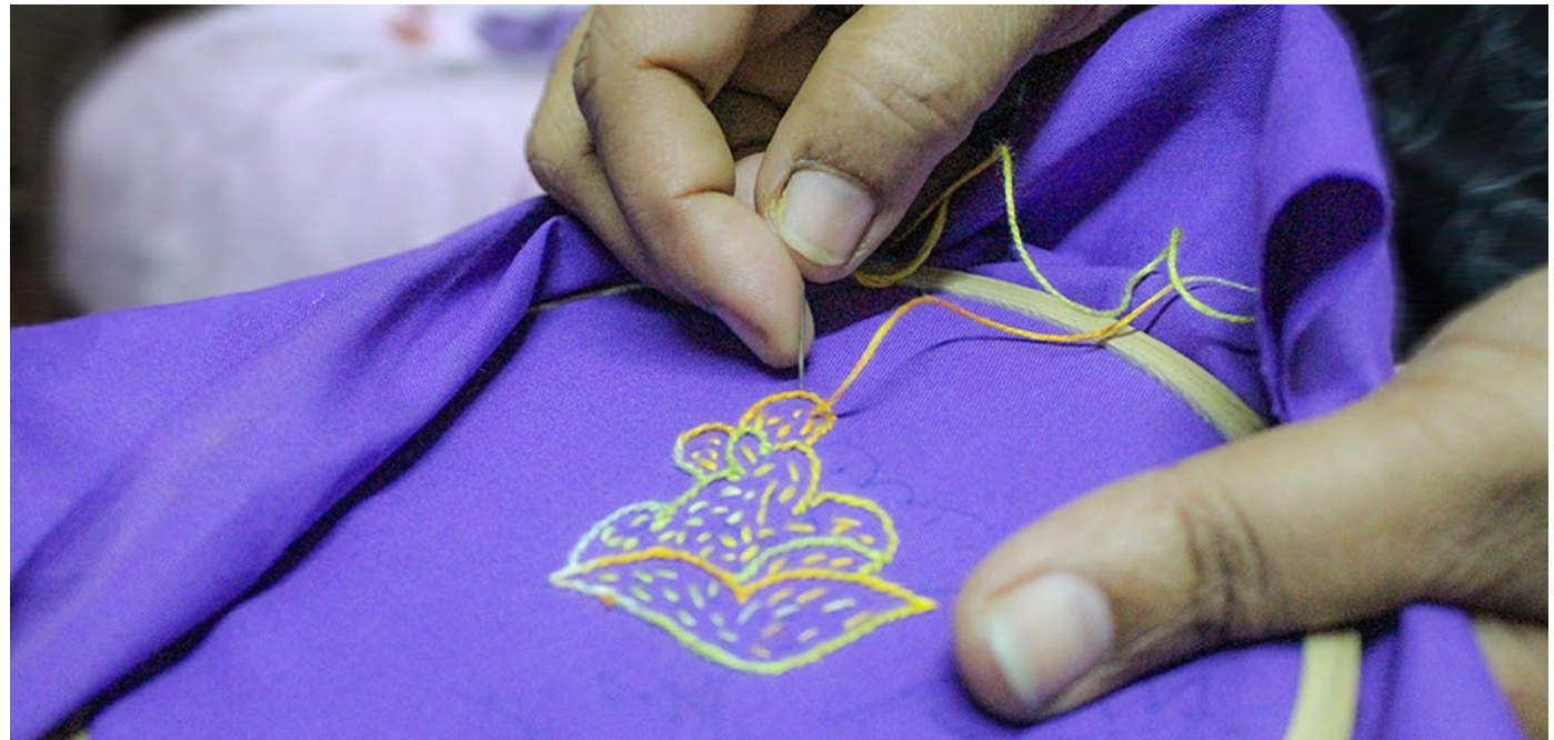
Tracing helps to define the design accurately.