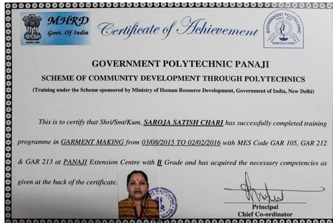
Artisan received an achievement award from the Ministry of Human Resource Development of India.