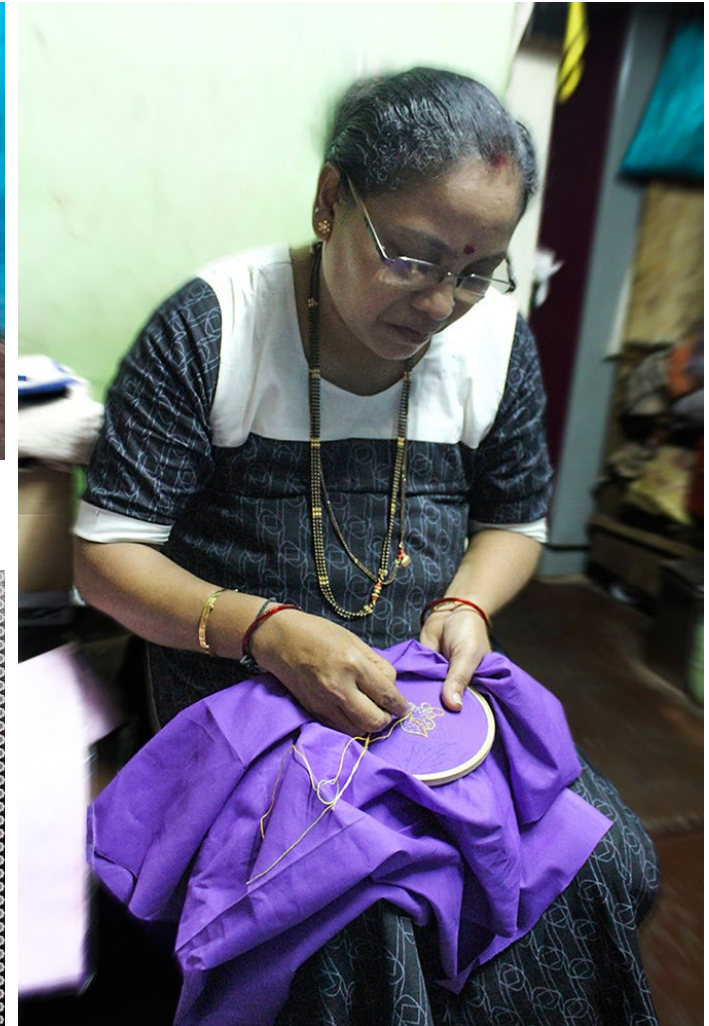
Artisan is involved in pillow cover embroidery.