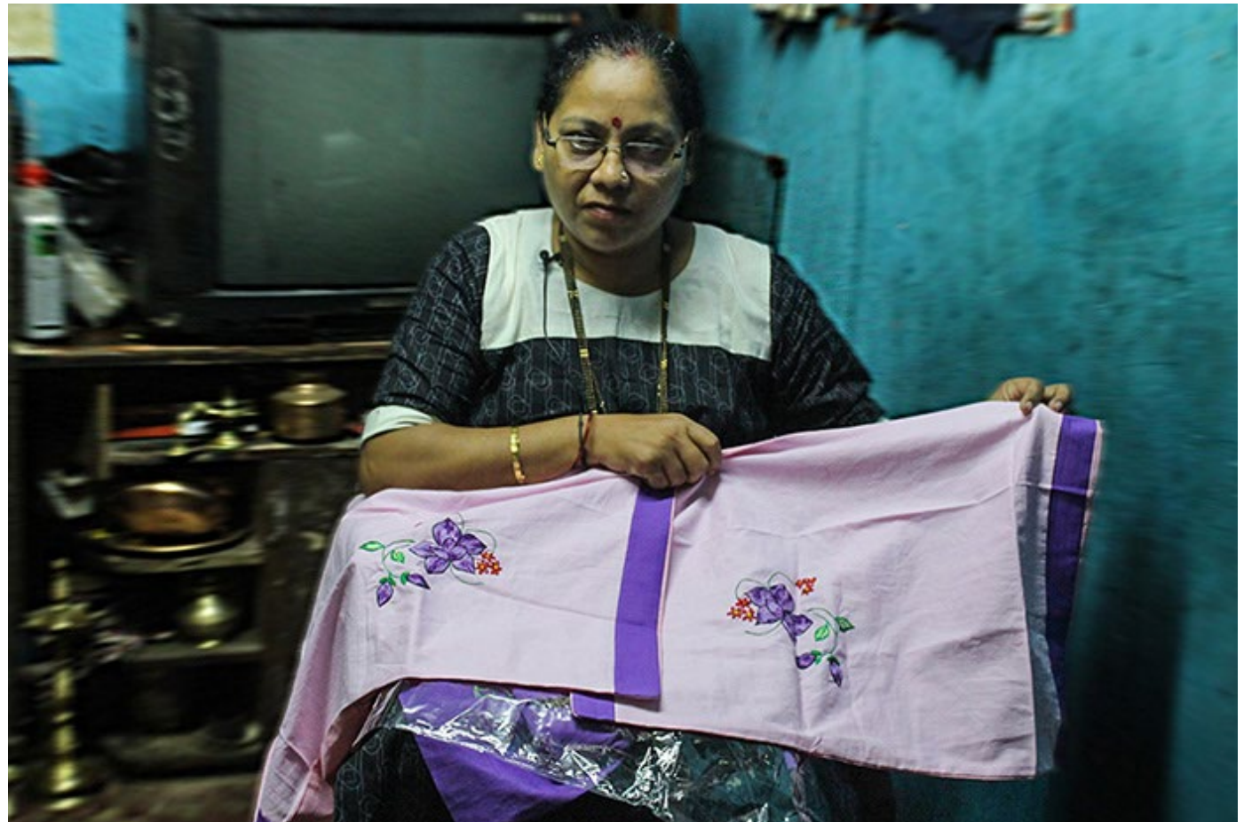
A pillow covers prettily embroidered with a floral design.

Embroidery has been used to decorate clothing and household furnishings including table linens, tray cloths, and towels. Ms. Saroja makes a variety of embroidery items such as hankies, table clothes, children and ladies garments, pillow and cushion covers, and bedspreads, etc. The price range of the product depends on the embroidery work, workmanship, and materials used.