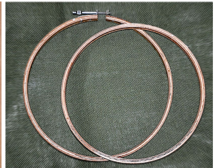
A wooden embroidery hoop is used for holding the cloth stiffly.