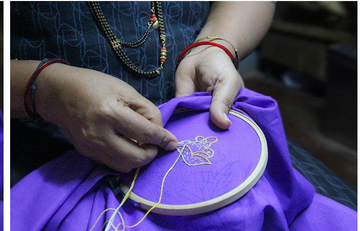
Artisan uses seed stitch type embroidery.