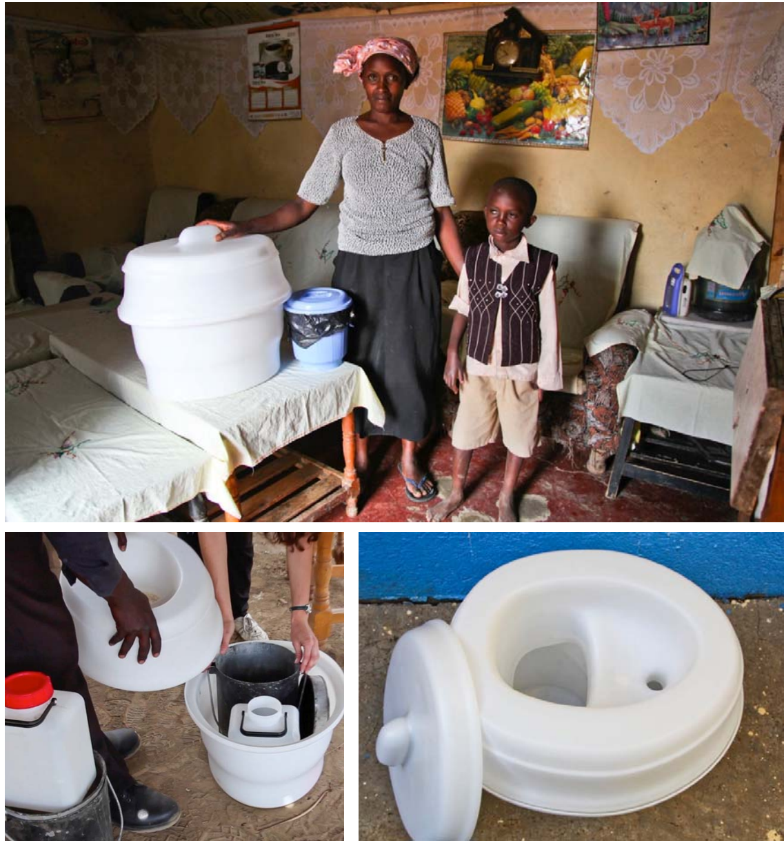
Figure 7: Family in Kenya with the MoSan toilet and separate waste bin. Figure 8: The MoSan toilet with feces bucket from metal. Figure 9: The seat design separates urine and feces into removable containers.

The sanitation service ensures collection and treatment of excreta, offers hygiene education for users and creates job opportunities. In the Kenya case study of 2013, MoSan toilet containers were collected and replaced regularly by trained stuff. The toilet containers made from metal were placed on the Sanivation solar concentrator. After 6 hours, potential pathogens in excreta are deactivated by heat, and the feces are ready for recycling. The "Lake Naivasha Environmental Disabled Group" used wooden tools to mix feces with other waste products like sawdust, charcoal dust, organic waste or paper. The mix was pressed manually and dried in the sun for 4 days. Our analysis in 2014 showed that