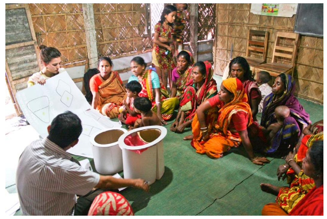
Figure 6: Design workshop with women in Mymensingh Bangladesh, 2011.

Many slum residents expressed their interest in a household toilet. This would allow them to avoid going out at night, share their toilet among fewer people, and, as a consequence, be more hygienic. The toilet should be easy to clean and visually aesthetic. Houses are small and space is limited, so a toilet needs to fit in the living environment. The strongest interest for private household sanitation came from those who spend most of their time at or near home: women, children, elderly, and disabled people.