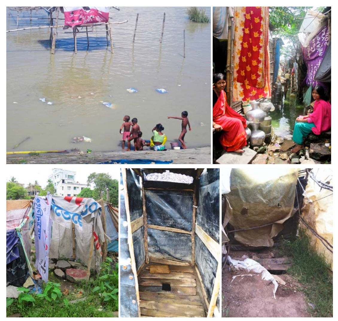
Figure 1: Lack of sanitation solutions contaminates water sources. Mymensingh in Bangladesh 2010. Figure 2: People in a flooded urban slum in Dhaka, Bangladesh 2011. Figure 3 / Figure 4 / Figure 5: Improvised toilets in Bangladesh and Kenya.

most and become victims of rape and violence when looking for a place to relieve themselves. 40% of the families who attended our pilot study in Kenya in 2013 reported that their daughters dropped out of school when they reached menstruation age. Schools either have no toilets or very unhygienic toilet facilities. By interviewing urban slum residents in in Bangladesh in 2011, I learned that it is a taboo for women to use public toilets and share them with men. Women explained that they limit their eating and drink habits during the day and wait until it is dark to find a private place outside. Children fear the risk of falling into conventional pit latrines and therefore prefer to practice open defecation —defecation on the ground or on the sides of open water bodies. This fear is so common that it is even represented in the movie "Slumdog Millioniare". It depicts a scene where a young boy falls into a latrine and is covered in fecal sludge. Watchers may think this is far fetched, but it is in fact a real threat to children in Indian slums.