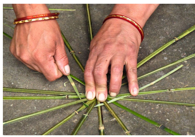
Weft strip is weaved in zigzag pattern.