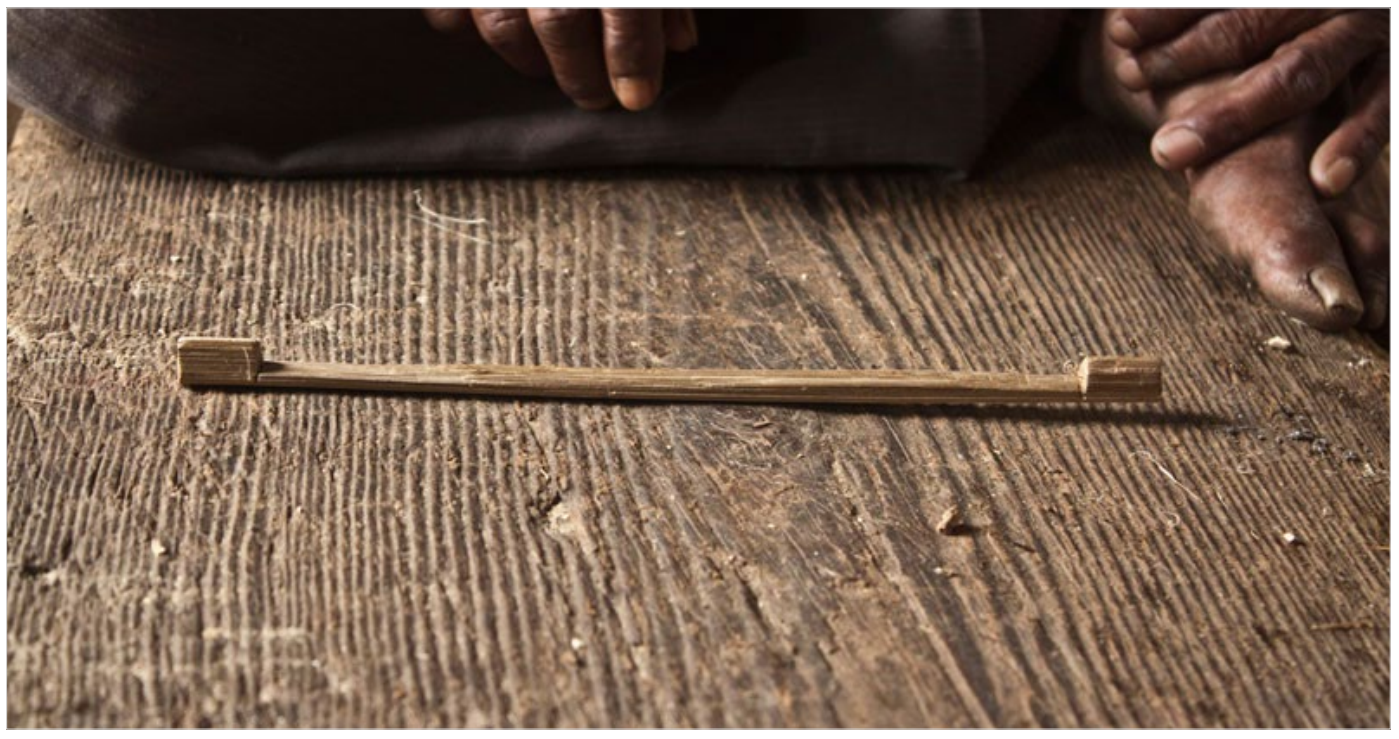
Bamboo stick is shaped to form the front part of the winnow.

Winnow weaving process is done by arranging the bamboo strips in a criss-cross manner with the help of a small bamboo stick. Once the weaving is completed, the extra edges are cut and removed. A small tender stick is tied on the edge of the winnow to give reinforcement.