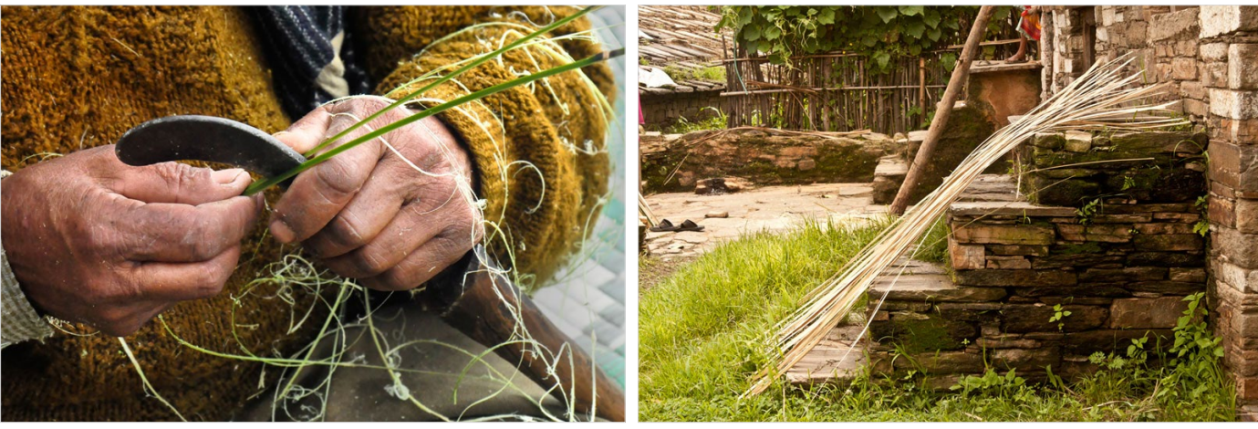
The bamboo is cut into thin strips and the outer layer of The splits are dried naturally. the bamboo is peeled using a sharp knife.