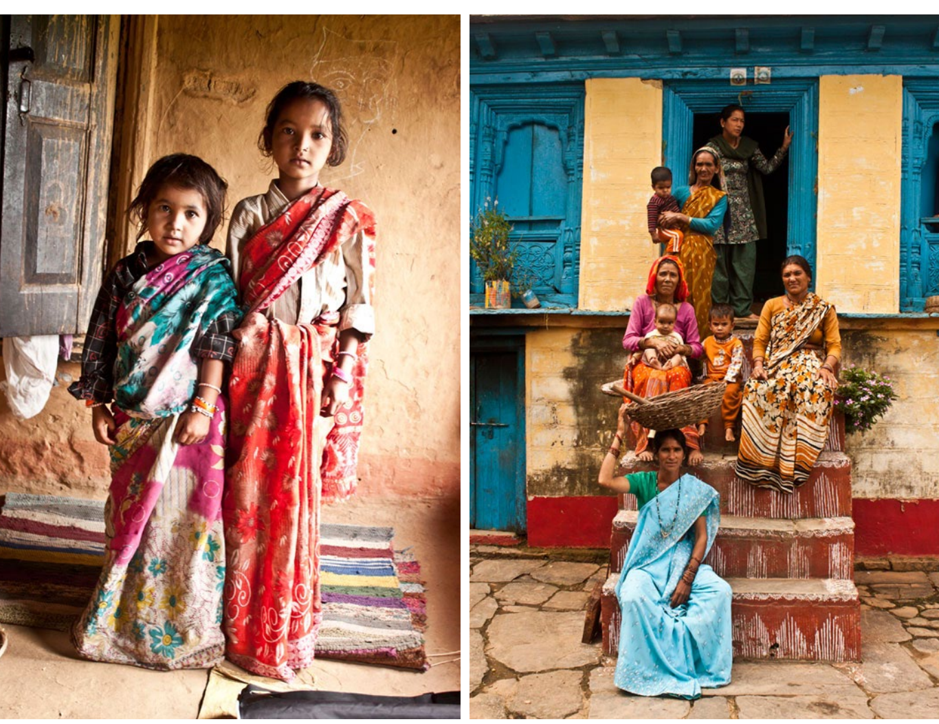
Village children dressed in sari.

Introduction Tools and Raw Materials Making Process Products People-Place-Lifestyle References