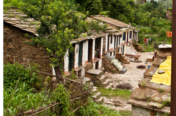
The living premises of typical farmer community in Dhamas village of Uttarakhand.