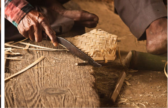
The extra part of supported stick is being cut.