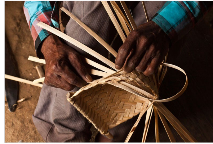
Interlocking the top edge.