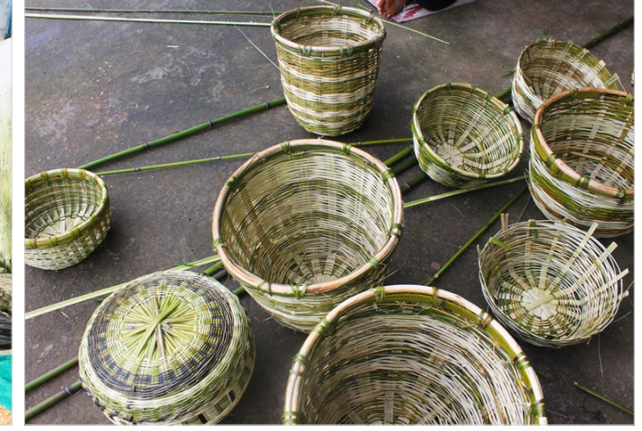
Thick cane poles are used to lock the borders of products for durability of products.