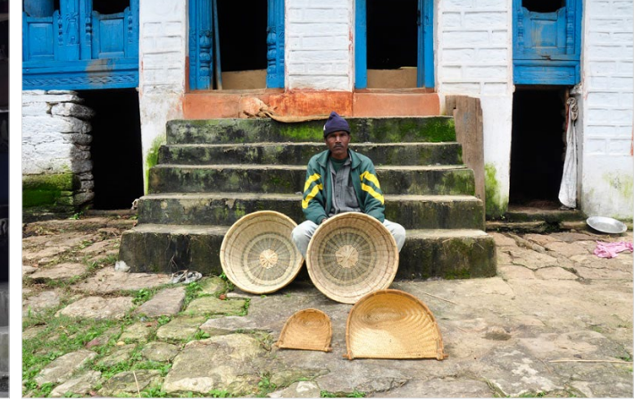
Artisan with his finished products.