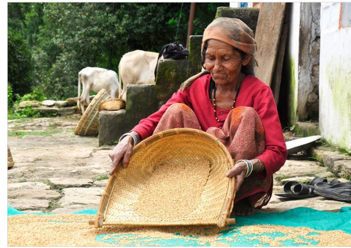
Winnow is used in daily life for winnowing purposes.

List of Traditional products: Tokri – Grain measures Doka – Large Baskets Dalia – Shallow Baskets Puthuka – Grain Baskets Dvak – Double-walled Baskets Suppa – Winnows Jhoola – Cradles