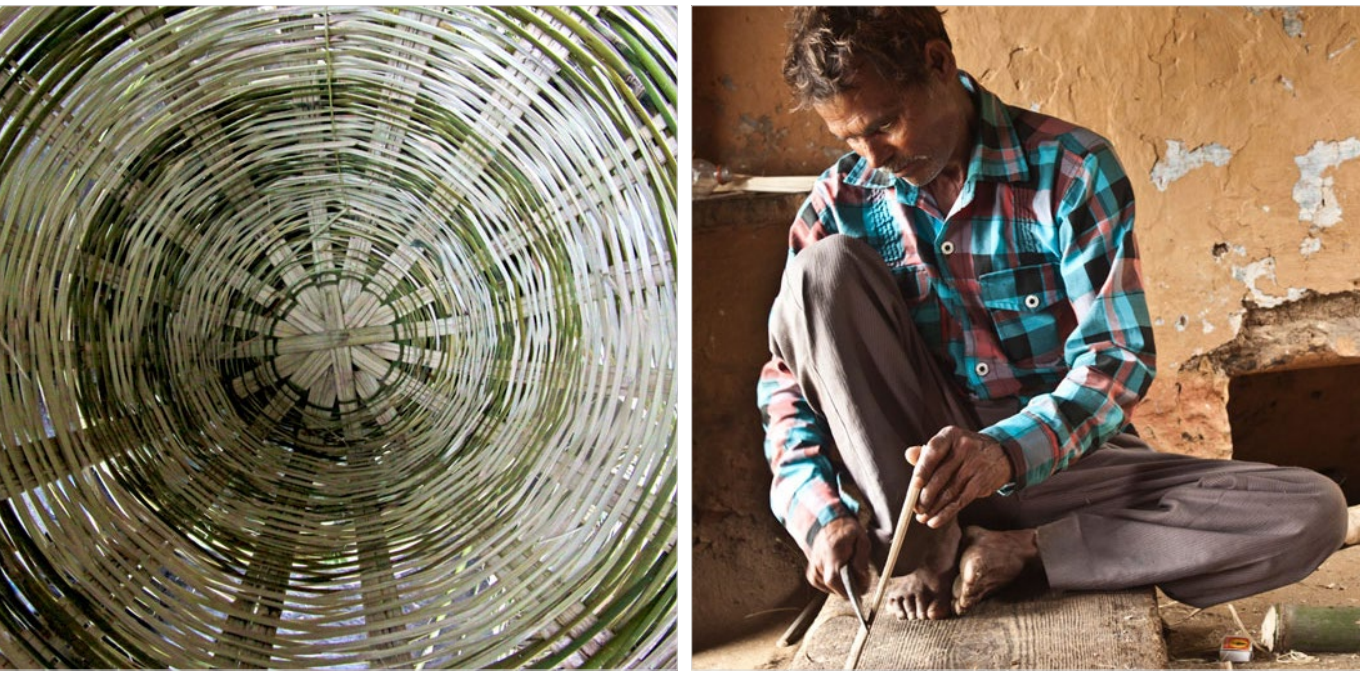
Eight main strips hold the structure of the basket placed in a circular manner.