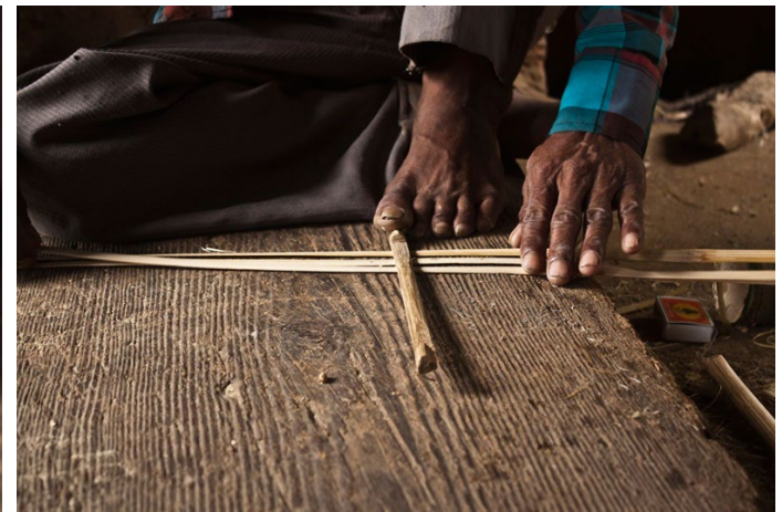
Arranging bamboo splits to start weaving.