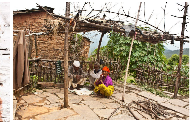
Senior citizens of the village relaxing in courtyard.