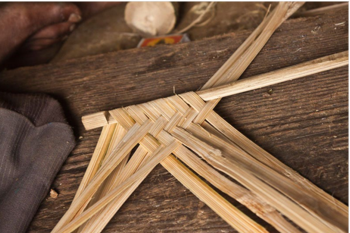
The splits are reversed from the front stick and interwoven in the main body.