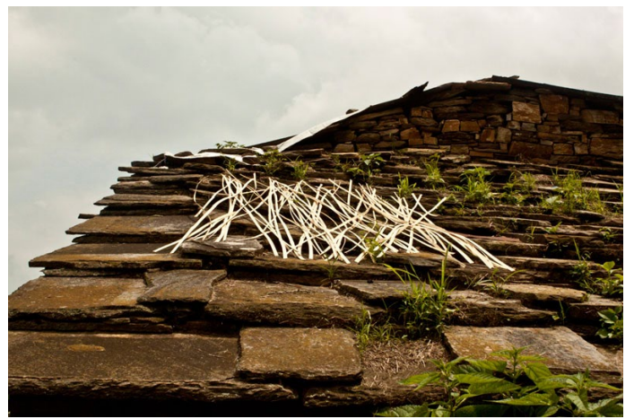
Bamboo strips are dried on the top of the stone roof house.