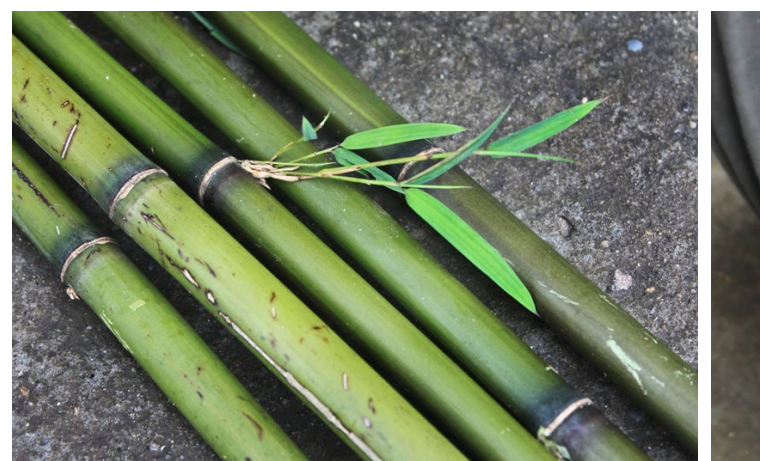
Tender bamboo poles are brought form forest to make Whole bamboo pole is being cut by cutter. bamboo products.