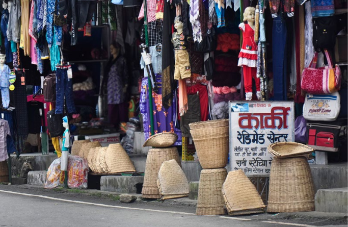
Traditional bamboo products have made their own significance in modern market.