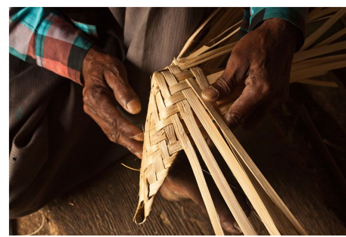
Extra long edges are twisted and turned to interweave.