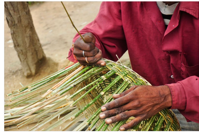
For big baskets, thick bamboo strips are used for toughness.