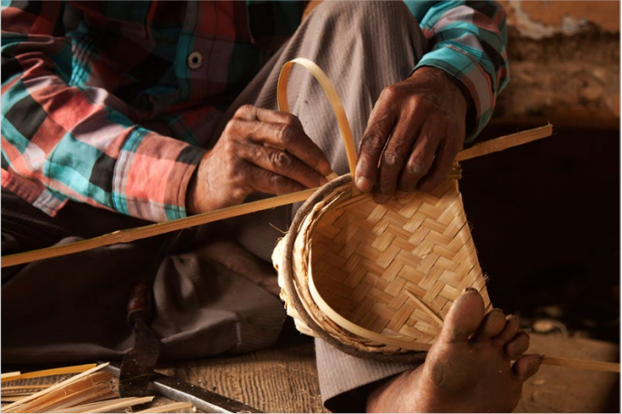
Artisan takes leg support to edge finish the product.