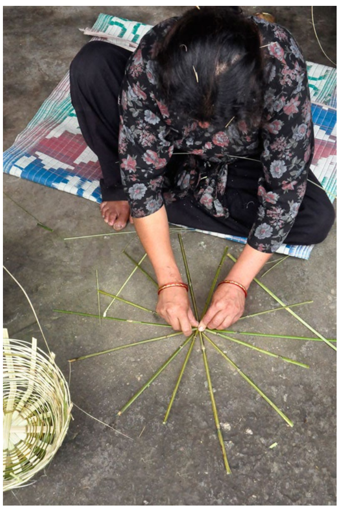
Bamboo strips are arranged to make the base.