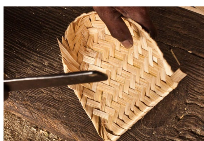
Extra edges are removed after weaving.