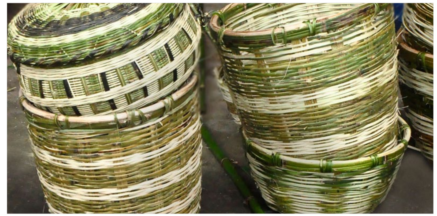
Bamboo baskets of different sizes and shapes.