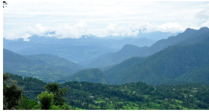
Natural beauty of Uttarakhand.

Uttarakhand has bamboo cottage industries based in Pithoragarh, Chamoli, Uttarkashi, Almora and Nainital and in other rural pockets where clusters of bamboo grow.