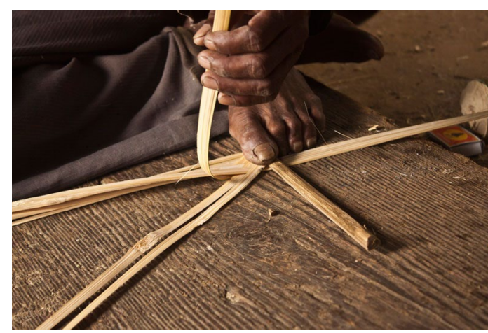
The splits are interwoven in a Zig-Zag manner.