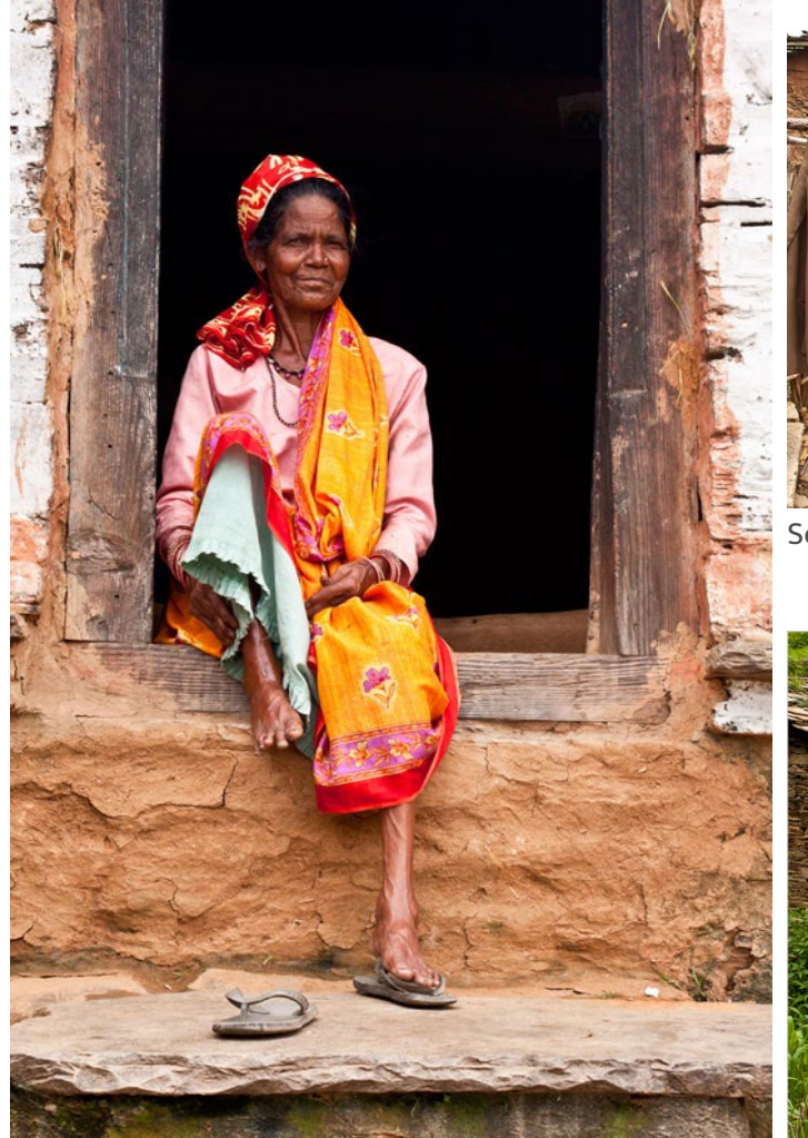
Woman in her leisure time.

Introduction Tools and Raw Materials Making Process Products People-Place-Lifestyle References