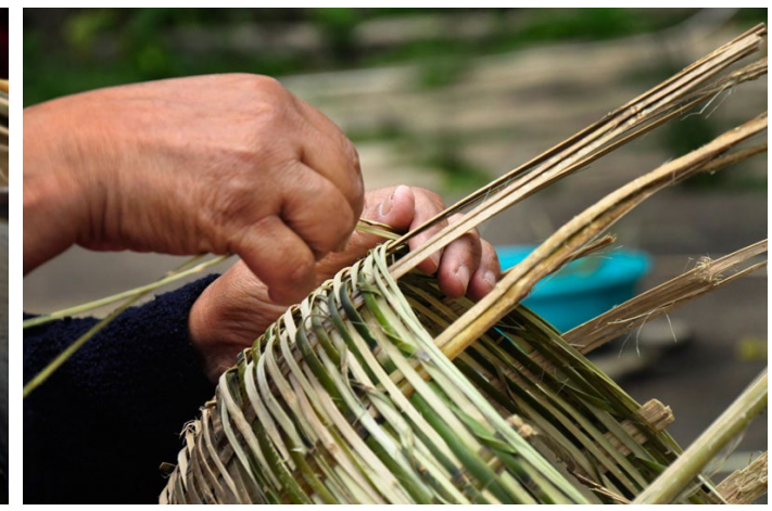
Thick bamboo stick is used for the border and interlocked with bamboo strips.