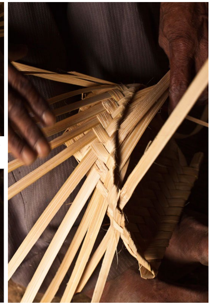
Final adjustments are made to tighten the formed weave.