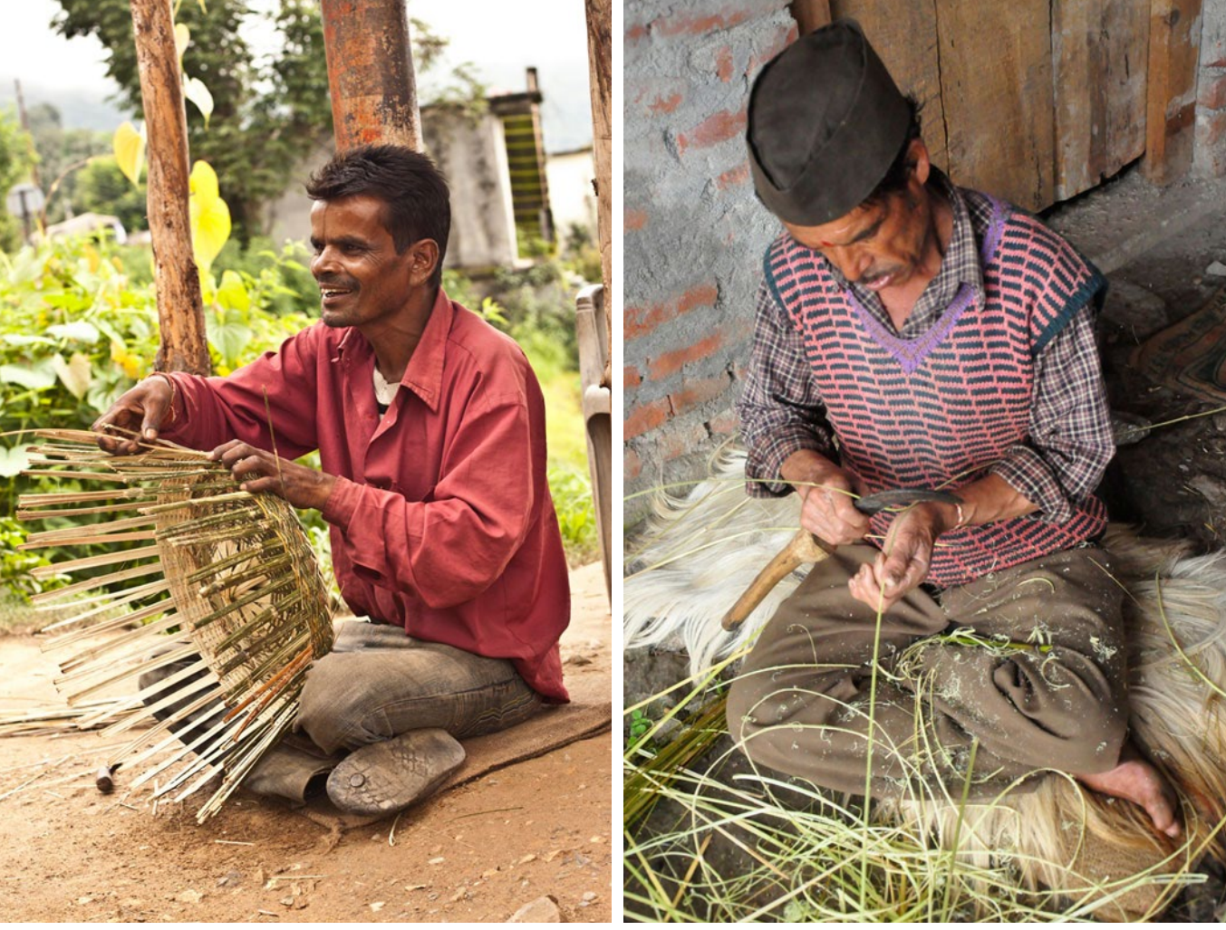
Bamboo artisan at work.

Introduction Tools and Raw Materials Making Process Products People-Place-Lifestyle References Contact Details