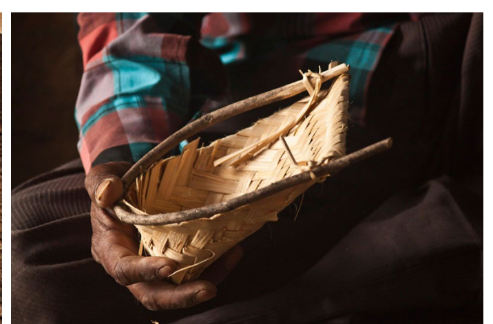
Tender wooden twig is fixed at the top for reinforcement.