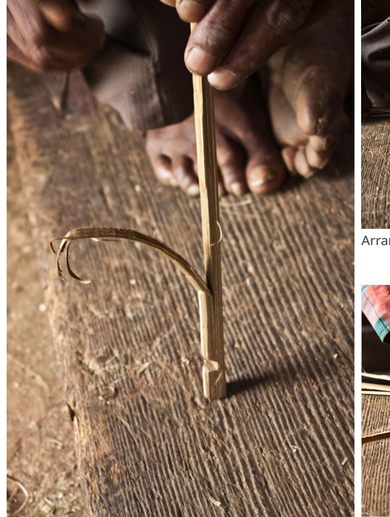
Small bamboo stick is used as a base support to make winnow.