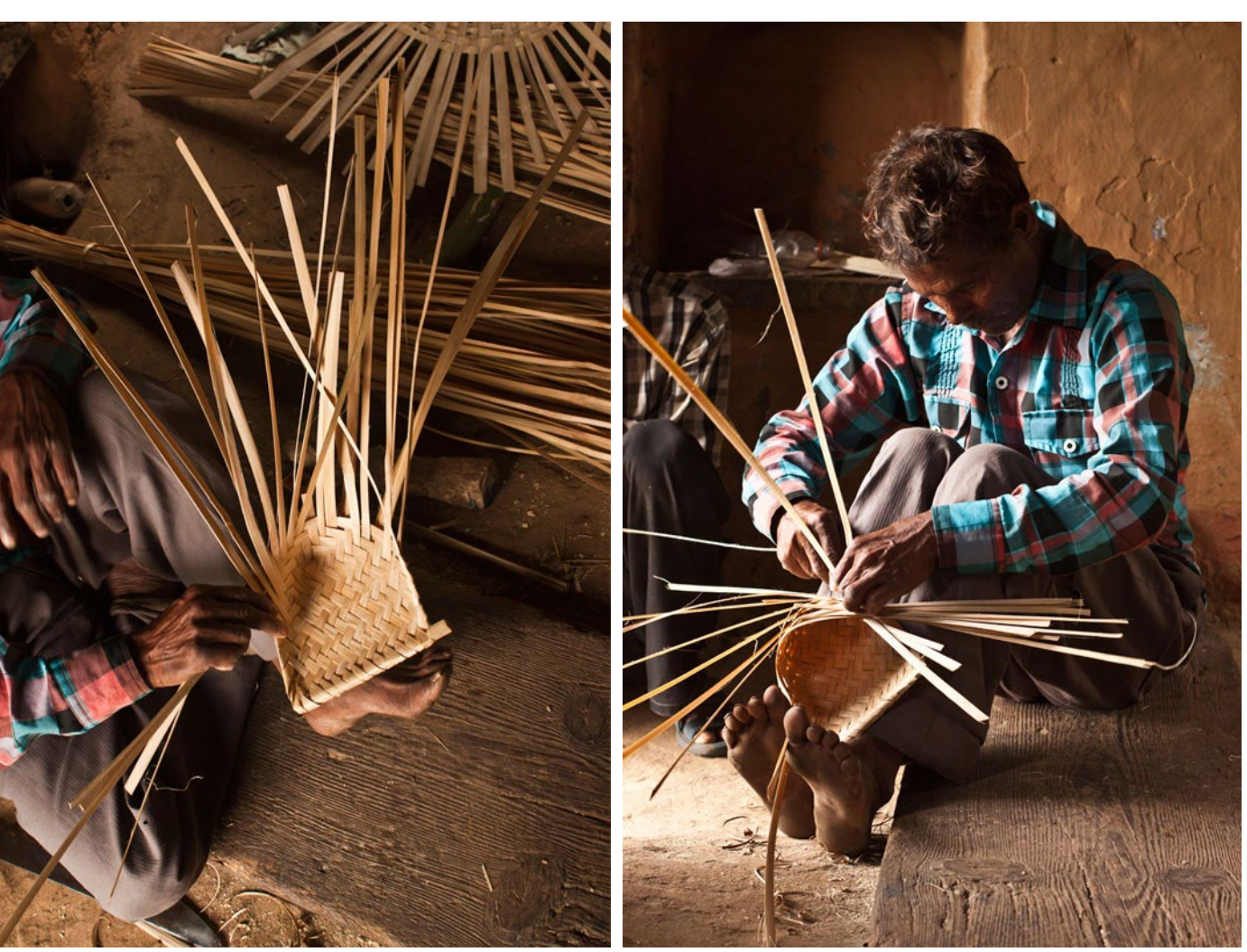
The side wall of winnow is being woven.