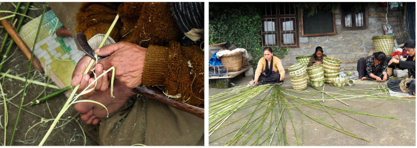
The bamboo is cut into thin strips and fiber is peeled to Women artisans engaged in selecting good quality of get smoother surface.

The finished baskets are mainly used for storing grains and supplements and carrying purposes. Some baskets are ornamented with plain weaves. Ringal Bamboo products are tough and durable. They are made with attractive Lattice designs. Other utilities and decorative items include fruit and vegetable baskets, pens, stands, flower vases, vessels and tea trays.