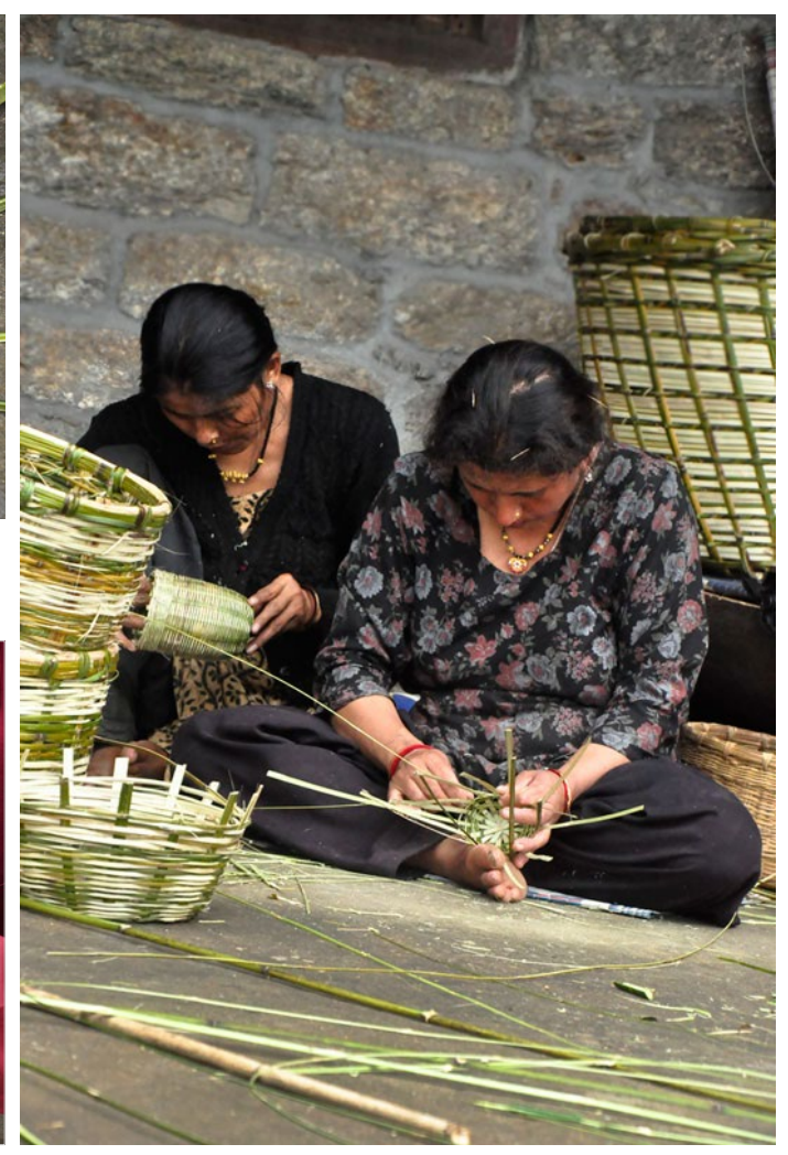
Women are mostly involved in this craft.