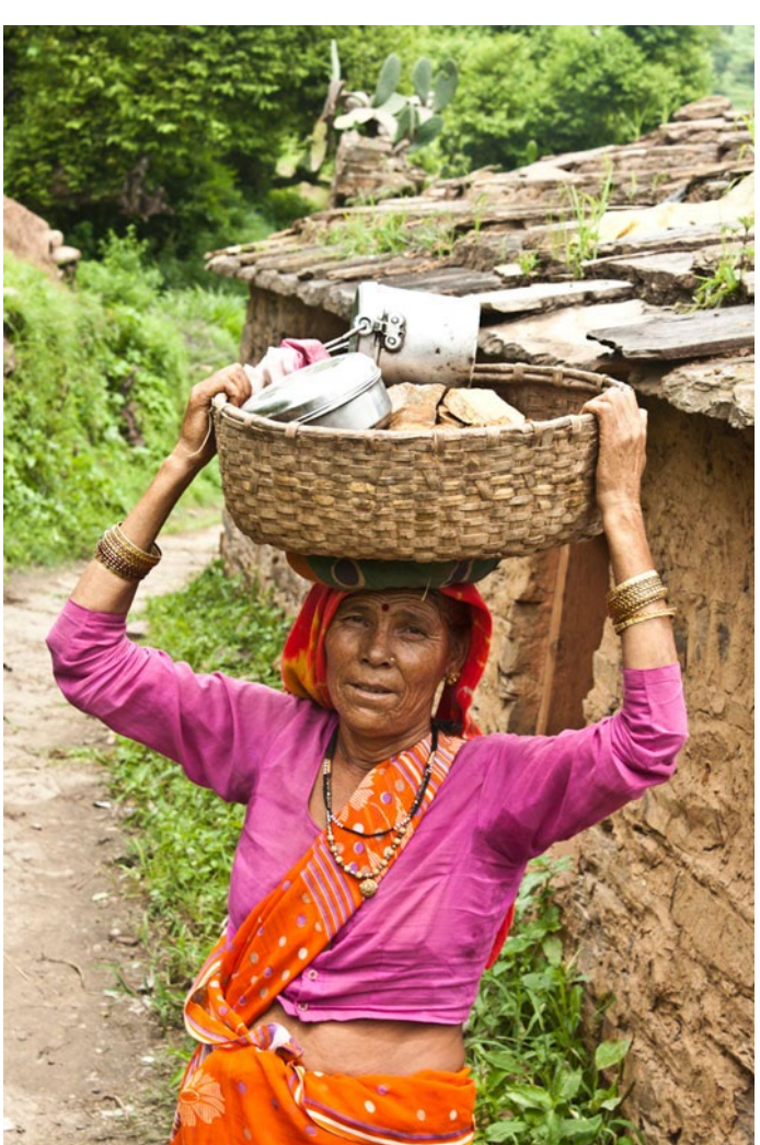
Daily labourer woman carrying things in a bamboo basket.

Introduction Tools and Raw Materials Making Process Products People-Place-Lifestyle References