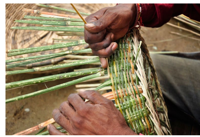
Bamboo strips are joined one after another for the continuity of weaving.