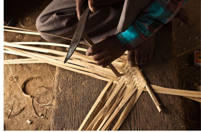
The strips are beaten mildly to sit firmly.