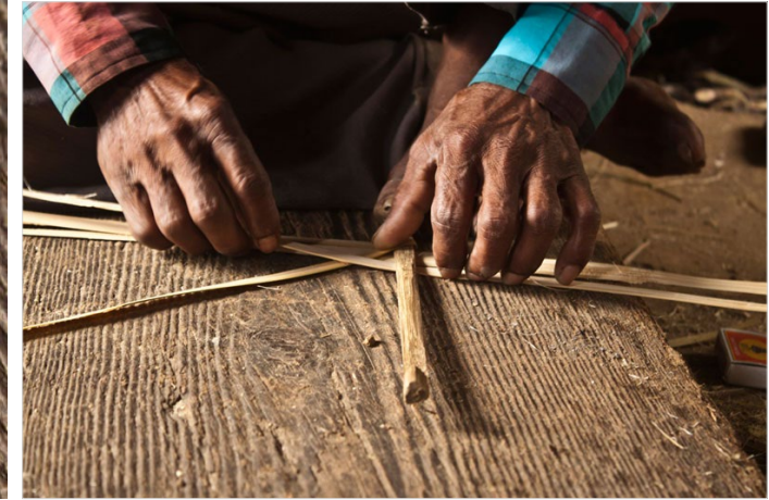
Initially, the strips are kept under the front stick in criss-cross manner.