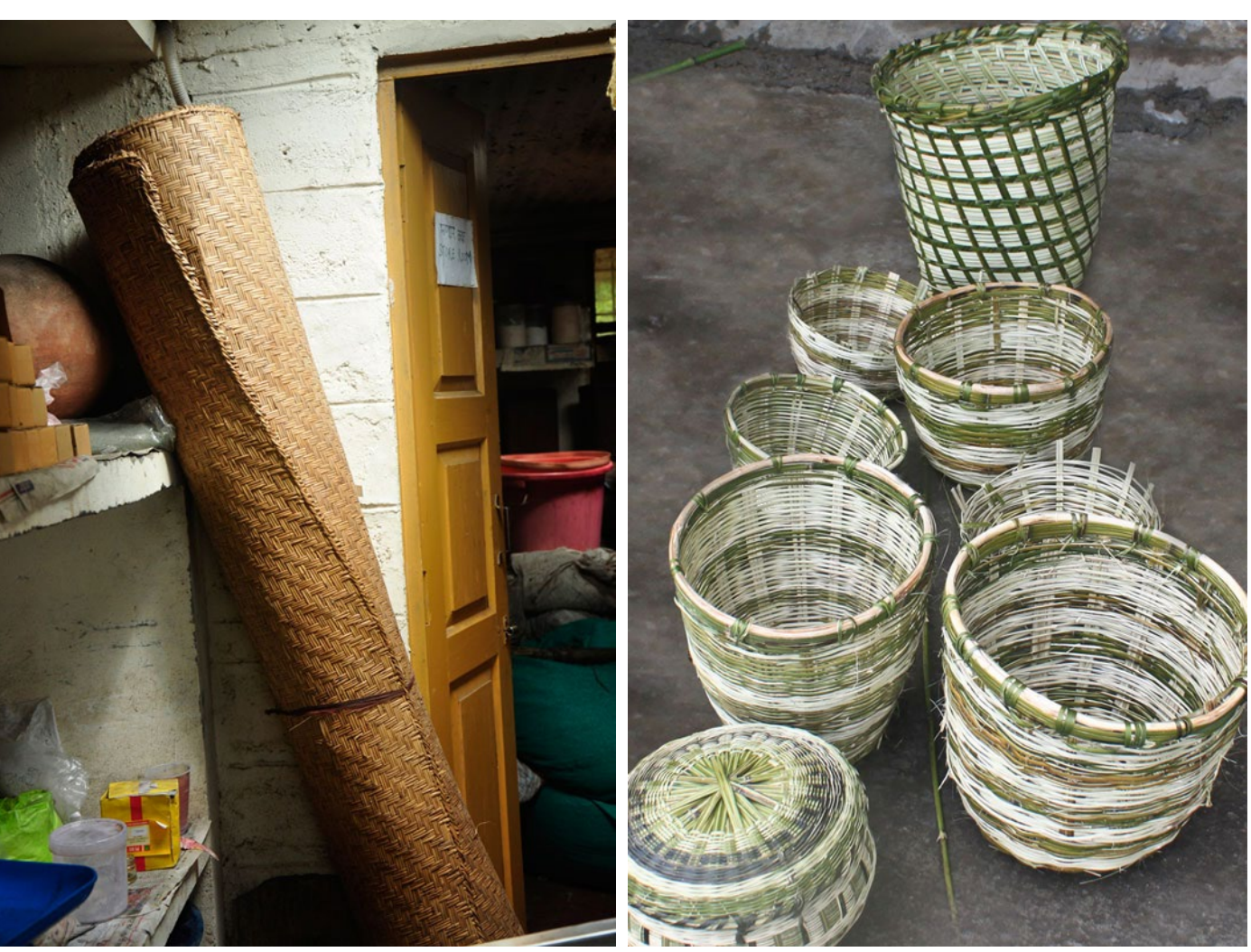
A multipurpose bamboo mat used for flooring, fencing and roof as well.

Introduction Tools and Raw Materials Making Process Products People-Place-Lifestyle References