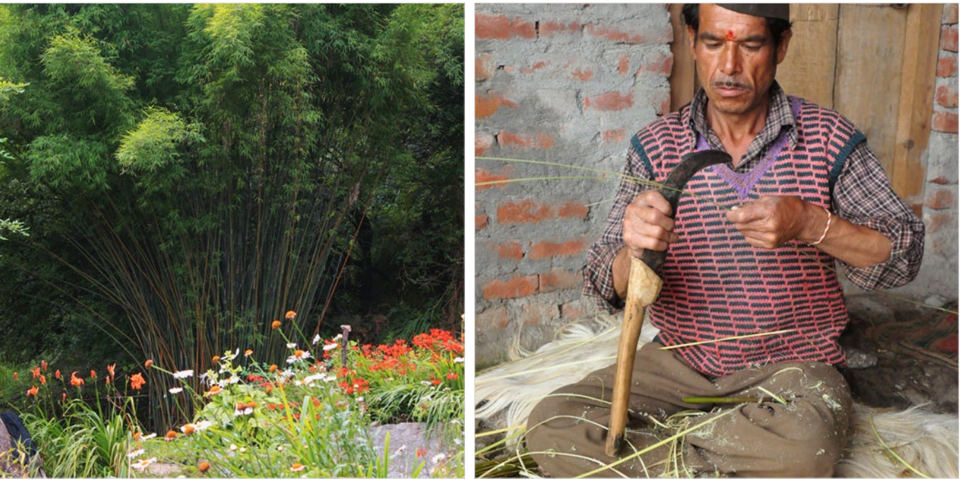
Ringal bamboo varies between three and five meters in A typical curve shaped knife used to peel and cut the length and is found in the hills of Uttarakhand.