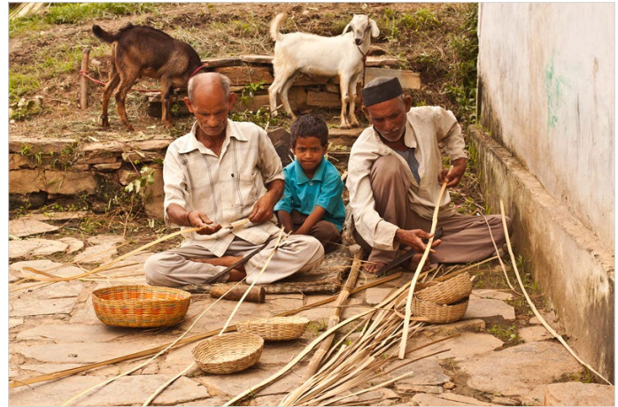
Senior artisans busy in their work.