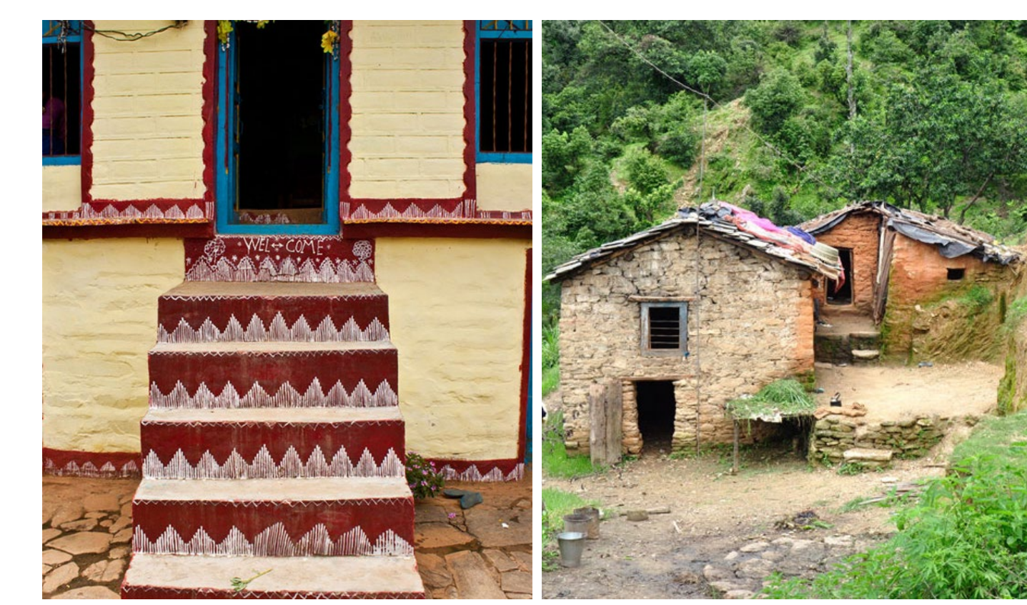
Stairs of house decorated with traditional Aipan art.

The lifestyles of the people here are very simple. The nature of these village people is very friendly and welcoming. The houses are beautifully decorated with locally available resources. One can see the cultural doors of Uttarakhand houses are intricately carved and painted.