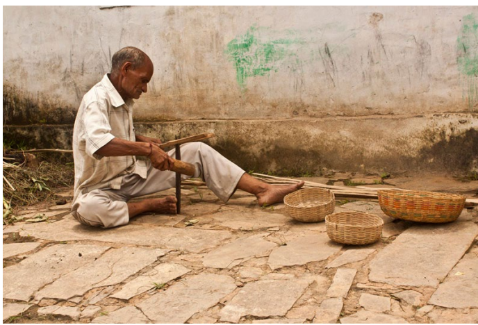
Senior artisan cutting and splitting the bamboo.