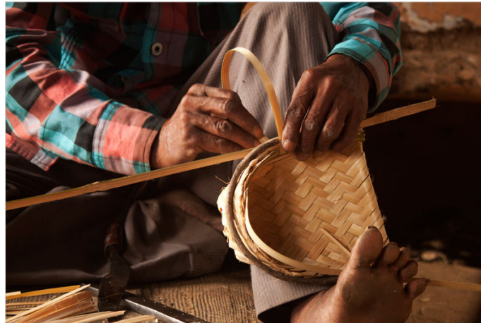
Artisan takes leg support to edge finish the product.