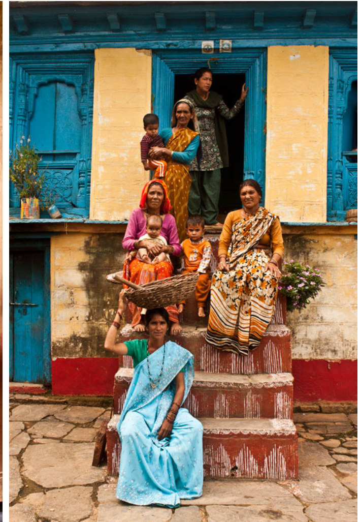
Working women sharing light moment in the morning.