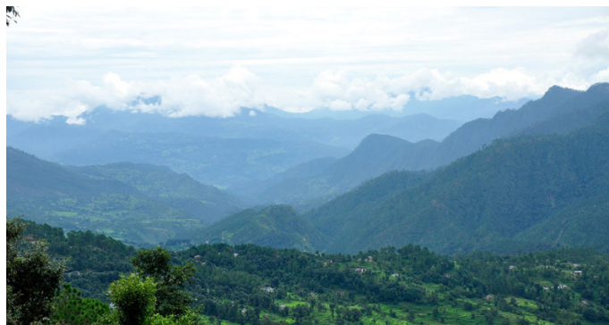
Natural beauty of Uttarakhand.

Uttarakhand has bamboo cottage industries based in Pithoragarh, Chamoli, Uttarkashi, Almora and Nainital and in other rural pockets where clusters of bamboo grow.