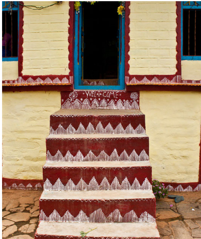
Stairs of house decorated with traditional Aipan art.

The lifestyles of the people here are very simple. The nature of these village people is very friendly and welcoming. The houses are beautifully decorated with locally available resources. One can see the cultural doors of Uttarakhand houses are intricately carved and painted.