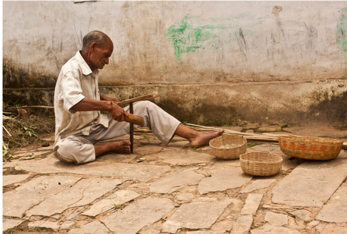
Senior artisan cutting and splitting the bamboo.