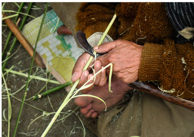
The bamboo is cut into thin strips and fiber is peeled to get smoother surface.

The finished baskets are mainly used for storing grains and supplements and carrying purposes. Some baskets are ornamented with plain weaves. Ringal Bamboo products are tough and durable. They are made with attractive Lattice designs. Other utilities and decorative items include fruit and vegetable baskets, pens, stands, flower vases, vessels and tea trays.