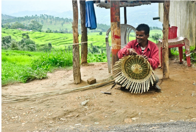
Artisan weaving basket with thin bamboo splits.