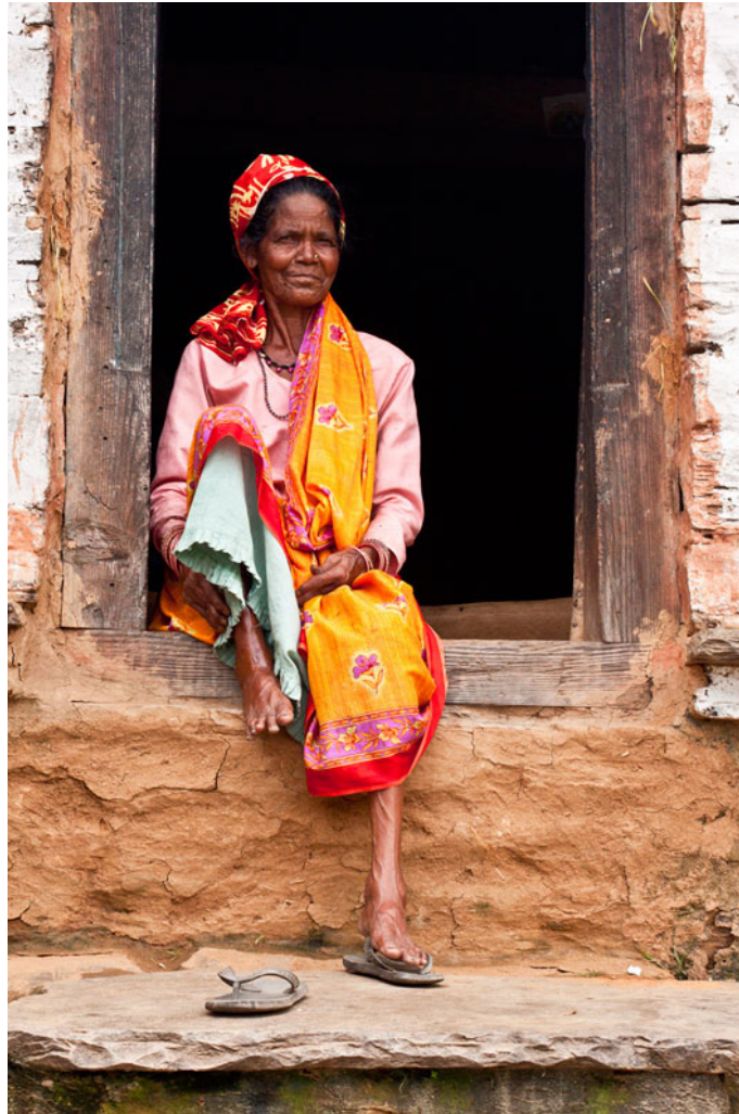
Woman in her leisure time.