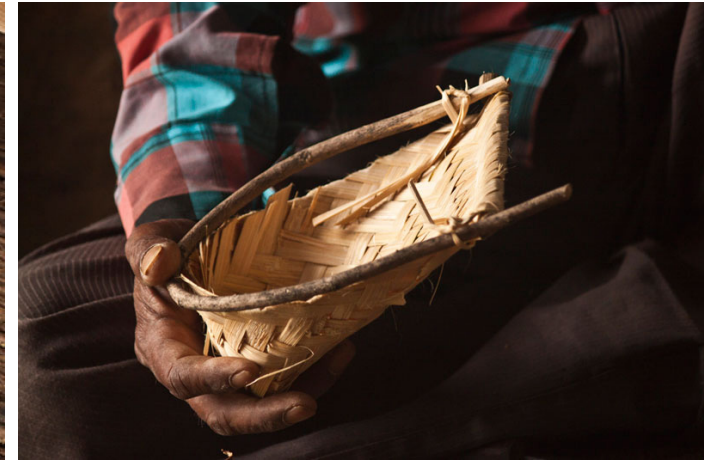
Tender wooden twig is fixed at the top for reinforcement.