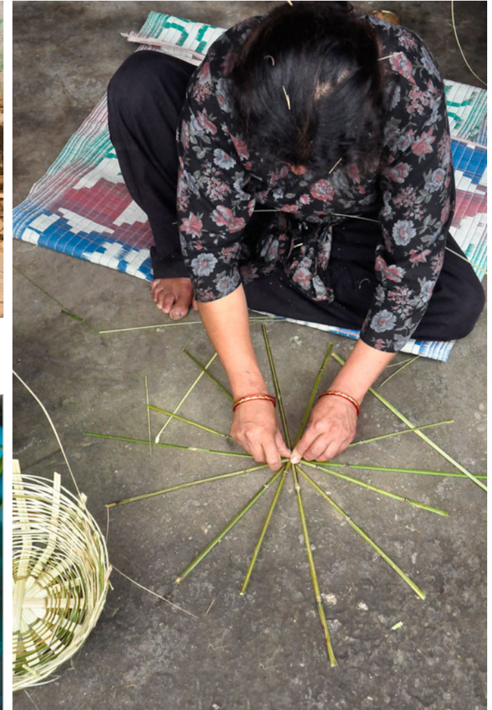
Bamboo strips are arranged to make the base.