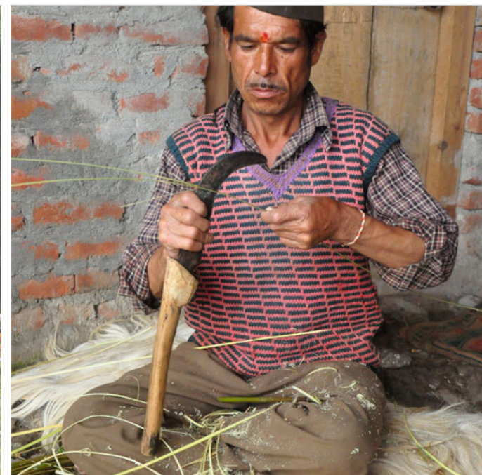
A typical curve shaped knife used to peel and cut the bamboo.