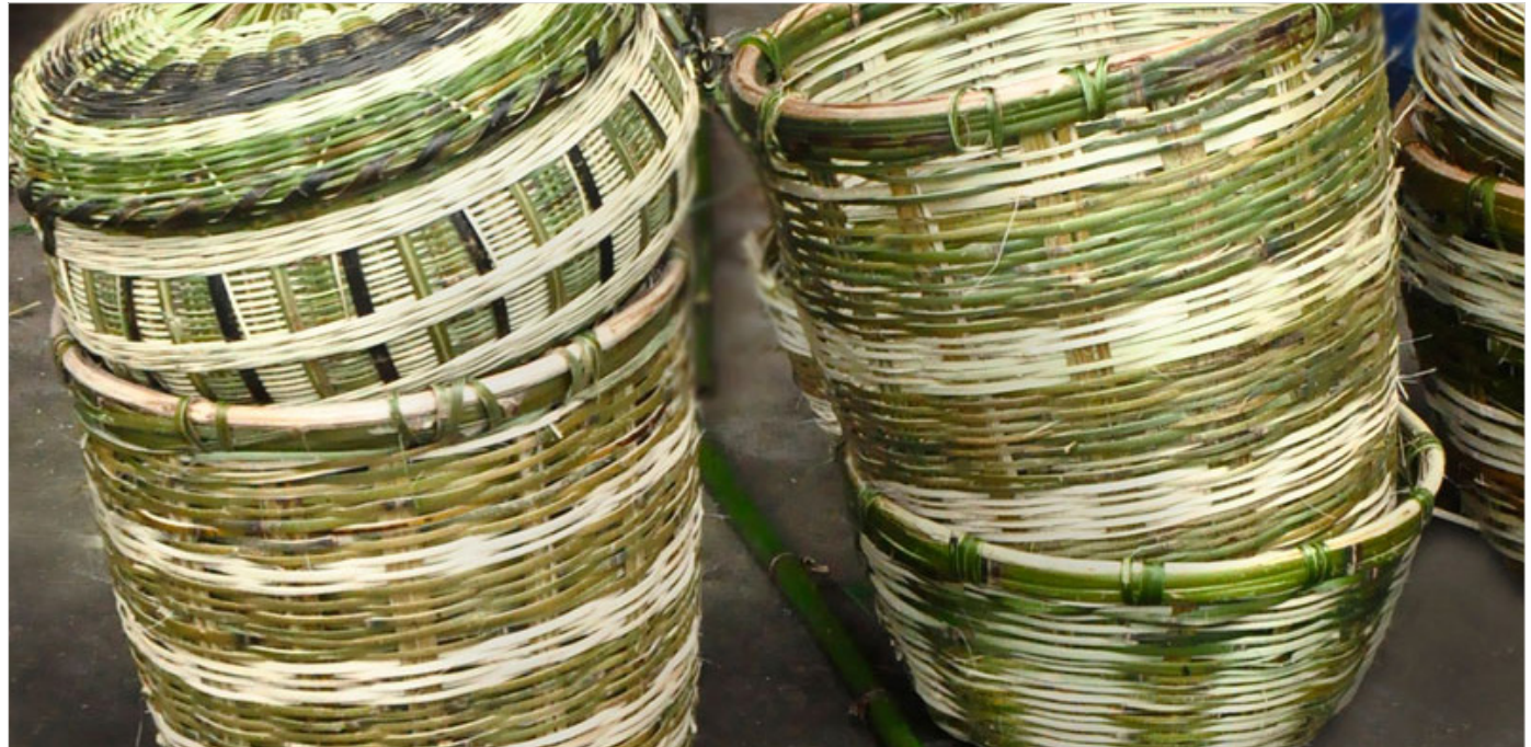
Bamboo baskets of different sizes and shapes.