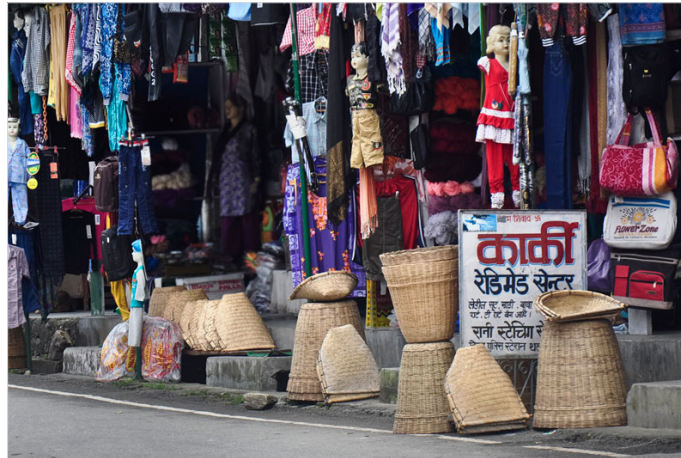
Traditional bamboo products have made their own significance in modern market.