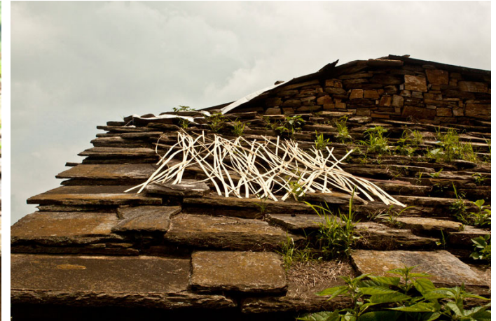
Bamboo strips are dried on the top of the stone roof house.