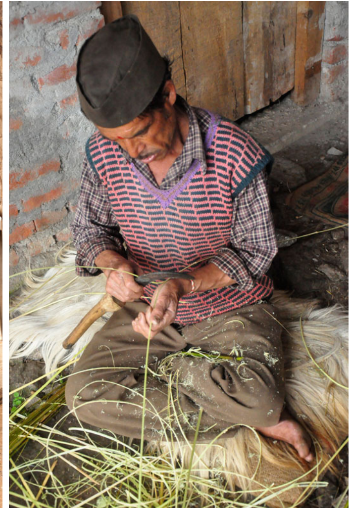
The local artisan sitting on a mat made of sheep skin.