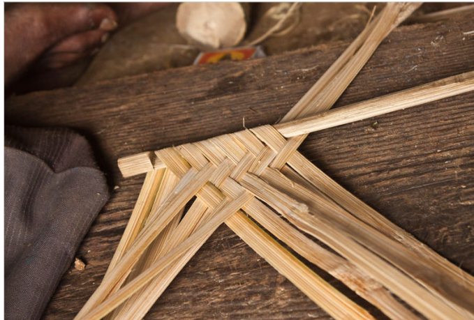
The splits are reversed from the front stick and interwoven in the main body.