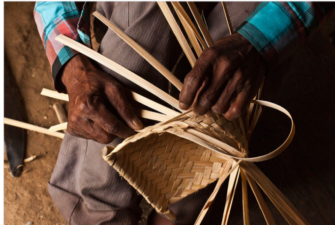
Interlocking the top edge.