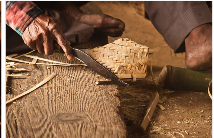
The extra part of supported stick is being cut.