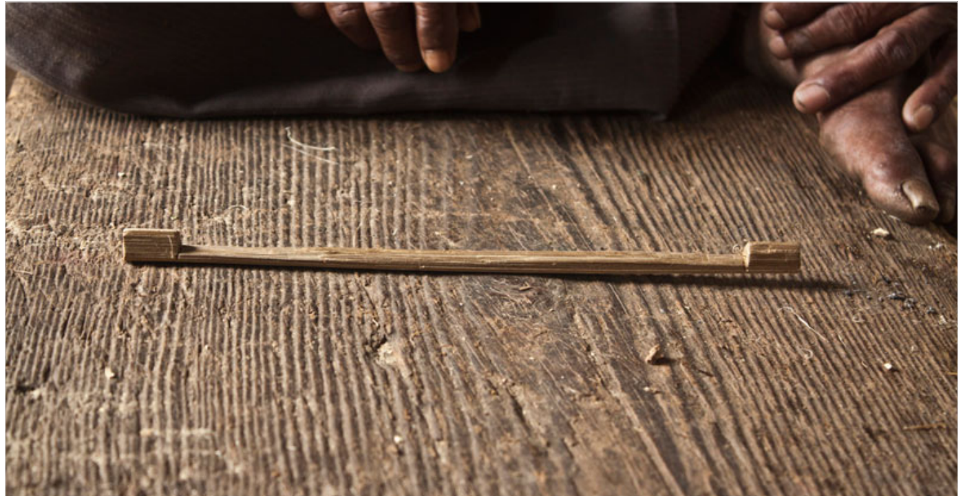
Bamboo stick is shaped to form the front part of the winnow.

Winnow weaving process is done by arranging the bamboo strips in a criss-cross manner with the help of a small bamboo stick. Once the weaving is completed, the extra edges are cut and removed. A small tender stick is tied on the edge of the winnow to give reinforcement.