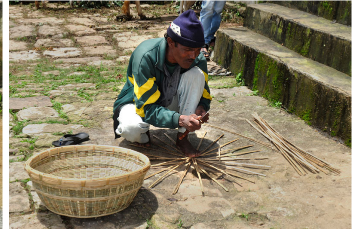
Base of basket is being arranged.