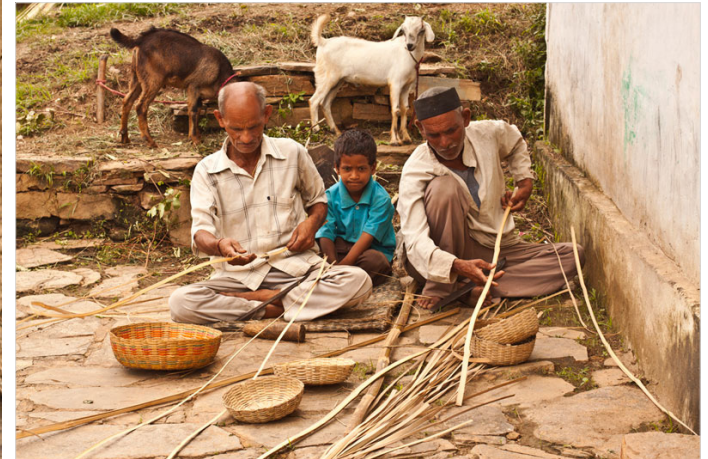
Senior artisans busy in their work.