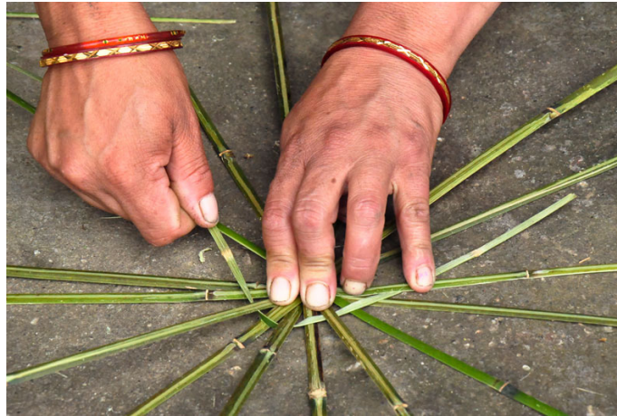
Weft strip is weaved in zigzag pattern.