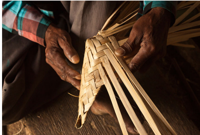
Extra long edges are twisted and turned to interweave.