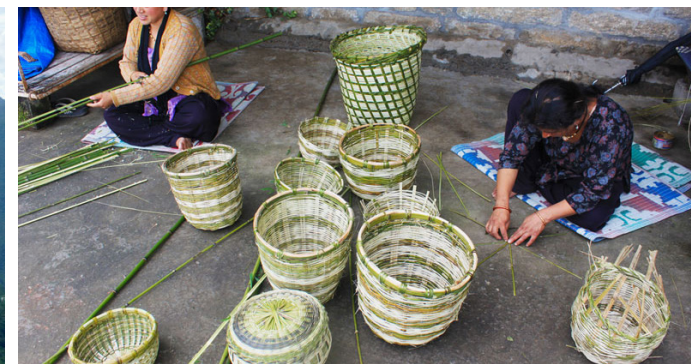
Hue of green products – Achieved by innovative and creative use of coloured bamboo strips.