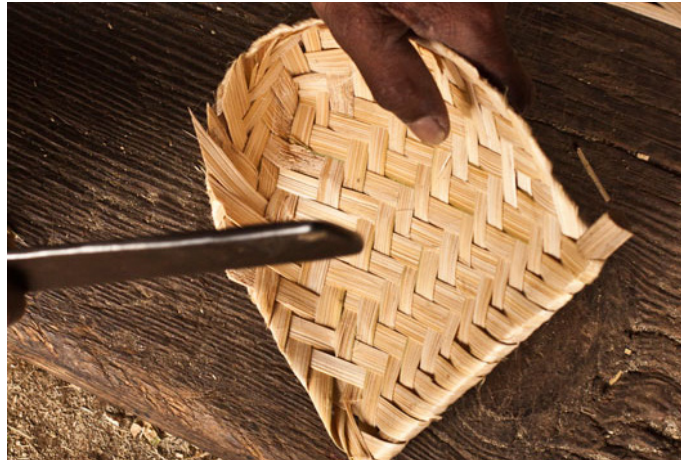
Extra edges are removed after weaving.