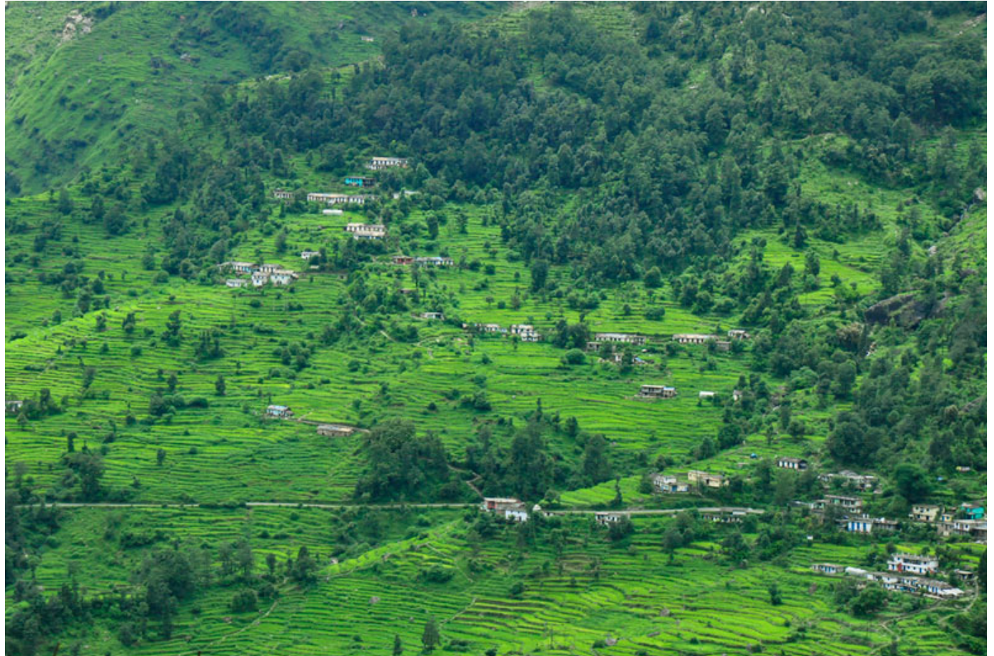
Natural beauty and habitation of Uttarakhand.