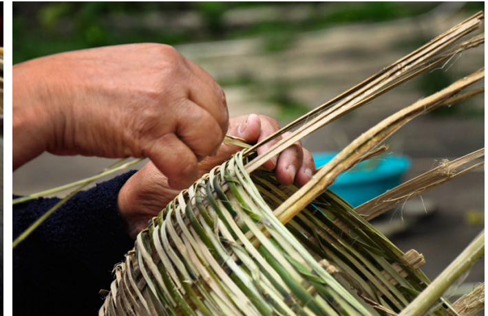
Thick bamboo stick is used for the border and interlocked with bamboo strips.