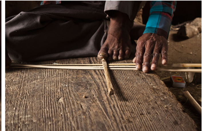
Arranging bamboo splits to start weaving.