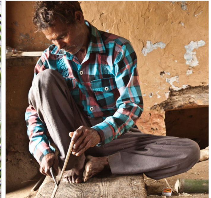
Artisan preparing bamboo sticks for winnow making.