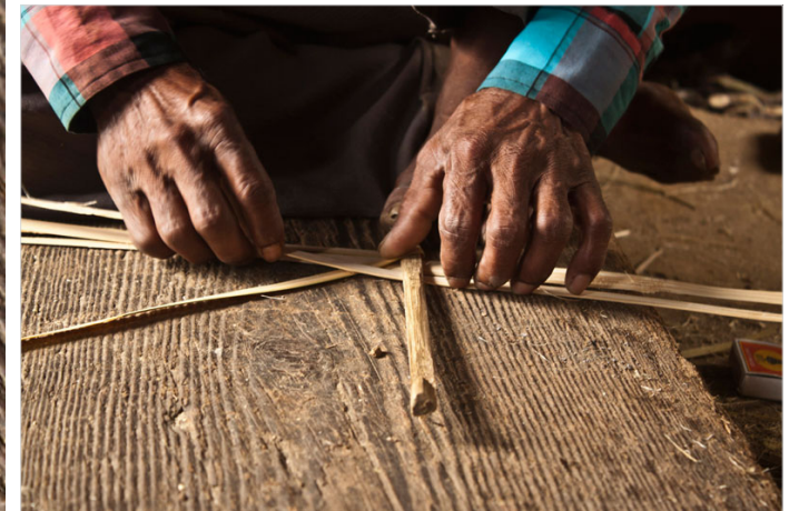
Initially, the strips are kept under the front stick in criss-cross manner.