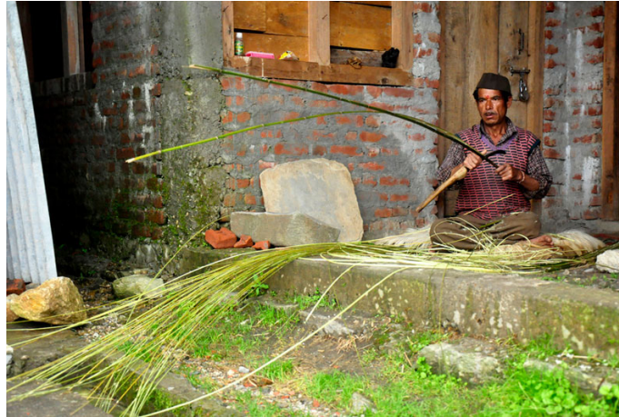
Artisan splitting the tender bamboo poles.

https://dsource.in/resource/ringal-bamboo-basketry-uttarakhand/introduction