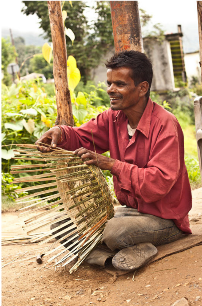
Bamboo artisan at work.