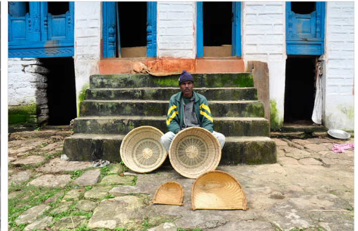
Artisan with his finished products.