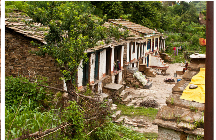
The living premises of typical farmer community in Dhamas village of Uttarakhand.