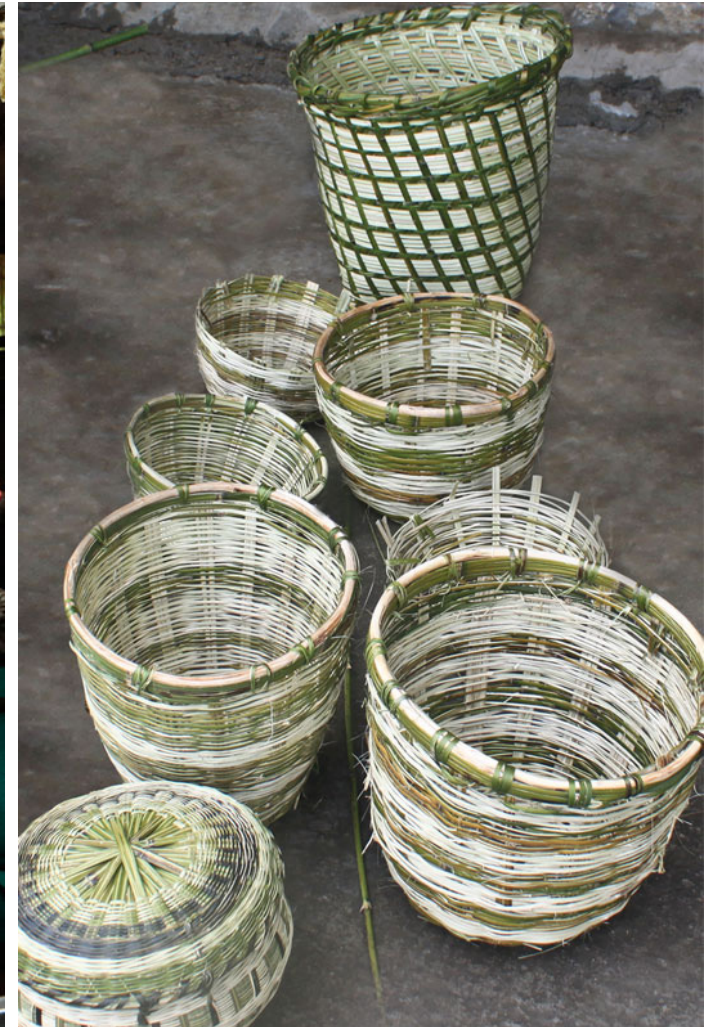
Bamboo baskets are made in different sizes and patterns.