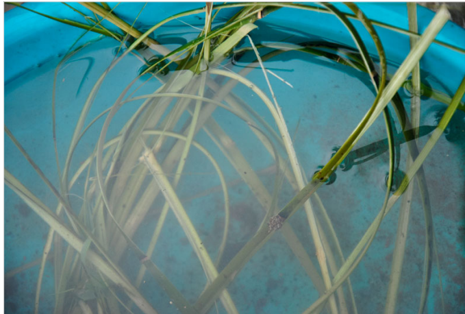
The strips of bamboo are soaked in water to retain moisture and to get flexibility while weaving.