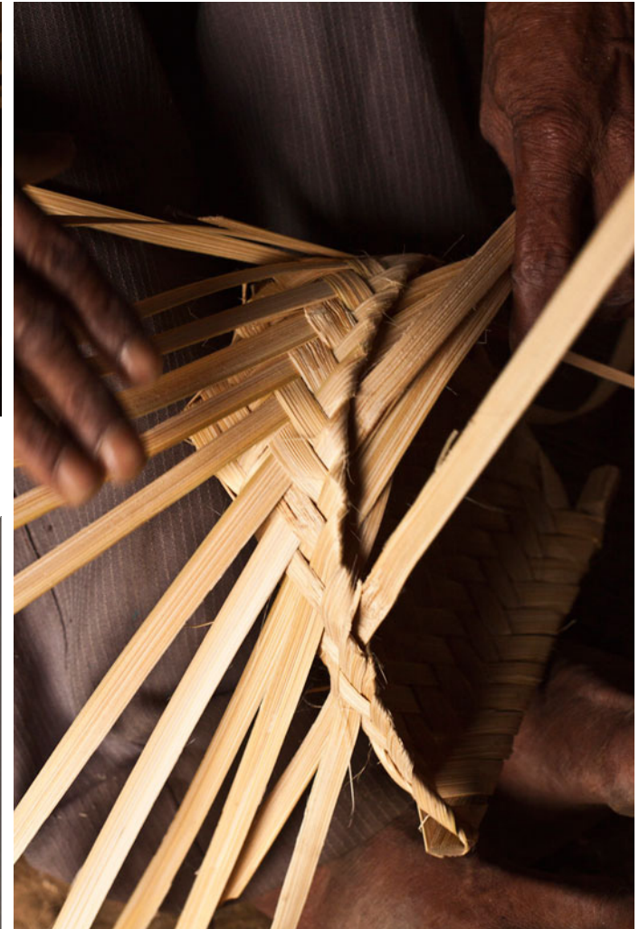
Final adjustments are made to tighten the formed weave.