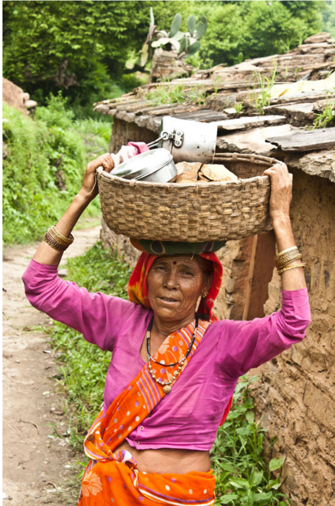
Daily labourer woman carrying things in a bamboo basket.