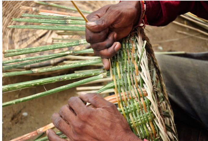
Bamboo strips are joined one after another for the continuity of weaving.