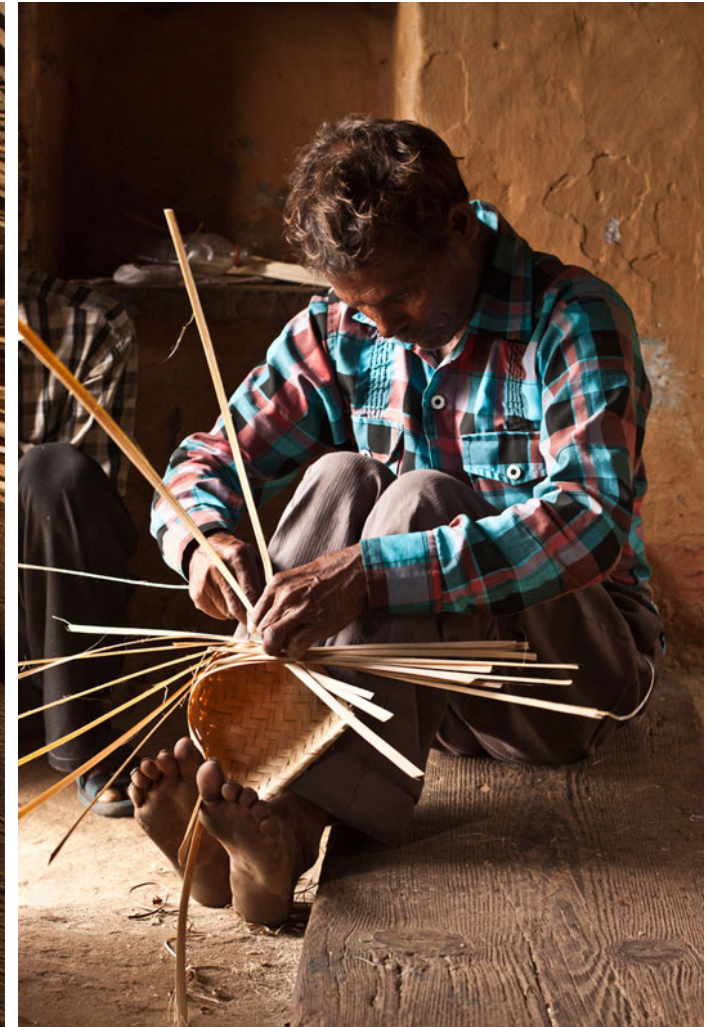
Artisan using both hands and legs tactfully to weave the winnow compact.