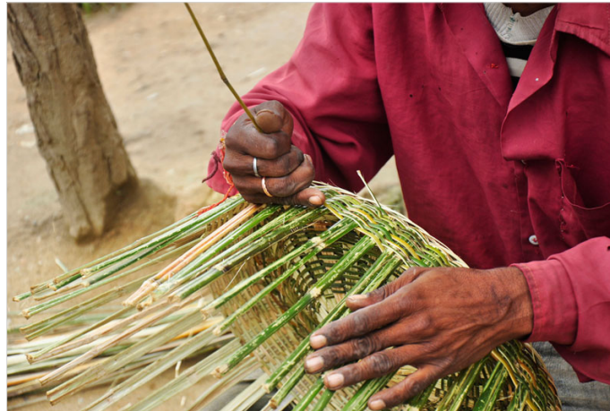
For big baskets, thick bamboo strips are used for toughness.