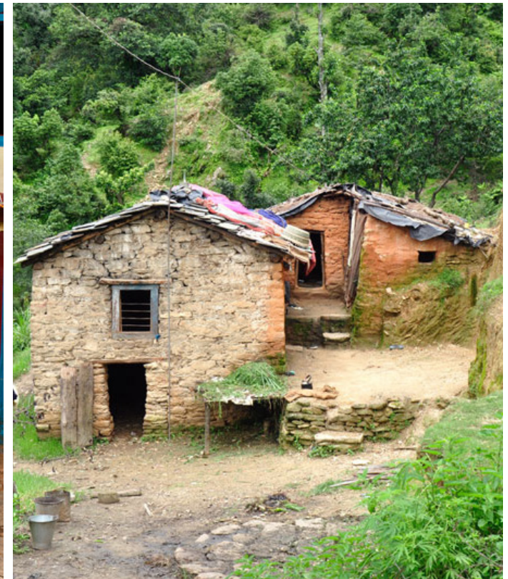
Local dwellings are far from each other.