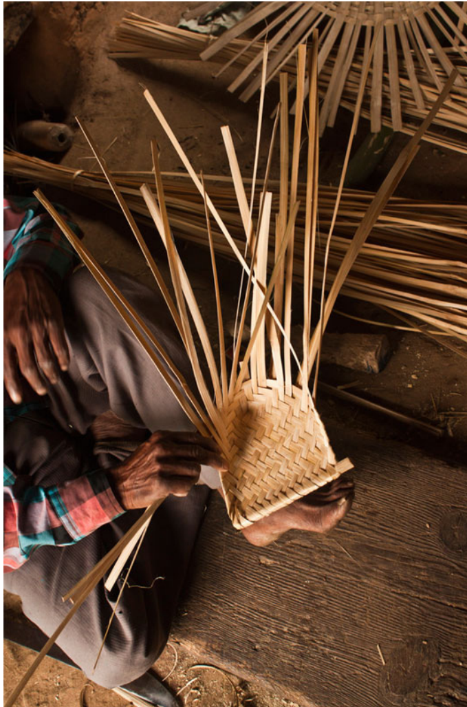
The side wall of winnow is being woven.