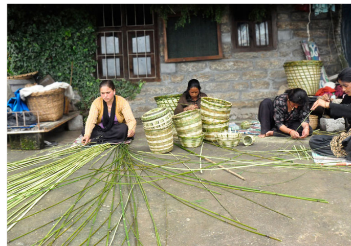
Women artisans engaged in selecting good quality of bamboo poles.