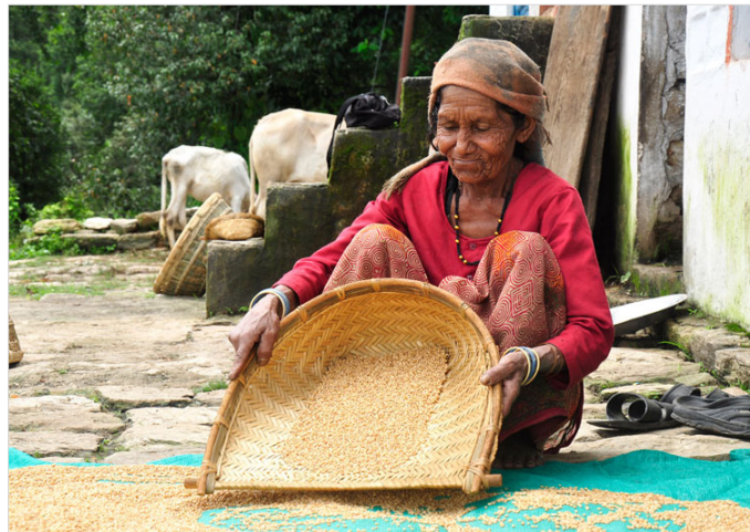
Winnow is used in daily life for winnowing purposes.