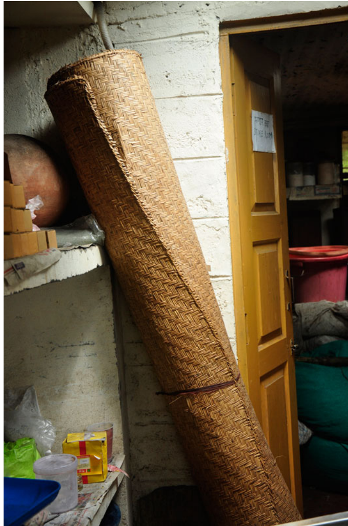
A multipurpose bamboo mat used for flooring, fencing and roof as well.