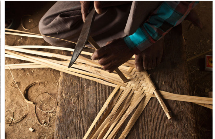
The strips are beaten mildly to sit firmly.