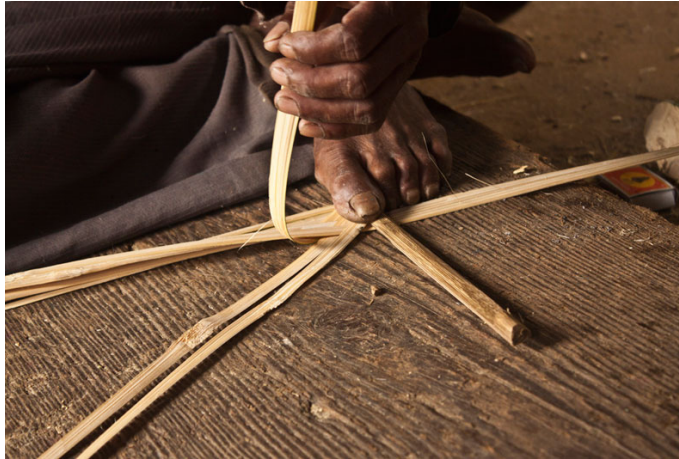
The splits are interwoven in a Zig-Zag manner.