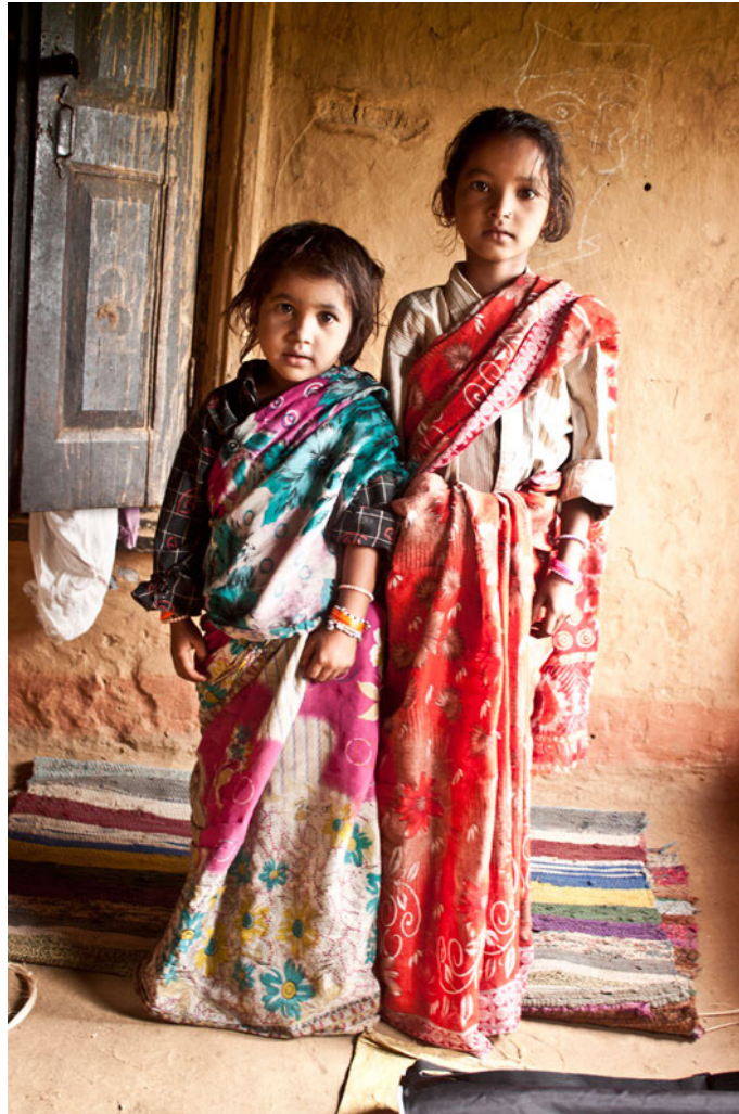
Village children dressed in sari.