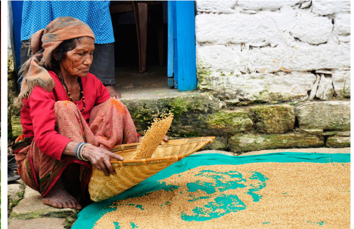
Farmers use bamboo products for agricultural purpose.