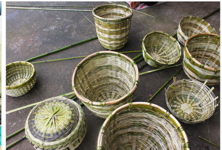
Thick cane poles are used to lock the borders of products for durability of products.