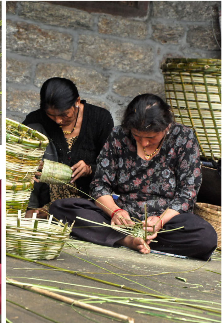
Women are mostly involved in this craft.