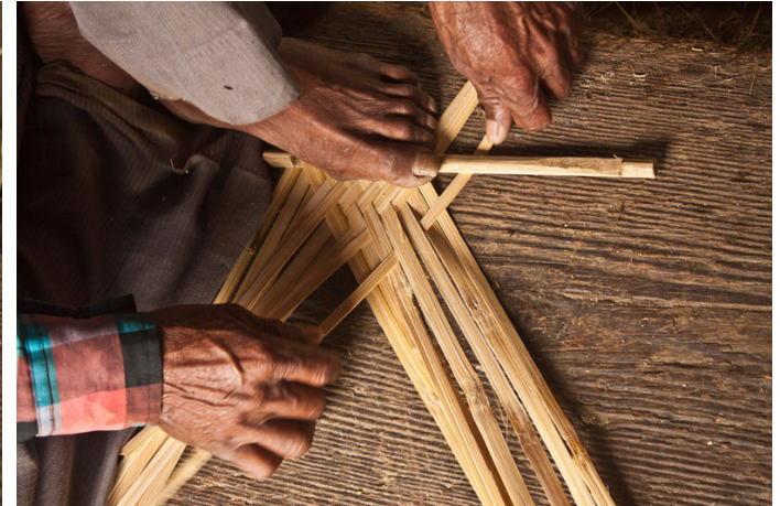
Weaving pattern looks similar to a basket weave (textile weave).