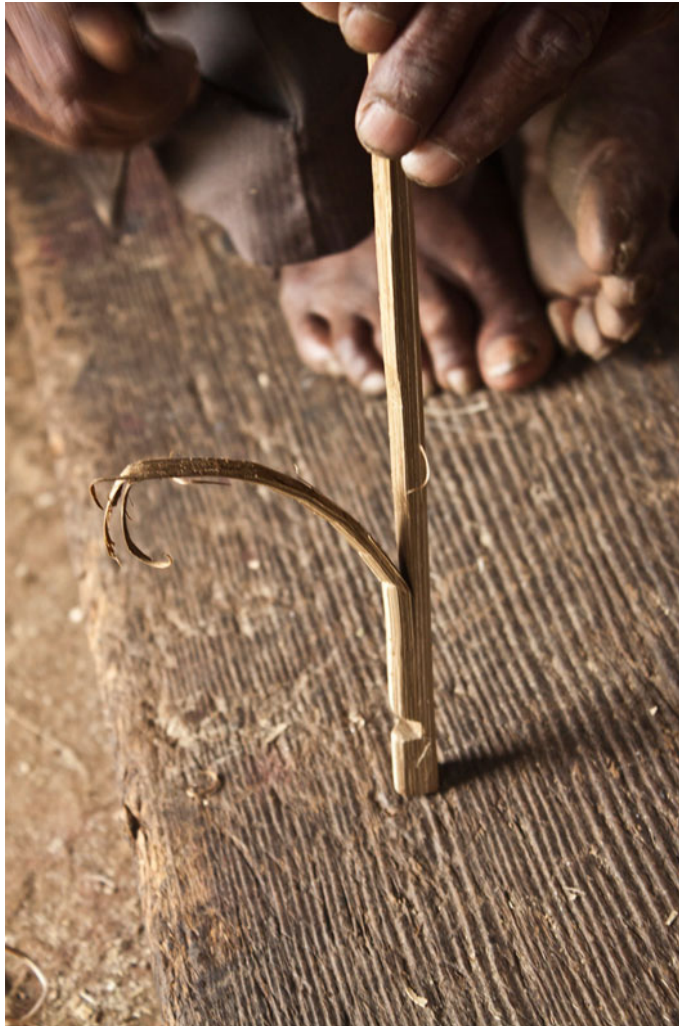
Small bamboo stick is used as a base support to make winnow.