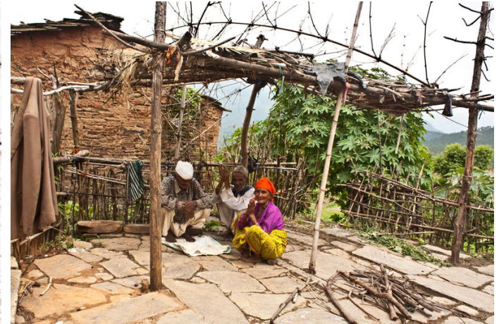
Senior citizens of the village relaxing in courtyard.