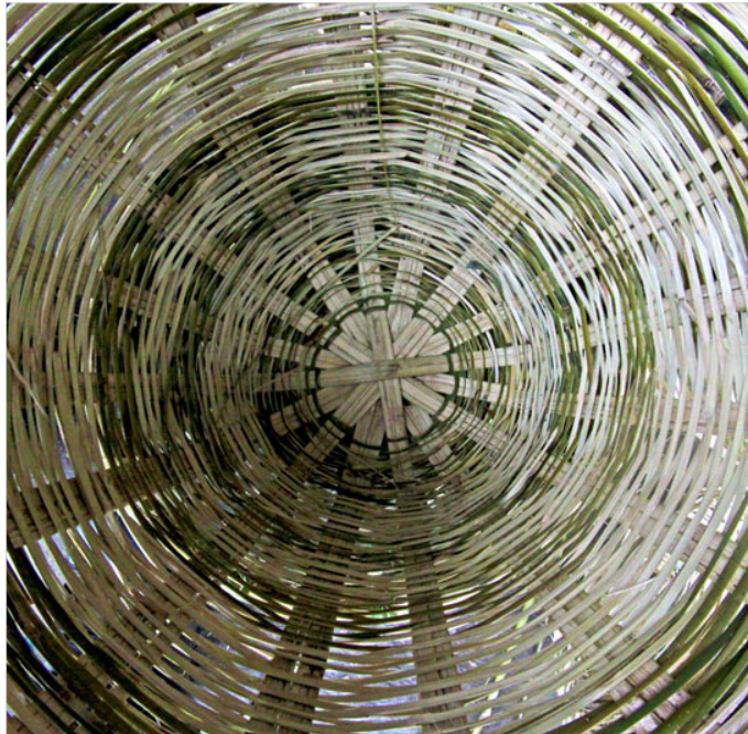
Eight main strips hold the structure of the basket placed in a circular manner.