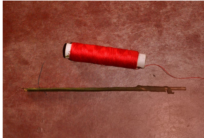
The thread is used for tying purposes.

https://dsource.in/resource/satin-flower-buds-goa/tools-and-raw-materials