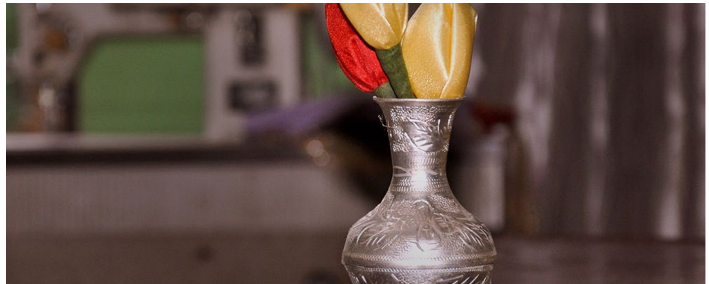
Stunning flower buds are decorated in silver pot.