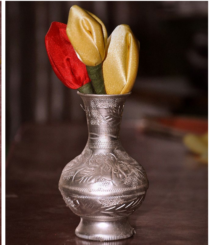
Flower buds decorated in a flower vase.