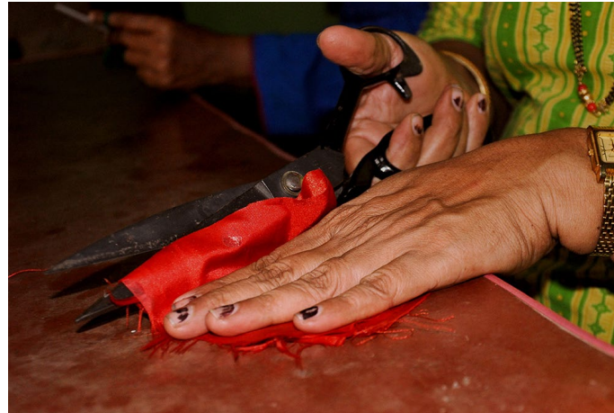
The artisan is cut the red colour cloth for making the flower bud.

https://dsource.in/resource/satin-flower-buds-goa/making-process