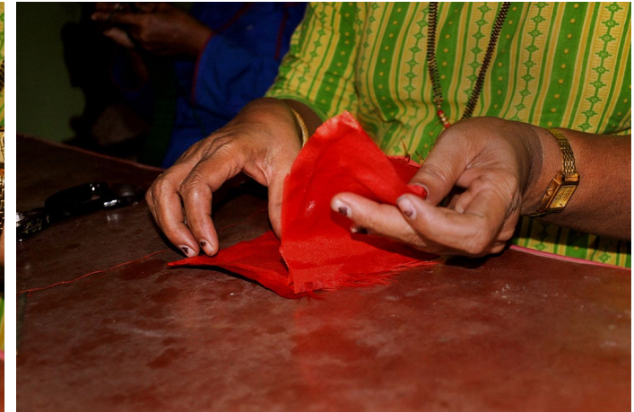
The required cloth is taken.