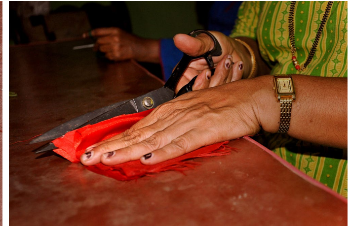
The Scissor is used for cutting the cloth.