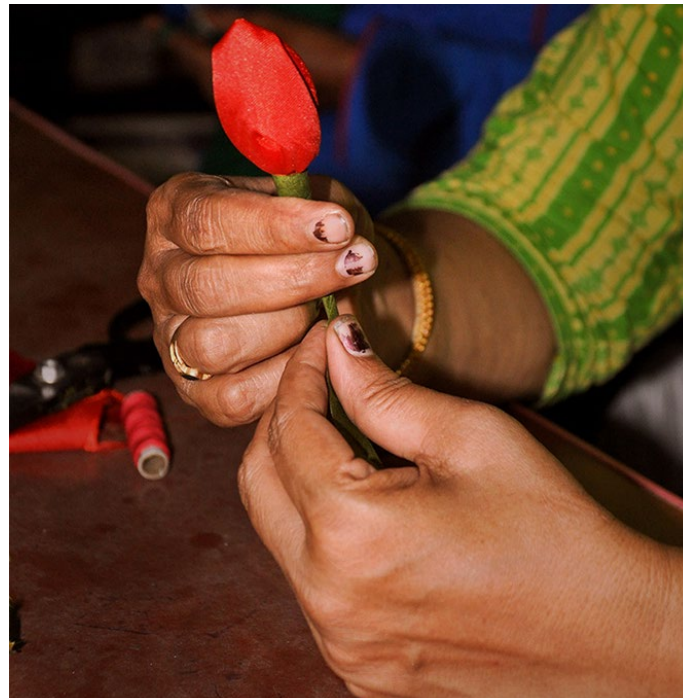
Artisan gives finishing touch to the flower bud.