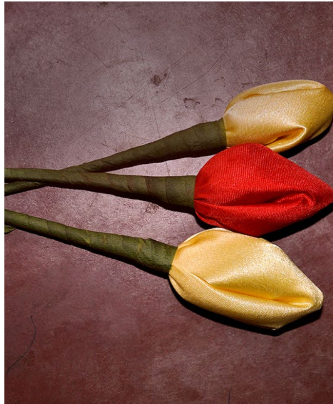
Bright coloured satin flower buds.

Bright coloured beautiful flower buds are used to decorate homes or offices. These buds are made from the left-over cut pieces of satin cloth, which are obtained during the making of satin bags. The price of each flower bud varies between INR 20 to INR 50, depending on the size.