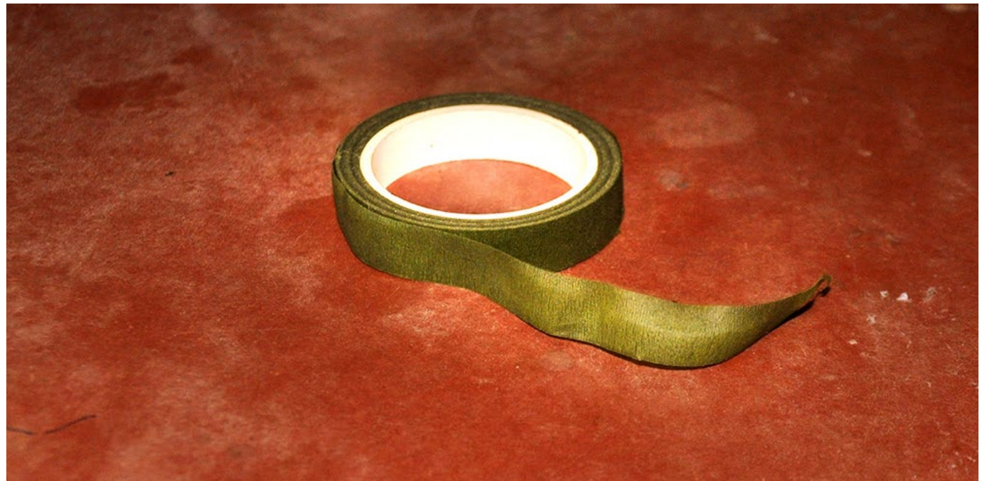
Green colour tape is used in the flower stem making process.