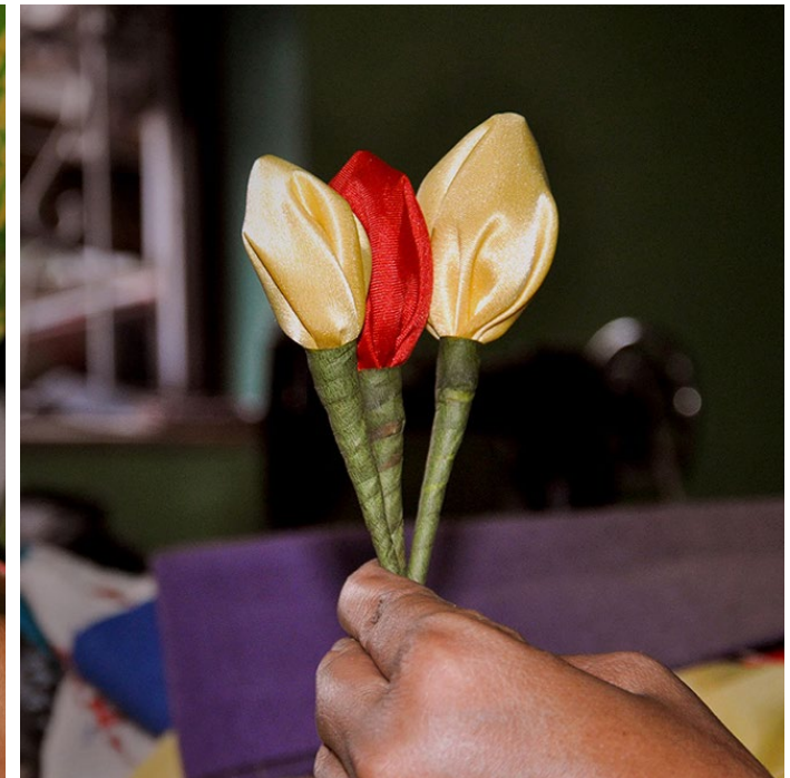
Yellow and red coloured cloth flower buds.