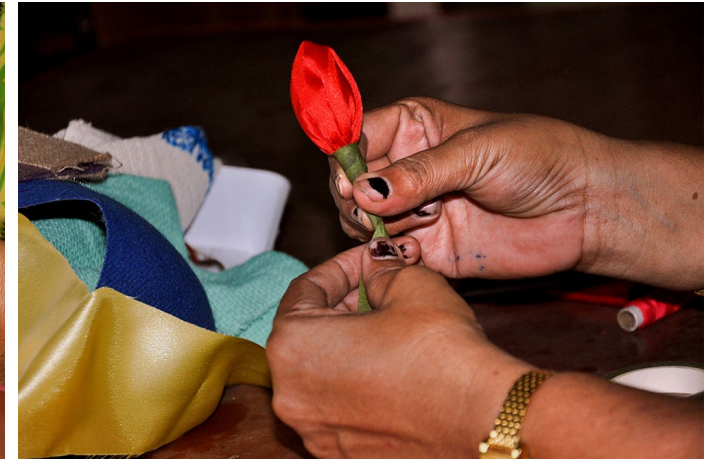
Green colour tape is applied on the top of the wooden stick.