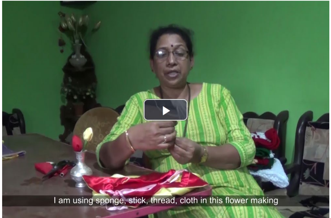
Satin Flower Buds - Goa