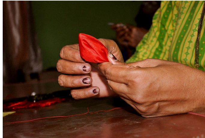
The cloth is folded and tied giving proper shape.

https://dsource.in/resource/satin-flower-buds-goa/making-process