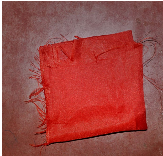
The satin cloth is used in flower bud making.