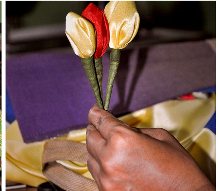
Artisan is showing her art.