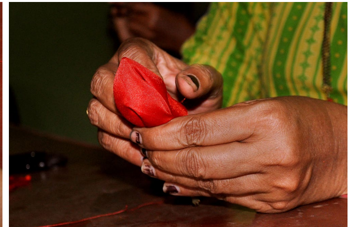
Folded edges are tied in flower bud shape.