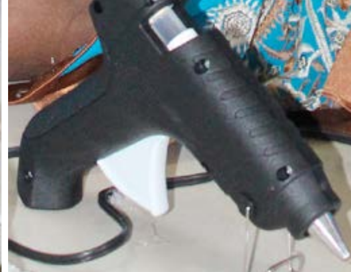
Hot glue gun.