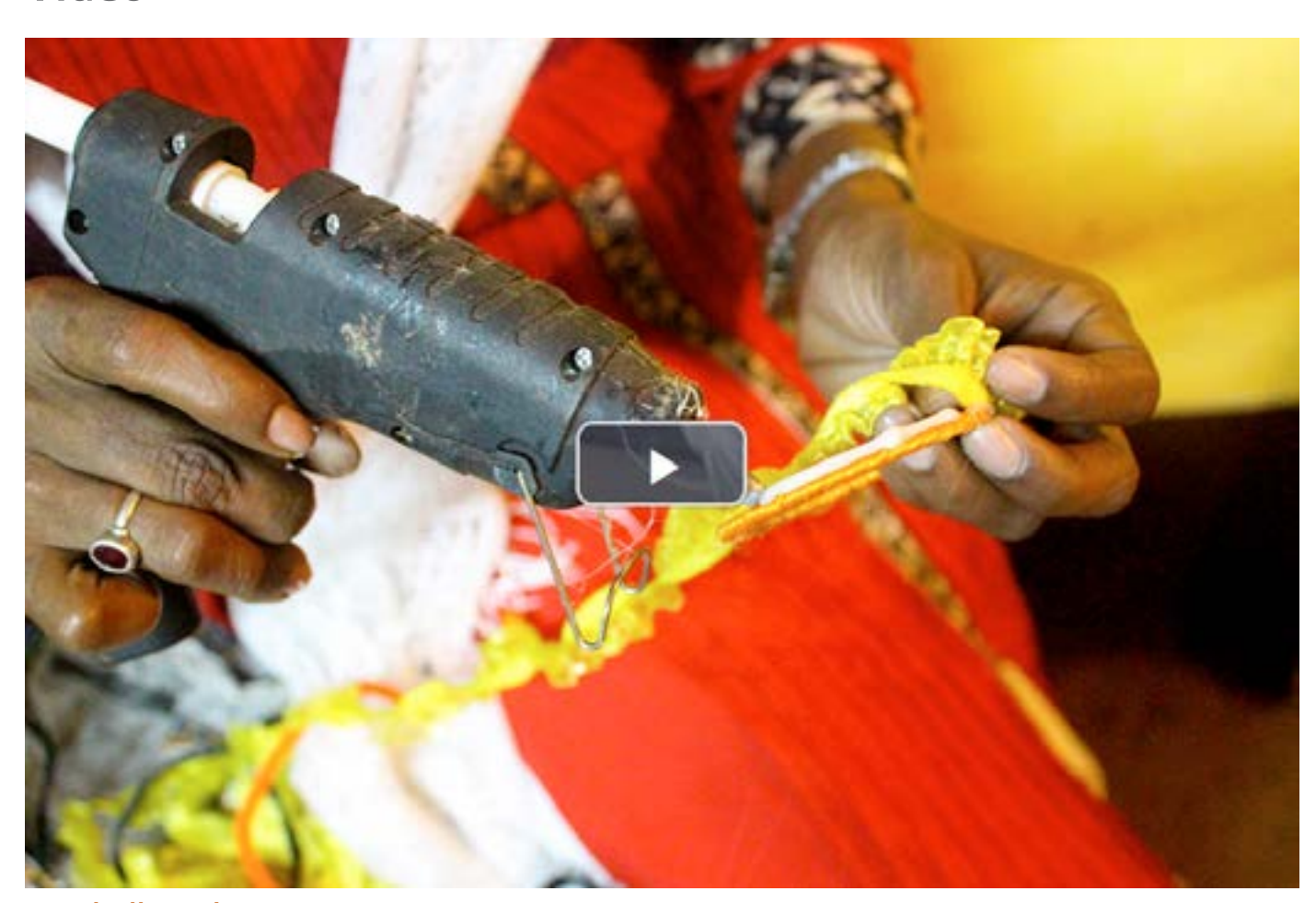
Seashell Products - Goa