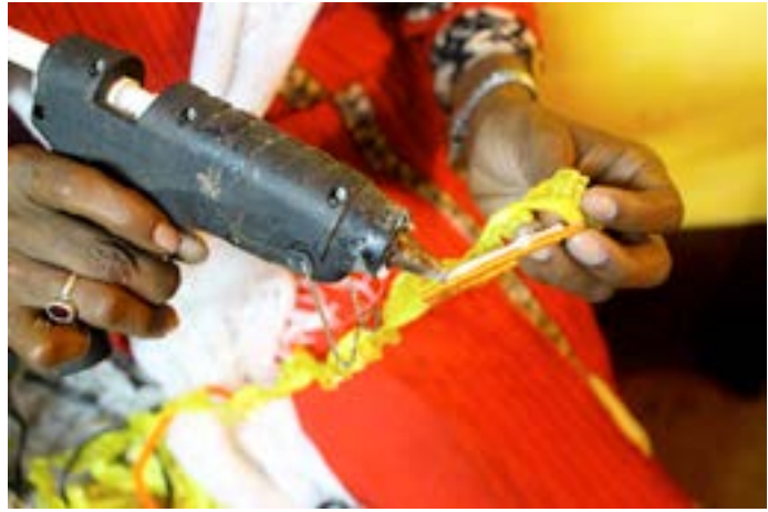
Applying hot glue on the colored fabric tape draped on the bangle.