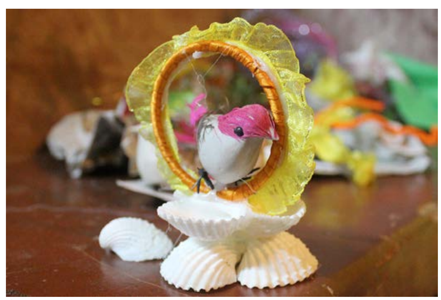
Showpiece made up of shell.