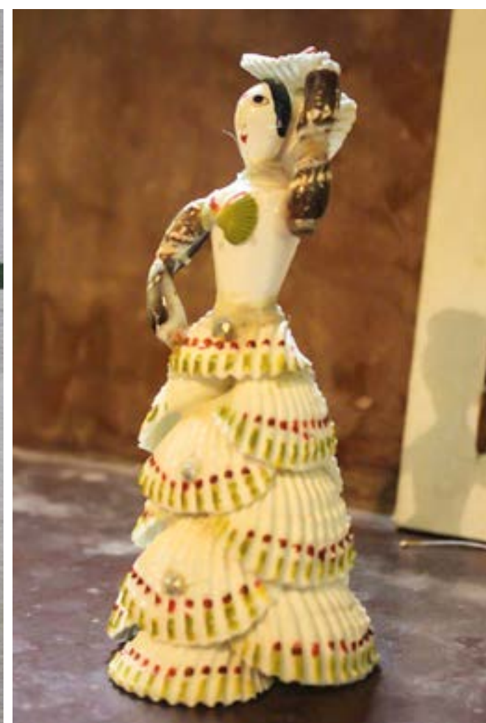
Beautiful doll made up of seashells.