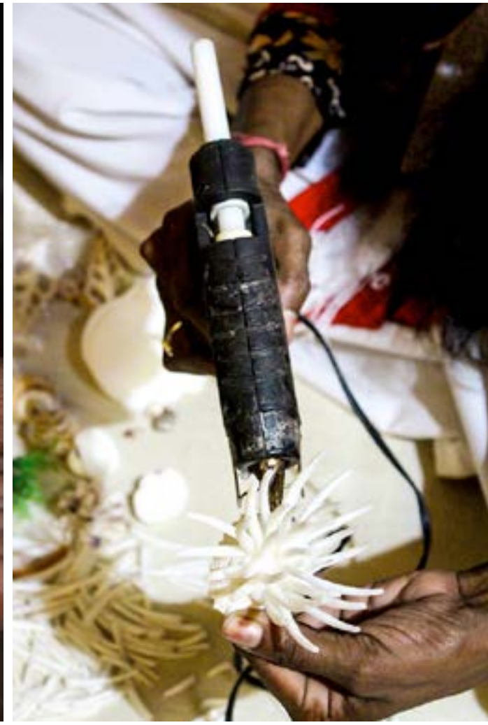
By using the glue gun, the artisan is sticking the tentacle shaped seashell on the cup-shaped shell.