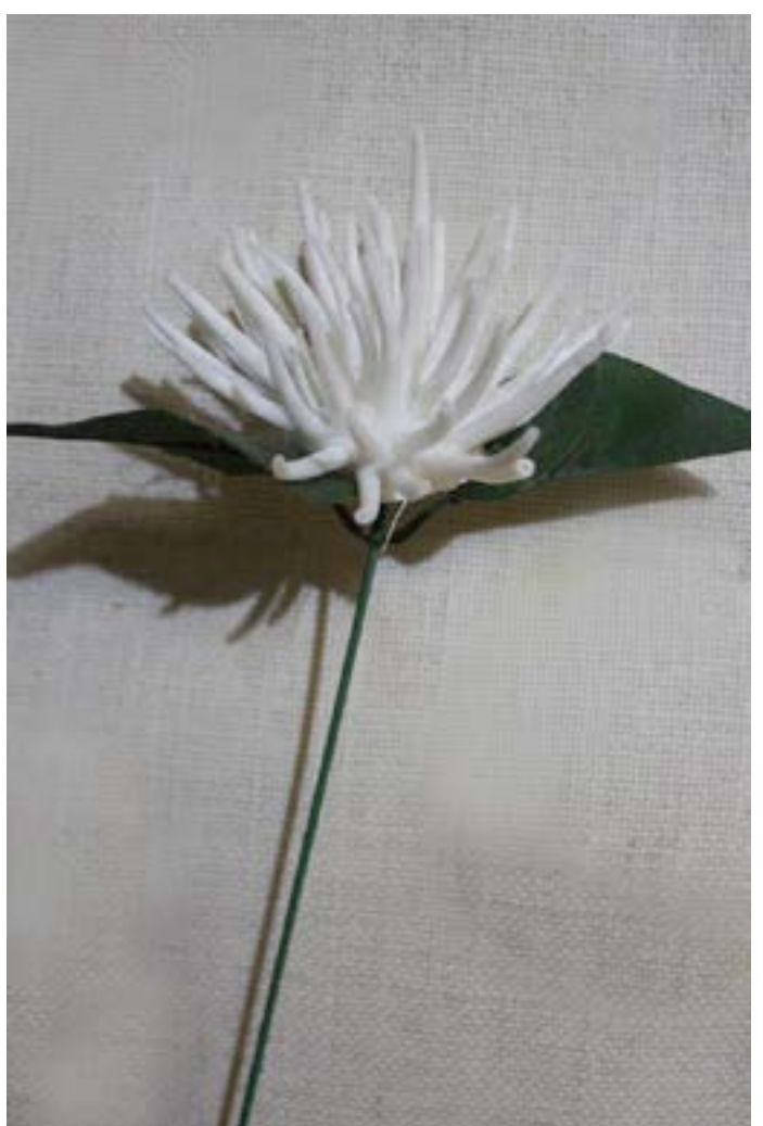
Flower made of seashells of a different shape.