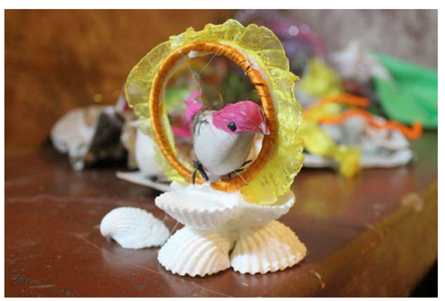
A beautiful showpiece is made up of seashells.