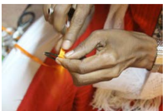
Once the flower is completed, artificial leaves and stems Artisan drapes coloured fabric tape to an old bangle. are attached to the flower.