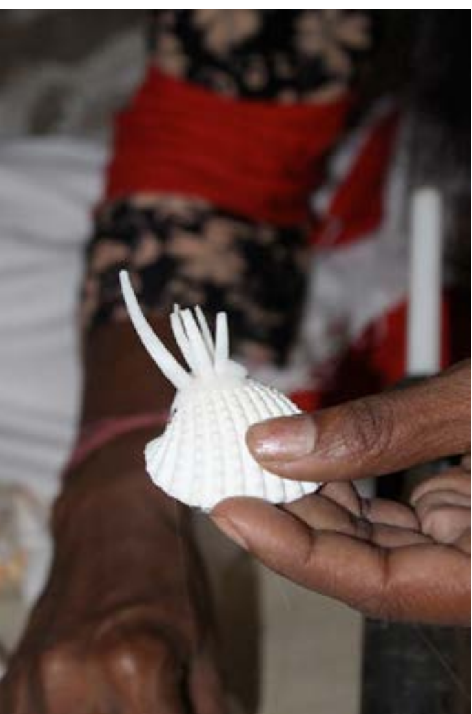
Artisan is making a flower using a cup shell as the base.