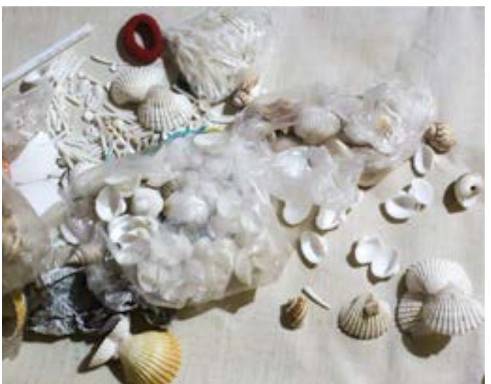
Shells of various sizes and shapes are used for making art.