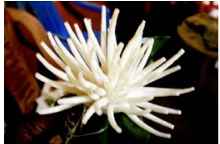
Seaweed is made out of shells.