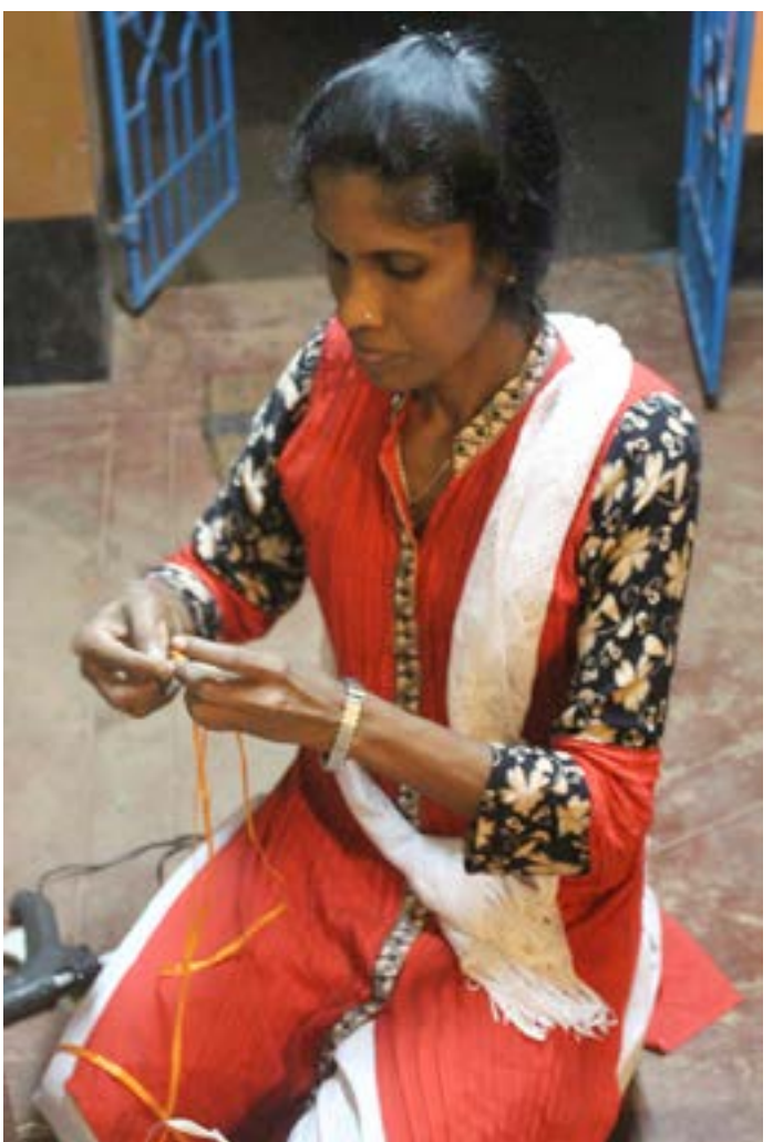
Artisan working on making of a bird showpiece.