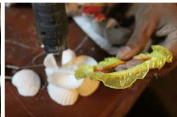
Hot glue is applied to the base.