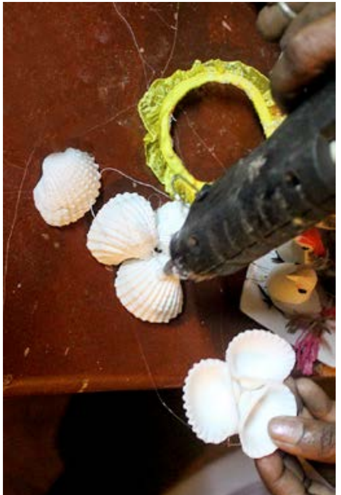
The cup shells are used to make the base of the showpiece.