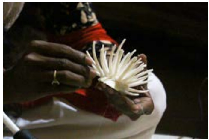
While using hot glue, the artisan has to hold the shell for a few seconds on the shell to fix it properly.