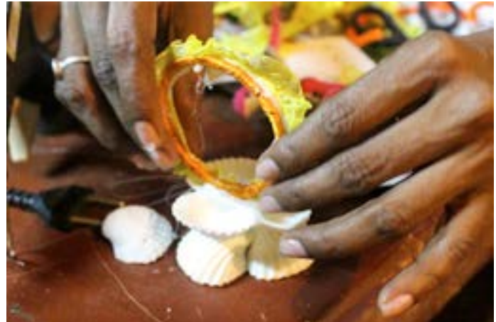
The designer ring made out of bangle is placed on the base.