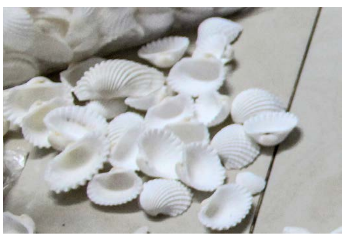
Seashells are widely found in coastal areas that are used in the making of various crafts.