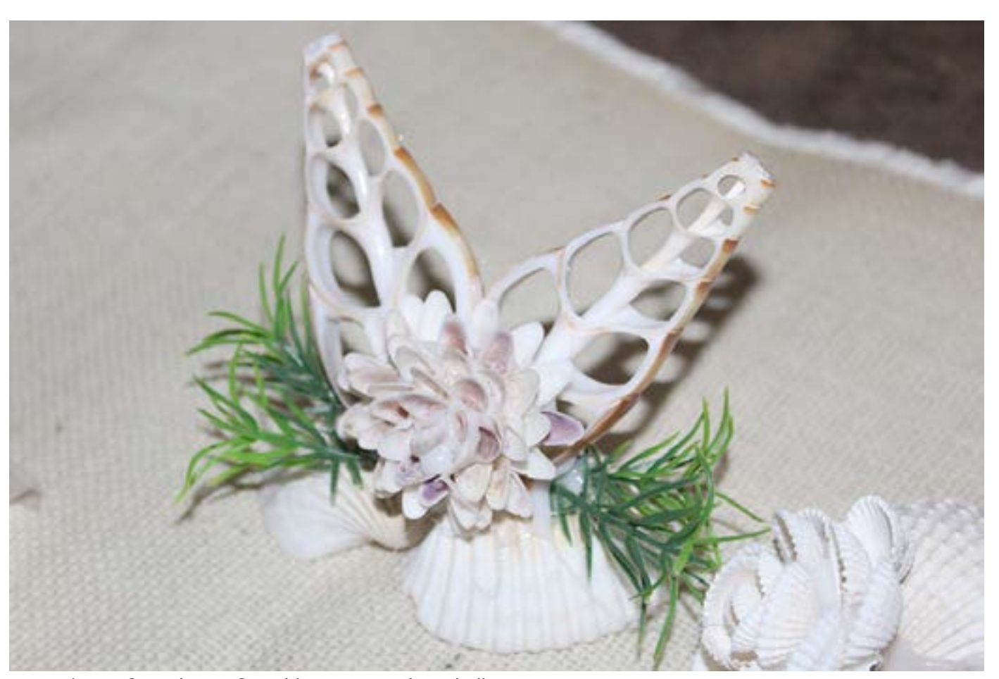
Attractive craft made up of machine processed seashells.