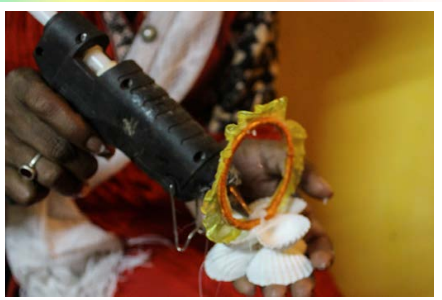
An artificial bird which is available in the market is placed on the ring with a hot glue gun.