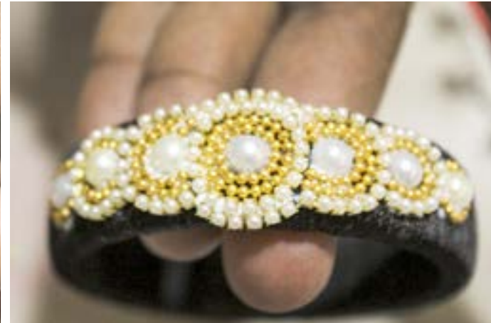
The final look of a decorated thread bangle.