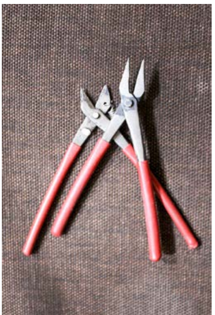
Scissors used to cut things into two or more pieces.