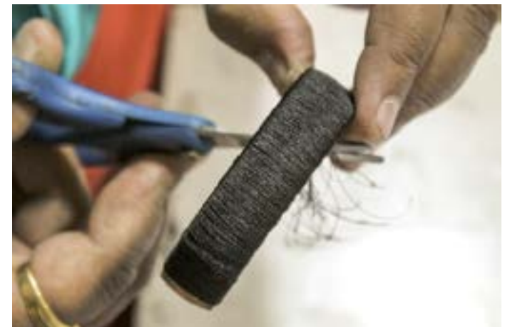
Extra threads being removed using a scissor.