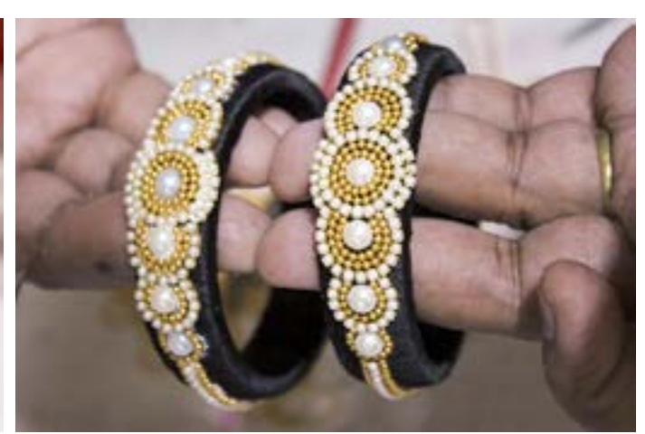
Pair of bangles with pearls.