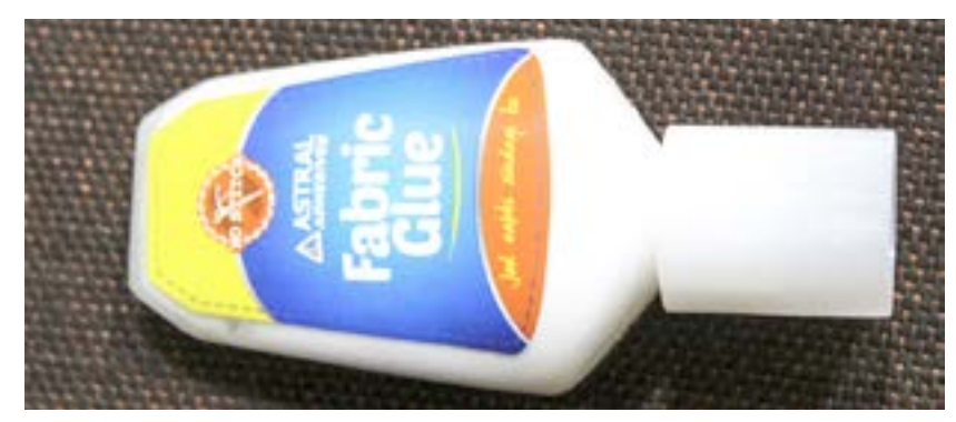
Fabric glue is used to stick the threads and beads together.