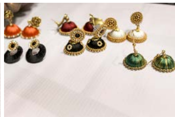
Various types of ear hangings, that suit different types of traditional attire.