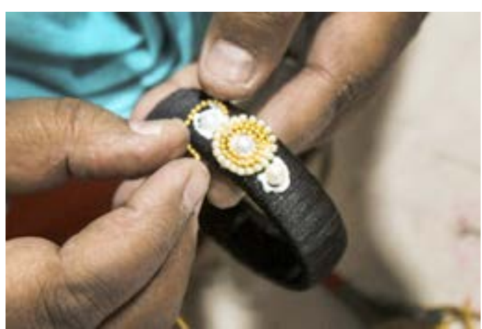
The bangle is decorated using various floral patterns and designs.