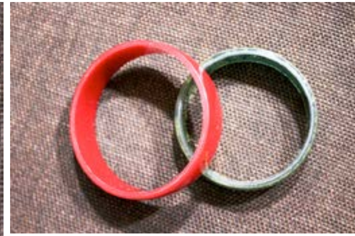
Old plastic bangles used to make refurbished bangles with a new look.