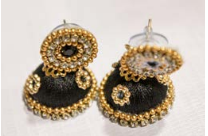
Hanging jhumka with stone designs.