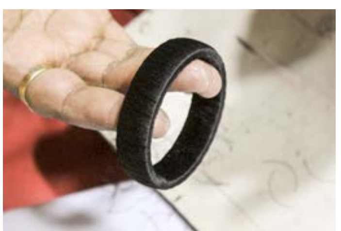
Showing threads strip bangle.