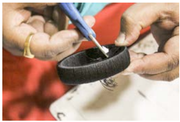
Artisan applying glue, so that the thread and bangle adhere well.