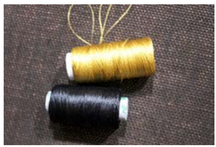
Coloured threads, which are wound around the bangles and beads to prepare jewels.