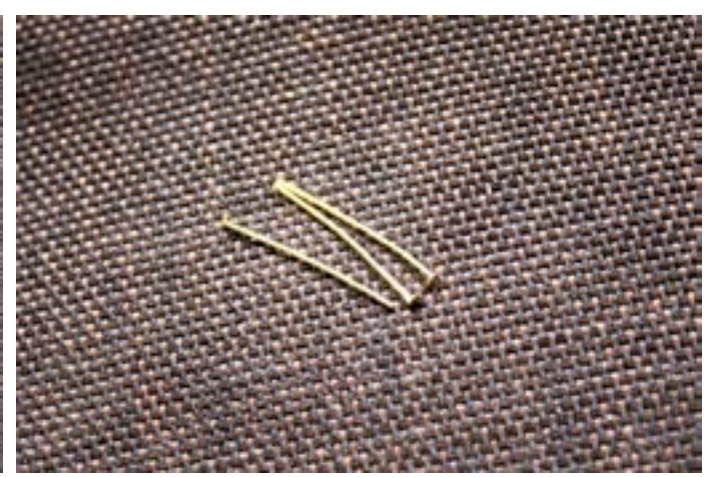
Pliers: It is used to hold and bend brass pins necessary in the making.