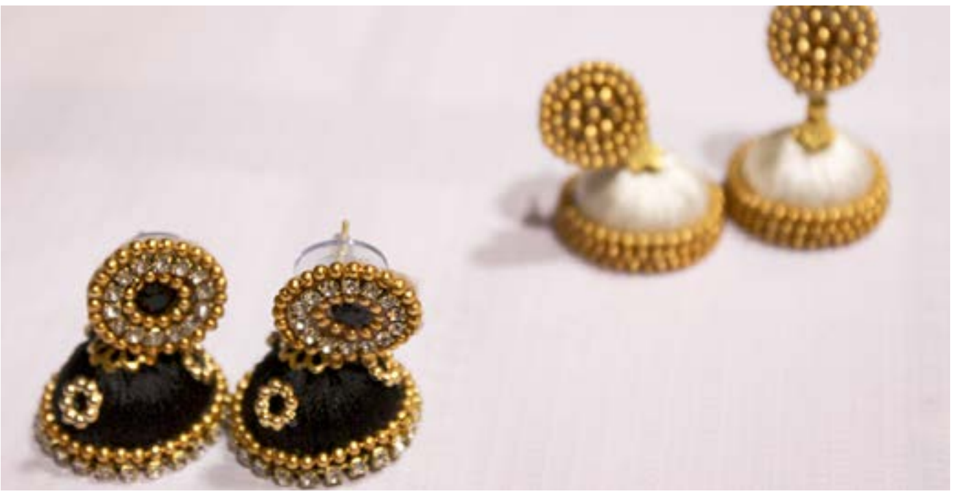
Beautiful hanging thread jhumka.