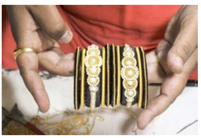
Bright coloured bangles.

Various types of thread earrings and bangles coming in different colours are created to suit different functions and attires. The price range of the thread jewelry starts from INR 200 and goes up to INR 1000.