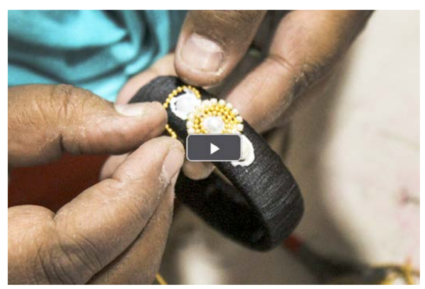
Silk Thread Jewelry - Ahmednagar