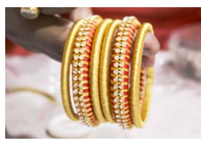
Bright colored thread bangles.