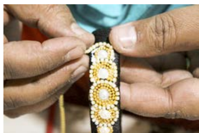
The bangle is decorated using various designs.