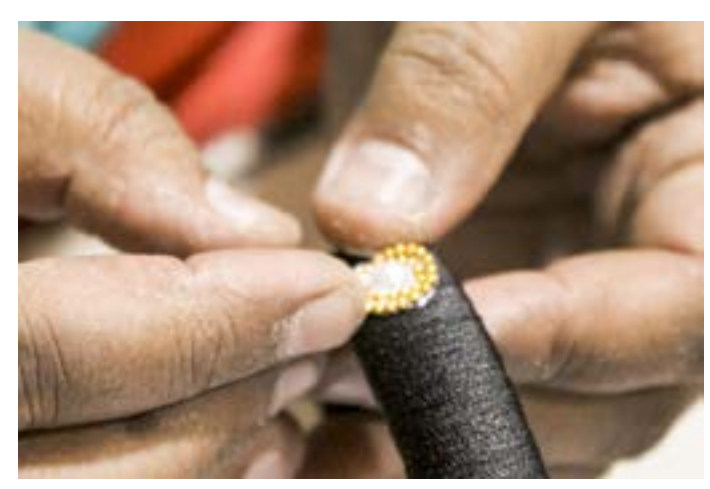
Artisan attaching floral designs over the threaded bangle.