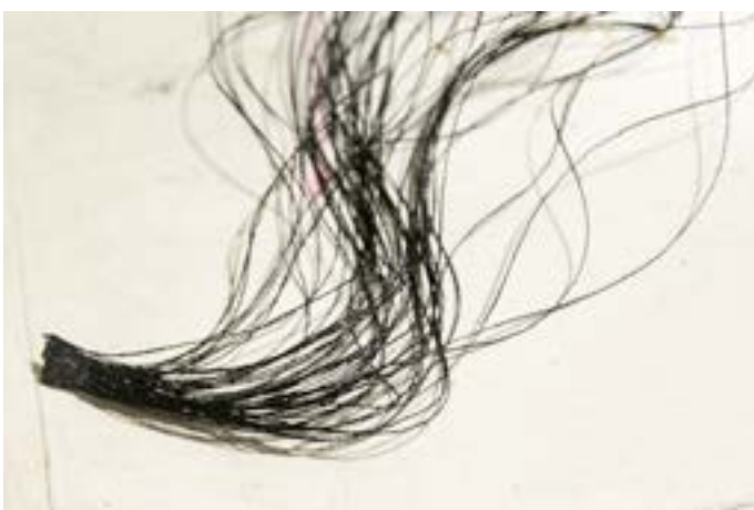
The required size of the colour thread.