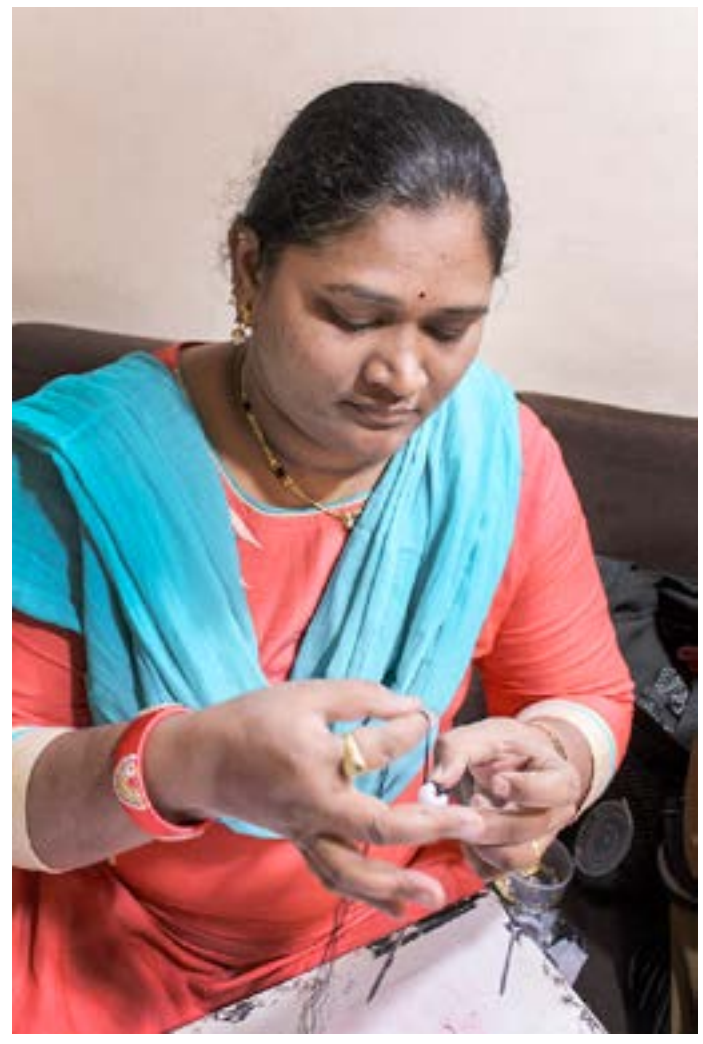
Artisan working on thread jewelry.