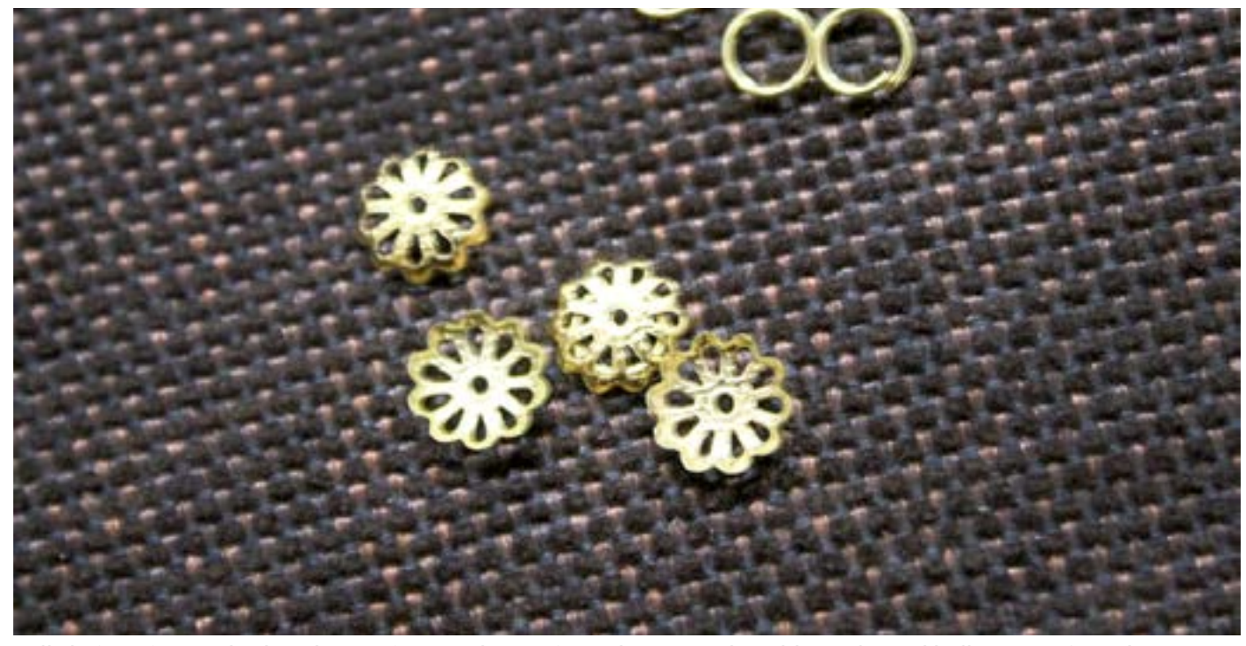
Ball chain: It is attached to the earrings as decoration, where mostly golden coloured balls are preferred.