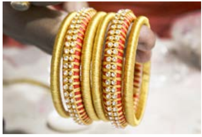
Golden thread bangles with stone chain decoration.