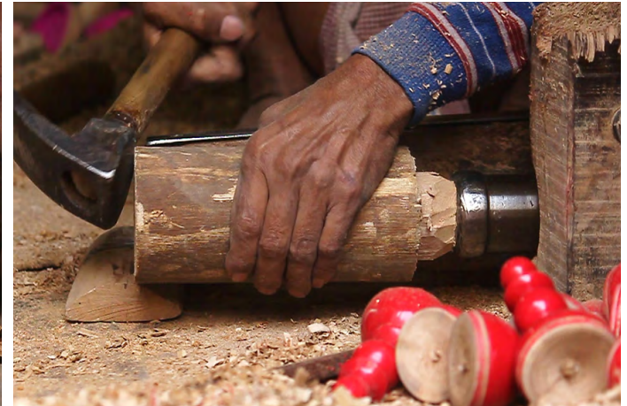
Fixing wooden block in chuck.