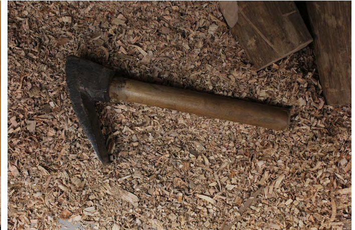
Bosuli is used for peeling wooden blocks.