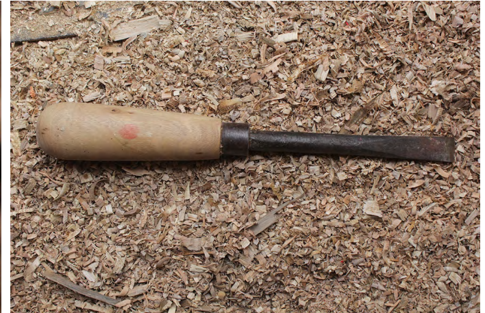
Chaudhara is used for external carving.