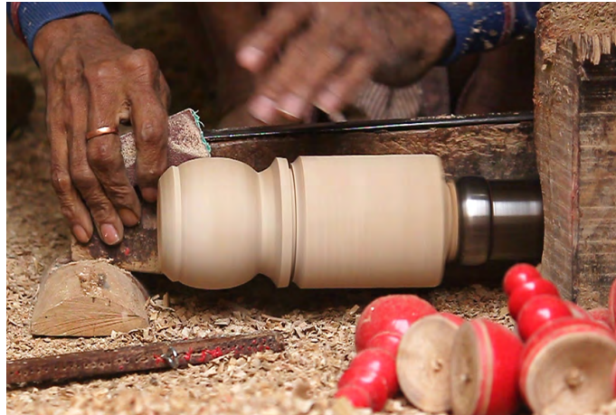
Sanding to get smooth surface.