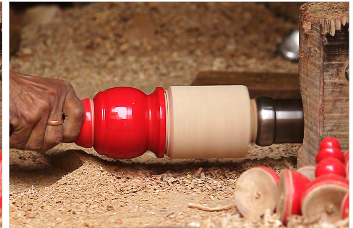
Putting a cap.