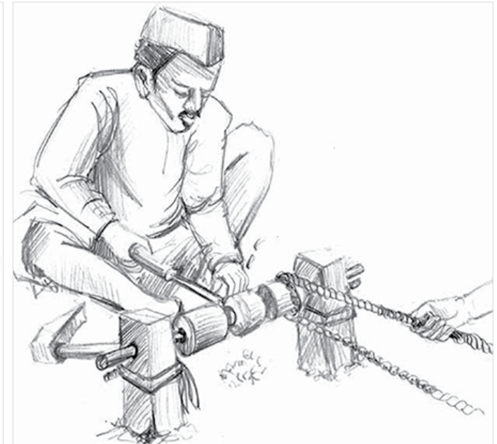
Craftsman working on lathe.