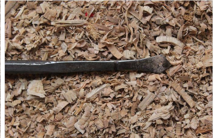
Barma is used for making a hole.