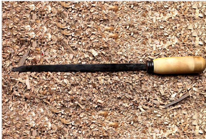
Battali is used for cutting and separating work from the wooden block.