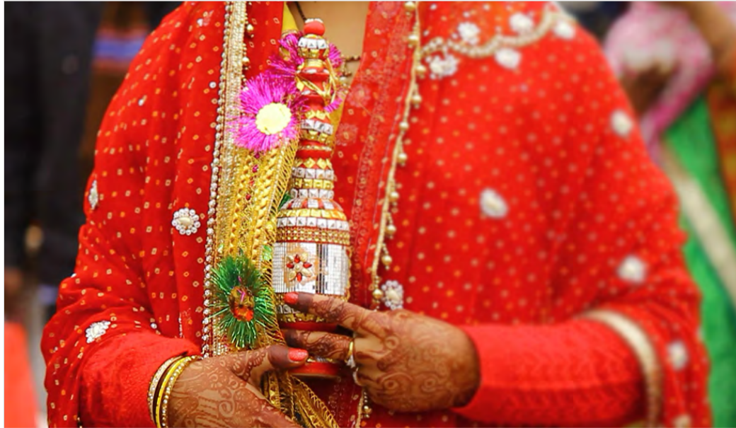
Newly wed bride with Sindoor.

https://dsource.in/resource/sindoor/types-sindoor