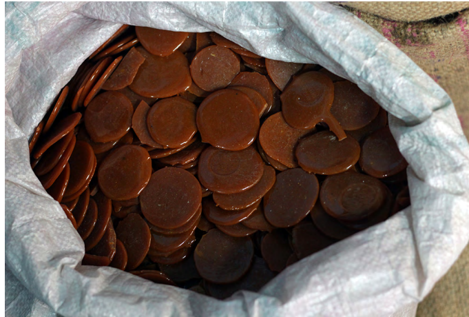
Lacquer is glue that is directly obtained from the trees.