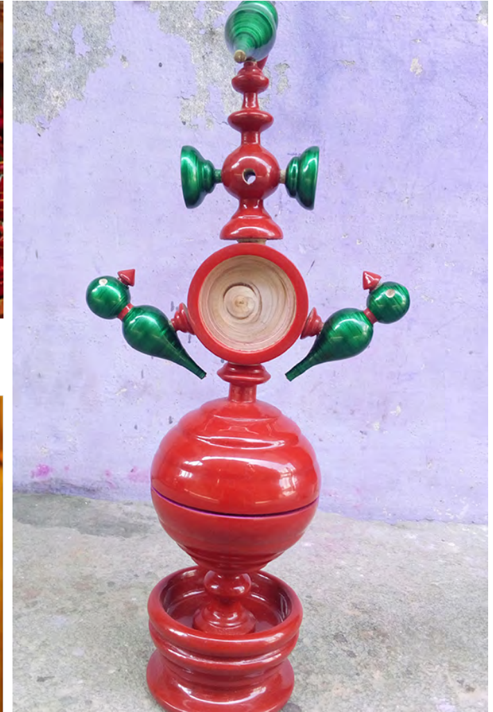
Sugga (parrot) Sindoora.