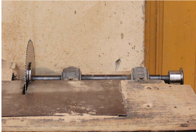
Aara (saw) is used for cutting down raw material into small pieces.