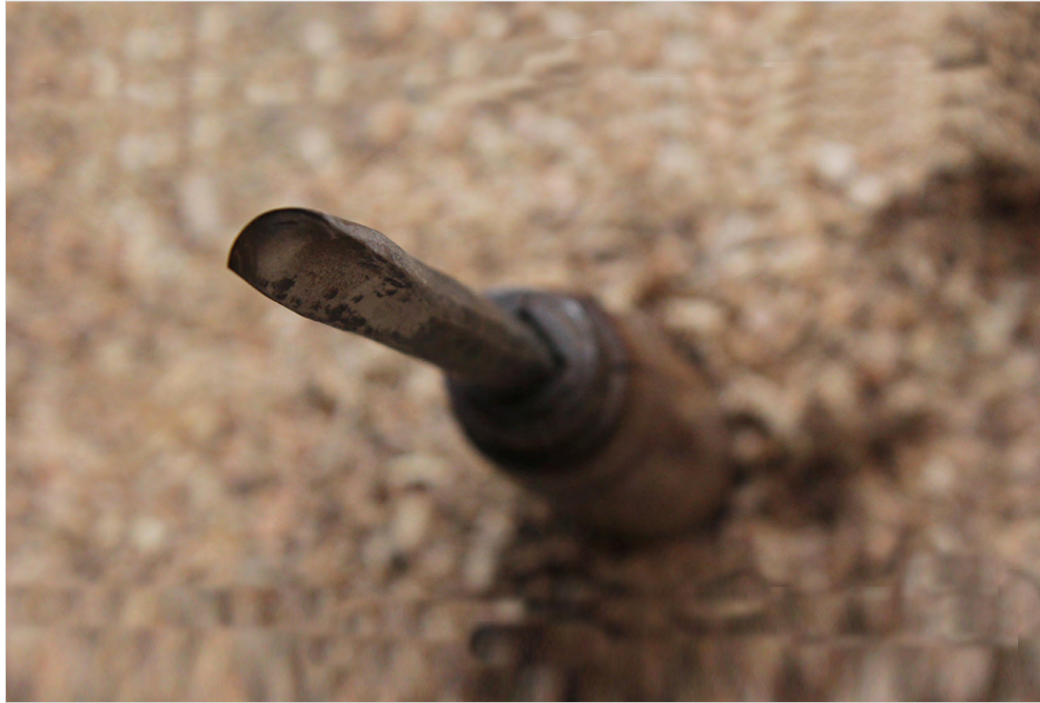
Broad Rukhani is used for carving design.