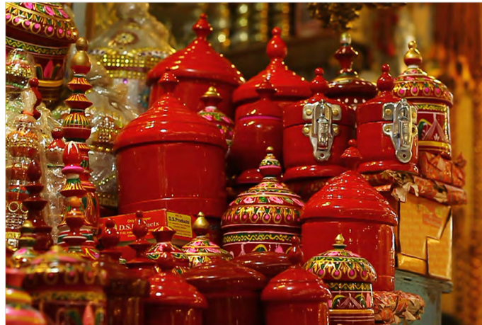
Temple shape Sindooras.