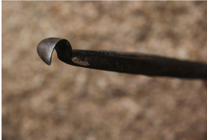
Banki is used for carving the inner part of Sindoora.