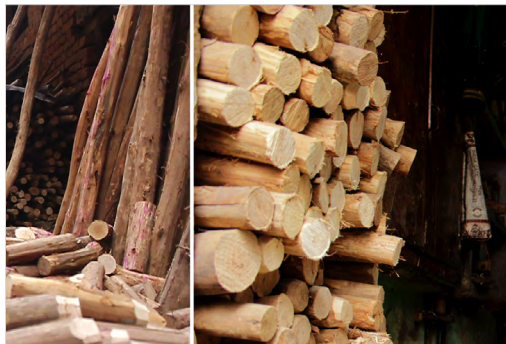
Sheesham/Eucalyptus wood a basic raw material to make Sindooras.