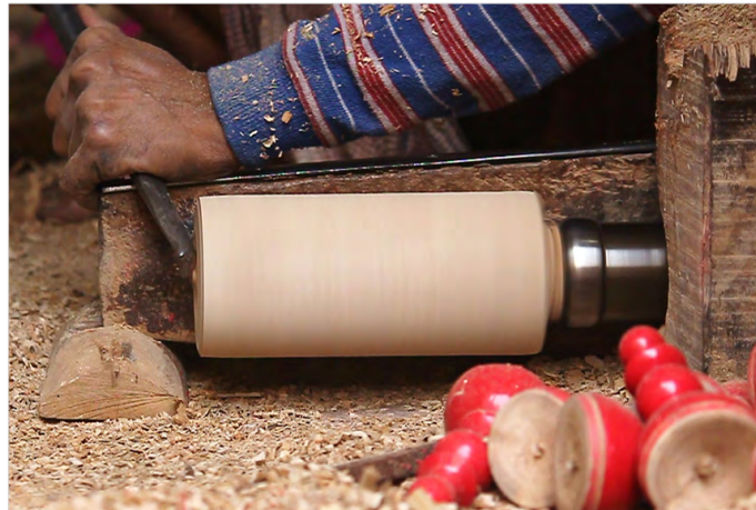
Making cylinder Shape.