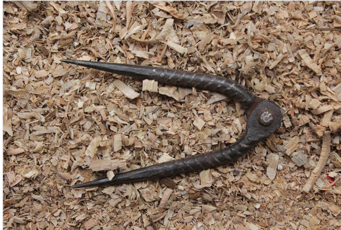
Compass is used for measurement.