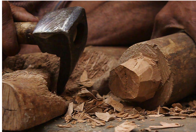
Peeling one side of wooden piece to make it fit for chuck.