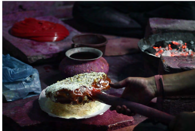
Resin is used to melt lacquer quickly.