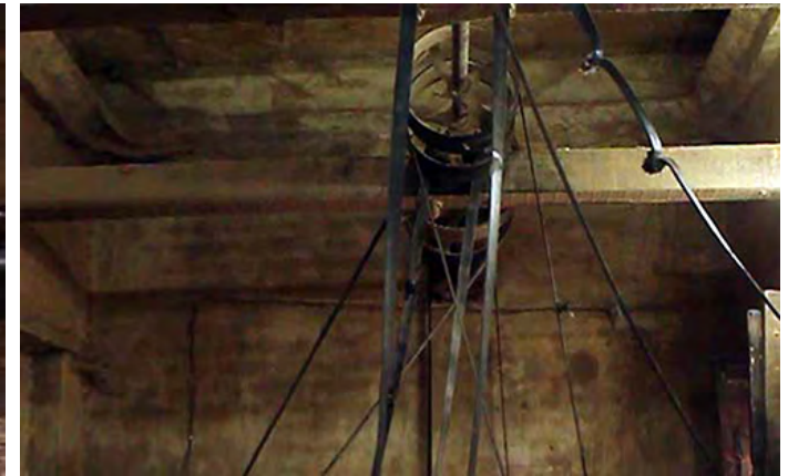
Set of Wheels with Straps.