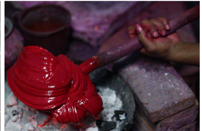
Melted Lacquer with color.