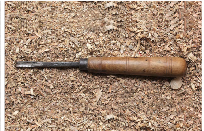
Small Rukhani is used for carving design.