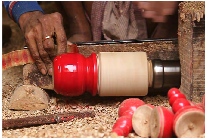
Rubbing with local material to shine the product.