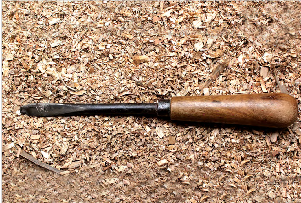
Triphala is used for fine carving. It has three sharp edges.