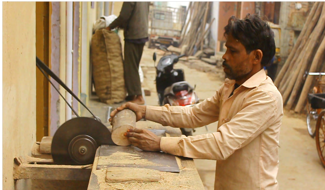
Cutting wooden log in small pieces.

Usually, Sindoora is made in two parts– cap and body. To make Sindoora, small wood blocks are cut from the log using an Aara machine (saw) then a carver would peel one side of the block to make it fit for the chuck of the turning machine or lathe. After this, the craftsman peels off the outer rough skin with the help of some set of tools to give it a cylindrical shape. This shape is further used to give the required shape for the Sindoora Vessel. After this, the application of colored shellac (lacquer) on work is done on the lathe only. While the lathe keeps revolving, the heat generated by friction softens the shellac, making the color stick to the surface of the work. Then they shine the color by rubbing a local material like the peel of bamboo.