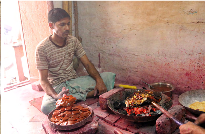
Lacquer is melted using burning coal.