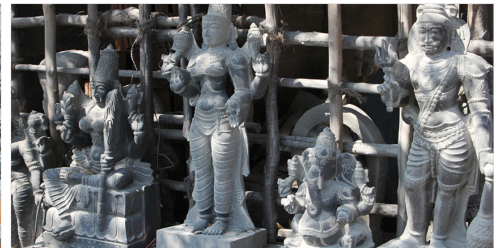
Idols of deities in different poses.