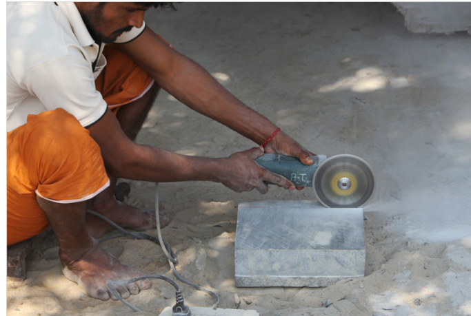
Automated cutting tool used to cut the granite stone evenly.

https://dsource.in/resource/stone-carving-mahabalipuram/tools-and-raw-materials