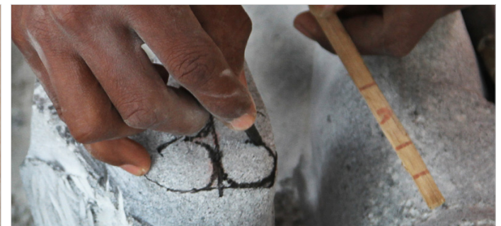
The design is being marked on the flat surface of granite stone.