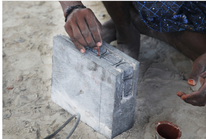
Marked design is highlighted with red oxide solution.