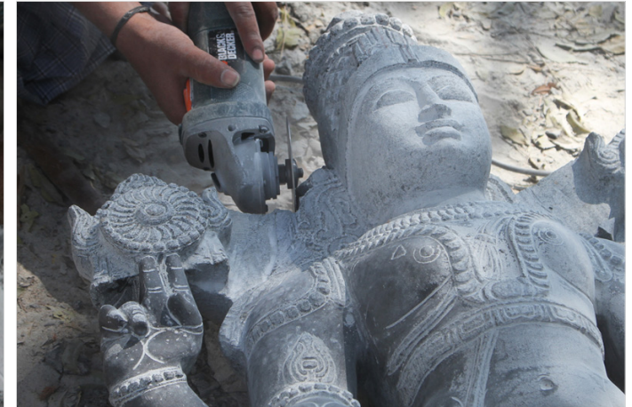
Different types of sharp edged disk blades used to carve sophisticated designs.