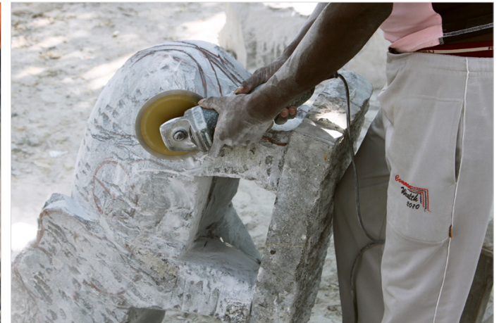
The outer surface is smoothed after rough carving.