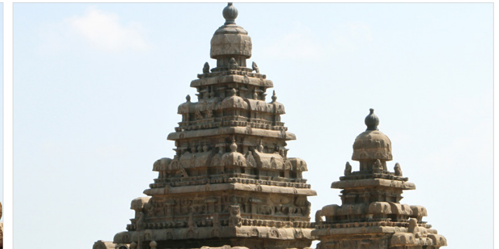
Unique carving can be seen on the towers of shore temple.