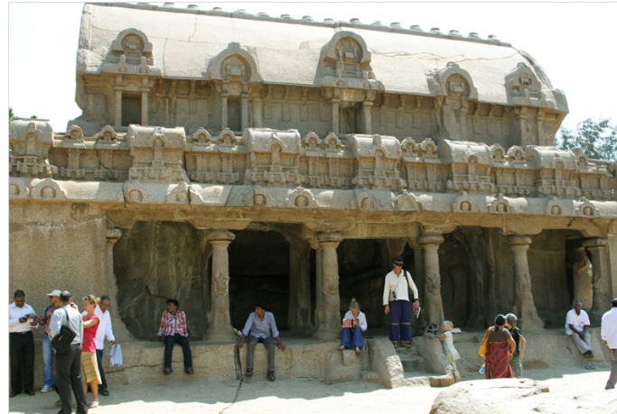
Bhima ratha which is placed next to Dharma raja chariot.

https://dsource.in/resource/stone-carving-mahabalipuram/history-monuments