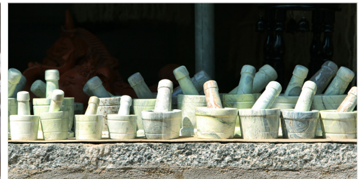
Stone grinders are kept for marketing.