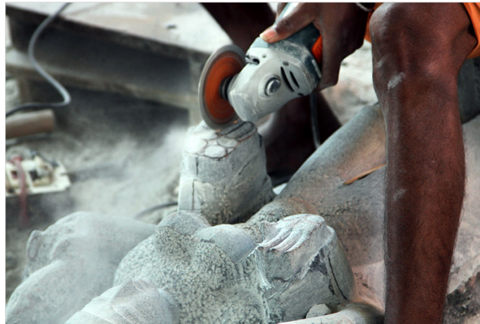
A detail of hand is being carved with power tool.