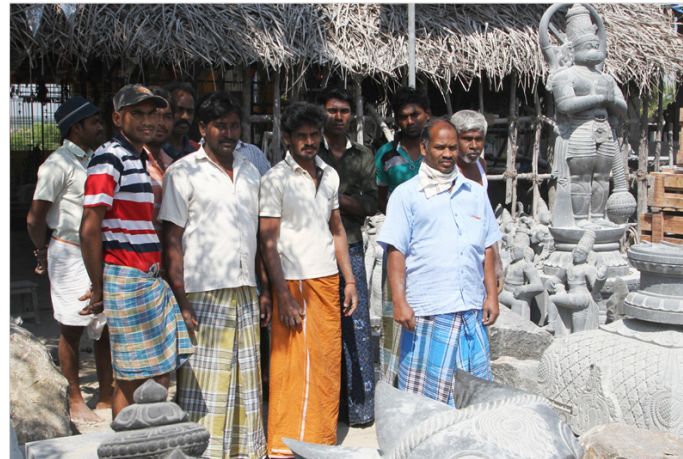
Artisans with their finished products.