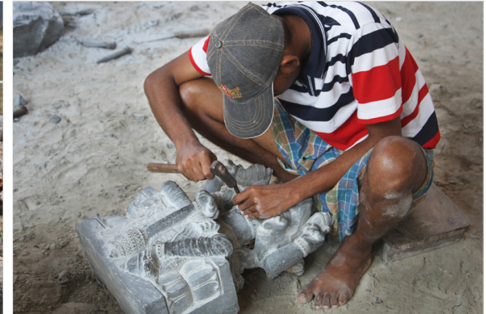
Keen interest required to achieve accurate carving.