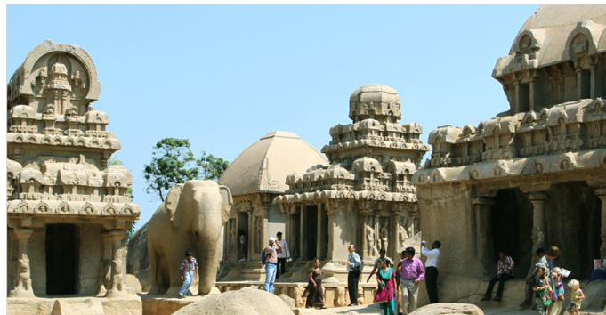
The five monolithic ‘Pancha Rathas’-five chariots.