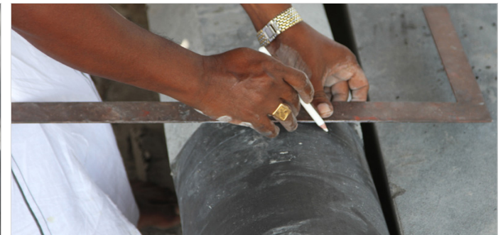
Stone is marked as per the required measurements.