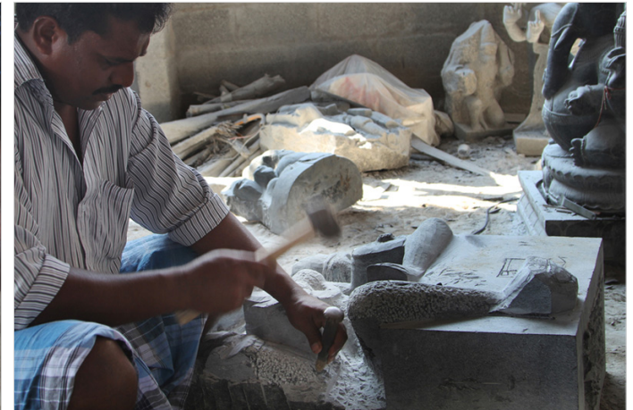
Artisan initiated the carving as per the marked design.