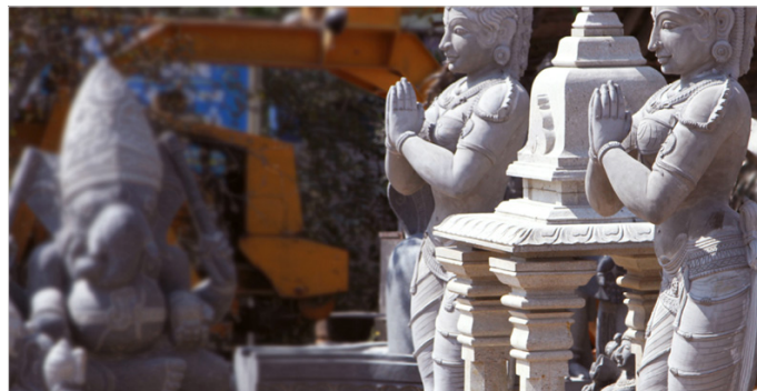
Welcoming idols are mainly used at entrance of the temples to greet the devotees.