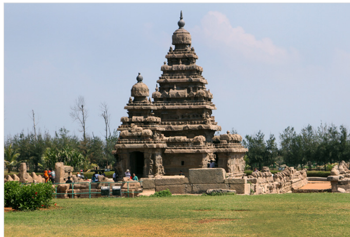
The famous historical Shore Temple of Mahabalipuram - one of “seven Pagodas”.

The stone carving is also practiced in other parts of Tamilnadu like Mylaudy, Suchindram from Kanyakumari district and in Madurai district. Stone sculptures, small dolls, images of animals, agarbatti-incense stands and other decorative pieces are carved using soap stone, green stone, soft granite, Bijri stone, durki stone and marble.