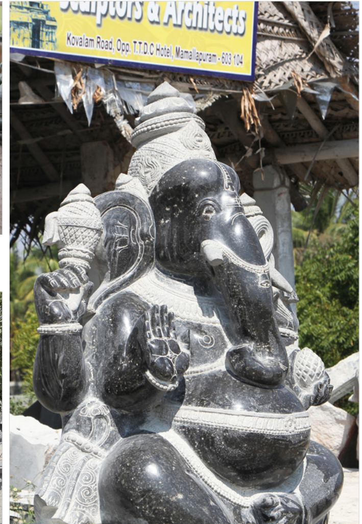
Polished idol of lord Vinayaka with detailed ornamentation.