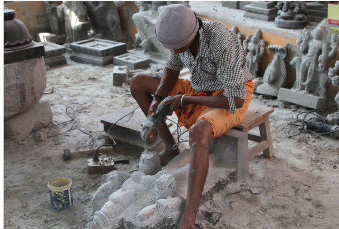
Skilled craftsman giving shape to the stone.