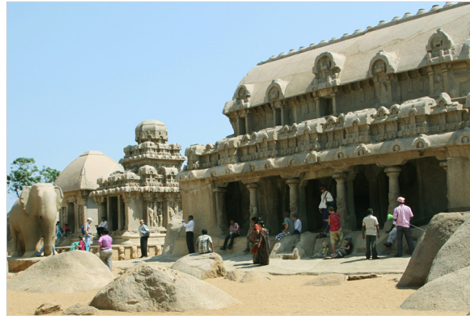
Historical monuments of Mahabalipuram.

https://dsource.in/resource/stone-carving-mahabalipuram/introduction