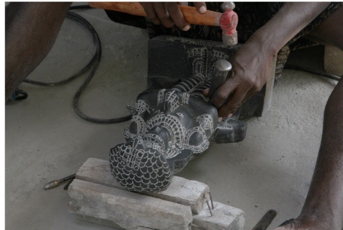
Chisel and hammer plays major role while carving the stone.