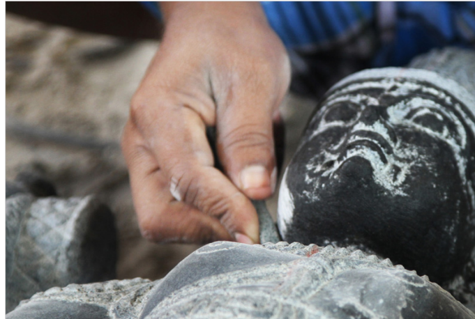
Sand stone is rubbed on the surface of idol to obtain smooth surface.

https://dsource.in/resource/stone-carving-mahabalipuram/making-process