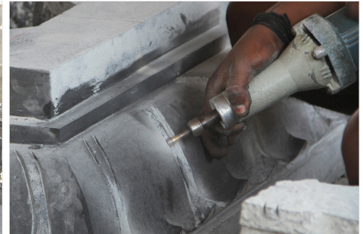
Artisan engaged in carving leaf motif.