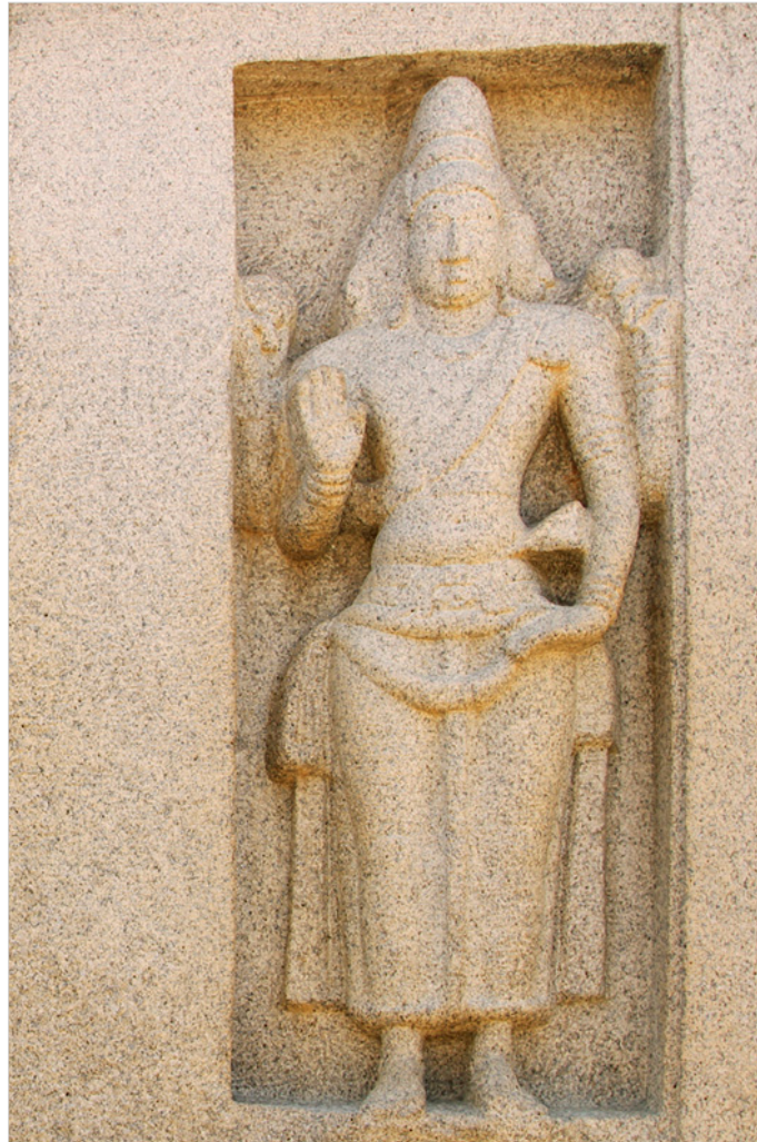
Figures of deities are carved on the walls of Rathas.