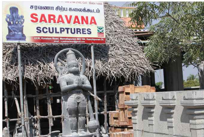
Carved Idol of Lord Hanuman.