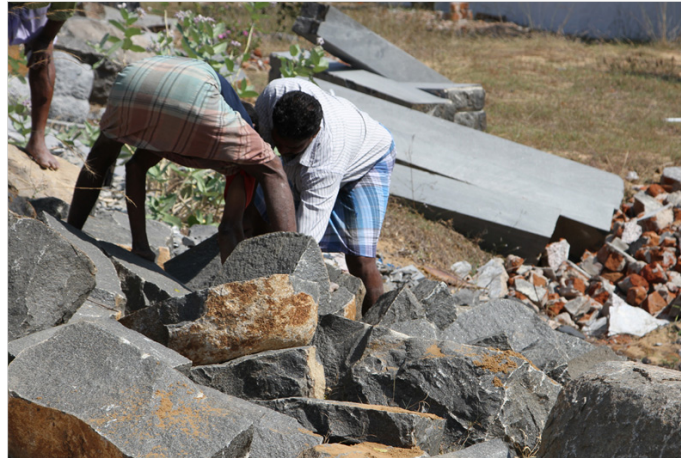
Craftsmen engaged in carrying a piece of Granite stone for design work.

https://dsource.in/resource/stone-carving-mahabalipuram/introduction