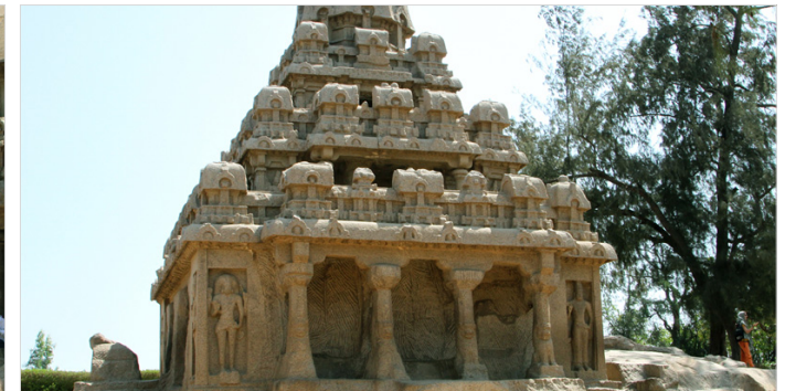
Dharma raja Ratha dedicated to Dharma Raya-one of five Rathas is tallest among all.