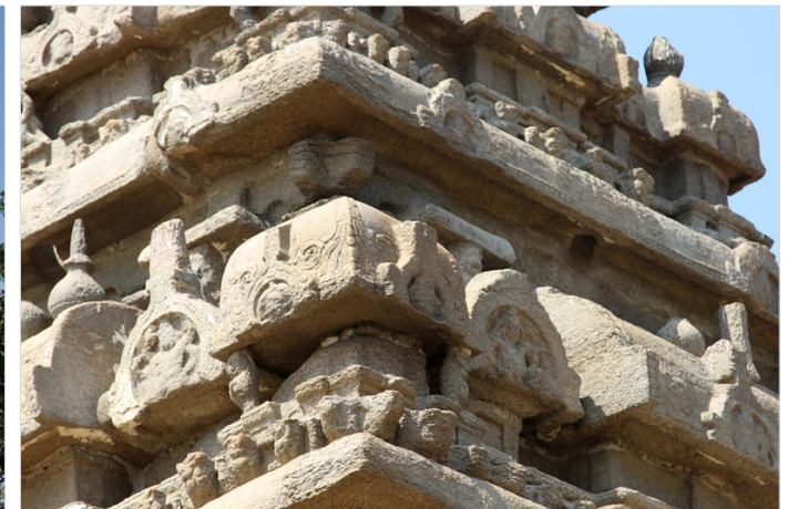
The closer view of sculptures adorning towers of shore temple.