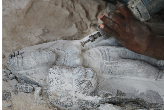
Depth is obtained by minute and detailed carvings.

https://dsource.in/resource/stone-carving-mahabalipuram/making-process