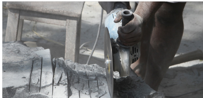
The big block of stone is first cut evenly.

The artisan first decides the required design to be carved from the stone. The block of the stone is first cut into appropriate size. A stone of desired shape is taken and leveled with a chisel called 'Palamunai uli' locally. Then the dimensions of the figure are marked with red oxide solution on the slab. The unwanted edges are removed by chiseling with chisel and hammer. Rough carving is made based on the rough sketches on the surface of the stone. The major carvings are done using the chisel and hammer to attain the desired figure. Water is sprinkled frequently to avoid heat generation during carving process. After rough carving, the detailing and minor carvings are made using sharp edged and pointed chisels. The ornamentation and the detailing design are done by scraping the stone with pointed chisels. Once the product is ready, the surface of the stone is polished by rubbing it with sandpaper. The carved stone is then treated with water and chemical. This is done to smoothen and whiten the stone. Sometimes oil is also applied to obtain the typical dark color for selected products according to the requirement.