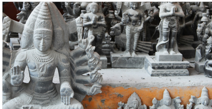
Idol of goddesses carved to cater the surrounding temples.

The magnificent sculptures portray the expertise craftsmanship and also the stone carving history of Mahabalipuram. Every aspect of stone carving is highly attention paid and artistic based. The basic stone is transformed into legendary pieces with elaborated ornament work and detailed facial expressions which gives life to the stone. Few art pieces and lamp shades are interestingly made of stone with Jaali work.