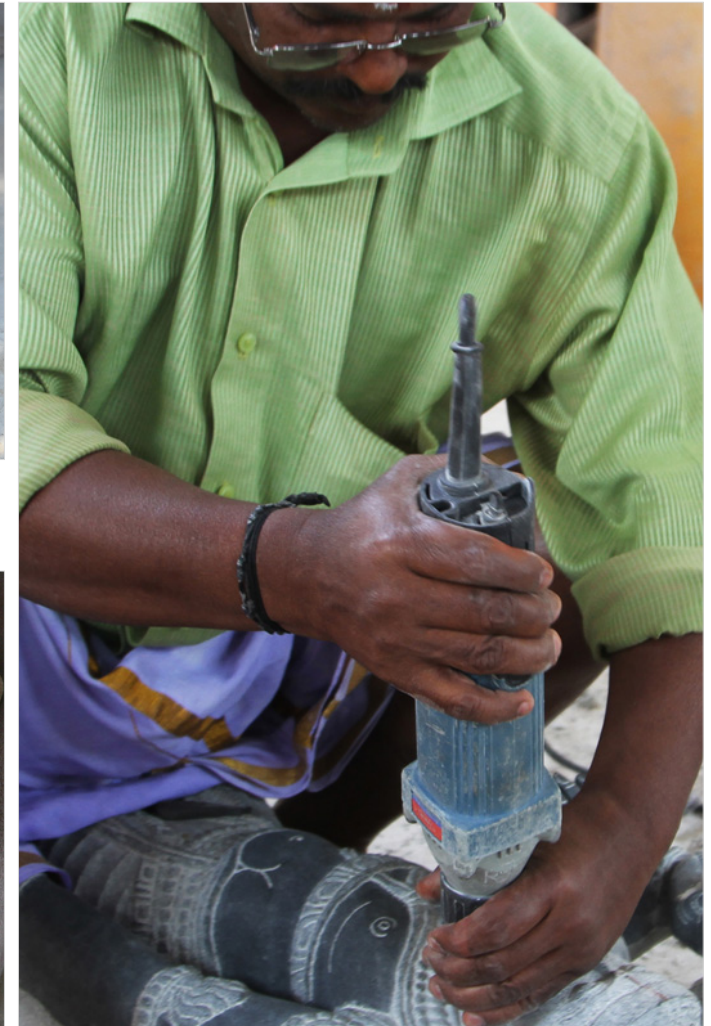
Another automated tool used to obtain sharp/polished facial expressions of an idol.