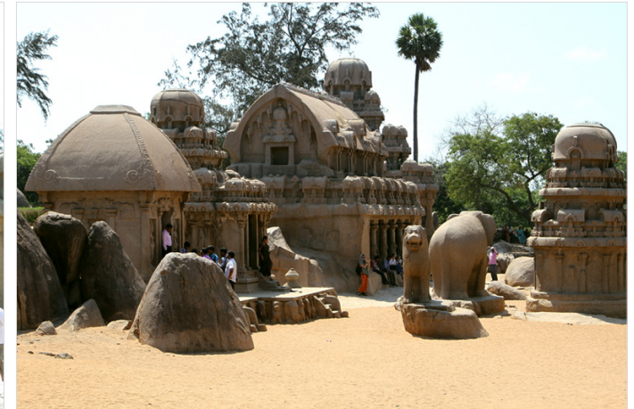
An elephant and lion sculptures placed very next to Nakula-Sahadeva ratha.