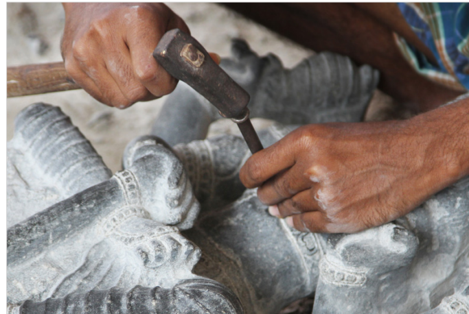
Few other embellishments are made by chiseling.