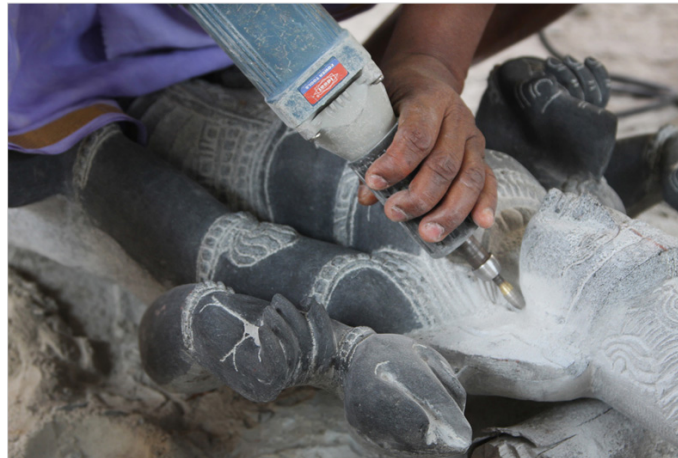
The edges are sharpened to get fine finishing.