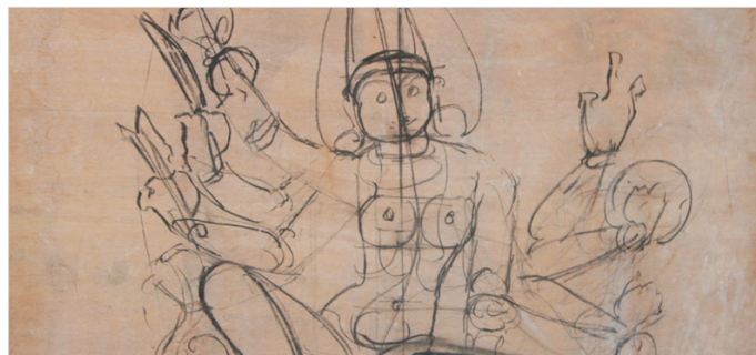
Reference sketch is made before carving.