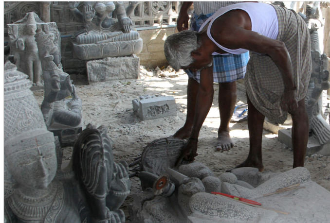
Work environment at artisans place.