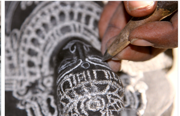
Sharp point edged chisel helps to achieve beautiful facial expressions.