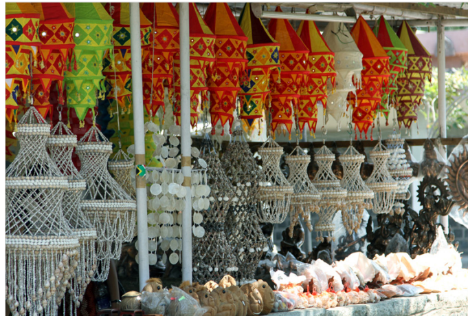
Decorative granite statues and shell products at market place attract visitors.