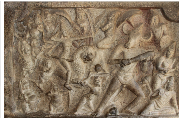
An episode from Hindu mythological epic is carved on stone wall of temple.