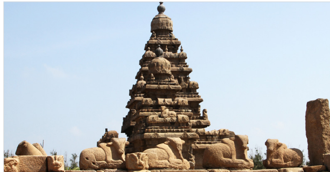
Ancient Shore temple at Mahabalipuram.

The antique stone architecture of Mahabalipuram talks about the stone carving history of Mahabalipuram. The fascinating towers of famous “Shore temple” which is one of the “Seven pagodas” were constructed by King Narasimha Varman in 18th century during Pallava period. The five monolithic Rathas (chariots) are carved in granite and can be seen in pyramidal structures and are named as Dharma raja Ratha, Bhima Ratha, Arjuna Ratha, Draupadi Ratha, Nakul Sahadev Ratha. These Rathas are carved from one single piece of stone which is an interesting attribute. The world famous Arjuna’s Penance which is an episode from Hindu epic Mahabharata is excellently composed with great passion to represent classical essence. Dharma raja Ratha with its highly skilled carvings involves complicated decorative forms. The monolithic rock-cut architecture of Varaha cave temple is a testimony to creative imagination. All these monuments are the outstanding examples of Pallavas art and architecture and remarkable in Indian cultural heritage.