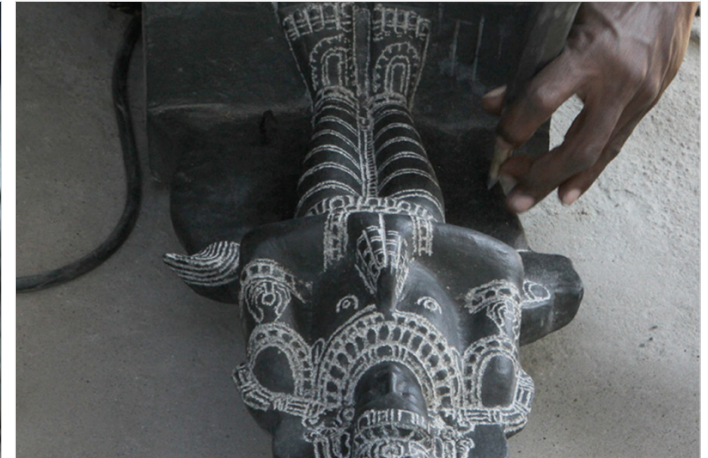
The idol is washed and coated with oil to get glossy look.