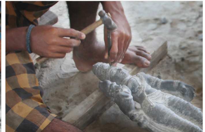
Idol is now ready for polishing.