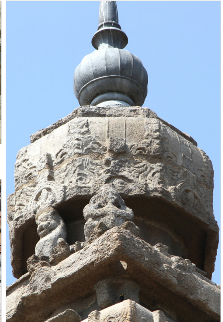
Closer view of tower of Shore temple.