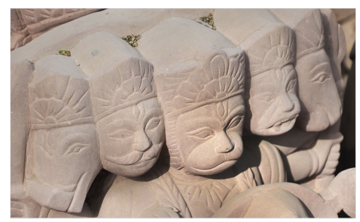
Idol of lord Hanuman carved in red stone.

Varanasi in Uttar Pradesh has very rich deposits of red stone. The experienced stone artisans of Varanasi have been doing stone carving since 50 years. The art has been carried from older generation to retain the tradition. Blocks of red stone is first cut and carved roughly. The detailing is obtained by fine carving. Highlighting facial expressions with artificial colors can be said as special feature in their carving. The stone artisans in Varanasi are called as Girharwal locally. Men involve in carving. Women help in polishing and washing the final idols. In Varanasi, there are nearly 20 to 30 families engaged in stone carving.