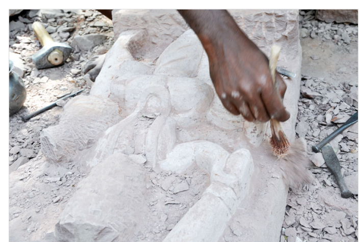
Cleaning the excess stone dust.