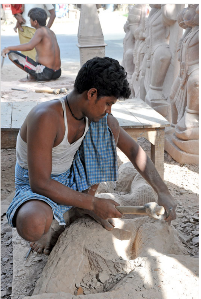
Stone carver involved in carving.