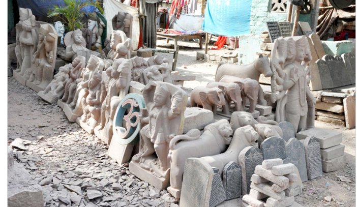
Displayed products at artisans place.