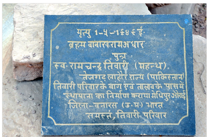
Carved letters on stone slab.