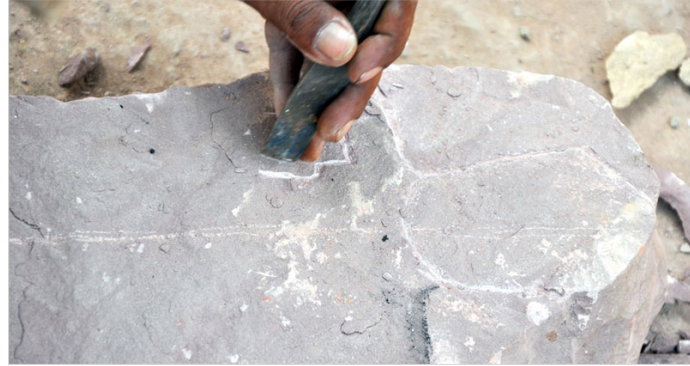
Carving initiated based on the traced lines.