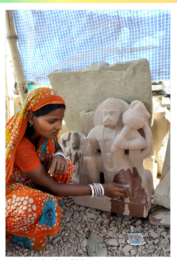
Women involved in polishing process.