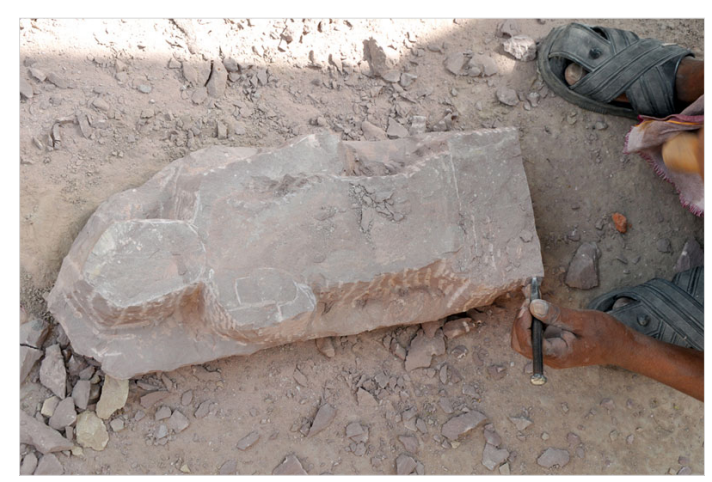
Roughly carved idol.