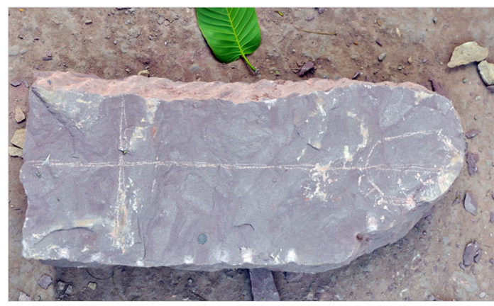
Red stone is the basic raw material.

Red, white and green are the types of stones used as basic raw materials available richly in surrounding places. The artisans of Varanasi procure stone from Chunar which is located 20km away from Varanasi. The references are marked on the stone using charcoal. Hammer locally called as Hatauda is used for hammering. Different types of chisels used for chiseling. Batti is the stone used for polishing after completion of carving. The divider Prakaar is used for scaling. The idol is washed with cold water after its completion. The idols are painted using artificial colors.