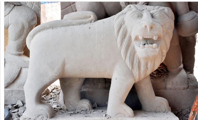
Replica of lion.