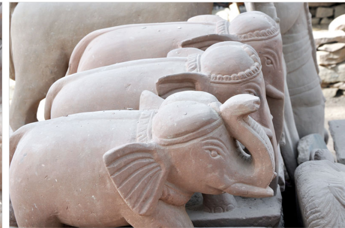
Carved idols of elephants.