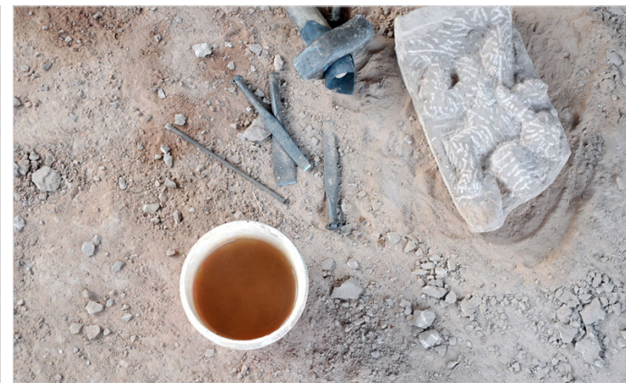
Water used to sprinkle on stone while carving.