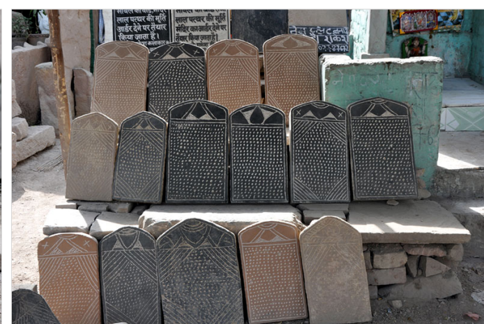
Sil-used for grinding purpose. Miniature temple.