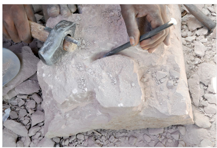
Shapes obtained through the process of hammering and chiseling.