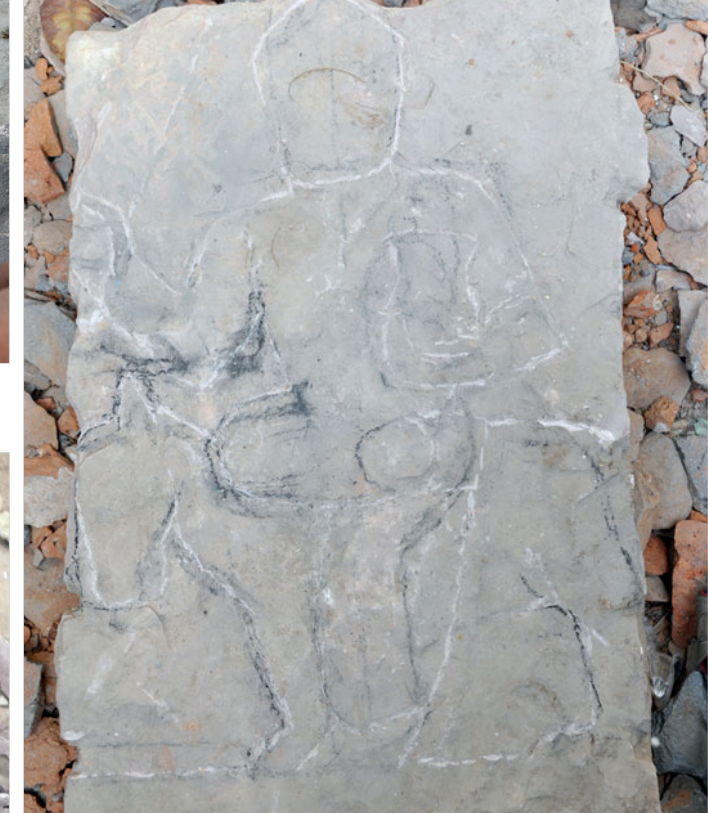
Rough design is sketched on stone.