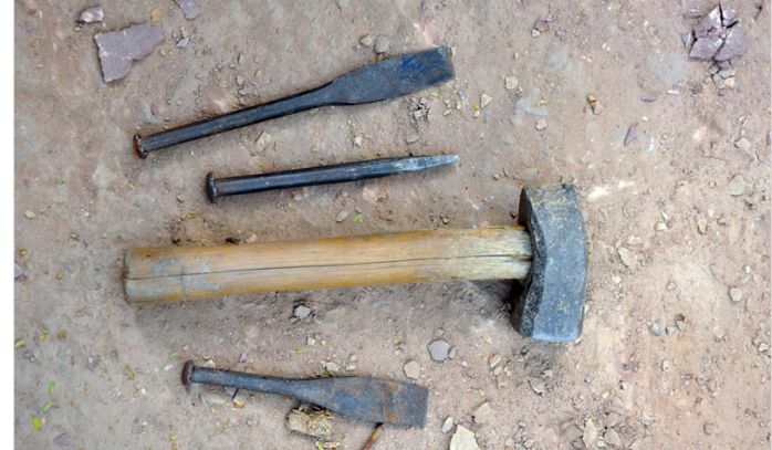
Hammer and chisels are the main tools used in stone carving.