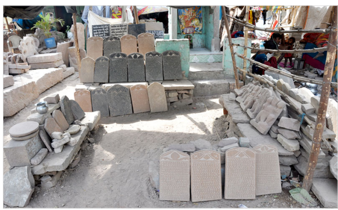
Carved stone slabs.