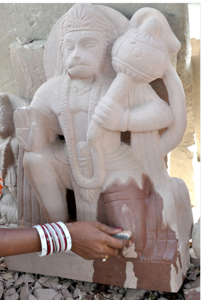
Smoothening the rough surface using Batti- a type of stone.