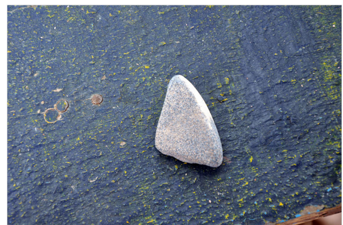
Rough stone used to smoothen the stone surface.