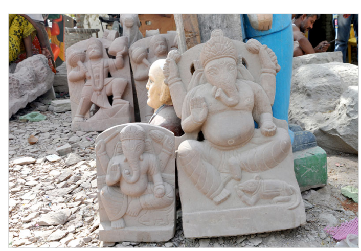
Ganesha idols made for temples.