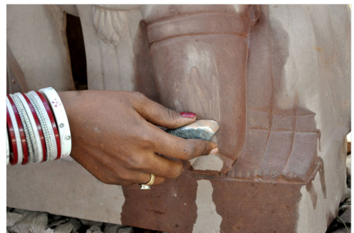
The closer view of smoothening process.