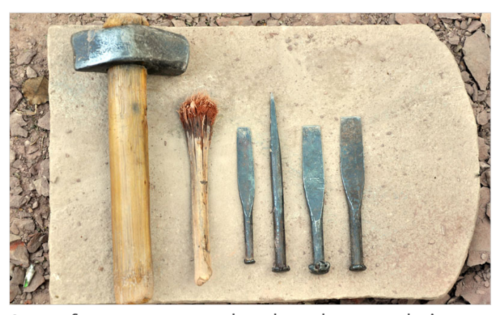
Stem of coconut tree used to clean the stone during carving.