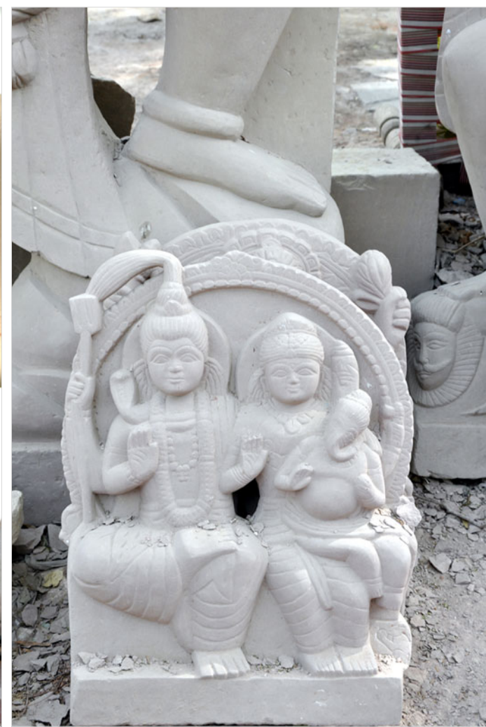
The finished product of deities.