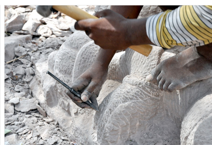
Artisan giving rough detailing on the stone statue.