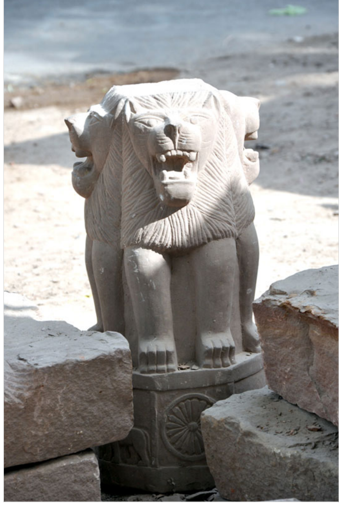
Replica of Four-headed loin emblem.