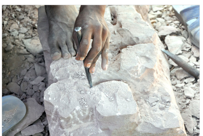
Major carving is done using large chisels.