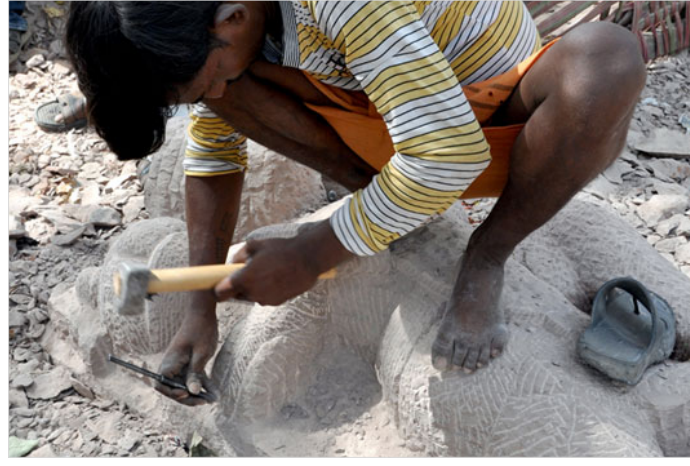
Skilled carver involved in detailing out the shape.