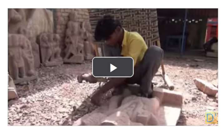
Stone Carving Varanasi