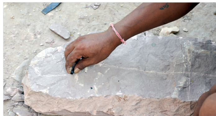
The design to be carved is being sketched on the stone by the artisan in the beginning stage.

The production process involves stages like stone cutting, sketching the design on it, carving and finishing the product. The making process starts by selecting fine quality stone. The big blocks are first roughly cut into shape according to the planned idol to be carved. The proportions are marked on the stone using charcoal and then the extra portion is taken out by hammering with hammer and chisel. The rough outlines of idol are drawn on the surface of the stone. Based on these rough sketches the major carvings are done by chiseling. Once rough details are carved, the detailing and ornamentations are carved using sharp-edged and pointed chisels. Finally the idol is smoothened and then polished by rubbing with stone called Batti locally. The polishing enhances the shine and luster of the article. The carved idol is washed with water and kept ready for the marketing. The quality of carving varies according to the requirement and the price as well. The idols are painted colorfully as per the client requirement.