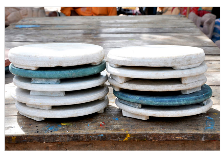
Chakla – a circular stone slab to make roti.