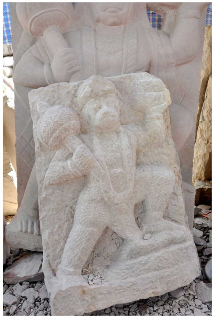
The carved idol is ready for smoothening.