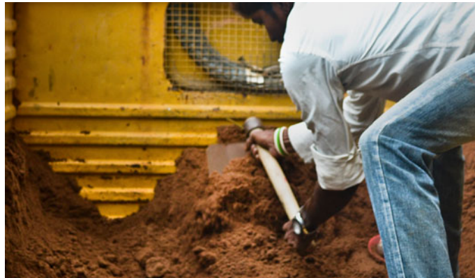
Clay is the basic raw material used for idol making.

The clay used for pottery is usually found on the riverbed. The clay found here is black in color, which is why Vellore pottery is famous as Black Pottery. The dough clay is the mixture 1:3 quantity of mud and clay. One fourth of mud and three fourth of clay is filtered to separate out stones, mud lumps and other impurities. The filtered mud and clay is put together and water is sprinkled on it. The soaked clay and mud is put in a mixing machine where the mud and clay is finely mashed into a soft mixture of clay used for pottery. The machine is brought from Chennai. The process is continued three times to enhance the elasticity of the clay. The prepared dough is covered and stored to retain the moisture. The clay is now ready for idol and pottery making.