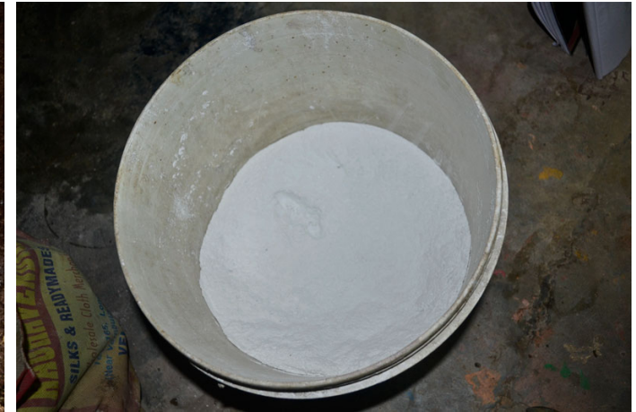
Plaster of Paris powder used to make the mould.