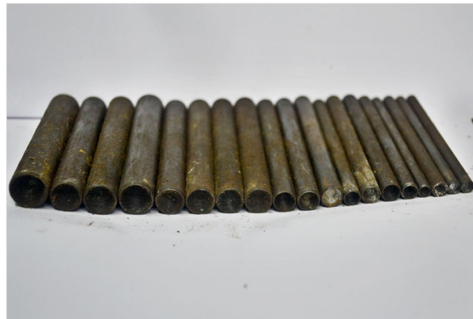
Tools used to engrave design on the clay.