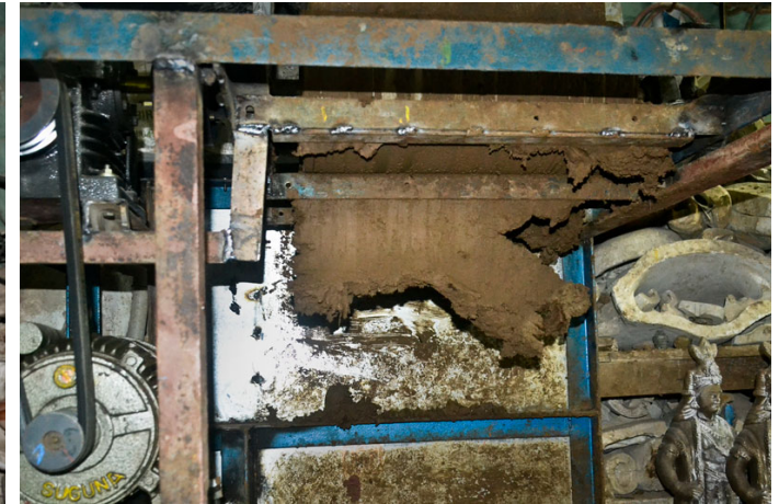
The machine smashes mixture turning it into a soft clay dough.