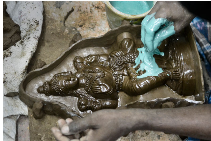
Artisan applies the casting paste on the idol.