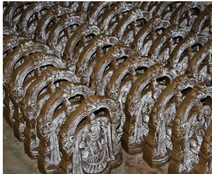
Number of clay idols made and kept for drying.

The work is mostly done by male artisans. The craftsmen experiment with many designs according to the changes in the generation. Some particular products are made during special occasions and festivals. The skilled artisans handling the clay give a variety of shapes to the product according to their imaginations. The clay craft has been a livelihood for many people in Tamil Nadu, which is a major source of income. The uniqueness of Vellore Terracotta is the products are made using black clay.