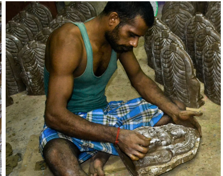
Artisan involved in removing the prepared clay idol from the mould.