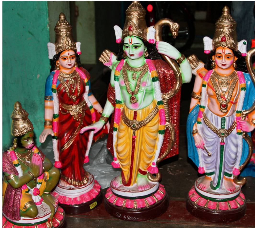
Colorful clay idols of lord Rama, Laxmana, Hanuman and Sita.

Clay figures or terracotta are made all over Tamil Nadu. The finest products of terracotta are made in Vellore such as idols, horses, diyas (clay lamps), and also house hold items. Large varieties of products are made colored using vibrant enamel paints to give glossier look to the products. The products are made according to the experience of the skilled artisans. The craft is practiced majorly by men artisans. The products are made according to the demand during special occasions and festivals. The idols have huge demand during Ganesh festival, Dussehra and Gowri Pooja.