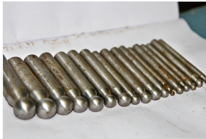
Different types of tools used in idol making.