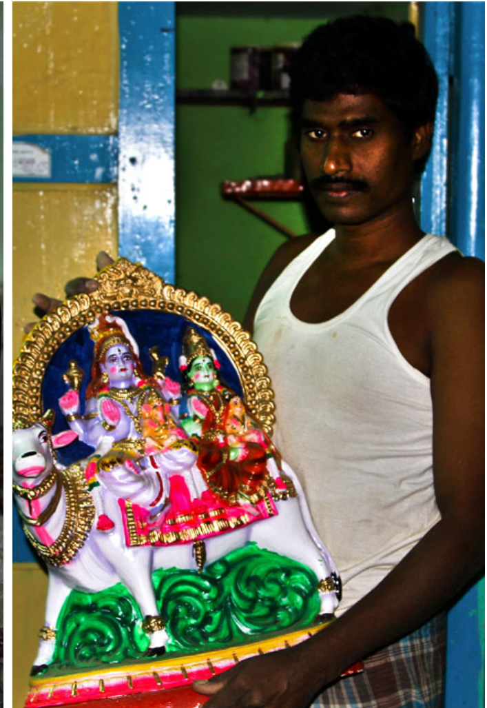
Image of the craftsman with his craft work.