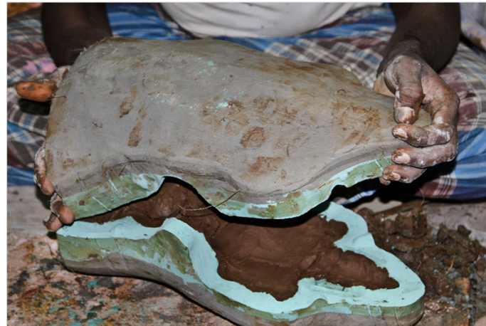
Once the mould is dried it is removed.