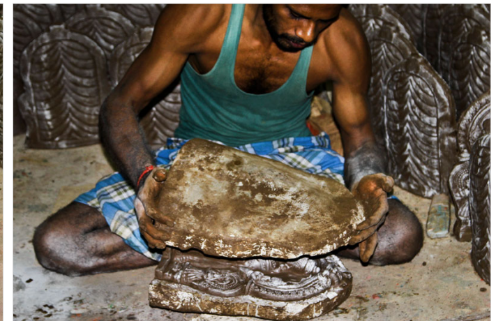
Artisan removes the prepared idol from the mould.