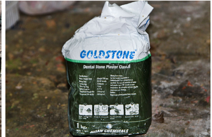
Dental casting powder used to make the mould.