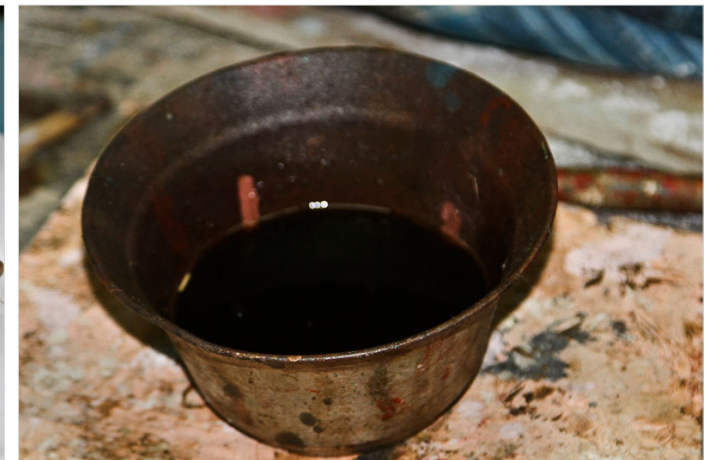
Solution of grease and kerosene is applied on the idol before putting the mould paste to avoid smudging of the design.