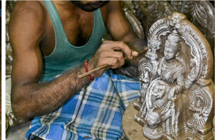
The prepared idol is checked for breakages and cracks.