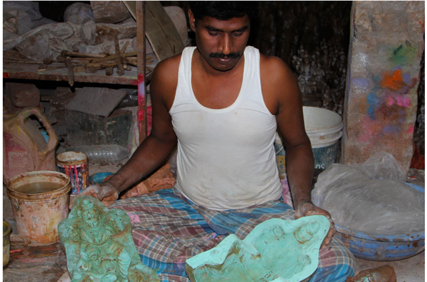
Prepared mould is kept to dry in the room temperature for a week.