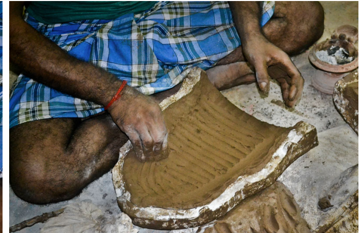
Artisan spreads the clay neatly and firmly to set it in the mould.