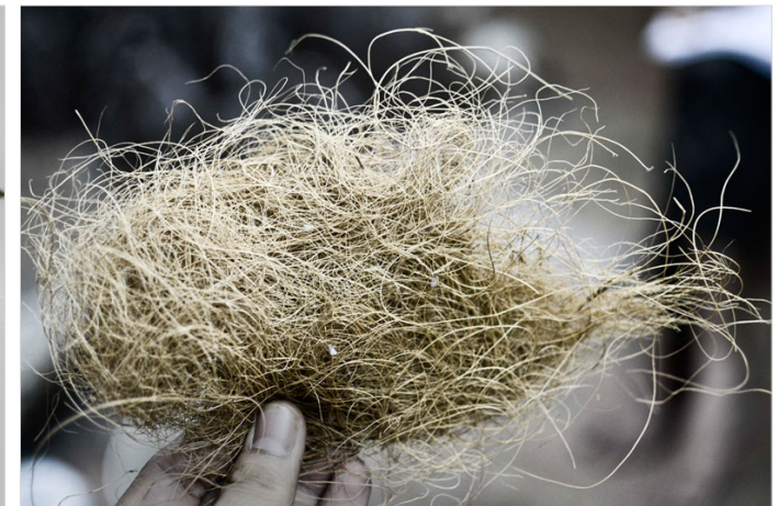
Coir used in mould making.