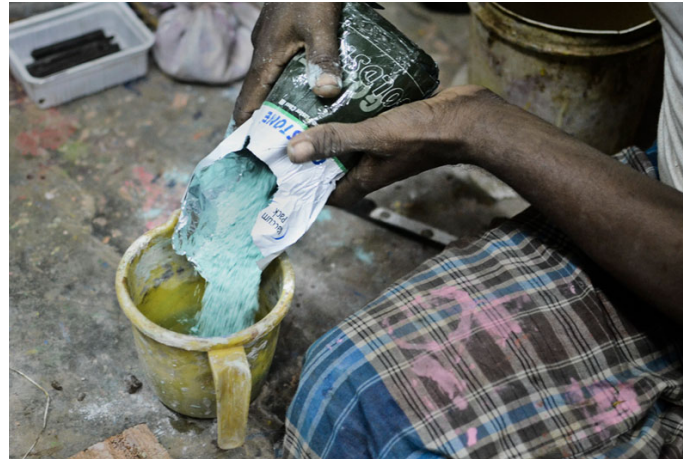
Solution of dental casting powder is prepared for the mould.

https://dsource.in/resource/terracotta-idols-vellore/making-process/mould-making