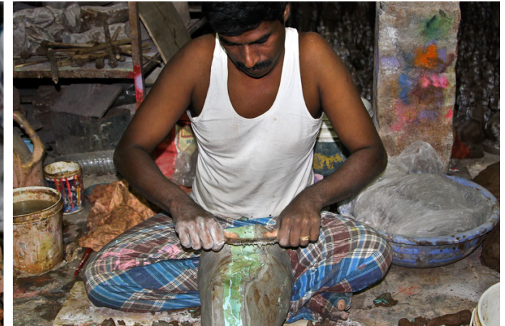
Excess material is scraped out.