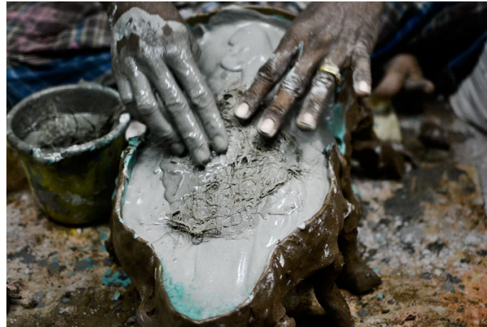
Same process of molding is repeated to prepare the other half of the mould.

https://dsource.in/resource/terracotta-idols-vellore/making-process/mould-making