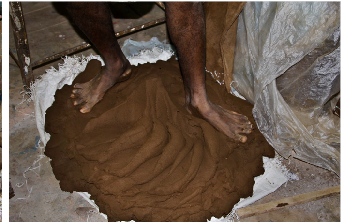
The clay is again kneaded finely with legs to enhance the elasticity of the clay and stored in room temperature.