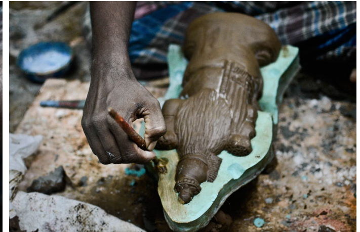
Soap is applied on the sides of the prepared mould to avoid sticking either sides of the mould.