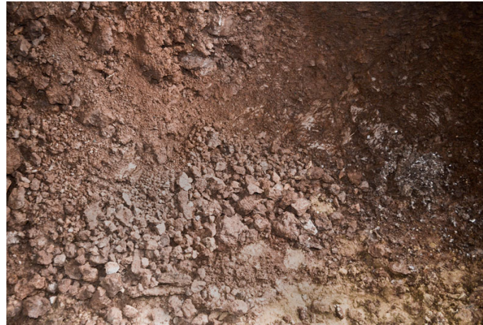
Basic material clay used to make clay idols.

https://dsource.in/resource/terracotta-idols-vellore/tools-and-raw-materials