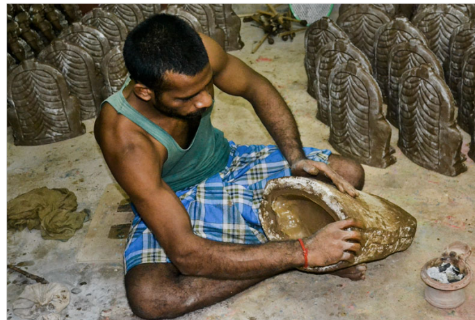
Base of idol is made hollow.