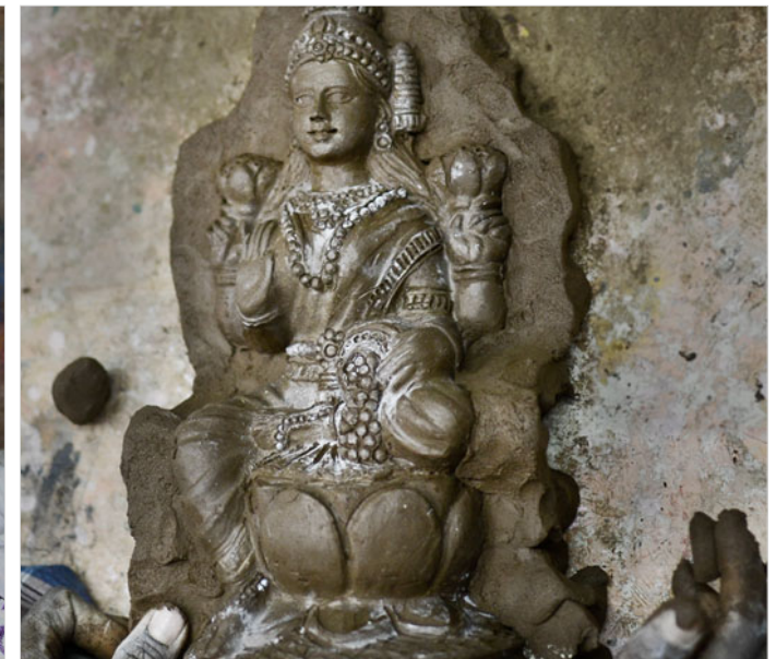
A base of the mould is made adjacent to the idol.