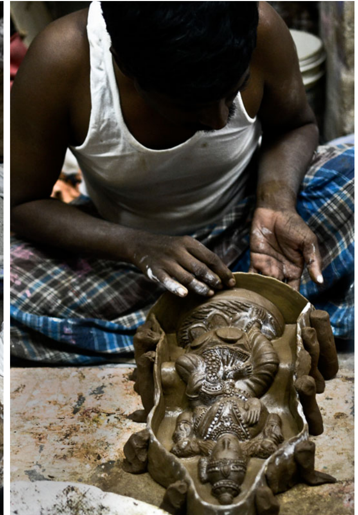
Artisan places the sidewalls firmly.