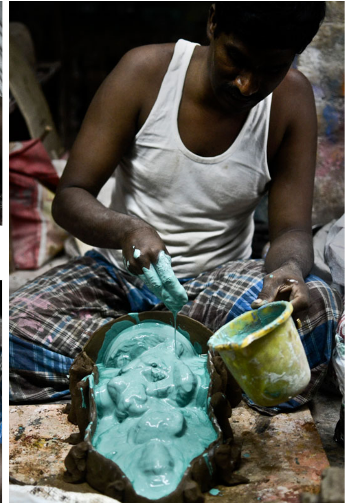
The first layer of the mould consists of casting powder solution.