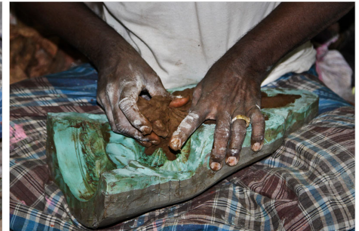
Clay is removed from the prepared mould.