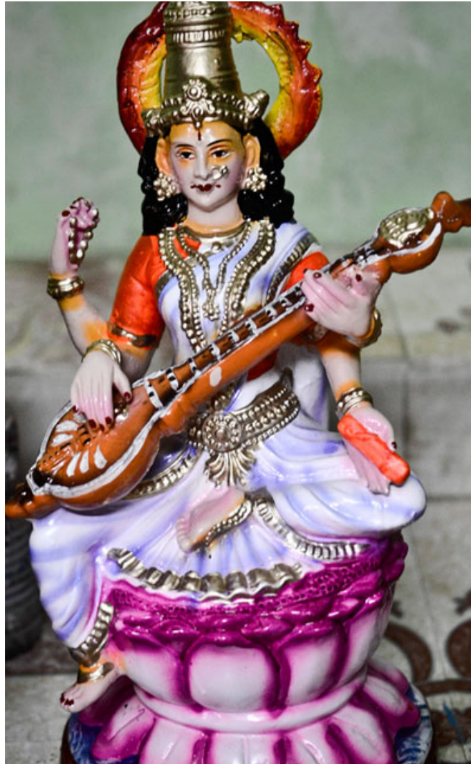
Idol of goddess Saraswathi playing veena.