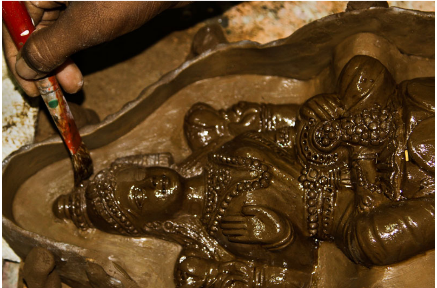
Mixture of grease and kerosene is applied to avoid smudging of design.