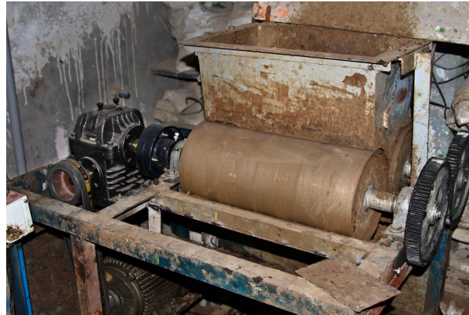
Mixing machine to mix the clay and sand into dough.

https://dsource.in/resource/terracotta-idols-vellore/tools-and-raw-materials