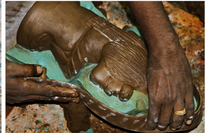
Sidewalls are made and attached to prepare the other half of the mould.