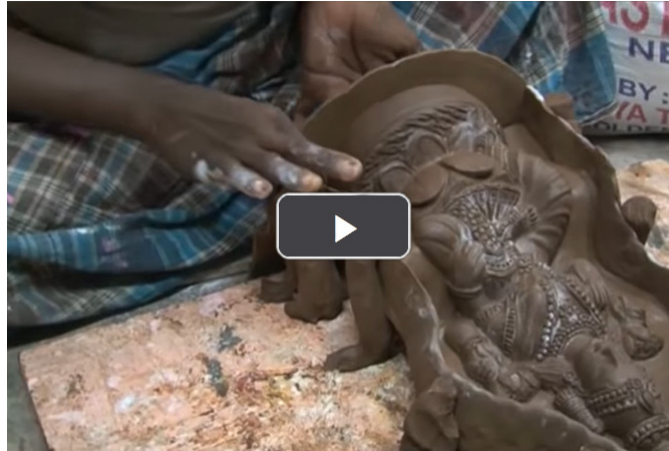
Terracotta Idols - Vellore