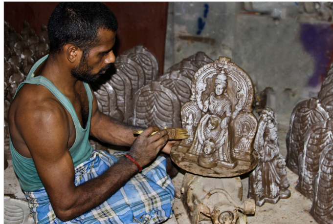
The cracks are filled with clay and the surface is smoothed using a wet brush.