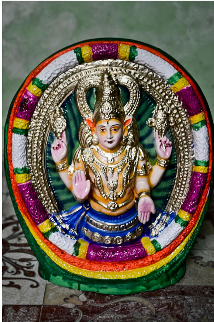
Idol of Lord Vishnu colored with vibrant colors.