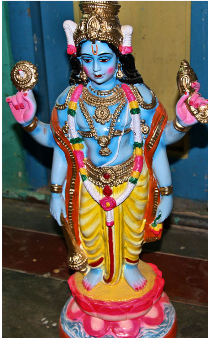
Idol of lord Vishnu which is beautifully ornamented with intricate jewelry design.