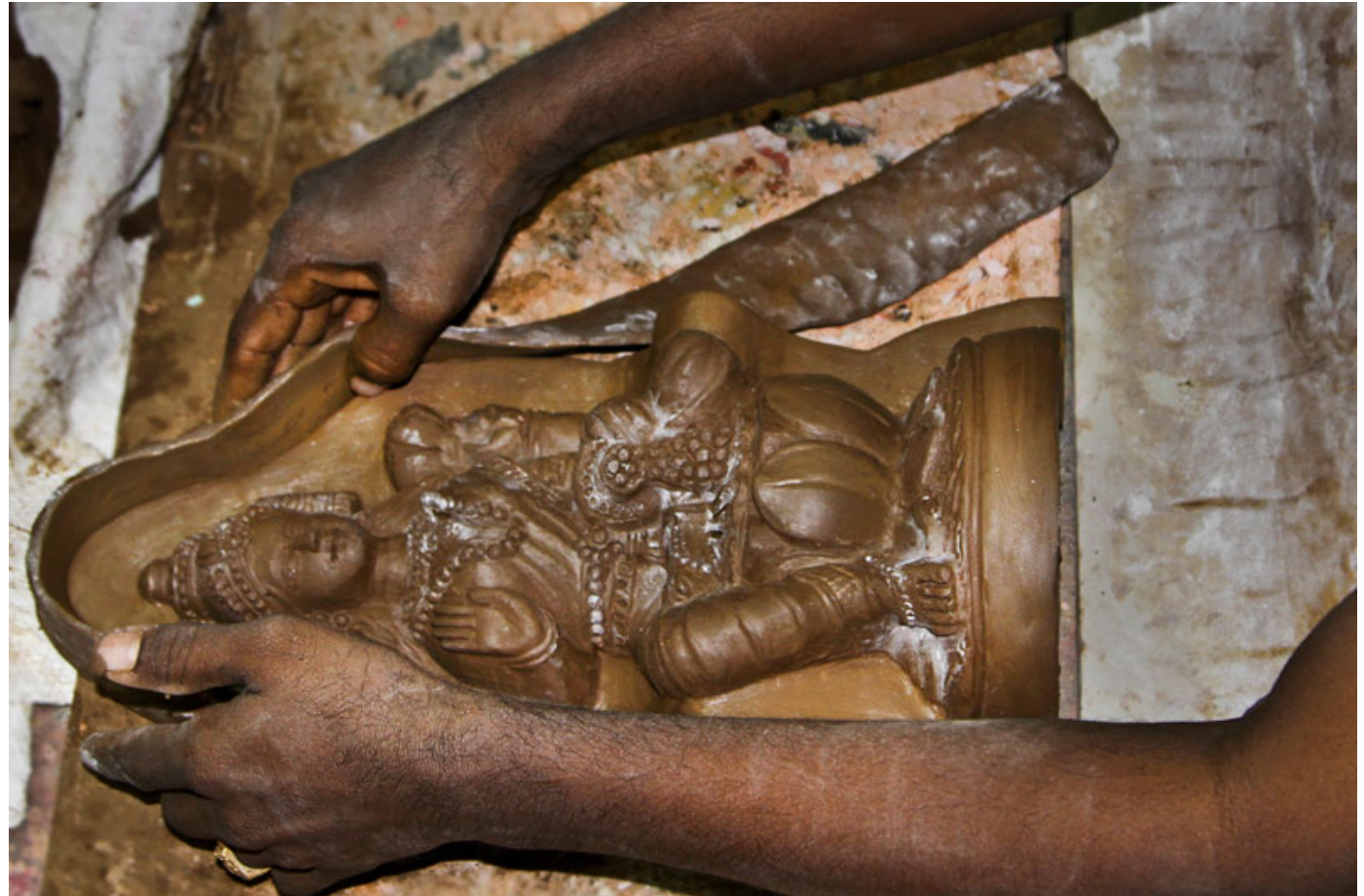
Sidewalls are made with clay to hold the mould mixture.