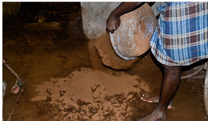
The filtered mud and clay is put together.