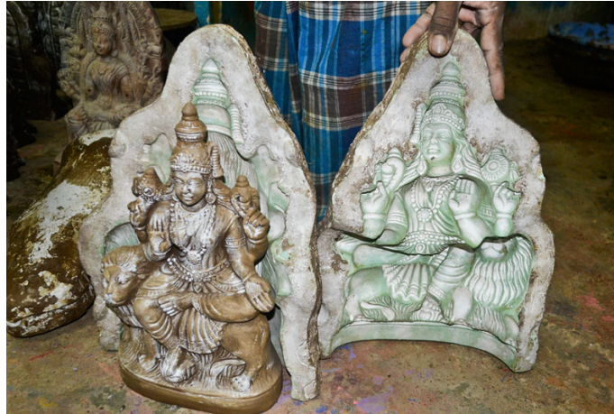
Image showing the detail design impression made by the mould on the clay.