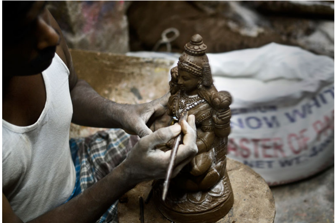
Artisan making designs on the idol.