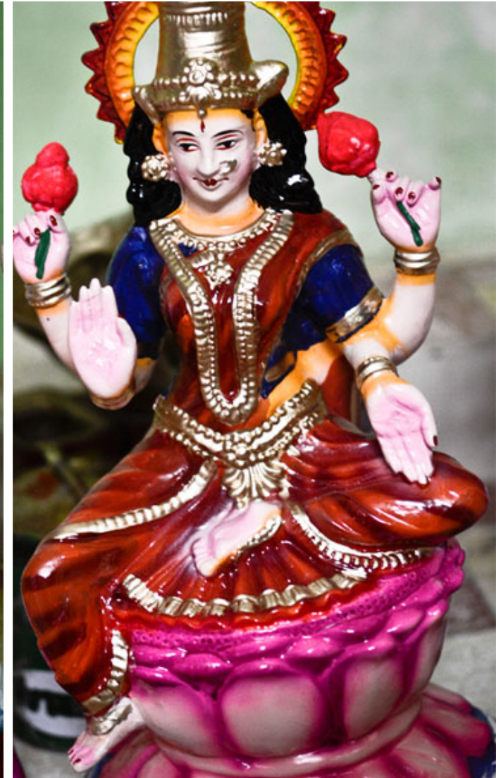
Goddess Lakshmi idol have huge demand during Diwali festival.