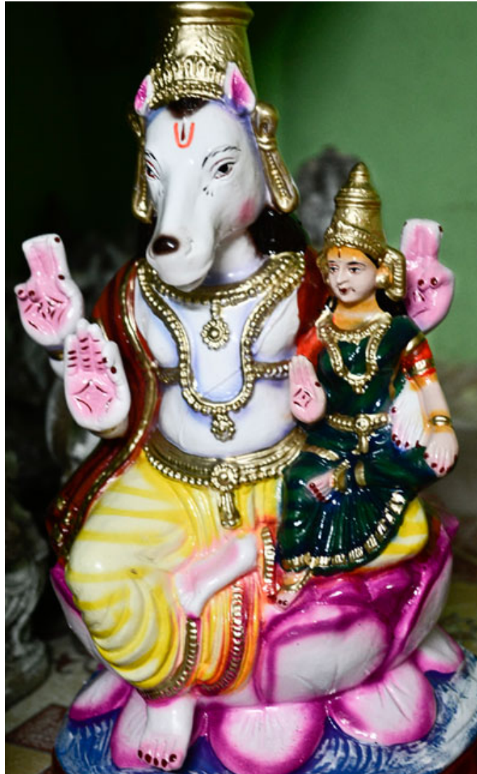
Lakshmi Hygreevar Set.