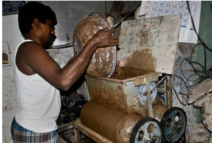
The soaked mixture is put in mixing machine.