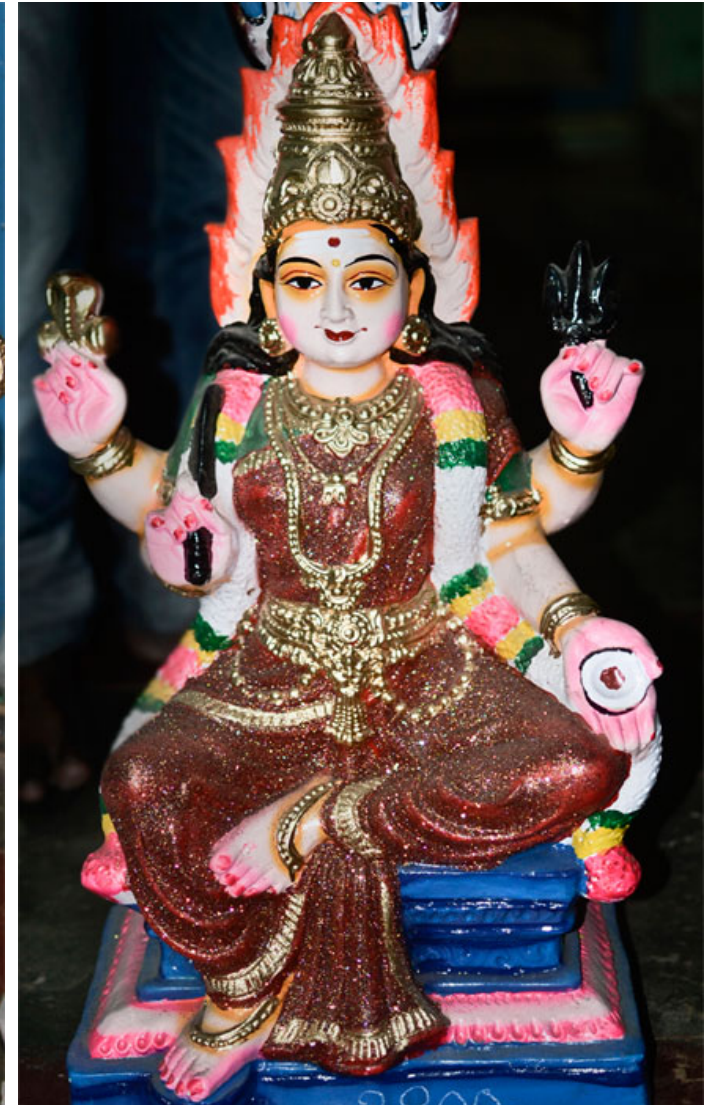
Idol of Goddess which is attractively decorated with glitter powder on attire.