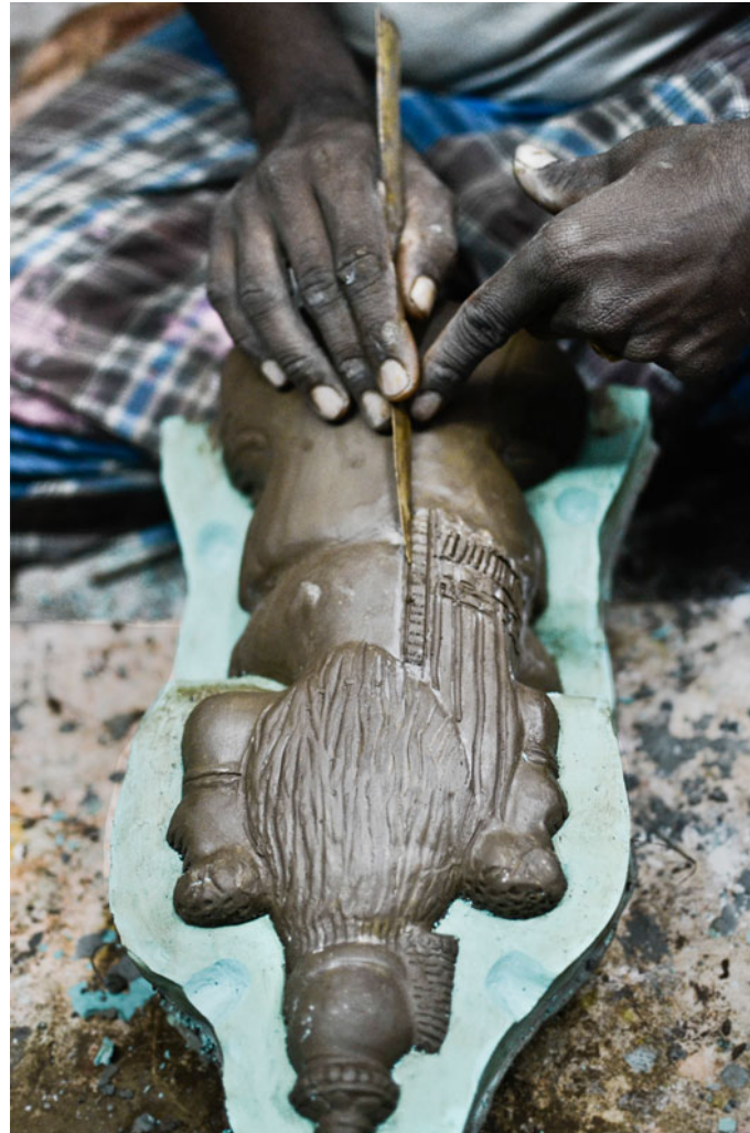
For the other side of the mould, artisan carves the design.