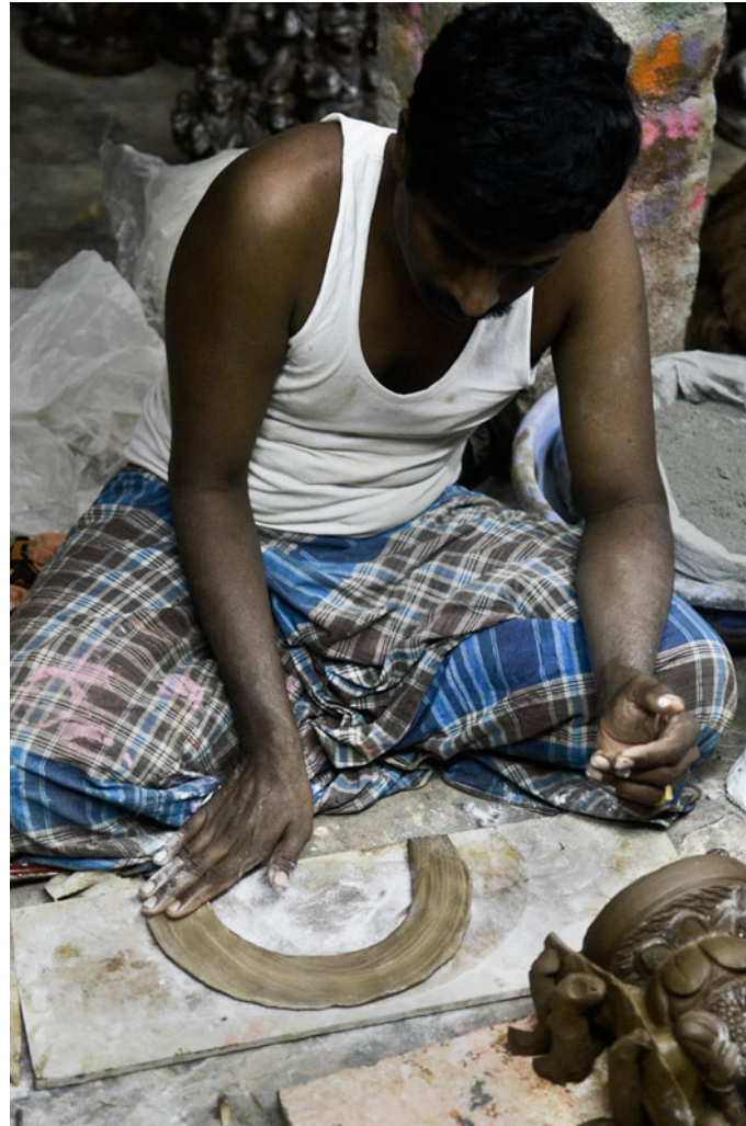
Artisan making the sidewall for the idol.