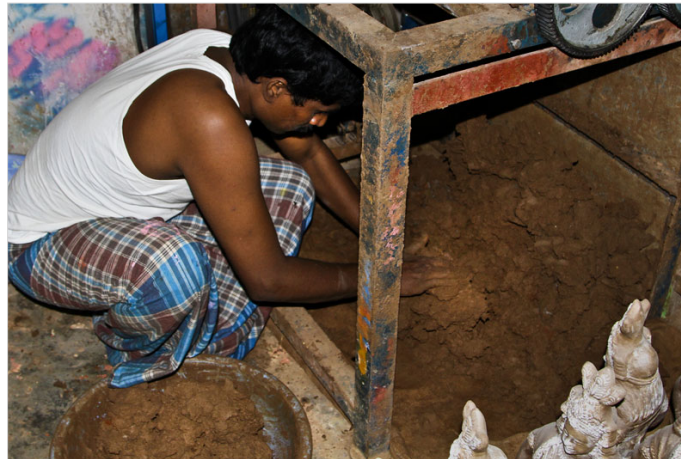
The process is continued three times to enhance the elasticity of the clay.