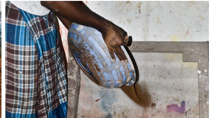
Clay is filtered to remove lumps and other impurities.