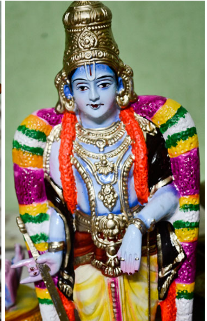
Rich vibrant colors are used to give the idol astonishing looks.