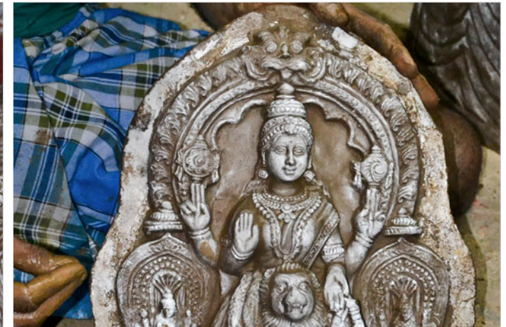
Clay idol kept for drying.