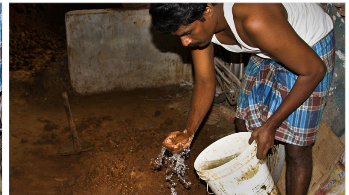
Water is sprinkled on the mixture and soaked for a while.