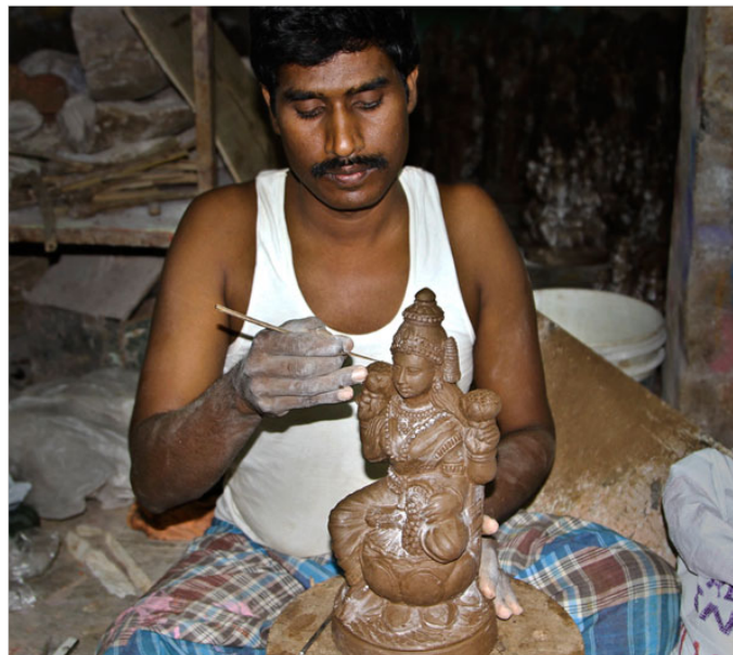
Artisan makes the required idol with detailed design.

After the mould is dried to an extent, the supportive clay strip is removed using a knife. The same method is repeated to prepare the other side of the mould. Before making the other side of the mould a thin layer of soap is applied on the edges of the one side finished mould, so that the either side of the mould doesn't stick to each other. The prepared mould is kept in room temperature to dry almost for a week.