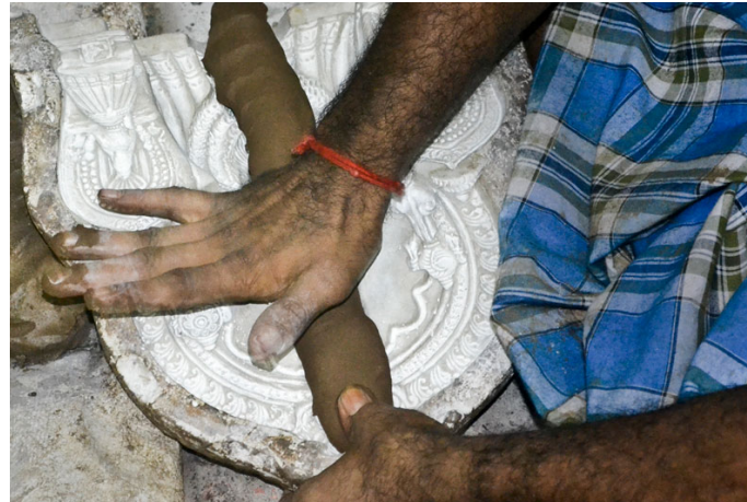
Clay is set in the mould to make the idol.

https://dsource.in/resource/terracotta-idols-vellore/making-process/idol-making