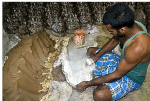
Pop powder is sprinkled on the mould.

The price range starts from 10 Rs and exceeds Rs 1,000 depending upon the size and details of work. These products are transported to markets in other parts of Tamil Nadu like Chennai, Madurai, Salem, Coimbatore and Trichi. People from other states also come to buy articles from here. During festival times, the sales of Vellore terracotta products are high.