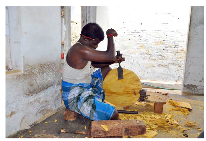
Artisan involved in shaping the wood.