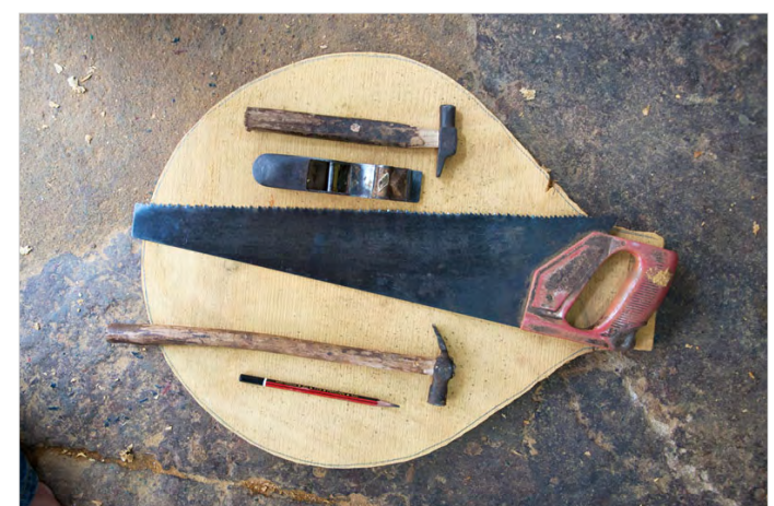
Rampam-Hacksaw blade used for cutting wood.