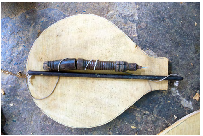
Thamur kodu – drilling machine to make holes.