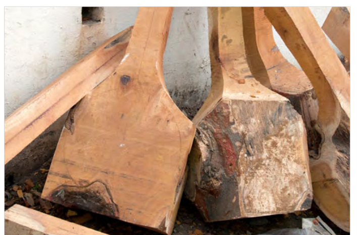
Blocks of Jack fruit wood.