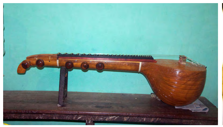
Veena-traditional music instrument of Thanjavur.

The instrument veena is the most sophisticated and famous among all the musical instruments. It is popularly referred as Yaazh. The ornamentation is done beautifully with silver and ivory. Veena has a pluck technique with the use of the nail. Out of seven strings four strings are for music and the three side one are for Talam-maintaining time. The traditional music and the musical instruments of Thanjavur have a great history. Veena is one of the wide varieties of ritual instruments made at Thanjavur. The Thavil and the Nadaswaram are essential for the temple festivals. The instruments are also played by the group of village potters for a village wedding. Any auspicious occasion is incomplete without the use these musical instruments.