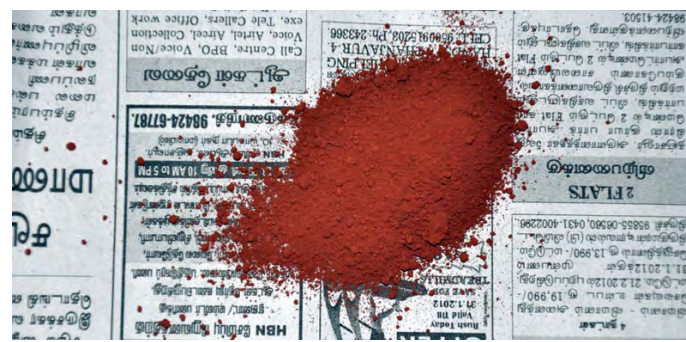
Color powder used to coat veena.