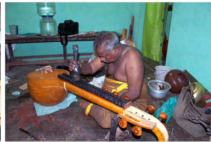
Dough is gently beaten for proper fixing.