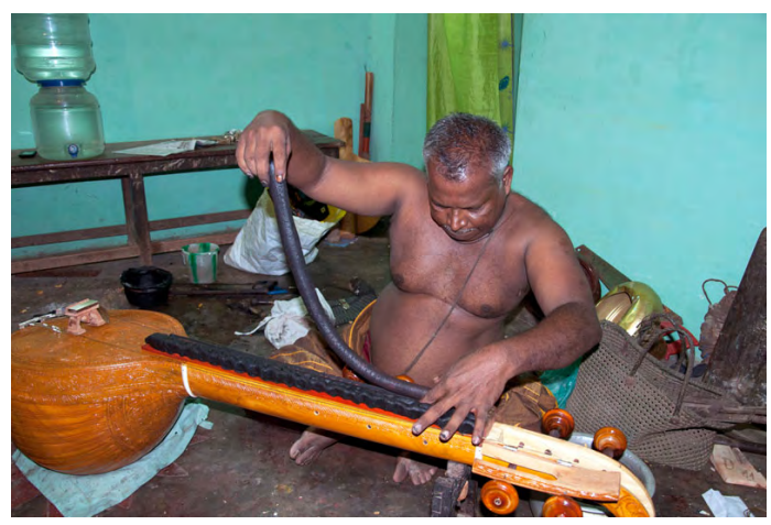
The prepared dough is being placed.