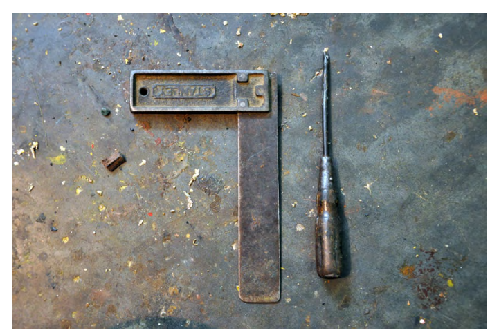
Right angle scale.