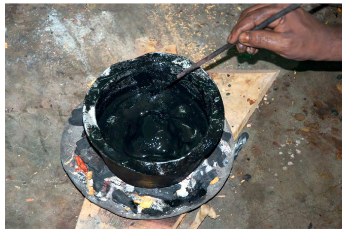
Black substance used to fix on the veena finger board.