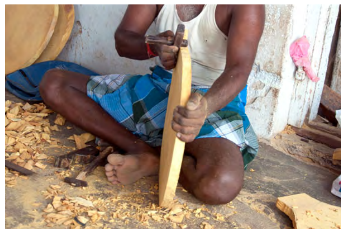
The side wall of wooden plate is smoothened.