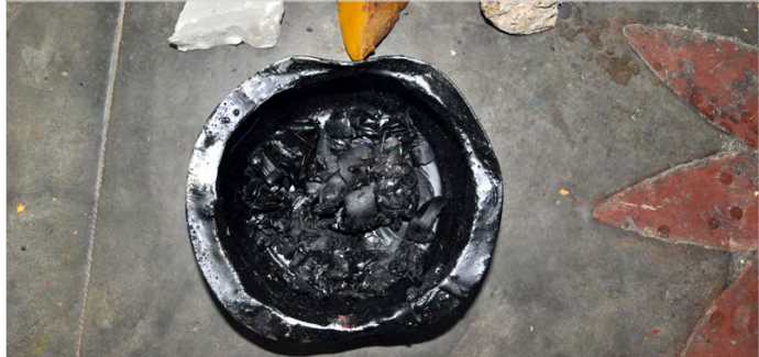
Black paste used to fix on the finger board.