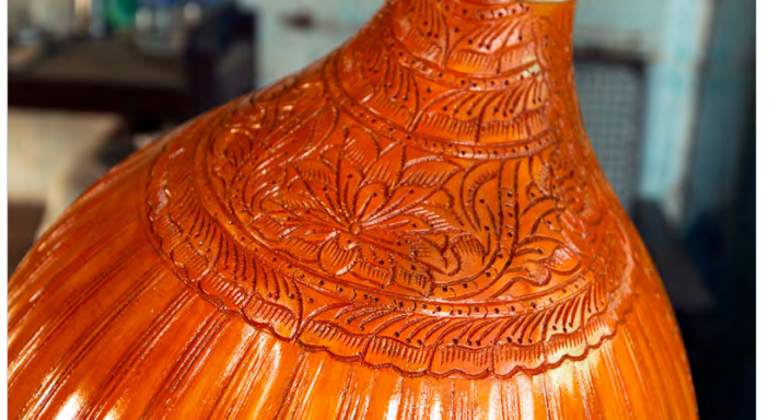
Design motifs are influenced/inspirations by/from flowers and deities.