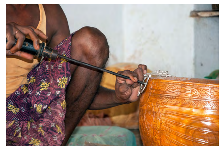
Fixing the strings.