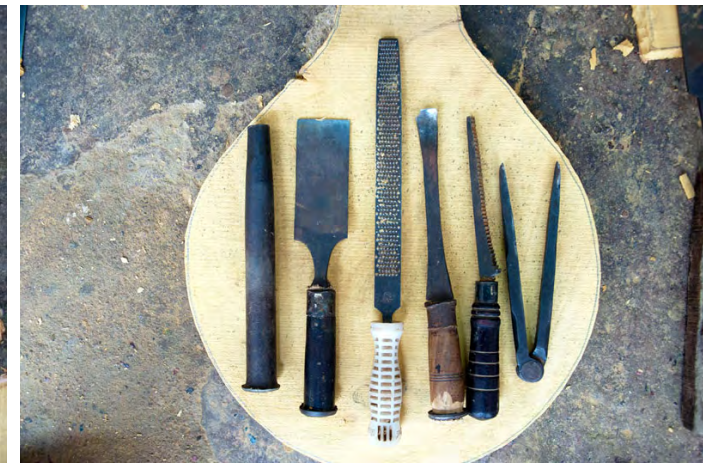
Uli- chisel, Mularam- rough chisel and small chisels.