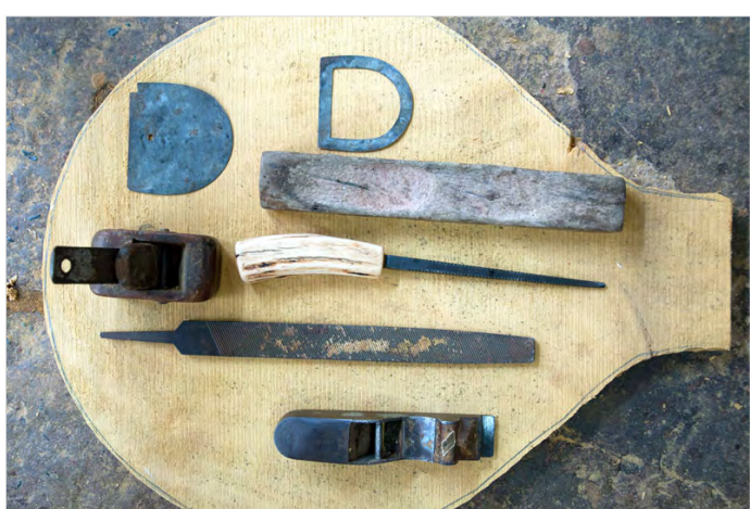
Files and Smoothening tools.