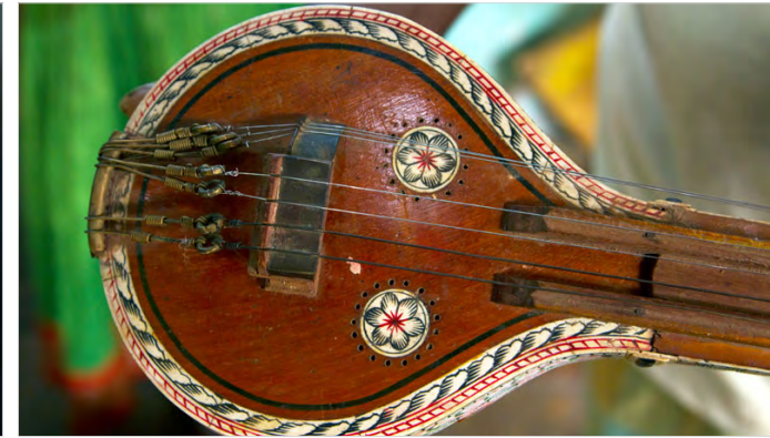
The sound holes are called Nada randhra.