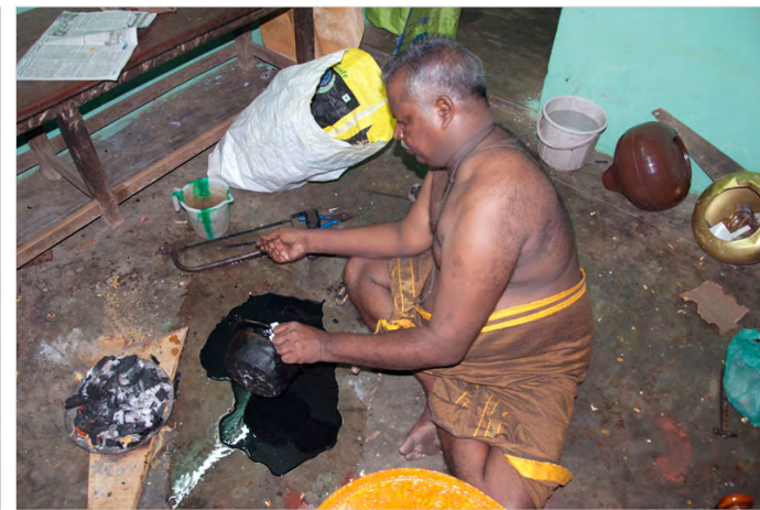
The molten solution is being poured on the floor above the water.