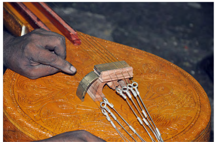
The copper strings are being placed on the bridge of the veena.