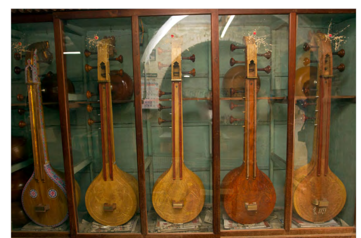
Display of veena instruments.