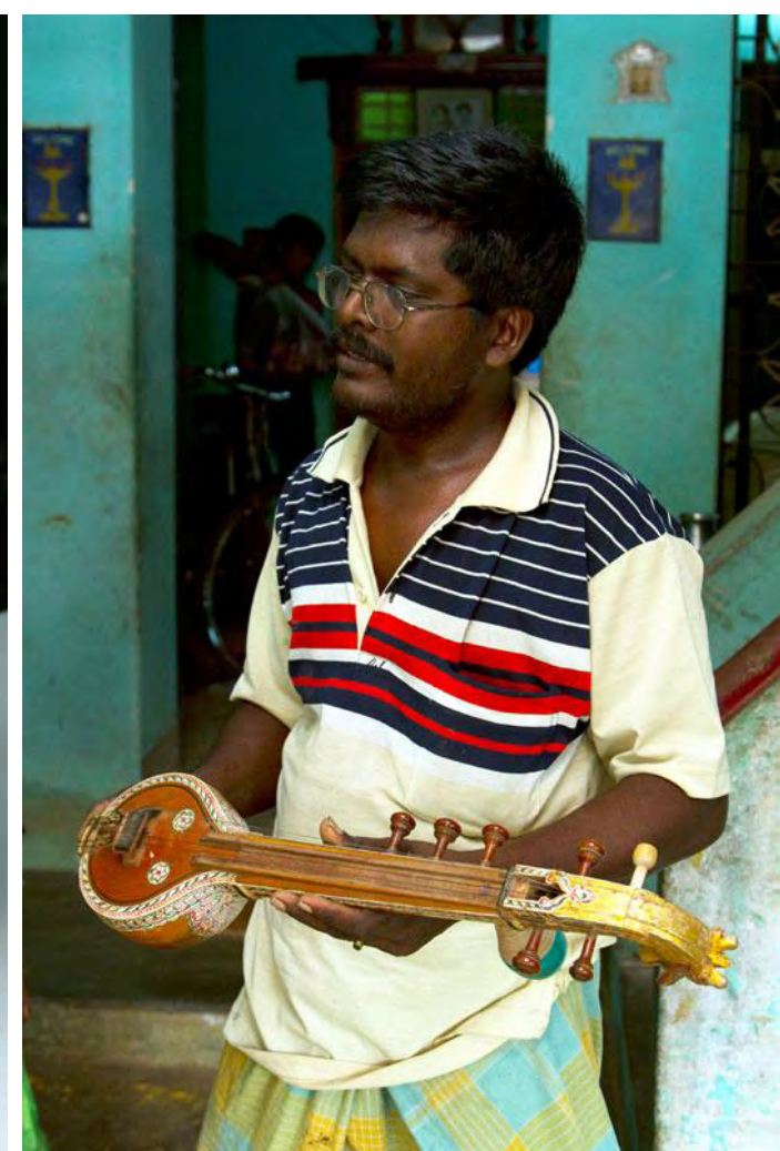
The artisan with mini Veena.