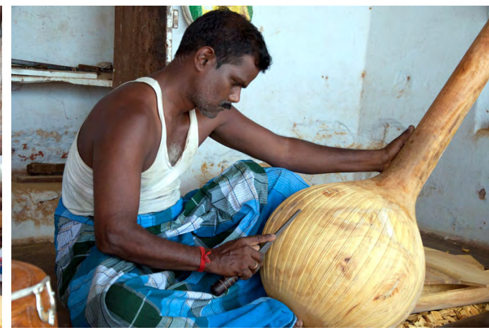
The design is created using chisels.