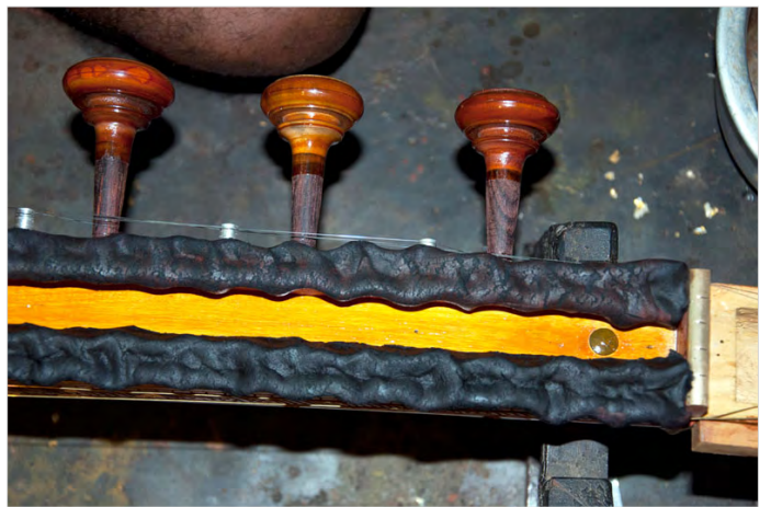
The fixed dough is allowed to cool for some time.