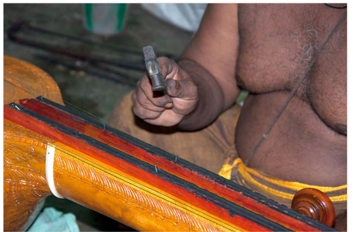
Fixing the nails.