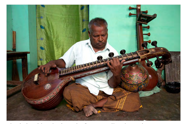
Final checking is done before sending it to the veena to the market.