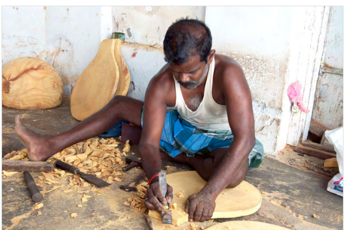
Artisan scraping out the excess wood.