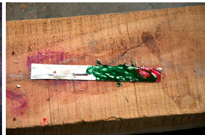
Acrylic sheet used to decorate the veena.