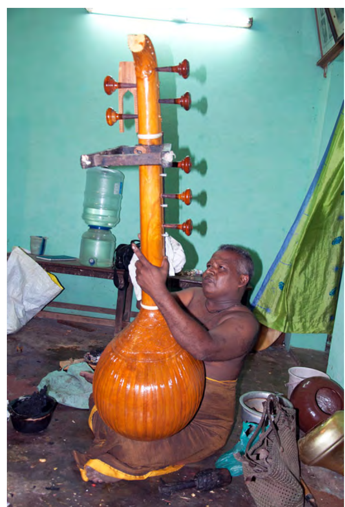
The master craftsman polishing the veena after the completion of the process.