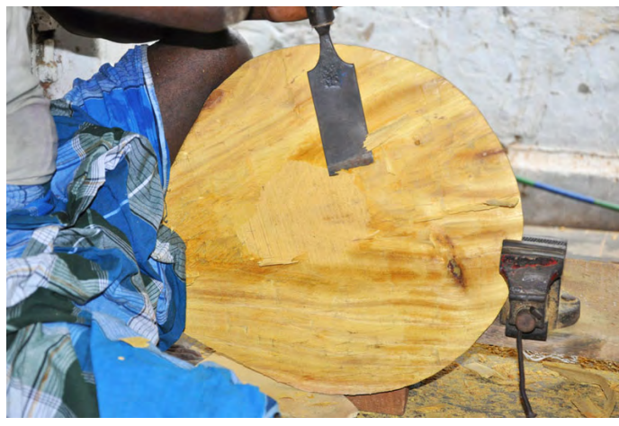
Wooden plate to cover the Veena resonator-Kudam.