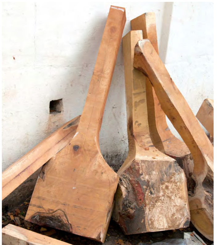
The basic rough shape of veena.

The making process of musical instruments is a laborious process. It takes minimum of twenty days to complete the product. The traditional Thanjavur Veena has three parts such as fingerboard, resonator and peg box. Pala maram (called locally)-Jackfruit wood is used to make veena. The entire instrument is carved on a single block of wood. A pot-like shape of the Veena is made out using round chisel called Kolavu uli. The resonator of Veena is made by scooping the wood and then a circular wood piece is made to cover the resonator. The seven metal strings are tied at the end of the bowl to metallic fastenings using metal rings. This helps the musician for accurate tuning. The metal frets of 24 are fixed on the finger board of veena using the mixture of beeswax and charcoal powder. These metal frets are made out of brass. The pegs and knobs for the strings are made of rose wood. These are fitted to the instrument using beeswax. Finally the embellishments of veena are made using lac colors. The performance of finished veena is tested by the musicians of Thanjavur before being sold in the market.