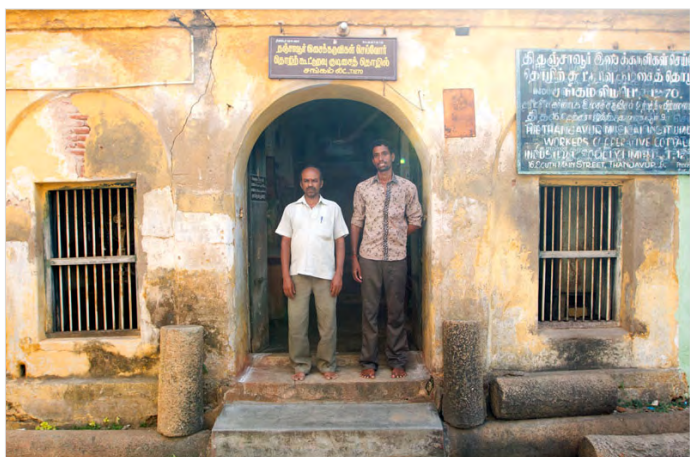
The artisans at market place.