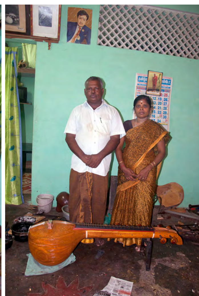
The master craftsman with his family.