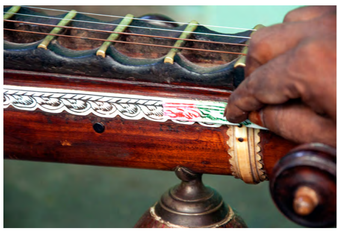
This sheet is fixed to the veena surface.