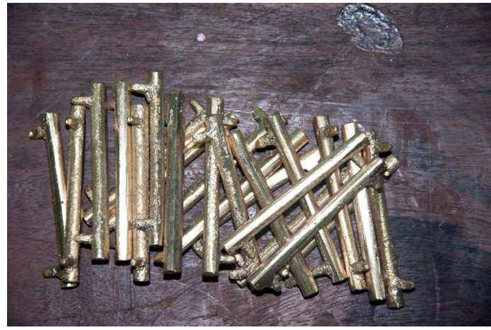
Frets made of brass.