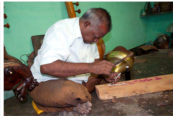
The design to be embellished is first carved on an acrylic sheet.