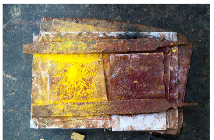
Powder used to polish the Veena.