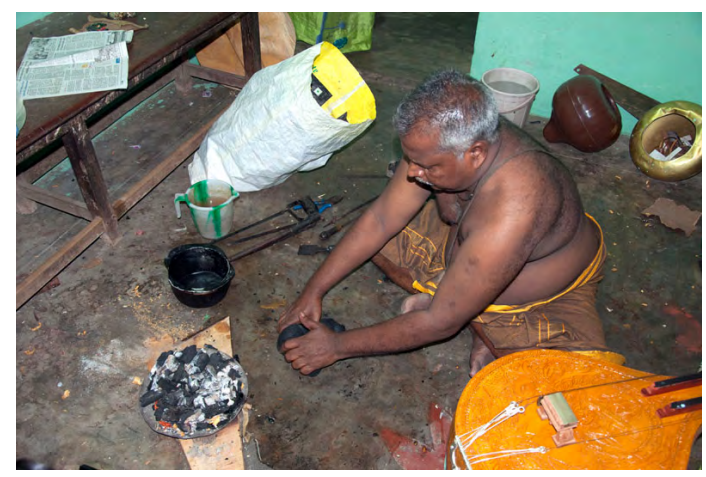
The substance is mixed.