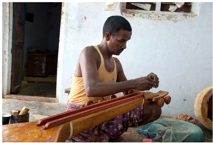
The strings are pulled and attached to the other end.