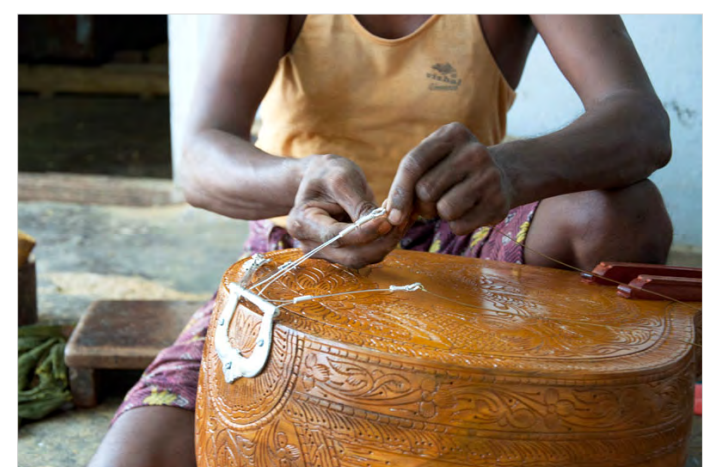
The copper strings are being tied.