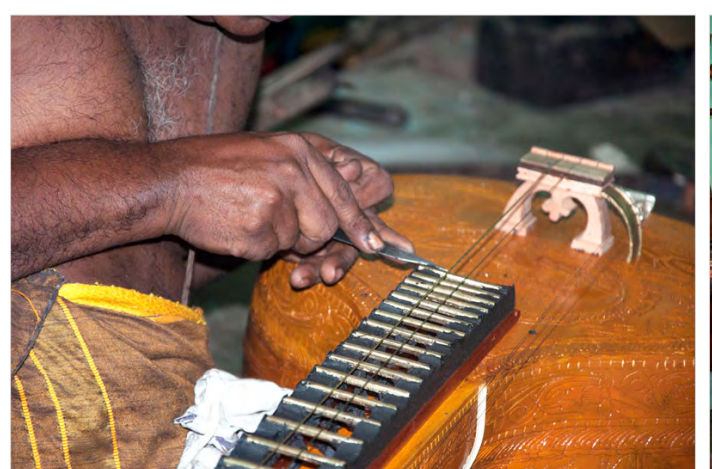
The 24 frets are fixed and adjusted.