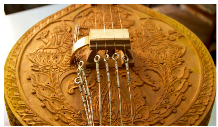
The intricate carving done to embellish the Veena.