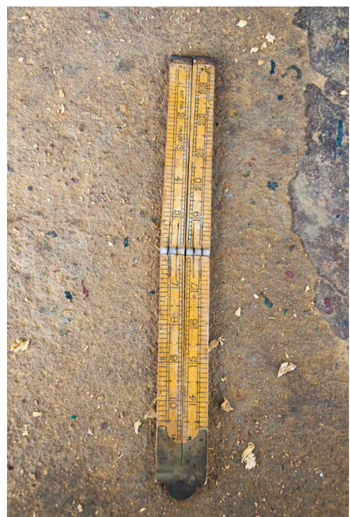
Scale for measuring.