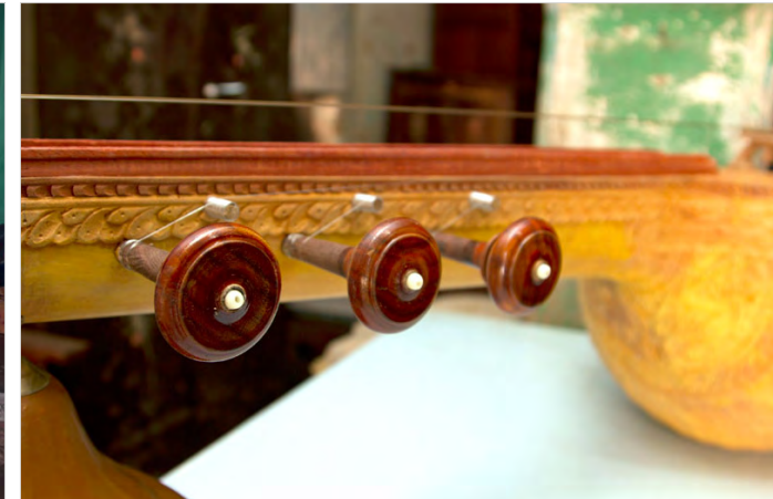
Pegs of veena to adjust the tuning.