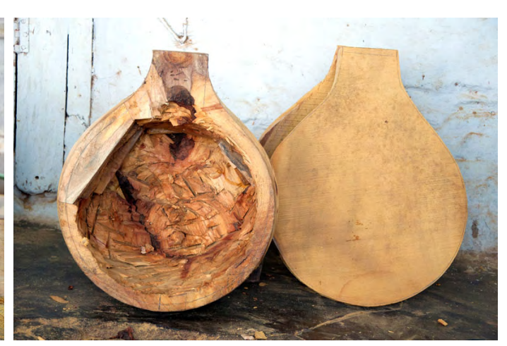
The inside stuff is scooped.