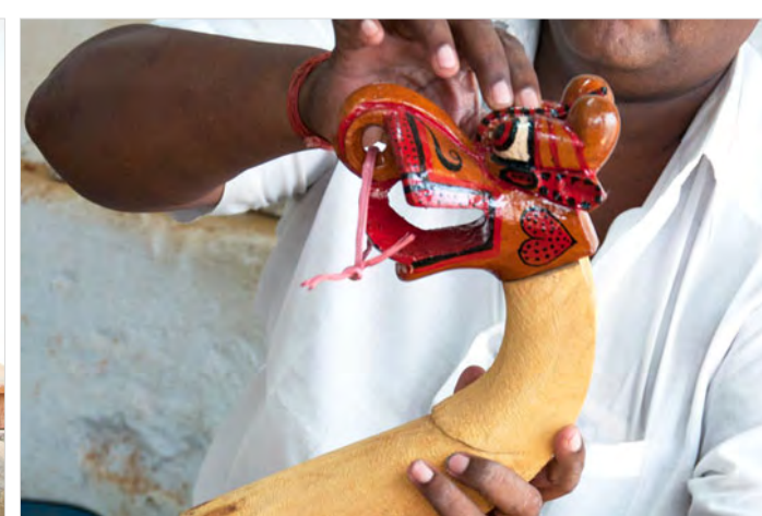
The other end of veena is decorated by carved animal face.