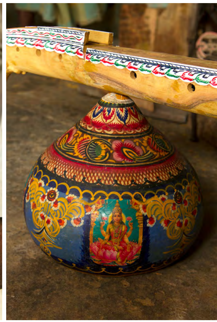
A very old artifact displayed at the artisan's place.