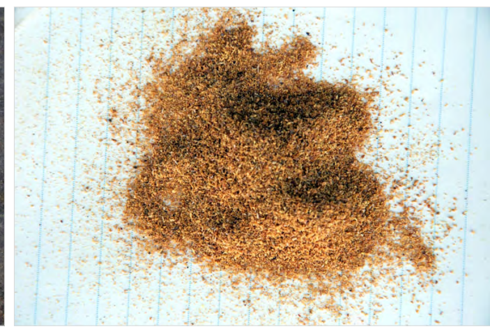
Wood dust used to fill the cracks.