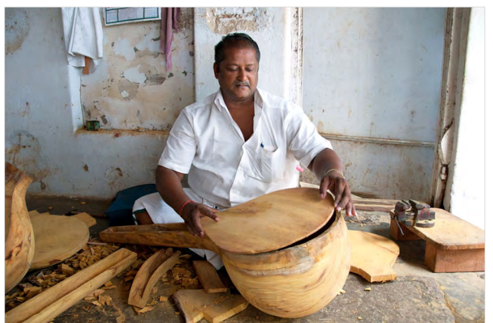
Fixing the wooden plate.