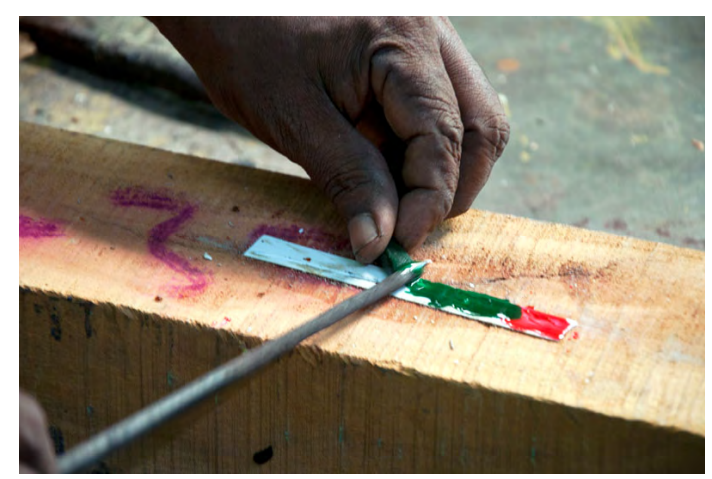
Then the lac colors are filled on acrylic sheet.