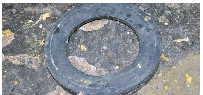
A stand meant for placing the veena.