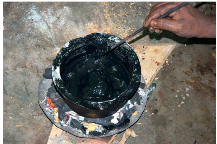
Iron containers used in boiling process.