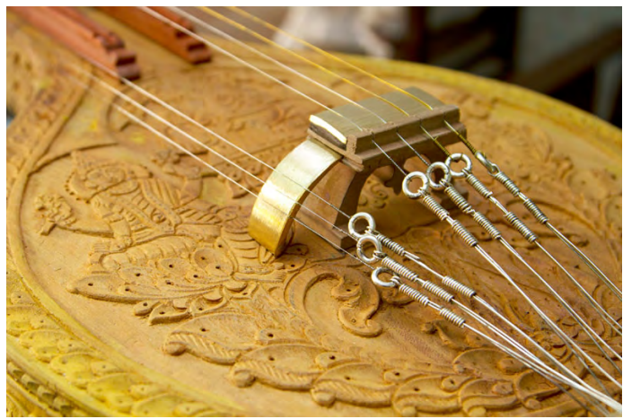
The closer view of the seven strings of veena.