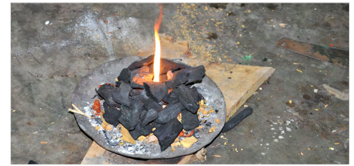
Charcoal is used as fuel.