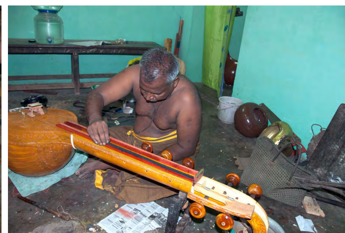
Black substance is being applied.