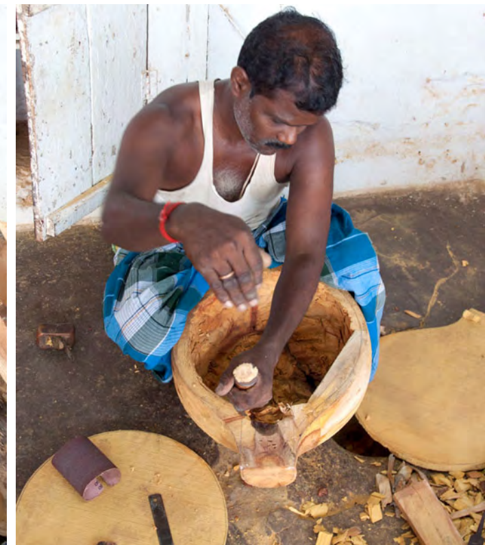
Initially, the carving is done to get the precise shape for the veena.