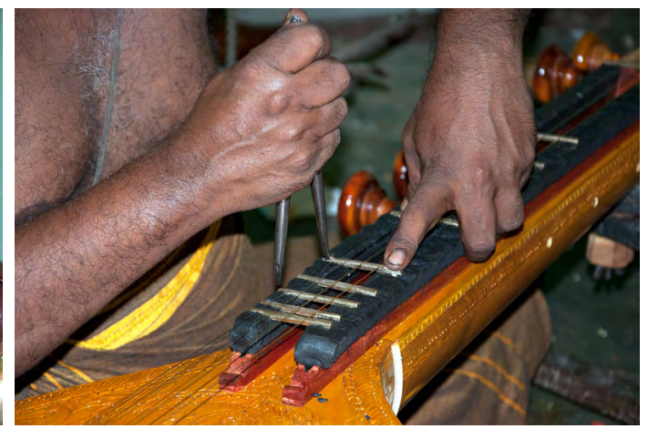
The metal frets are placed and fixed on the black dough.