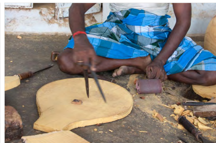
Measuring is done using compass.