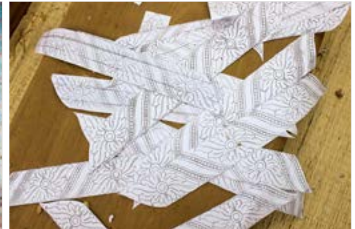
The paper pieces with a sketch are used to stick on the wood for carving.