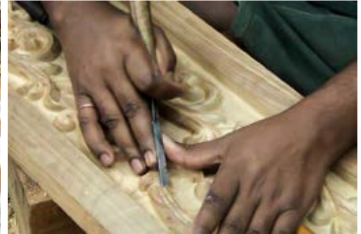
Artisan is carving the design for the side part of the bed.