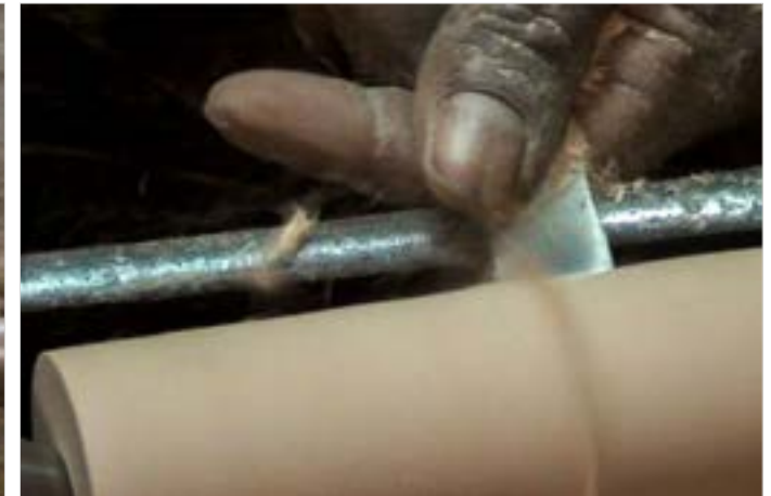
The lines are being carved on the wood while it rotating on symmetrical axis.