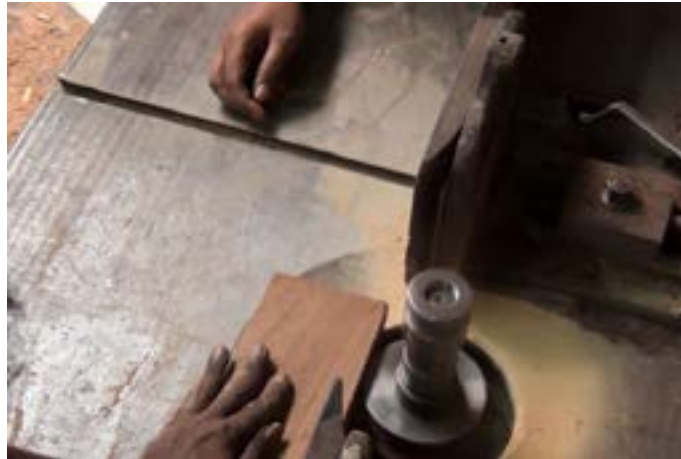
Artisan is mending the wood with the help of Wood shaper.