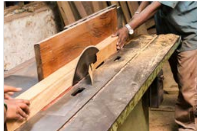
Artisan is using Table saw to cut the extra thickness of the measured wood.