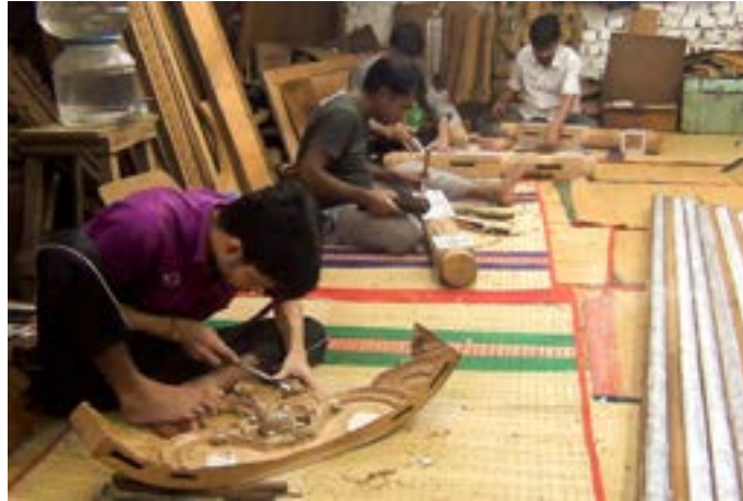
Artisans work on the different parts to complete the work smoother and easier.