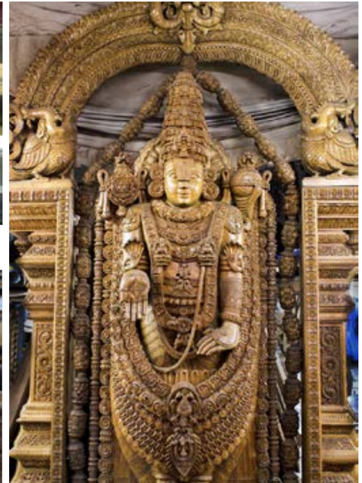
Lord Balaji's sculpture has almost taken 3 years to get completed, which is around 11.5" feet tall.