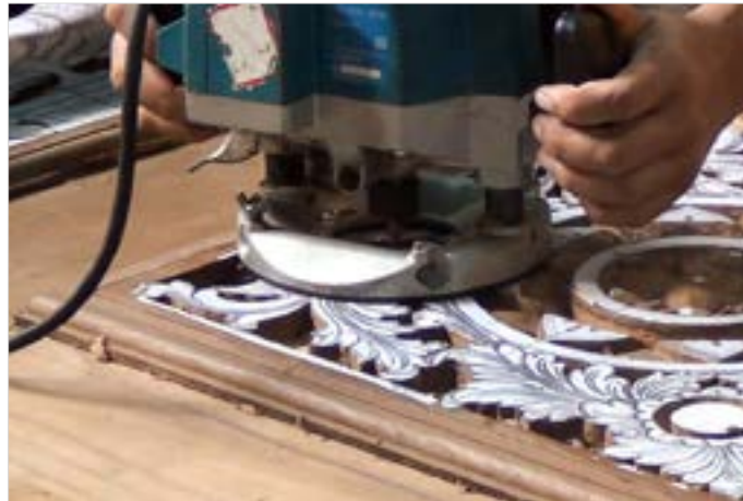
Artisan is using Wood Router to give the depth of the design.