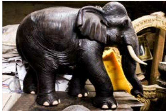
The carving of a wooden sculptured elephant gives life to the object.