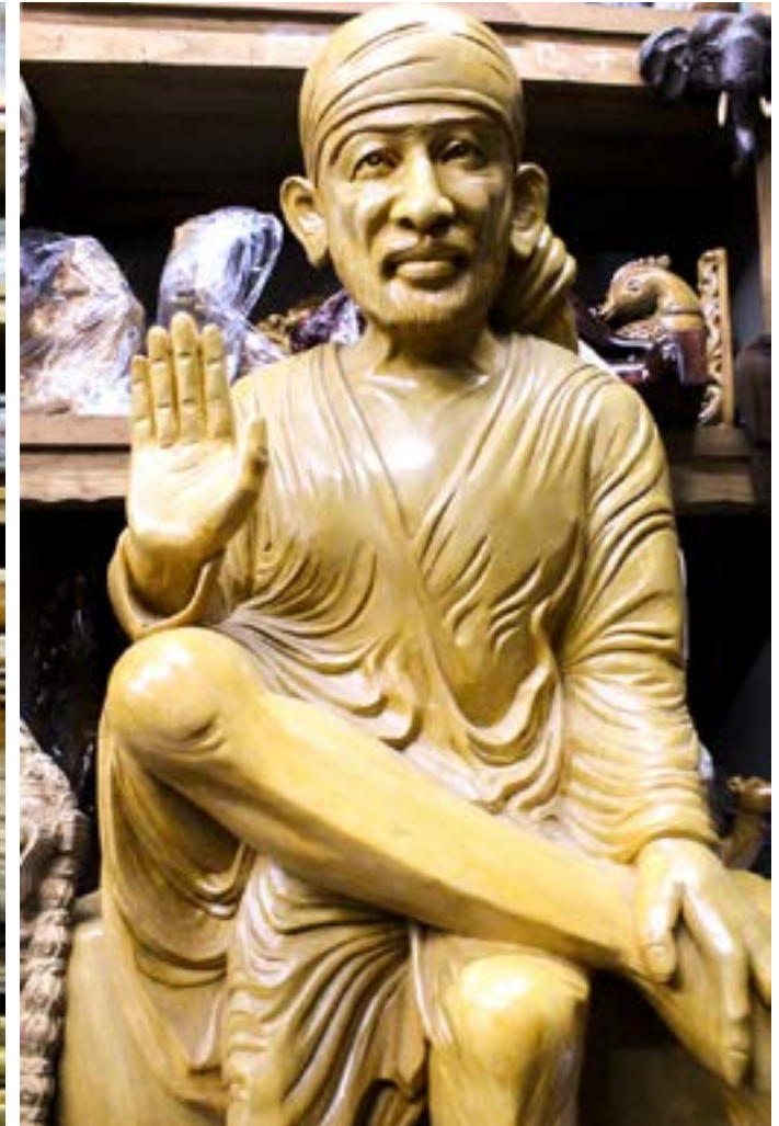
The effigy of Lord Saibaba shows the simplicity and peacefulness coming from within.