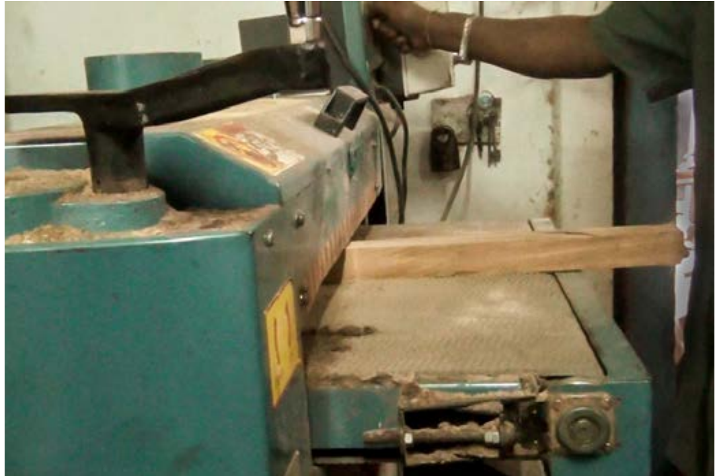
Artisan is placing a wood on one end of the Surface Planer.