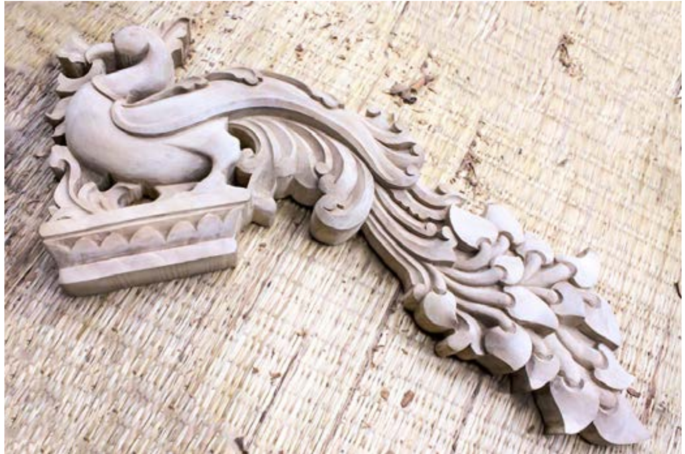
A wooden peacock that is sculpted in a traditional design captures the attraction.