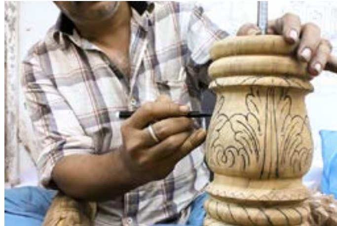
Artisan is sketching the unique pattern on the cylindrical shaped wood.

https://dsource.in/resource/wood-carving-bengaluru-karnataka/making-process