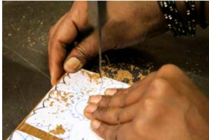
The outline of the sketched wood is being trimmed by Band saw.