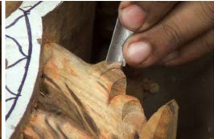
Artisan is lacerating the complicate layers from the wood.