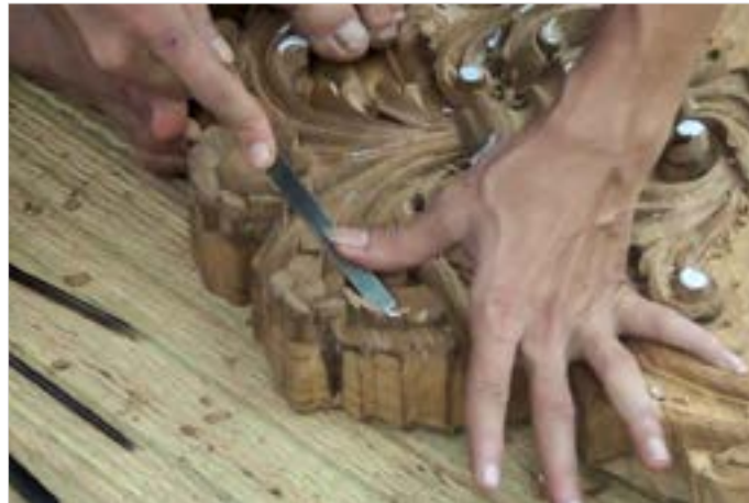
Artisan is shaping the edges of the designed wood.