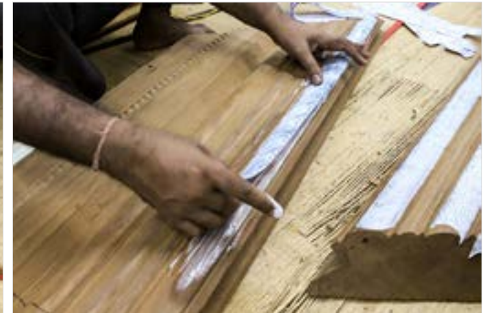
The sketched paper is being stuck on the wood with the help of adhesive.