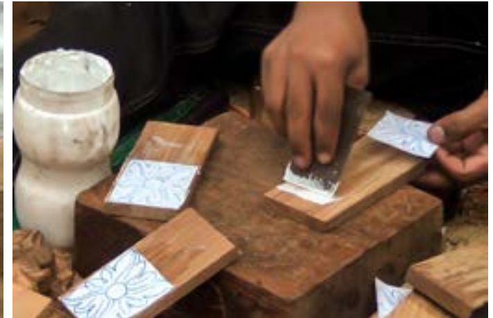
Artisan is using a blunt steel piece to apply the adhesive on wood.