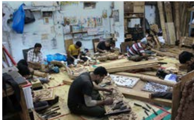
The collaboration of artisans is skilful in carving the wood.