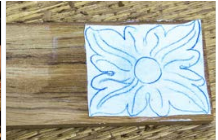
After the pattern paper is stuck, it is kept to dry.