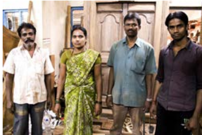
Artisans work on the machine to cut and shape the wood pieces.