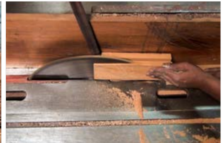
As per the required shape and size artisan is trimming the wood through Table saw.