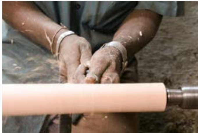
Artisan gives a cylindrical shape to the wood by using Wood turner.