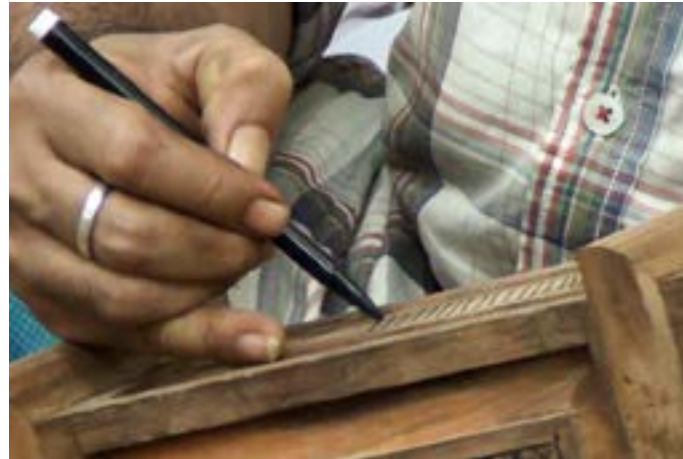
Artisan is using a black sketch pen to draw horizontal lines on the rectangular wood.

https://dsource.in/resource/wood-carving-bengaluru-karnataka/making-process