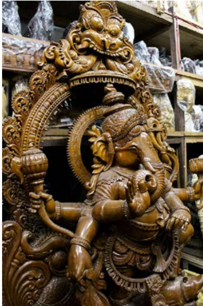
The idol of Lord Ganesh gives a heavenly look.