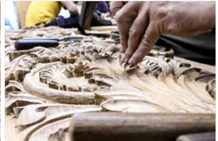
Artisan is checking for the sharpness and dull it.