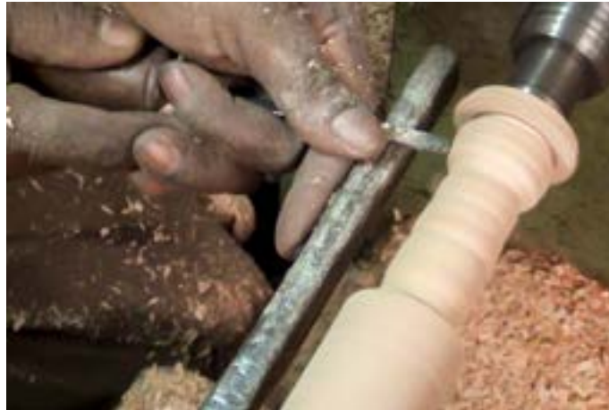
Artisan is using chisels to give a required shape on the wood.