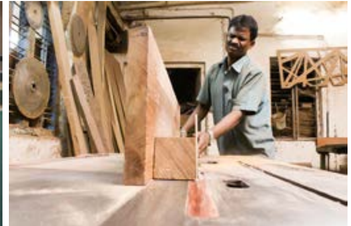
The artisan is measuring the wood size.