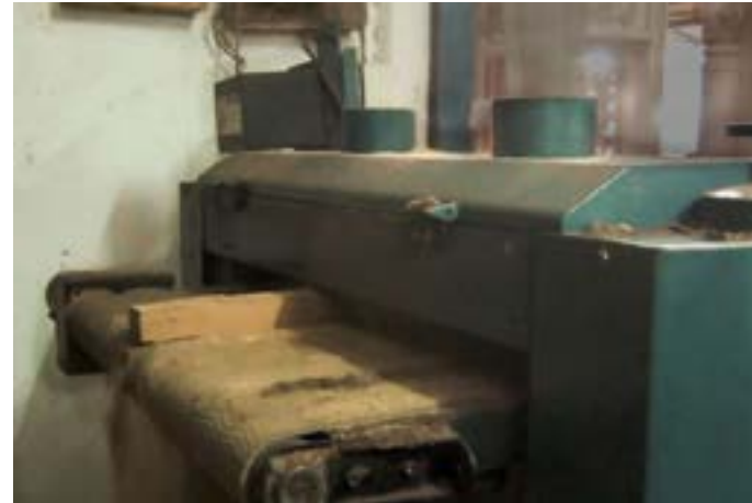
The Surface Planer is consuming the wood and a set of blades inside a machine rubs the surface and gets it out from the other end.

https://dsource.in/resource/wood-carving-bengaluru-karnataka/making-process