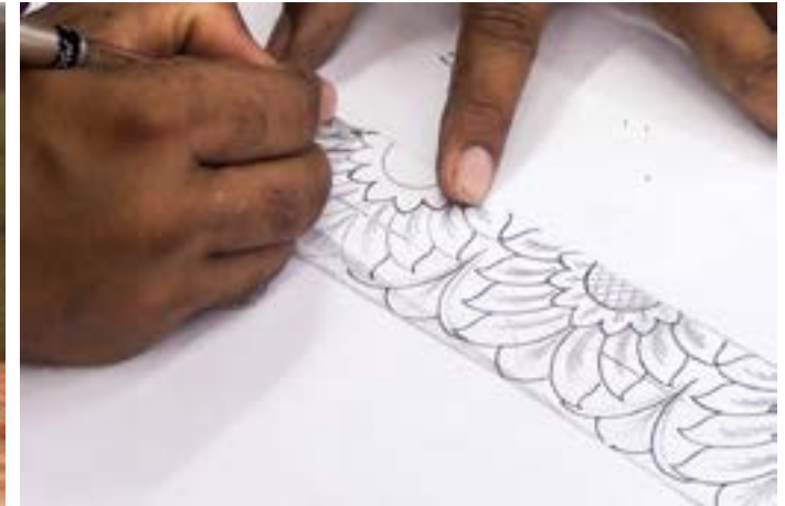
Artisan is sketching on the paper with their unique pattern.