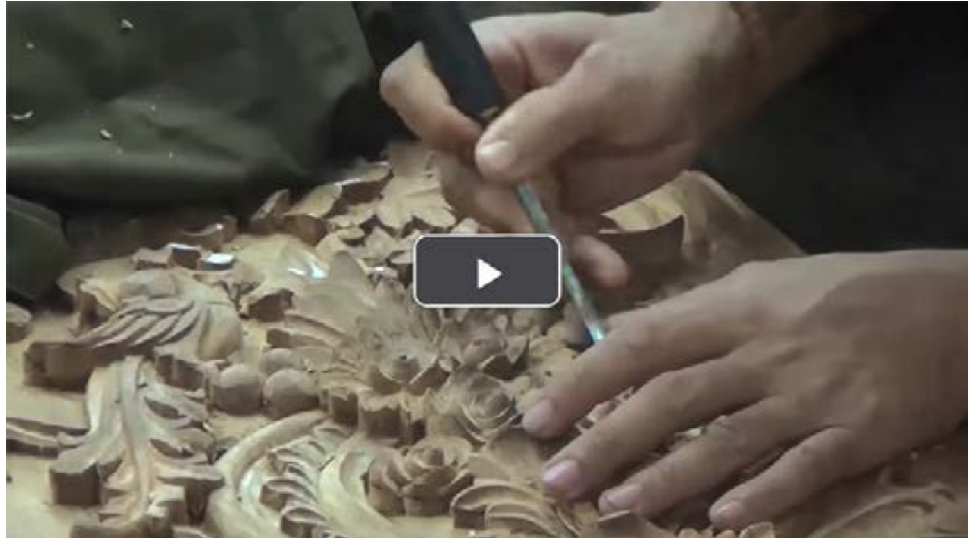
Wood Carving - Bengaluru