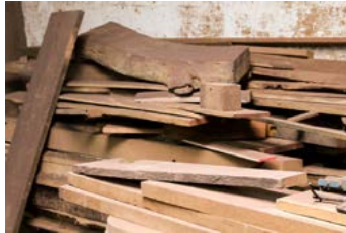
The wood logs have been dumped in a room as a basic element in woodcarving.

https://dsource.in/resource/wood-carving-bengaluru-karnataka/tools-and-raw-materials