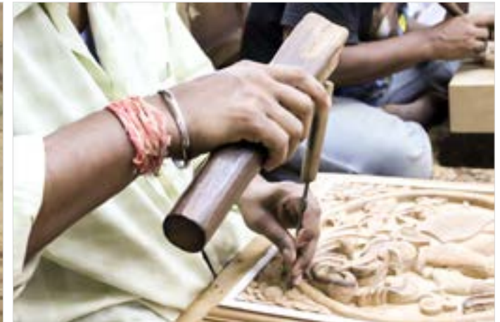
Artisan is highlighting the details on the wood.