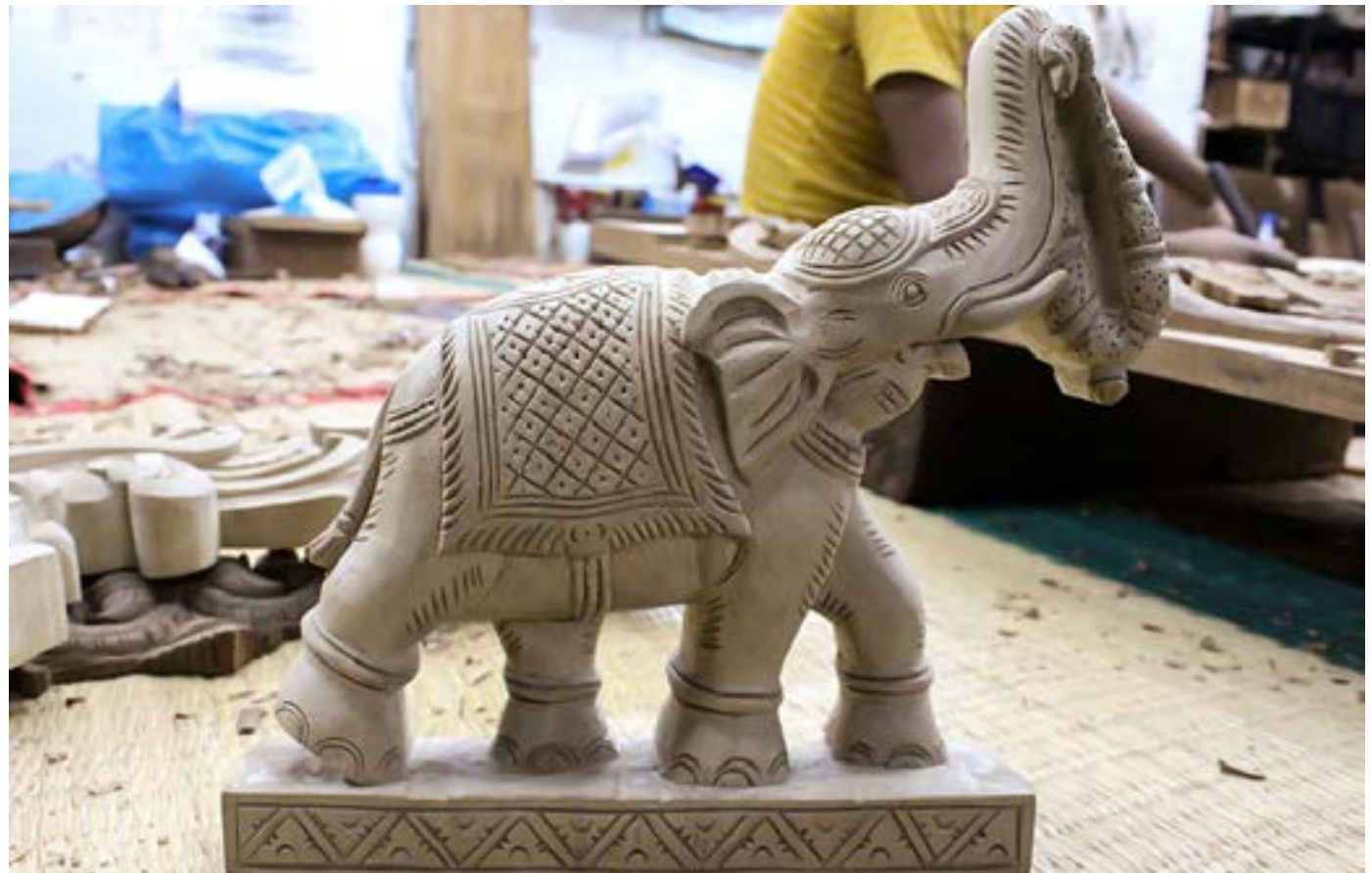
A sculpture of an elephant carrying a flower garland, which indicates welcoming the guest.

Wooden products manufactured at the artisan's workplace are the most attractive and intricately carved items. They are made as per the orders they get from the customers. As the wood used for these products are of high quality, they give the best durability of all the products. The sizes of these products vary in terms of the requirement of their client. Some of the God idols like Lord Venkateshwara, Lord Ganesh and Goddess Lakshmi are made in huge sizes. Apart from the idols; keeping the decorative aspect in mind, other attractive wooden articles are also engraved. Animals like elephants and birds like peacocks and parrots are also made. These wooden articles cost according to the workmanship that has gone through while engraving the article, the specific wood that has been used and the size of the final product.