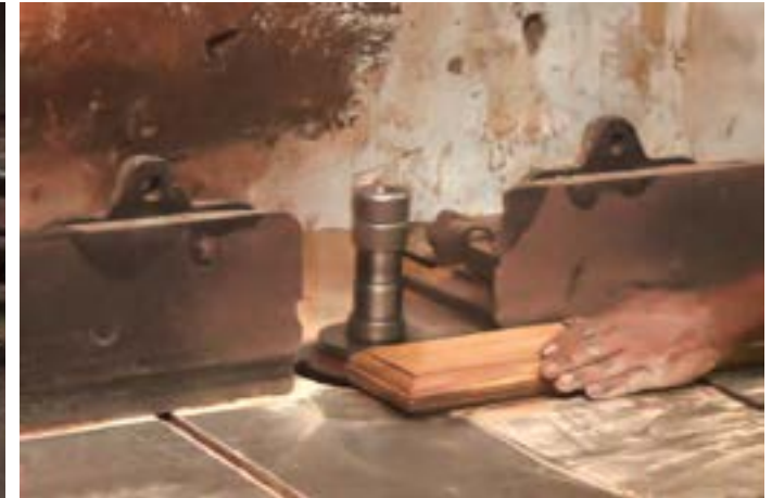
Artisan is giving shape to the edges as layers by Wood shaper.