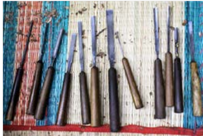
Dissimilar types of chisels used for carving wood.