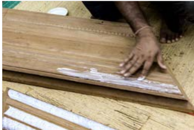
Artisan is applying white adhesive on the wood.