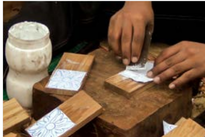
The adhesive is being applied to a sketched paper.