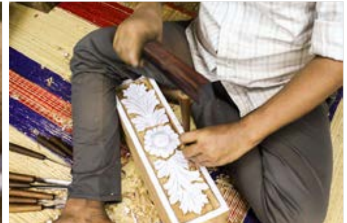
Artisan has almost completed in incising of extra-unwanted layers of the wood.