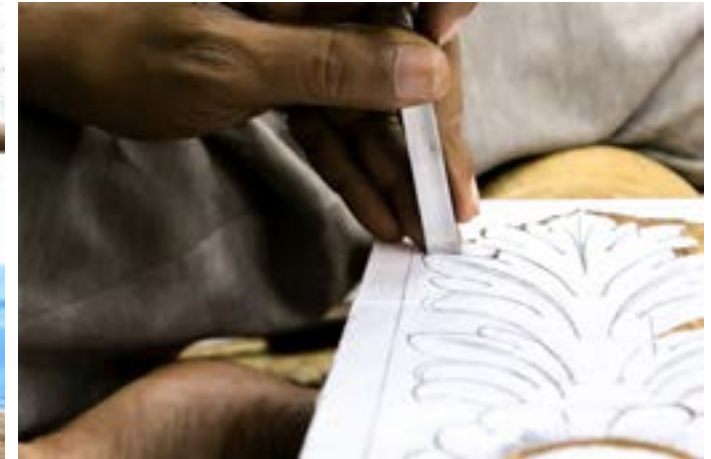
Artisan has started to carve wood over the paper stuck on it.