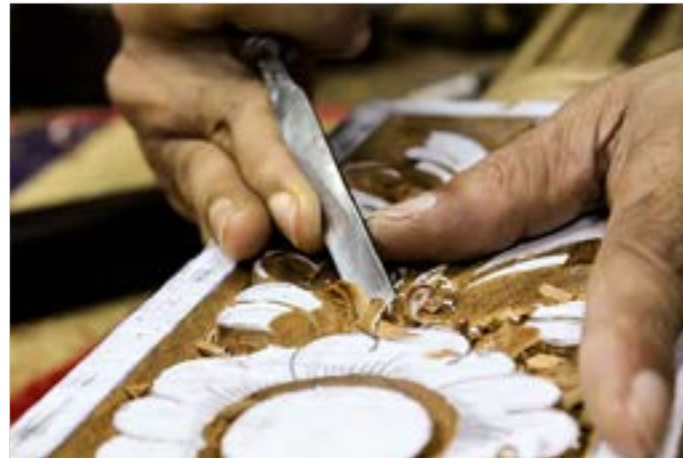
By using chisel artisan is reaping the extra wood to give the pattern.