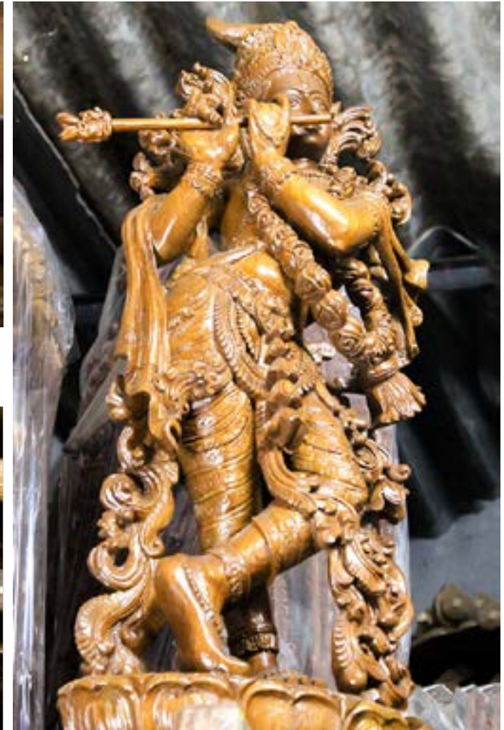
A delightful statue of Lord Krishna explains the importance of artisans' work.