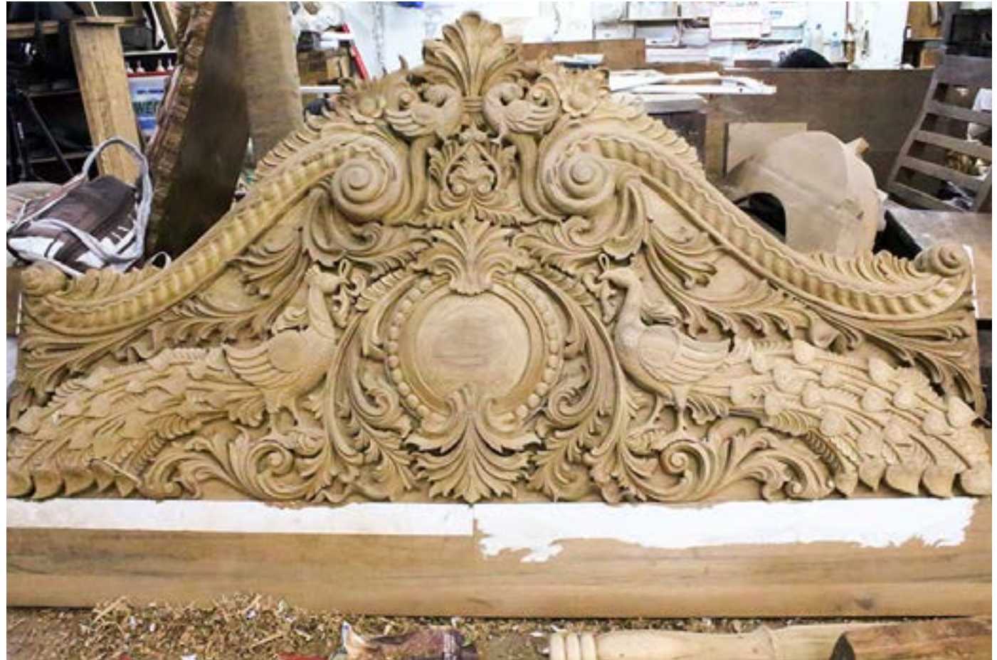
The main filler panel of the bed is being aesthetic glitz.