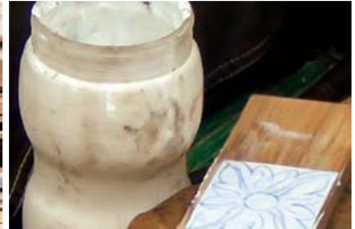
A white adhesive is used to stick the paper pieces on the wood.