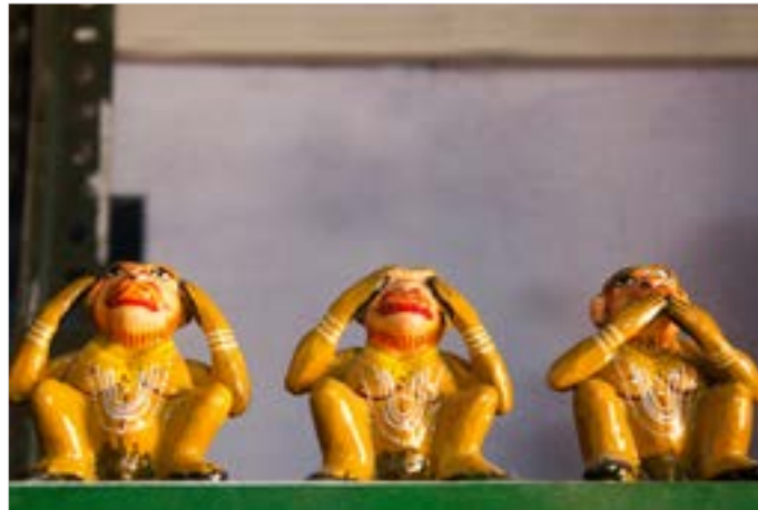
Three wise monkeys of Gandhiji.