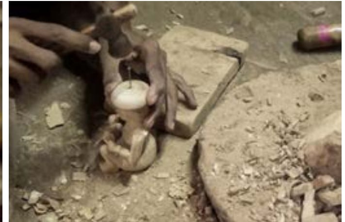
After drying cap is fixed with nail for durability.