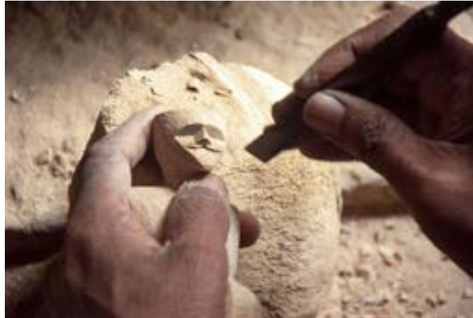
Gular fig (Ficus racemose) is used for carving in Varanasi.