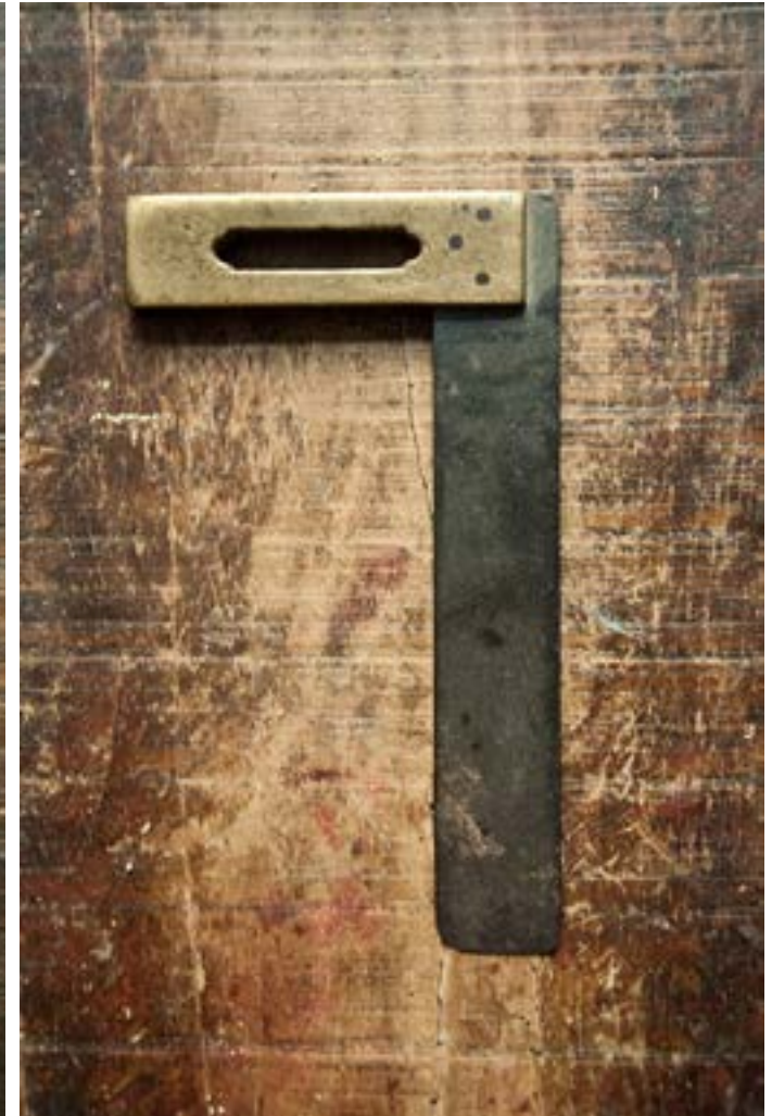
Try square tools used for measuring the accuracy of a right angle.