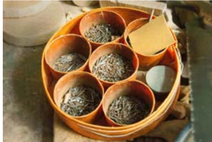
Different sizes of nails used to join the body parts of the idol.

https://www.dsource.in/resource/wooden-toys-varanasi-1/tools-and-raw-materials