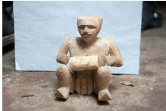
The toy is kept for drying after each part stuck.