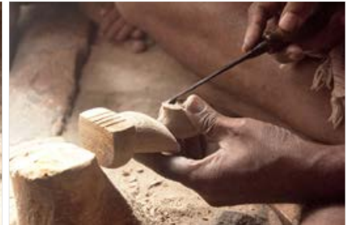
A wooden anvil is used in props for holding the toys with the grip to carve.