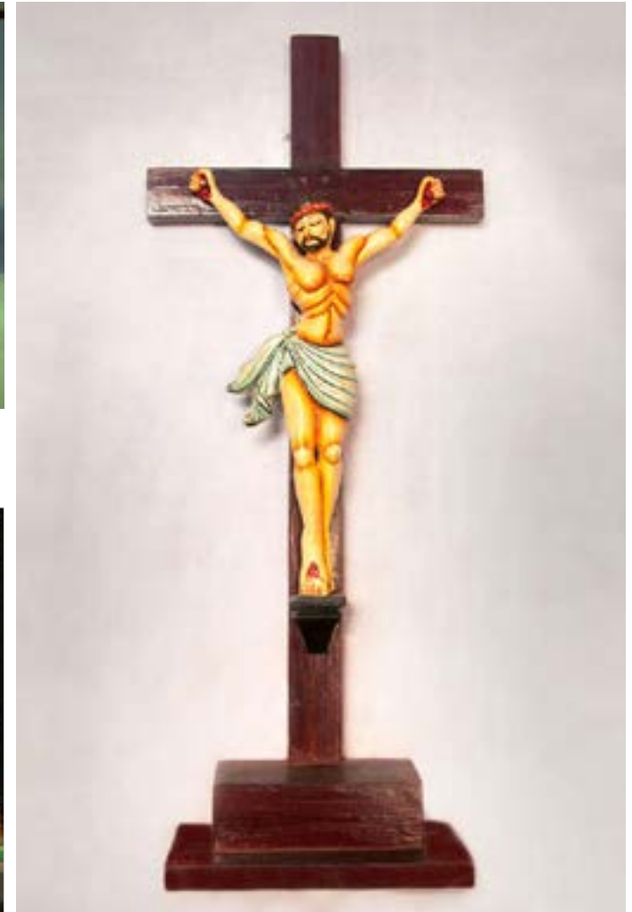
Lord Jesus on the cross.