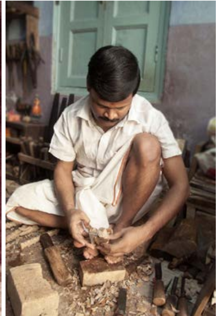
Artisan assuring with adjournments of the different parts of the toys.