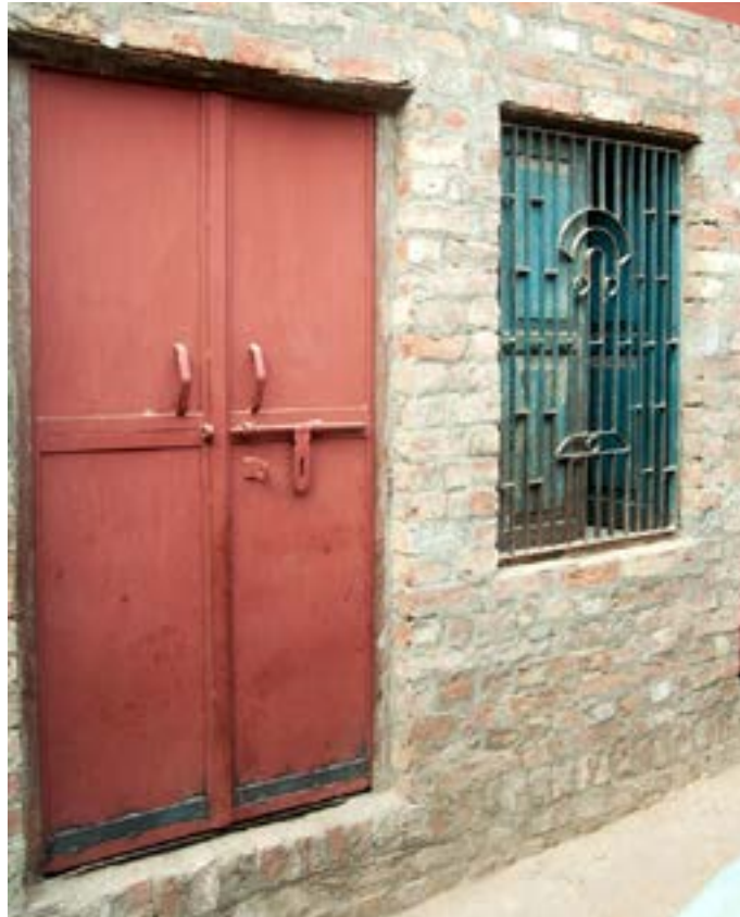
Wooden craft making place.

Dolls made from wood are very popular. Varanasi is known for its carved objects and dolls. Traditional designs are carved on wood and then painted over giving the whole object a rich effect. Craftsmen use Gular wood to sculpt exquisite mythological pieces. This place offers the choicest varieties of wooden dolls blended both in folk and classical forms, which provide an aesthetic appeal with a freshness and charm of their own. Wood carving is a traditional craft of Varanasi.