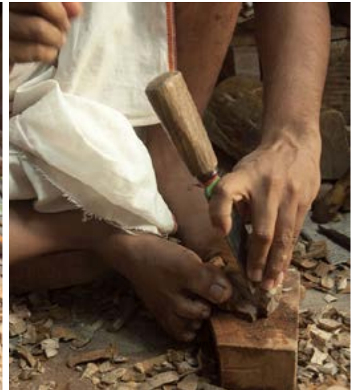
Artisan is given basic shape to the toy.