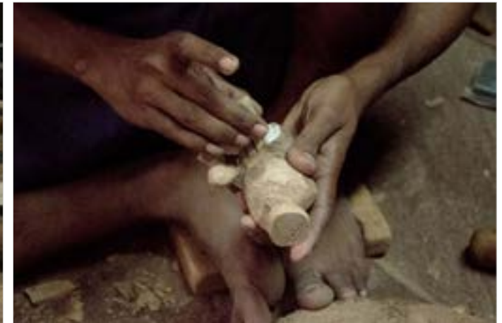
The shape of the leg is attached and stuck on the particular place.