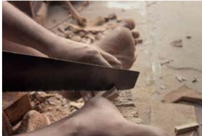
Saw toll used to cut manually.

https://www.dsource.in/resource/wooden-toys-varanasi-1/introduction