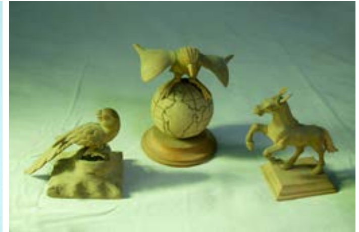
Beautifully carved animal and birds on the memento.