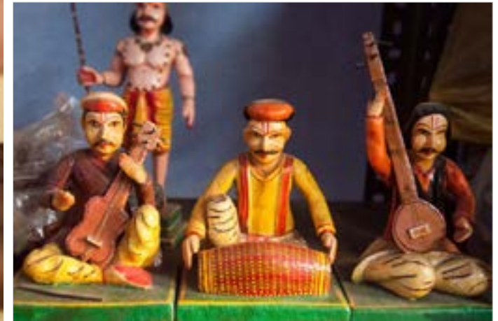
Toys depicting musicians.