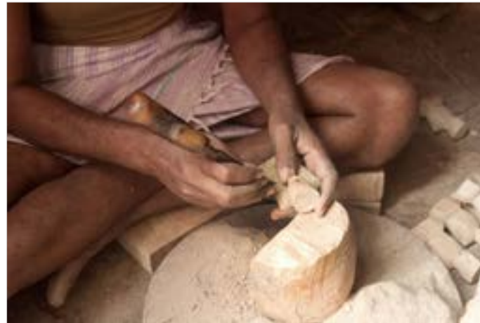
Toy is getting carved to get more detail.