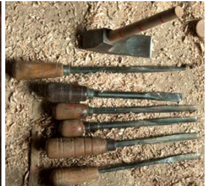
Several tools used for hand carving process of toy making.