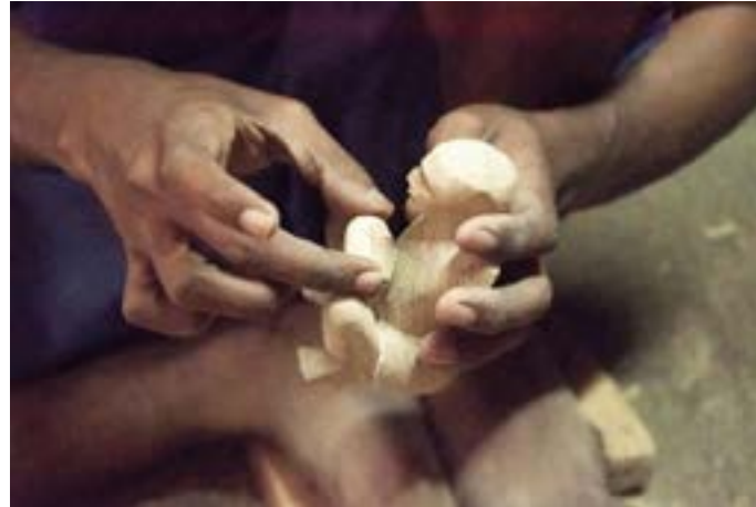
The parts of toys are carved separately then joined together with the help of glue.

https://www.dsource.in/resource/wooden-toys-varanasi-1/making-process