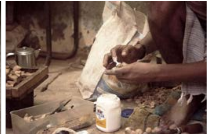
Artisan applying adhesive on the top.