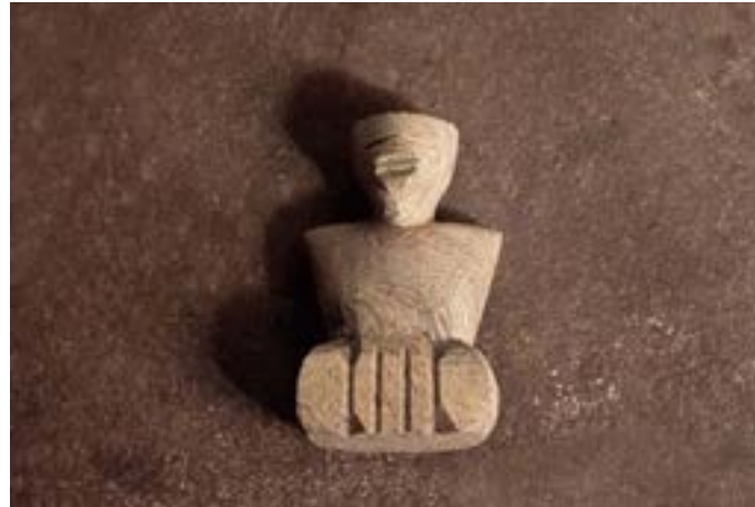
Basic shape of the toy.

https://www.dsource.in/resource/wooden-toys-varanasi-1/making-process