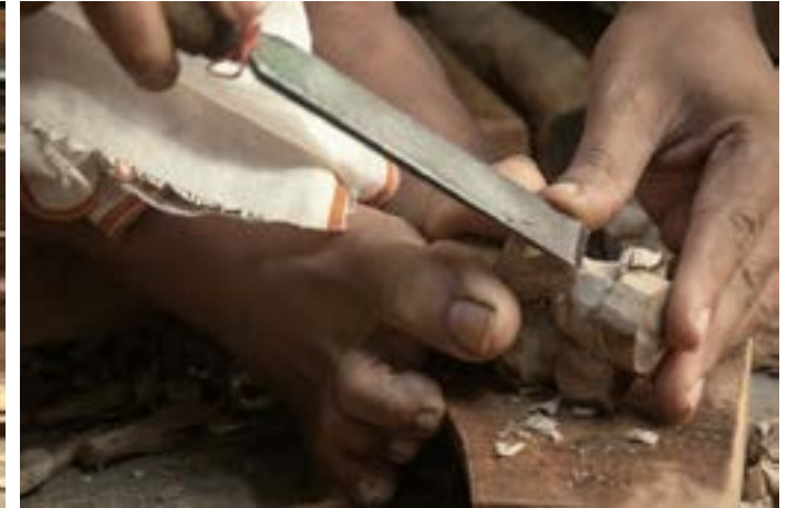
Chisels are used to get a correct forms of the toys.