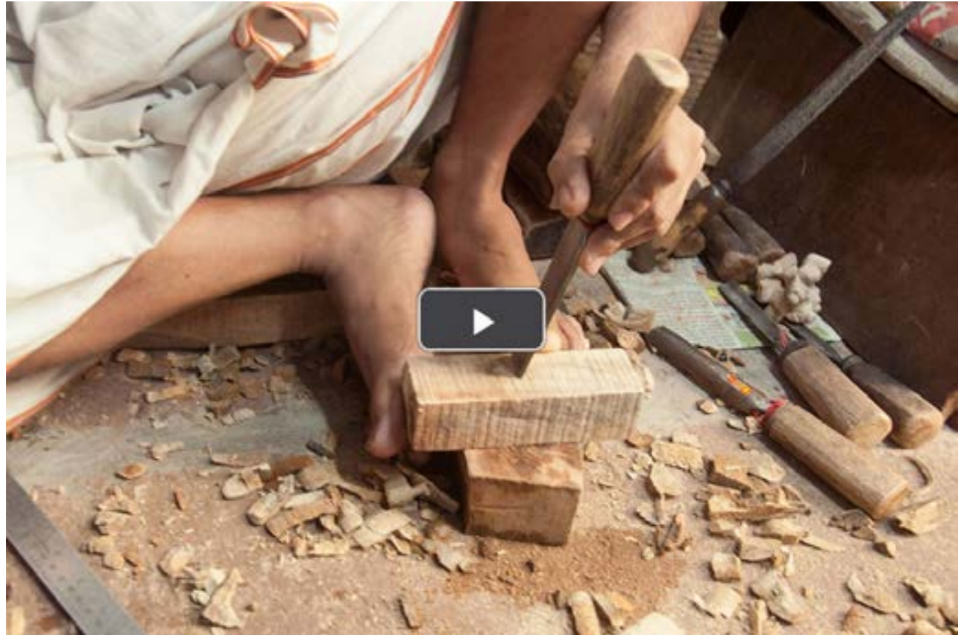
Wooden Idol - Varanasi