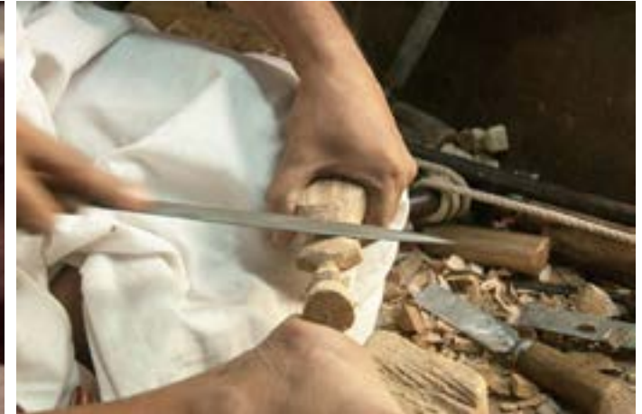
File is used to smoothen the surface.