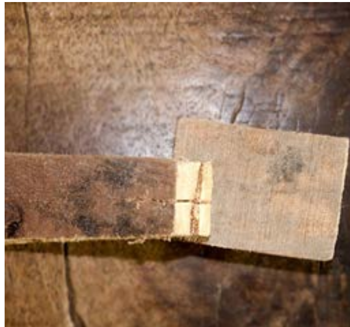
Gular wood (ficus racemose) is basic raw material used for making toys.