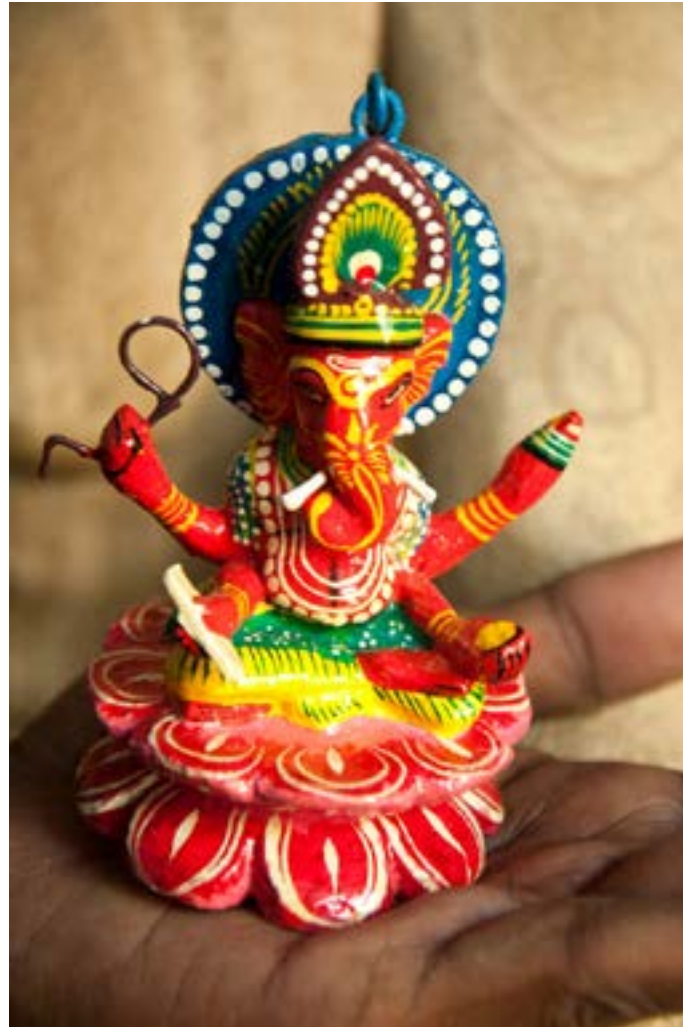
Attractive Ganesa idol with bright colours.