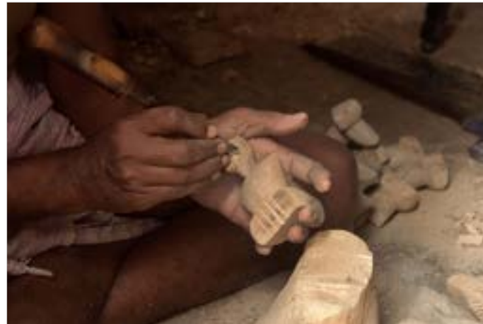
Facial part is getting carved by u shape chisel tool.