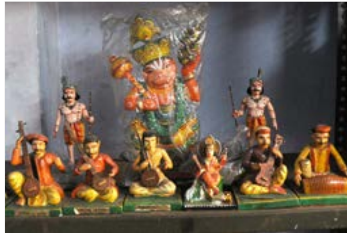
Showcase of wooden Toys.