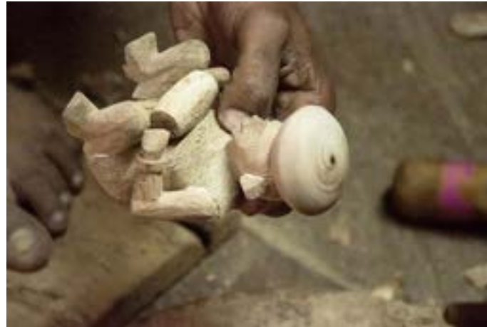
Cap is fixed on top and left for drying.

https://www.dsource.in/resource/wooden-toys-varanasi-1/making-process