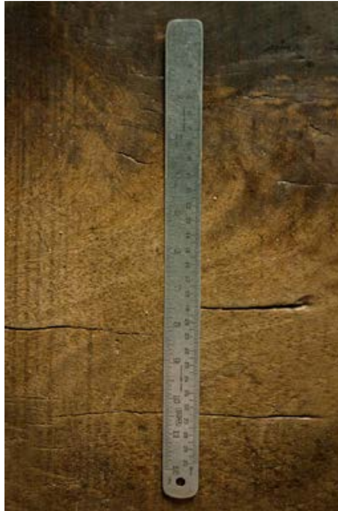
Measurement scales are used to quantify variables.