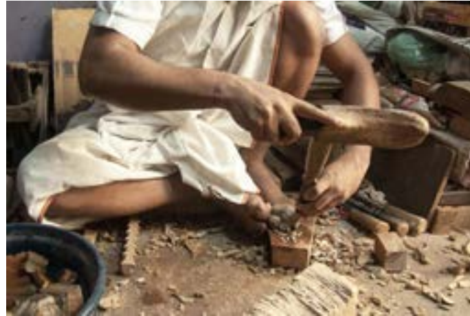
The wooden block getting carved to get a desired shape.

https://www.dsource.in/resource/wooden-toys-varanasi-1/making-process