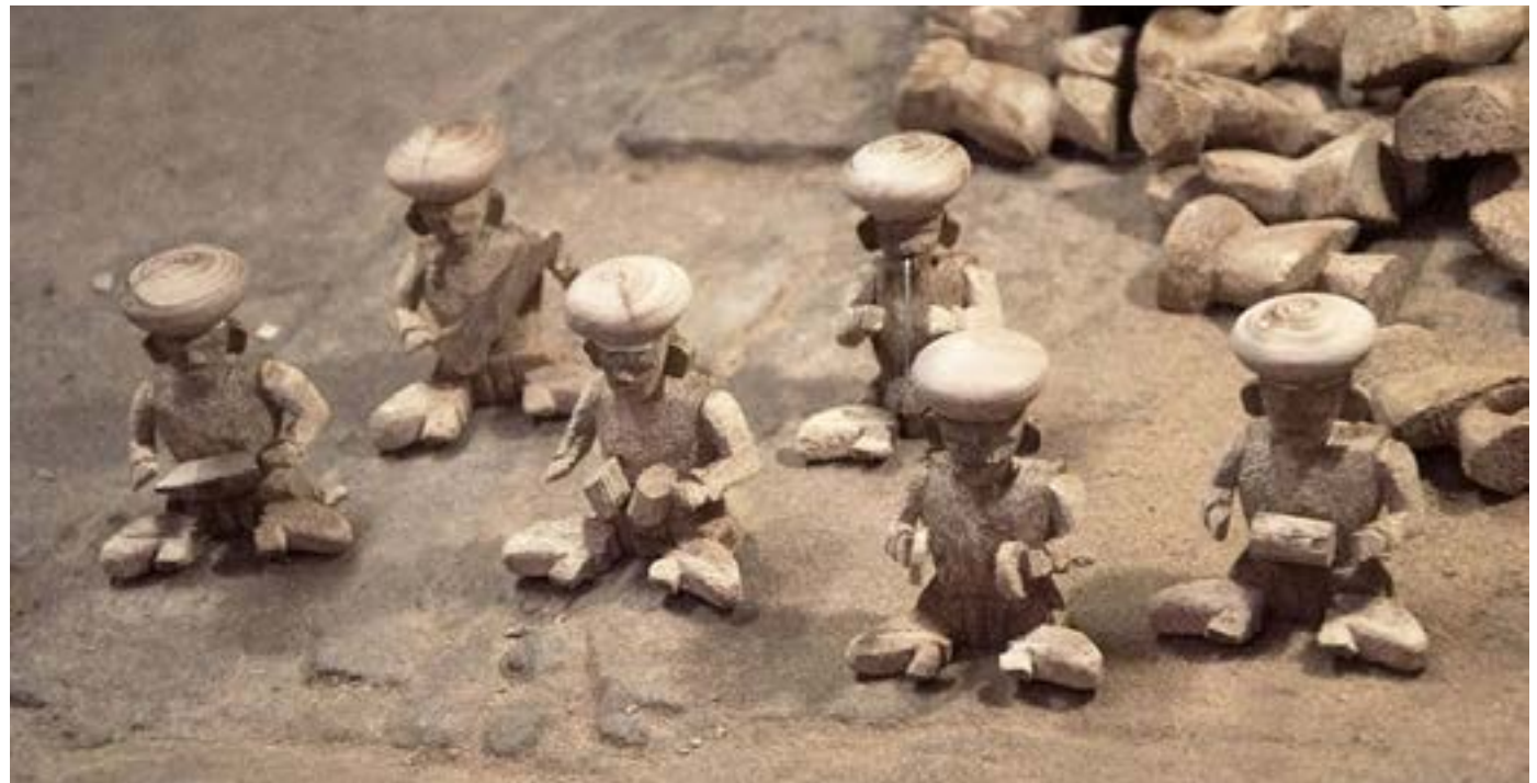
Toys are arranged before colouring.