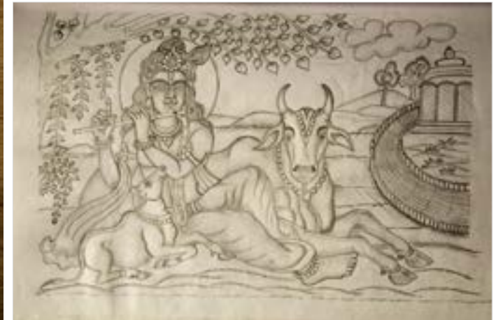
Drawings are used as a template for carving.