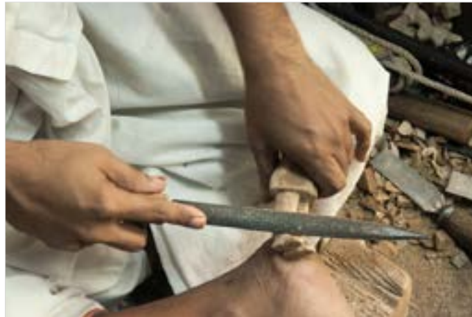
The carved portion are filed to even the surface.