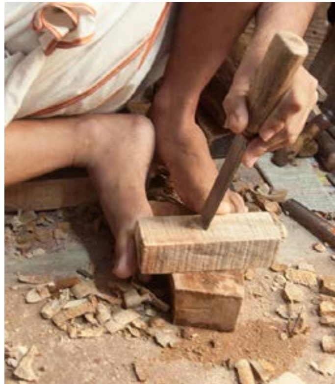
Artisan starts to carve wood piece to basic shape.

Once the idol is completed, it is painted with attractive bright colours.