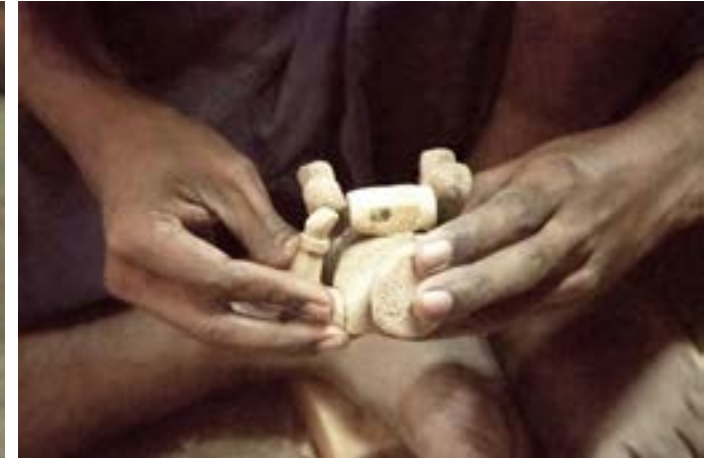
Artisan assuring the placement of the hand to the toy.