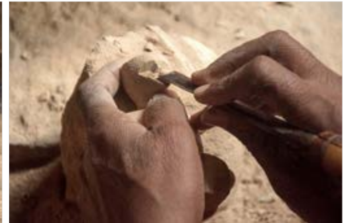
For the smooth carving of the details, the artisan holds the body of the tools with less pressed.