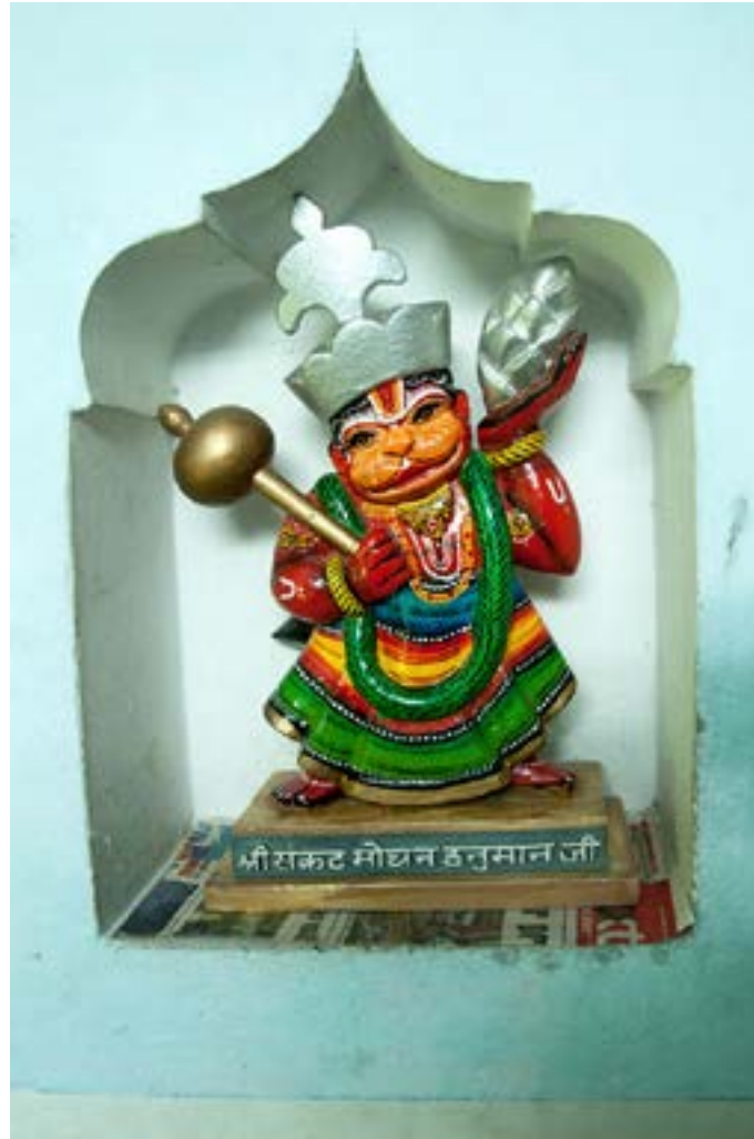
Load hanuman carrying Sumedh Parvat (mountain).