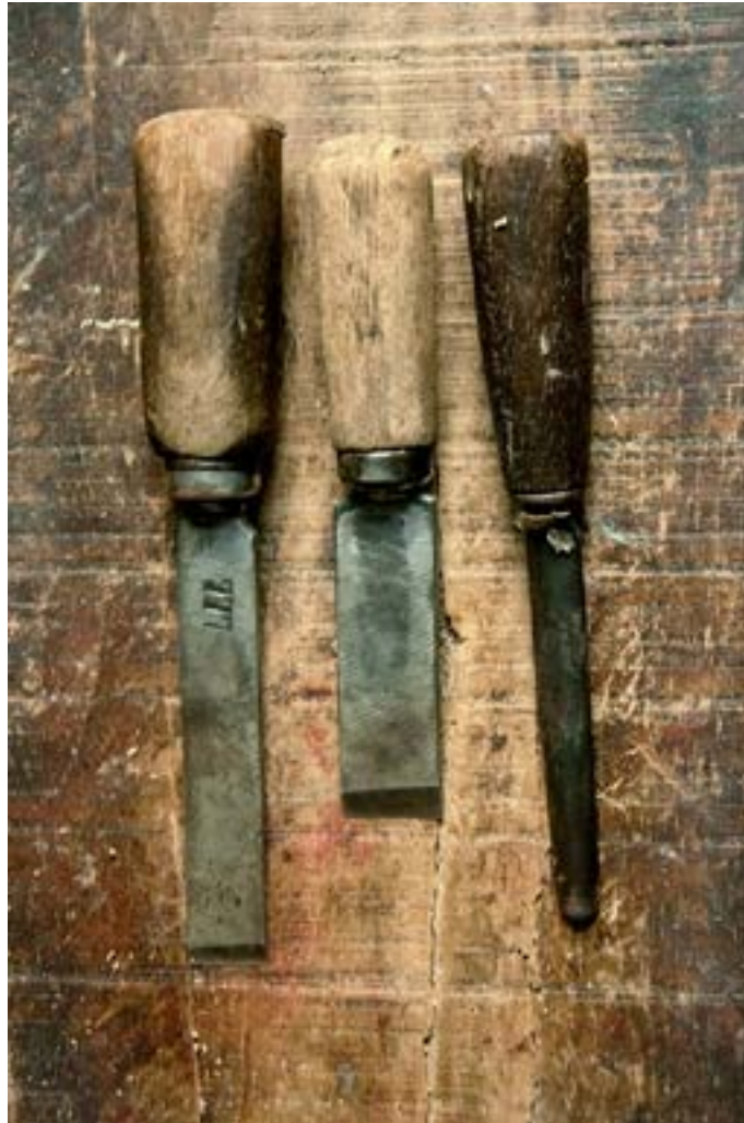
Chisels used to shape surfaces in curve.