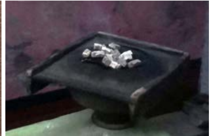
Carved toys are lightly warmed to remove the excess moisture.