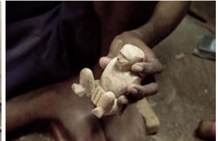
Artisan stuck the leg with the help of glue