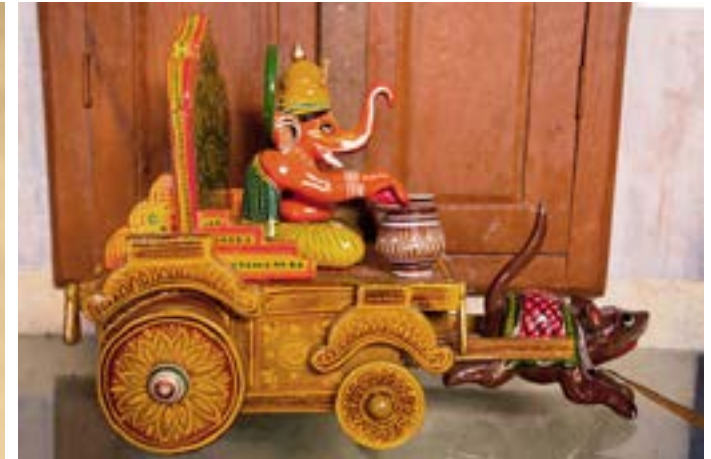
Lord Ganesha sitting on the chariot.