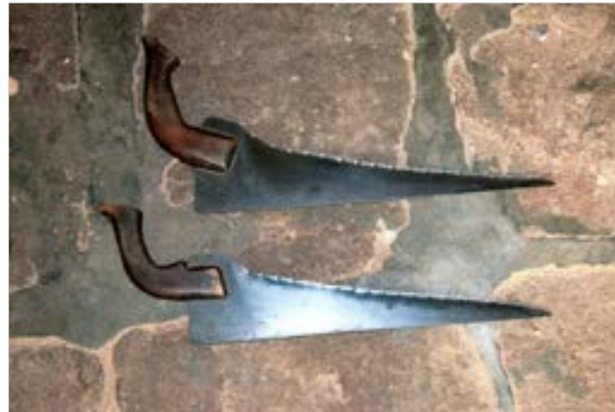
Saw tools are used for cutting the raw material.