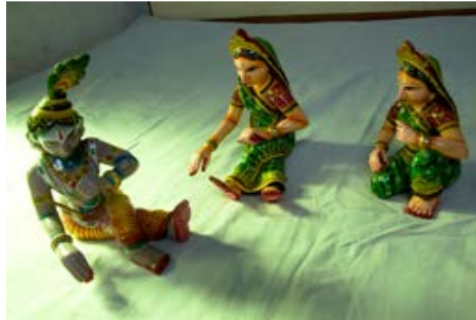
Krishna with Gopikas.