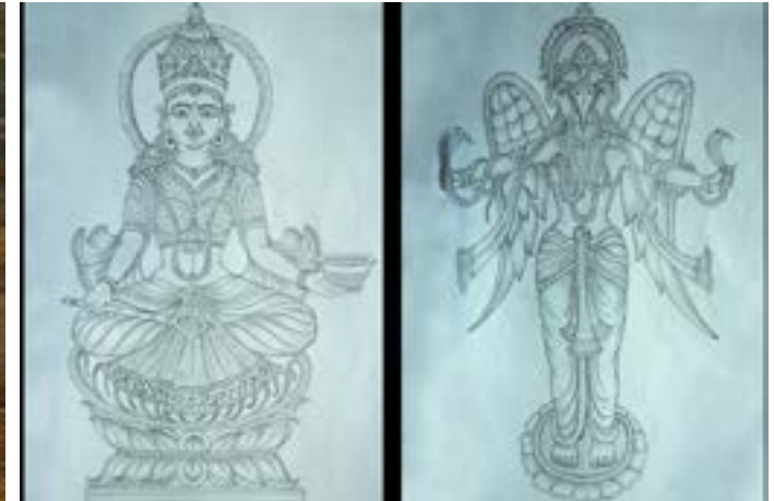
Drawings are used as a template for carving.