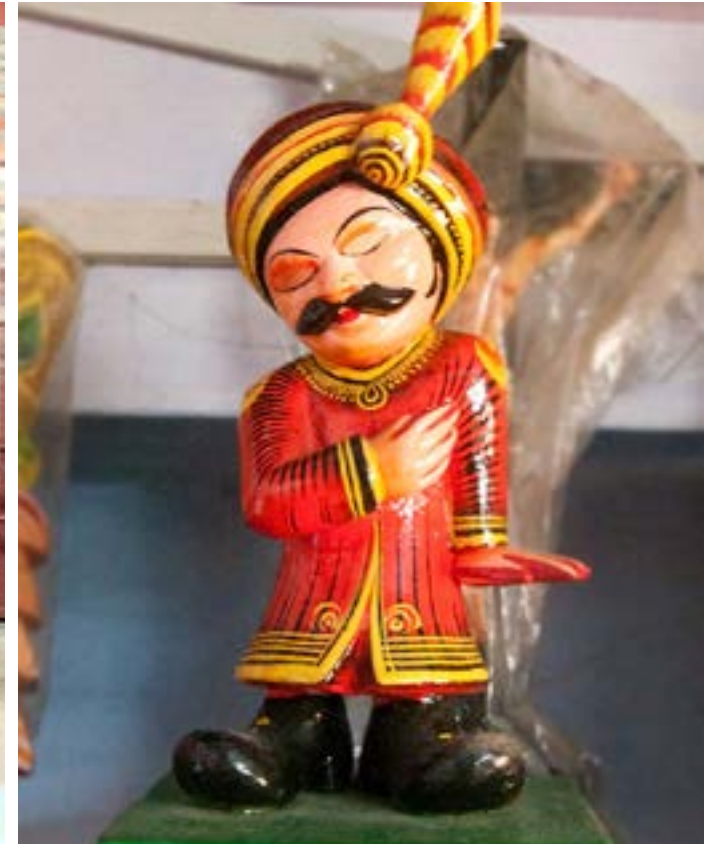
The Air India mascot made in wood.