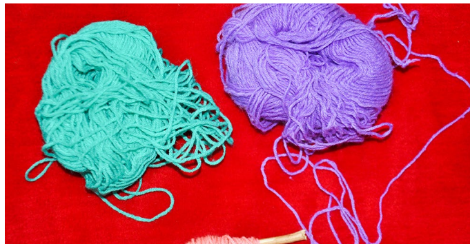
The multi-coloured woollen yarns are used for knitting.