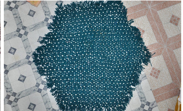
Single colour woollen table mat, completed in a simple design.