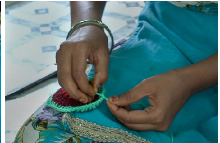
Artisan tying a final knot after knitting the circle.