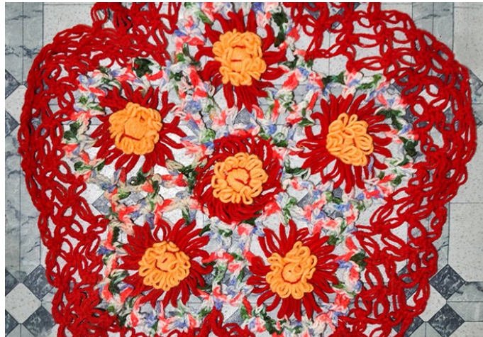
A star-shaped table mat depicting flowers floating on water.