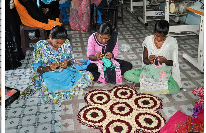
Trainees working on a Table mat, which takes around an hour to finish.