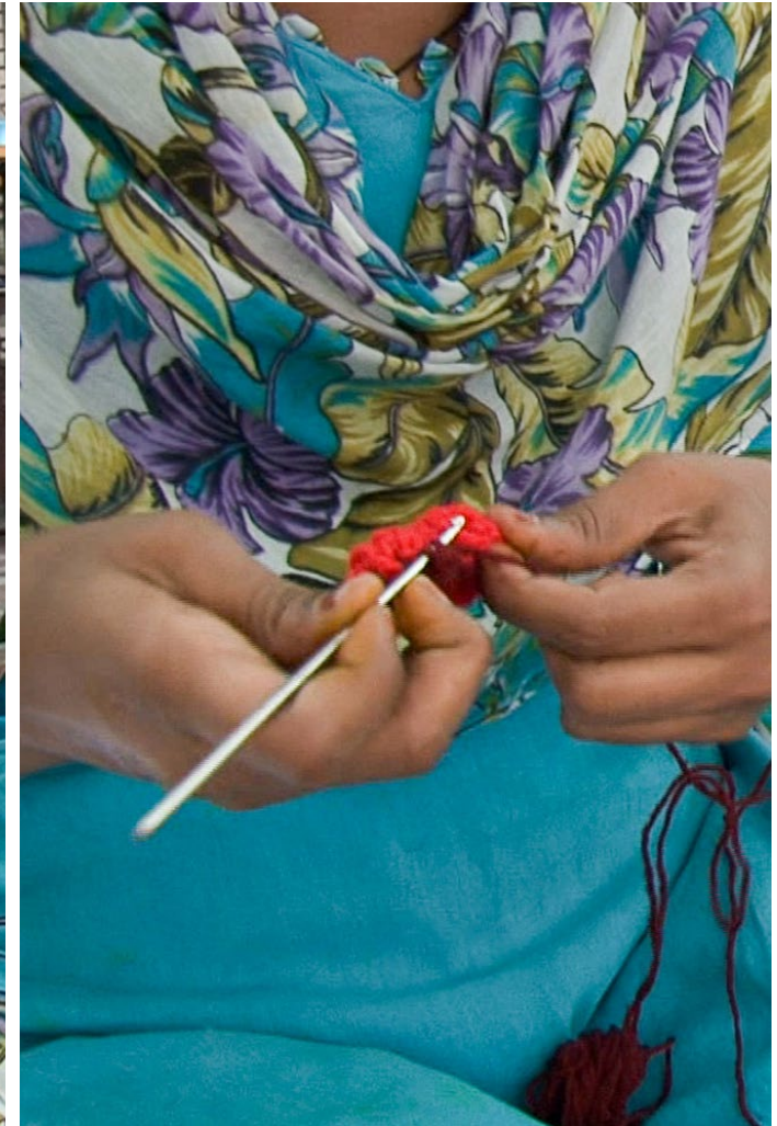
Then knitting brown woollen thread over the red thread.