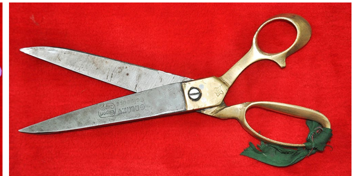
Scissor are used to cut the extra woollen threads.