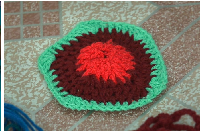
The completed table mat was displayed on the floor.