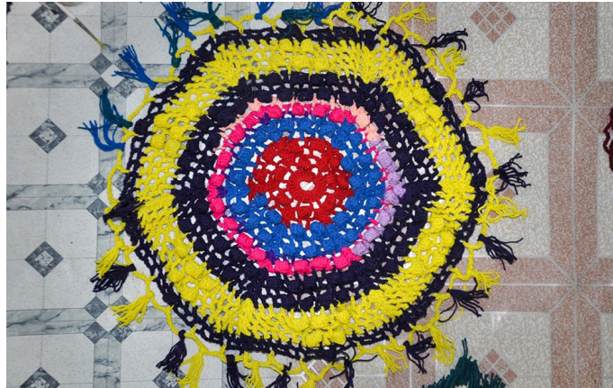
A phenomenal crochet tablemat is done in multi-coloured woollen threads.

The products made out of woollen crochet designs include sweaters, tablemats, curtains, caps, socks, bags, hand purses, etc. The cost of the items ranges from Rupees 70 to 800, rates varying as per the detailing done and the design used.