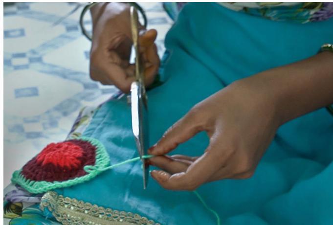
The extra thread being snipped with a scissor by the artisan.