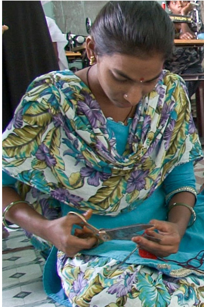
Artisan trimming the extra woollen thread with a scissor.