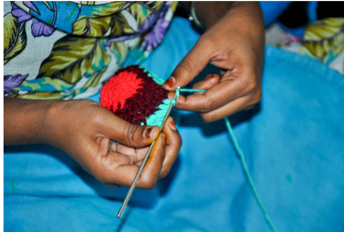
The final touch to the green circle formed by knitting.