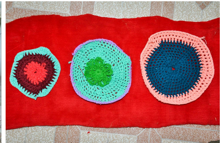
Different sized tablemat knitted with multi-coloured woollen threads.