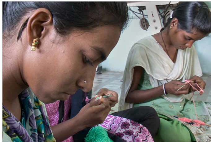
Individuals engaged in learning new stitching patterns on woollen crochet.