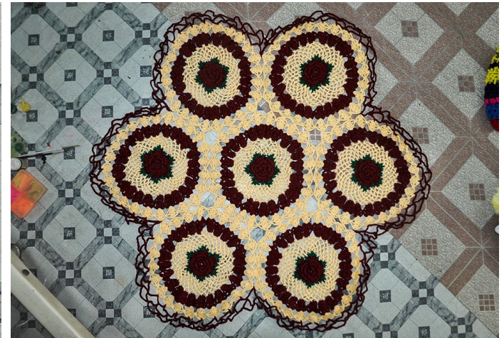
A hexagon-shaped tablemat adorned with woollen roses.