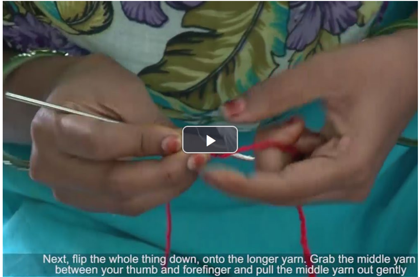
Woollen Crochet - Yadgiri