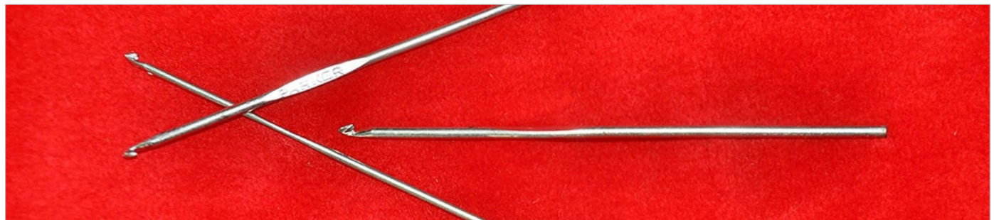
Crochet hooks used to knit woollen products.