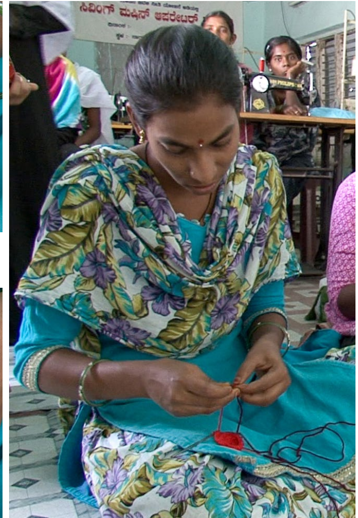
After completing the red colour circle, artisan tying brown colour woollen thread.