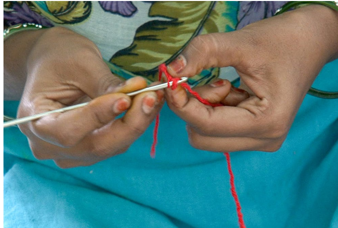
Artisan using a crochet hook and red colour woollen thread to start knitting woollen table mat.