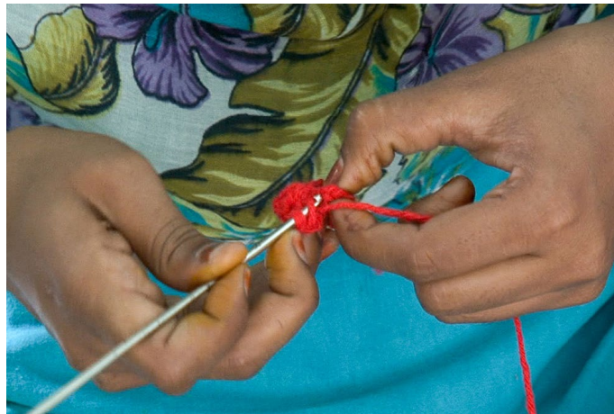
Artisan knitting red colour woollen thread in round shape.